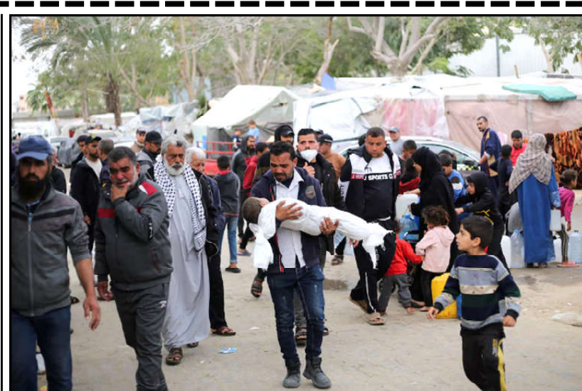
A mourner carries the body of a Palestinian child killed in an Israeli strike, amid the ongoing conflict between Israel and Hamas, in Khan Younis in the southern Gaza Strip.

additional measures. Undeterred, Pretoria tried again — this time urging the court to impose emergency measures to "save the Palestinian people in Gaza already dying of starvation". The ICJ's judges said that the mid-January rulings "do not fully address the consequences arising from the changes in the situation... thus justifying the modification of these measures". Pretoria hailed the latest ICJ decision, calling it "significant". "The fact that Palestinian deaths are not solely caused by bombardment and ground attacks, but also by disease and starvation, indicates a need to protect the group's right to exist," it said in a statement. The MSF medical charity said there was no change on the ground since the Security Council resolution.