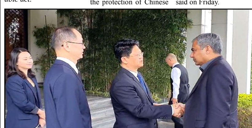
ISLAMABAD: Interior Minister Mohsin Naqvi meeting with Chinese officials at Chinese Embassy.

Meanwhile China's inter-departmental working group has carried out comprehensive emergency response work with the Chinese Embassy in Pakistan and the relevant enterprises in the wake of the Dasu terrorist attack, a Chinese foreign ministry spokesperson said on Friday.