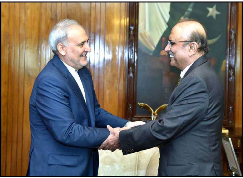
ISLAMABAD: The Ambassador of Iran to Pakistan, Dr. Reza Amiri Moghadam calls on President Asif Ali Zardari, at Aiwan-e-Sadr.