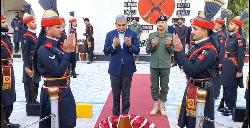
PESHAWAR: Federal Minister for Interior Mohsin Naqvi offering Dua at Martyrs Monument during his visit to Frontier Constabulary Headquarters.