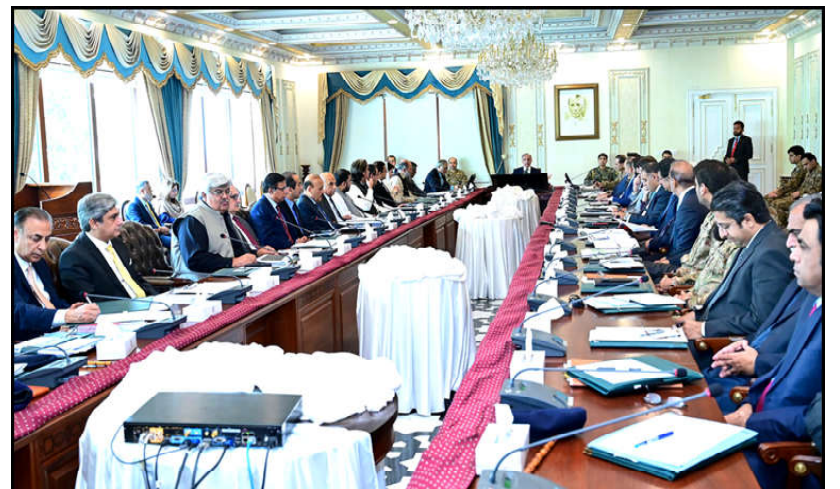
ISLAMABAD: Prime Minister Muhammad Shehbaz Sharif chairs a meeting on measures against the spectrum of illegal activities.

President Biden reaffirmed the joint commitment to upholding human rights and promoting inclusive development, signaling a strengthened partnership between the United States and Pakistan.