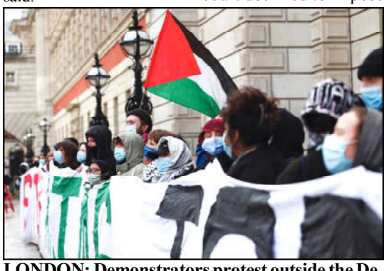
LONDON: Demonstrators protest outside the Department for Business and Trade in support of Palestinians.