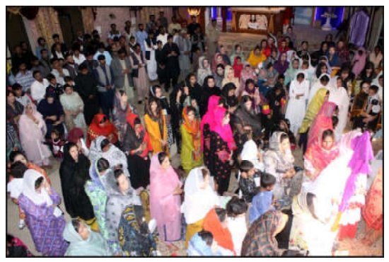
QUETTA: Members of Christian community engaging in services of Good Friday, at a Church.