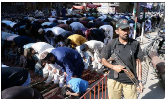
HYDERABAD: A large number of people offering Namaz-e-Jumma at Jamia Masjid city during Holy Fasting Month of Ramzan ul Mubarak