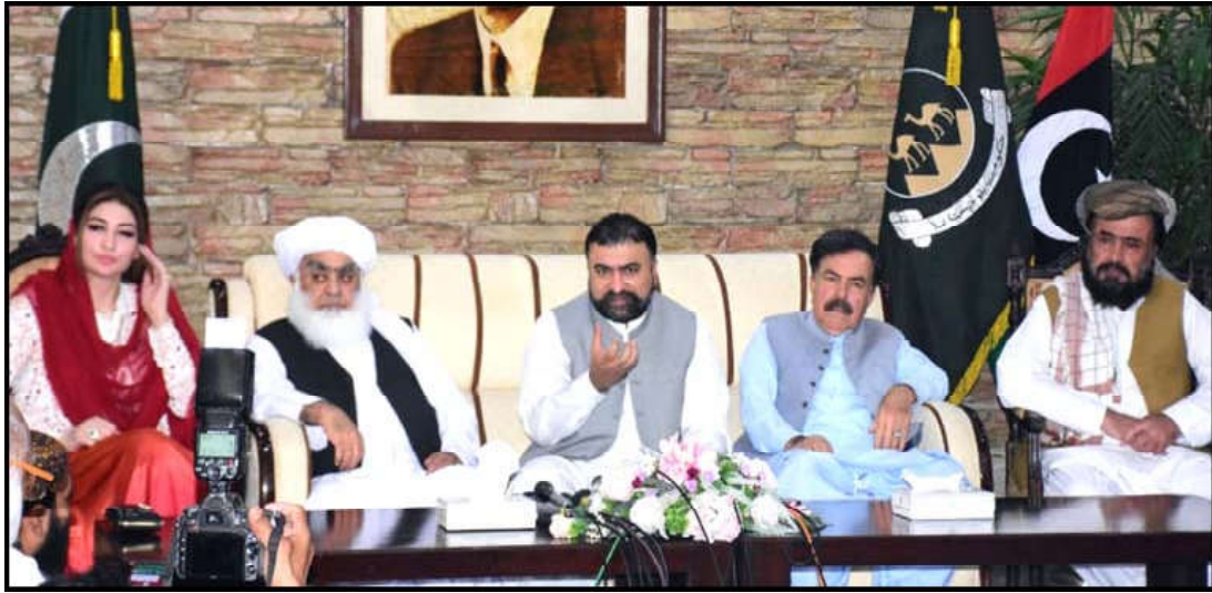
ISLAMABAD: Chief Minister Balochistan Mir Sarfraz Ahmed Bugti addressing a press conference along with leaders of allied political parties

Ph: 2841470/2841473 Vol: XIX No. 283, Ramzan 19, 1445 AH Saturday March 30, 2024, Pages 04, Price Rs.15