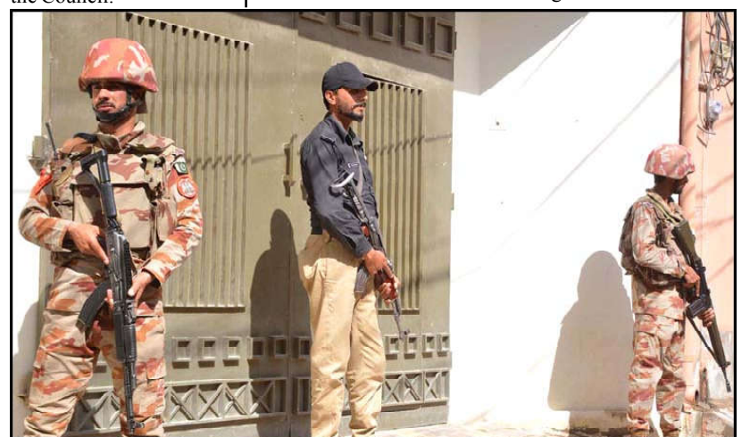
QUETTA: Security personal stand alert during Good Friday service at Bethel Memorial Methodist Church.

ment for a tenure of three years. The approval of this appointment came through the circulation of a summary from the Ministry of Interior, the Federal Cabinet, and cognizant of the need for robust governance structures, also sanctioned the inclusion of Rule Seven A in the NADRA Rules 2020.