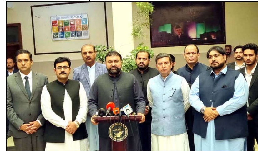
QUETTA: Balochistan Chief Minister, Mir Sarfraz Bugti addressing a press conference, at Provincial Disaster Management Authority (PDMA) in Quetta.

He also prayed for early recovery of those injured in the incident.