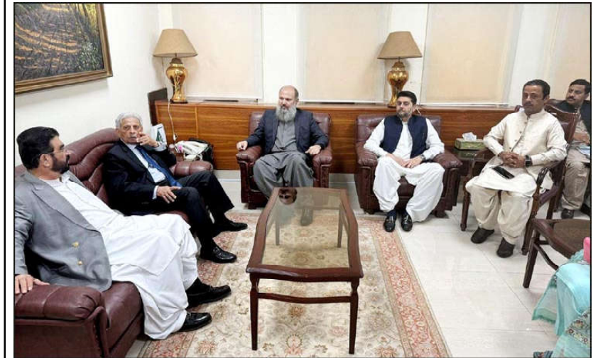
ISLAMABAD: Federal Minister for Industries and Production, Rana Tanveer Hussain, paid a courtesy visit to the office of Federal Minister for Commerce, Jam Kamal Khan, sparking discussions on matters of mutual interest.

was working for the upbringing and care of orphans. He said healthy societies always care for the development and education of the vulnerable, especially orphans. He said there were about 4.6 million orphans in the country while the POCF was taking care of around 100,000 orphan children. Expressing gratitude to President Asif Zardari, the Chairman POCF said inviting children to the presidency would increase their confidence and motivation.