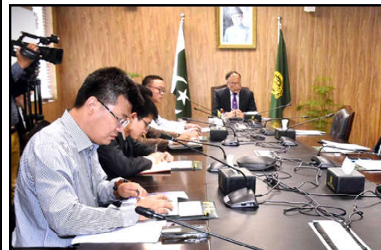
ISLAMABAD: Federal Minister for Planning, Development and Special Initiatives, Ahsan Iqbal chairing a meeting on progress of Gwadar Power Plant with Chinese company.

Terming Gwadar 'the gateway of CPEC', the minister said that the incumbent government had expedited the implementation of phase 2 of the CPEC while integrating it with five new economic corridors.