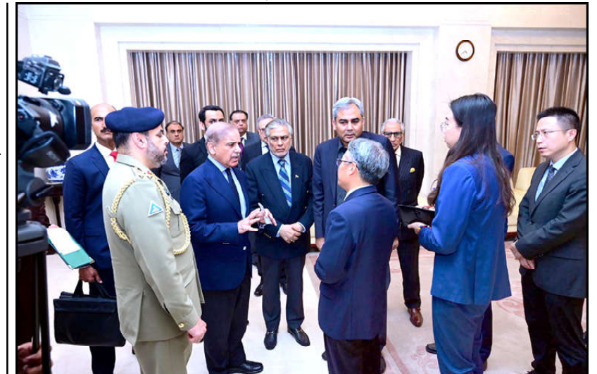
ISLAMABAD: Prime Minister Muhammad Shehbaz Sharif visits the Chinese Embassy, and met with Chinese Ambassador Jiang Zaidong to offer condolence over the death of Chinese nationals in a suicide attack in District Shangla.

The chief minister said that modern heavy machinery has been provided to QMC to make the provincial capital a clean city. He ordered that salaries would be issued to the working employees of Metropolitan Corporation. The employees were protesting on failure to perform duties but not for salaries, he said and adding employees should perform their duty and we will resolve the problem of salaries.