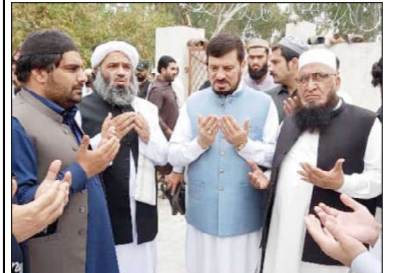
PESHAWAR: Governor Khyber Pakhtunkhwa Haji Ghulam Ali offering Fateha after funeral prayers of mother of senior journalists Gulzar Khan.

Moreover, efforts are underway to ensure round-the-clock availability of dialysis services in government hospitals equipped with such amenities, with endeavors to introduce dialysis services in hospitals currently lacking them.