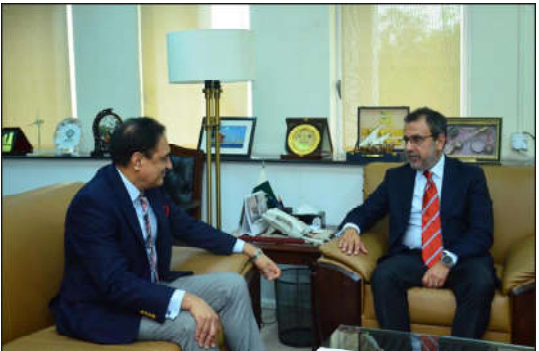
ISLAMABAD: Federal Minister for Power Sardar Awais Ahmed Khan Leghari was called on by WAPDA Chairman Lt. Gen. (Rtd) Sajjad Ghani.

tariffs. During a public hearing, the company argued that the gas price needs to be raised to Rs. 4,446 per MMBTU to reflect production costs. Consumers present at the hearing expressed strong opposition to the proposed hike, highlighting the potential for business closures and rising unemployment due to high gas prices. Stakeholders pointed out that existing gas prices have already forced numerous businesses to shut down, despite the fact that Pakistan sells gas to some customers for as low as $4 per unit while purchasing it internationally for $15. The Oil and Gas Regulatory Authority (Ogra) chairman acknowledged the concerns of both consumers and gas companies and indicated that a final decision on gas price revisions will be made after careful consideration.