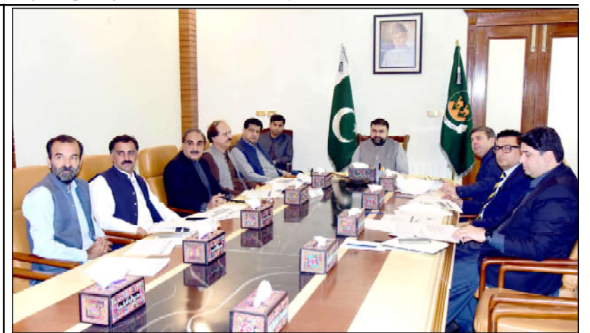
QUETTA: Chief Minister Balochistan Mir Sarfaraz Ahmed Bugti presiding over a high level meeting of Education Department

But that text was blocked by Russia and China, which along with Arab states criticized it for stopping short of explicitly demanding Israel halt its campaign in Gaza.