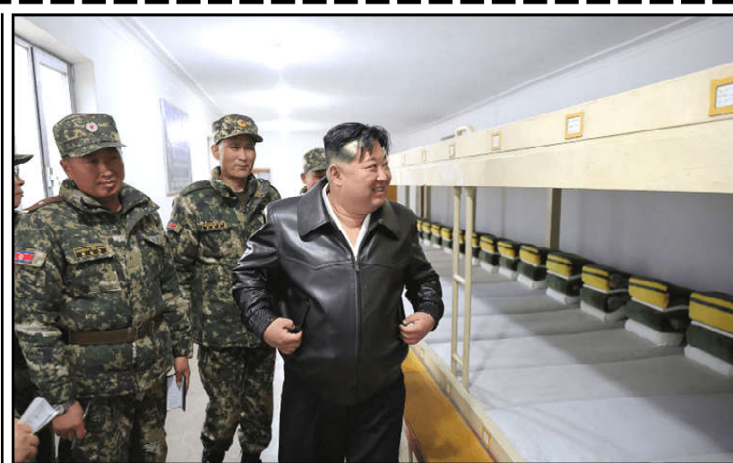
North Korean leader Kim Jong Un (C) inspecting the First Tank Armored Infantry Regiment, which is under the direct control of the Seoul Ryu Kyong Su Guards 105th Tank Division of the Korean People's Army (KPA) at an undisclosed location in North Korea.

try spokeswoman Maria Zakharova called into question US assertions that IS, which once sought control over swathes of Iraq and Syria, was behind the attack. In an article for the Komsomolskaya Pravda newspaper, she said the US was evoking the "bogymen" of IS to covertly "wards" in Kyiv and reminded readers that Washington had supported the mujahideen fighters who fought Soviet forces in the 1980s. Two US officials said on Friday that the US had intelligence confirming IS's claim of responsibility. Kremlin spokesman Dmitry Peskov later told reporters that Russia could not comment on the IS claim while the investigation was ongoing and would not comment on US intelligence, saying it was sensitive information.