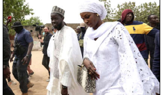
Presidential candidate Bassirou Diomaye Faye, who is backed by Senegalese opposition leader Ousmane Sonko, walks with one of his wives after casting his vote at the polling station at Ndiagianio in Mbour, Senegal.

building about 100 meters from the hospital, said he huddled in the kitchen for days while explosions sometimes caused the building to shake. Early Saturday, Israeli troops stormed the building and forced dozens of residents to leave. He said men were forced to strip to their underwear and four were detained. The rest were blindfolded and ordered to follow a tank south as blasts thundered around them. "From time to time, the tank would fire a shell," he told the Associated Press. "It was to terrorize us." Israeli jets on Sunday launched several strikes near Shifa Hospital, which largely stopped functioning following the November raid. After claiming that Hamas maintained an elaborate command center there, Israeli forces months ago exposed a single tunnel leading to a few underground rooms.