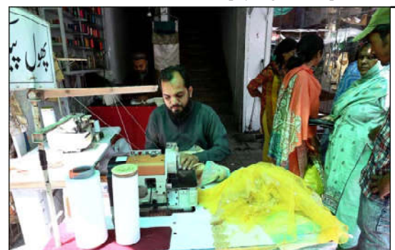
ISLAMABAD: Tailors busy stitching clothes for upcoming Eid ul Fitr festival at Aabpara.

Under the Tajir Dost Scheme, monthly advance tax payments will kick off