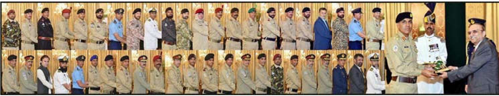
ISLAMABAD: President Asif Ali Zardari distributing commendation shields among military and civil officers who successfully organized Pakistan Day Parade, in a shield distribution ceremony held at, Aivan-i-Sadr.