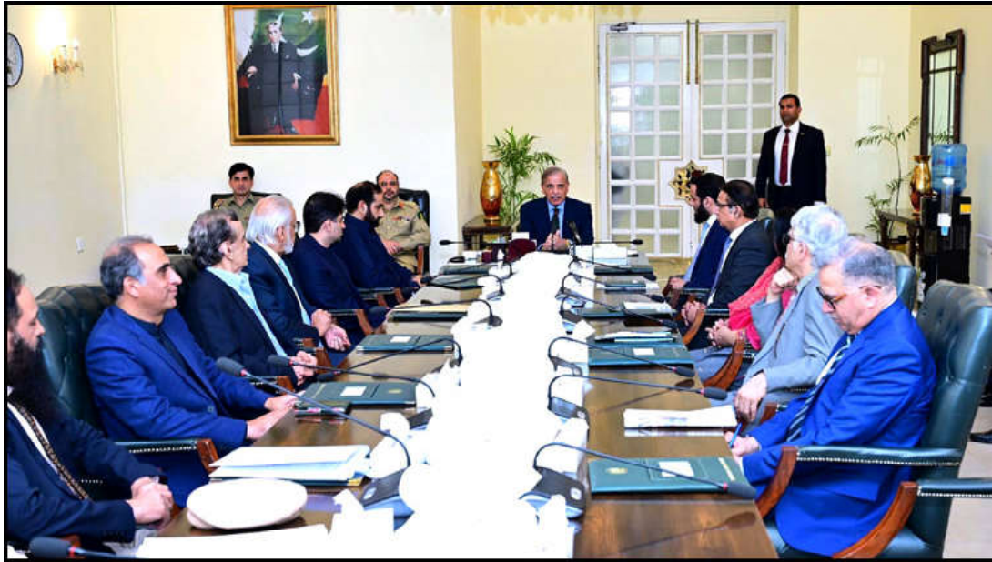
ISLAMABAD: A delegation of Pakistan Broadcasters Association calls on Prime Minister Muhammad Shehbaz Sharif.

Ph: 2841470/2841473 Vol: XIX No. 279, Ramzan 15, 1445 AH Tuesday March 26, 2024, Pages 04, Price Rs.15