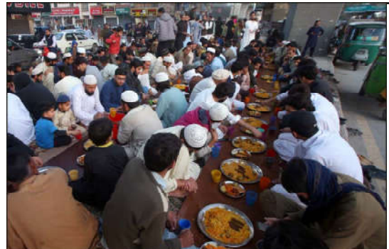
PESHAWAR: Faithful Muslims are breaking the fast (Iftar) under the supervision of charitable organization during the Holy month of Ramadan-Mubarak, at Stadium Chowk in Peshawar.

said that in addition to the new RCC drains in the sewage project in Daska of PCP, rehabilitation of 31,507 feet of old drains, 282 feet of drain culvert, remodeling of 4,739 feet of drains and de-silting of 36,000 feet of old drains of Municipal Committee Daska are also part of this project. He said that it is the responsibility of the Engineering Wing of Municipal Committee Daska to complete the project within the stipulated time and ensure quality. He said that delay in the completion of development projects will not be tolerated and projects of public welfare will be completed within the stipulated timeline.