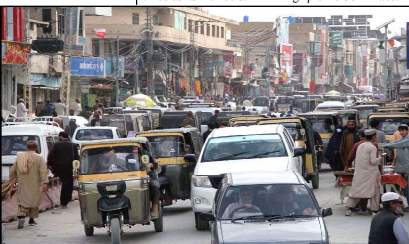
QUETTA: A large number of vehicles stuck in traffic jam before Iftar time due to negligence of traffic police staffs and illegal parking, need attention of concerned department

When an armed clash broke out between two groups on agricultural land in the morning. On the information that 6 people were injured, the police of the entire district were called. A heavy police force has been deployed to prevent any situation. The situation in the area became tense and the police force of the entire district was called. The clash between the Dahri community started