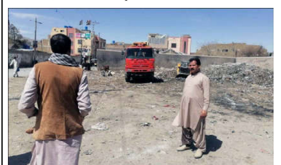
QUETTA: Heavy machinery removes garbage at garbage dump during cleanliness drive under the supervision of Metropolitan Corporation, at Spiny road Quetta.

preciated the initiative. Shaza said that PM Shehbaz Sharif was working hard to control inflation, adding that no doubt country was facing economic challenges but soon with the grace of the Allah Almighty these challenges would be overcome. The state minister said that being a nation, it was a responsibility of the government to steer the country out of economic crises. To a question, she said that some complaints had been received regarding registration at utility stores, adding that "we are in touch with the Punjab government and complaints related to registration would be solved soon".