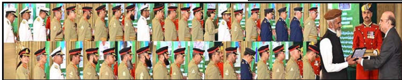
ISLAMABAD: President Asif Ali Zardari conferring the insignias of Hilal-i-Imtiaz (Military) upon officers of the Pakistan Armed Forces, at Aiwan-e-Sadr.