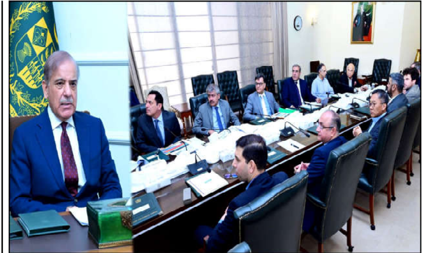
LAHORE: Prime Minister Muhammad Shehbaz Sharif chairs a meeting on Mines and Minerals of Balochistan with special context to Reko Diq Project.

The President Barrick Gold Corporation said that he underscored the company's commitment to sustainable development, job creation and community empowerment.