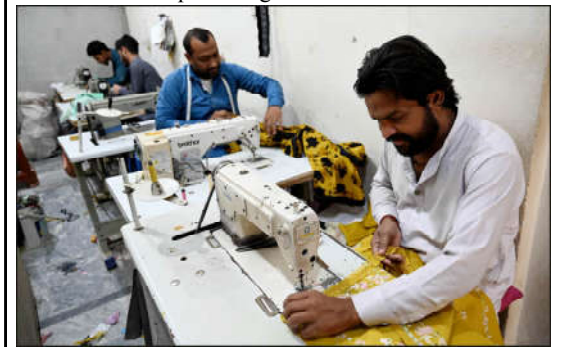
ISLAMABAD: Tailors busy stitching clothes for upcoming Eid ul Fitr festival.