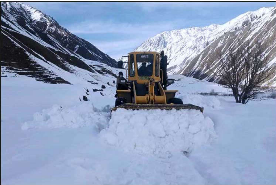
GILGIT: Heavy machinery being used to remove snow from the blocked road of Mir Malik area Astore Valley.