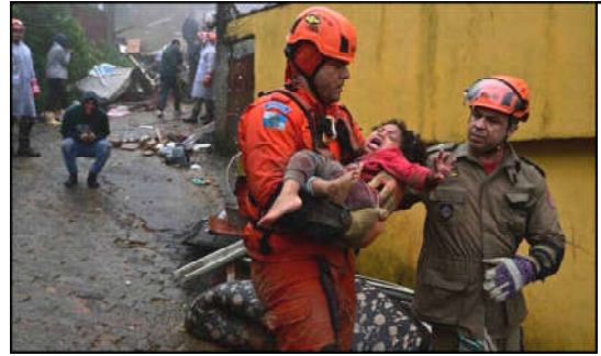
Members of the Civil Defense carry a girl, who remained more than 12 hours under the rubble of her house, which was destroyed by the heavy rains in Petropolis, Brazil.

were killed when camouflaged gunmen stormed the Crocus City Hall, in Moscow's northern suburb of Krasnogorsk, and then set fire to the building on Friday evening. The Islamic State group wrote on Telegram on Saturday that the attack was "carried out by four IS fighters armed with machine guns, a pistol, knives and firebombs," as part of "the raging war" with "countries fighting Islam". It is the deadliest attack in Russia for almost two decades. Russian officials expect the death toll to rise further, with more than 100 wounded in hospital. Russia's Investigative Committee, which probes major crimes, said rescue workers were still pulling bodies from the burnt-out building on Saturday.