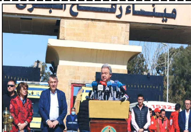
United Nations Secretary General Antonio Guterres talks to the media during a visit to the Rafah border crossing.