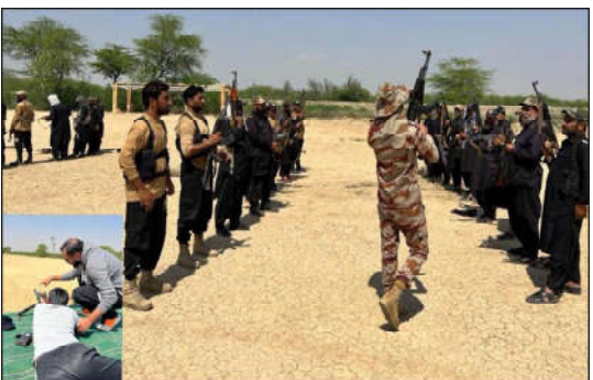
KACCHI: Levies force personnel being trained by Pakistan Army.