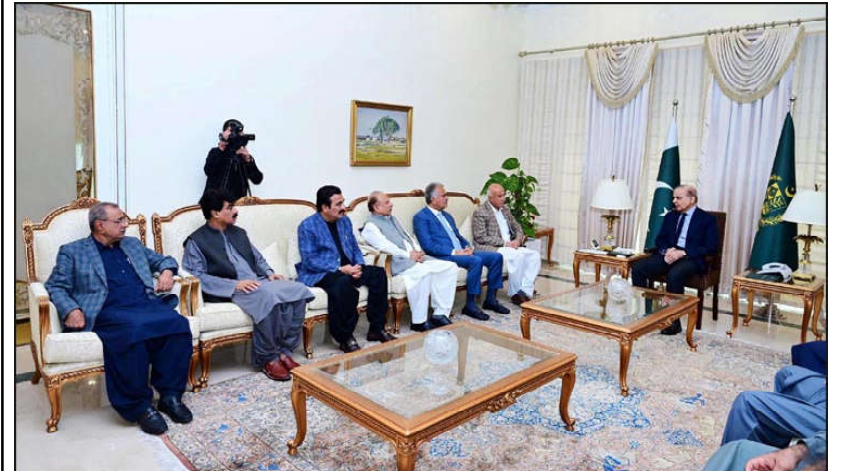
ISLAMABAD: A delegation of the National Party calls on Prime Minister Muhammad Shehbaz Sharif.

She said that today we all have to pledge that we will not allow any kind of fire to come on the motherland Pakistan and all together we will fight the enemies of Pakistan and forget our personal interests and differences and collective interests for the country. Will work for the whole nation have to stand side by side for the security and stability of our country and face all the challenges together. For this, forgetting their differences and showing the best performance.