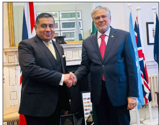
LONDON: Foreign Minister Mohammad Ishaq Dar shakes hand with UK Minister of State for South Asia and Commonwealth, Lord Tariq Ahmad.

Referring to the second recently adopted resolution on measures to combat Islamophobia.