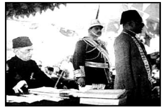
Muhammad Iqbal during historic Allahabad address in 1930.

Sir Syed's reforms had excelled Muslims in education, social, economic and political sciences, resultantly their voices have strongly been heard by the British rulers. The Muslims, under the flag of All India Muslim League (AIML) founded on December 30, 1906 at Dhaka, got united by giving new impetus to the independence movement. It witnessed further momentum after Quaid-i-Azam spearheaded independence movement after formally joining AIML in 1913 and outlining of an independent state for Muslims majority provinces in North West India by the great poet philosopher Dr. Allama