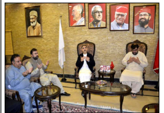
ISLAMABAD: Chief Minister Balochistan, Mir Sarfraz Ahmed Bugti, former caretaker Prime Minister Anwarul Haq Kakar and Senator Dhanesh Kumar offering Feteha for departed soul of mother of Provincial President of Awami National Party (ANP), Aimal Wali Khan

The Chief Minister and others expressed condolence with Aimal Wali Khan over death of wife of veteran politician Asfandiyar Wali Khan. They also offered feteha for the departed soul and prayed for the patience on the loss.