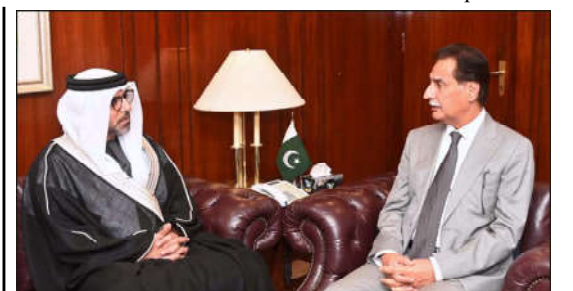
ISLAMABAD: Ambassador of the United Arab Emirates, Hamad Obaid Ibrahim Alzaabi calls on Speaker National Assembly Sardar Ayaz Sadiq at Parliament House.