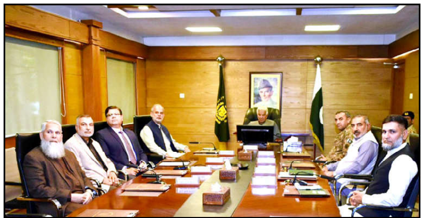
ISLAMABAD: Federal Minister for Defence Production, Khawaja Muhammad Asif chairs an introductory meeting on arrival in Ministry of Defence Production.