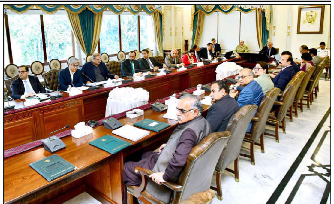
ISLAMABAD: Prime Minister Muhammad Shehbaz Sharif chairs a meeting regarding reforms in Pakistan's IT sector.

According to report, Aurangzeb said Pakistan will seek a new loan program from the IMF of at least three years. Further details will be discussed after the Washington-based lender's annual spring meetings, he said.