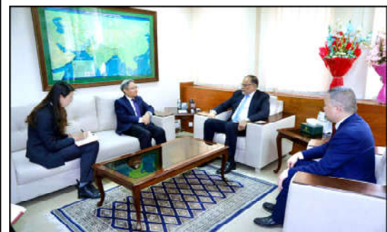
ISLAMABAD: Ambassador of the People's Republic of China, Jiang Zaidong calls on Planning Minister Prof Ahsan Iqbal in Ministry of Planning, Development and Special Initiatives to discuss accelerated growth of CPEC projects.

The day marks adoption of historic Lahore Resolution this day in 1940 that provided a framework for realization of the goal of a separate homeland for Muslims of South Asia. The Day will dawn with 31-gun salute in the federal capital and 21-gun salute in provincial capitals. Special prayers will be offered in mosques after Fajr prayers for the welfare, prosperity and solidarity of the country. National flag will be hoisted on major government buildings. The main feature of the day will be the grand military parade in Islamabad where contingents of the three-armed forces and other security forces will conduct march past while fighter planes will present aerobatic maneuvers.