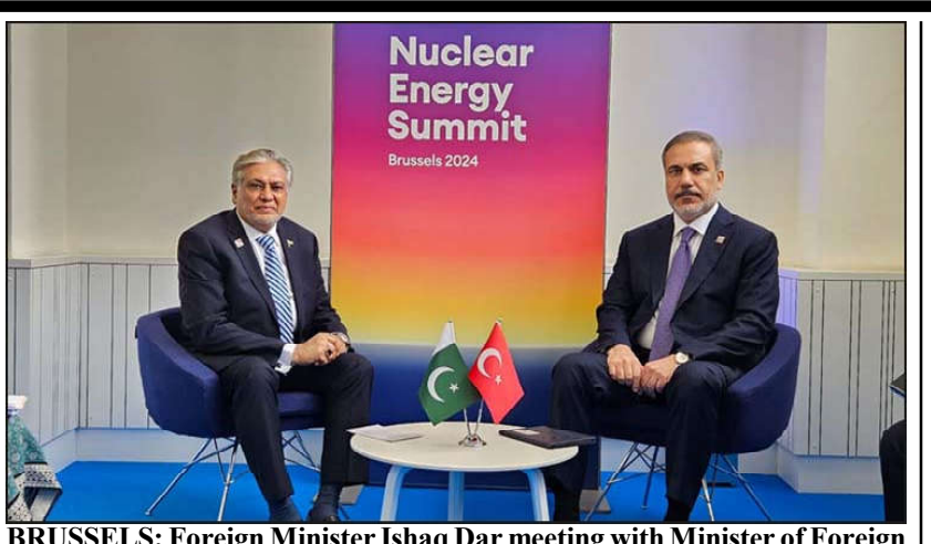
BRUSSELS: Foreign Minister Ishaq Dar meeting with Minister of Foreign Affairs of Türkiye Hakan Fidan on the sidelines of Nuclear Energy Summit 2024 in Brussels.

The necessary investigation has been started after recovering the betel nuts. The vehicles have also been impounded, the Customs Intelligence official added. He said that the Customs Intelligence is committed to wipe out menace of smuggling from