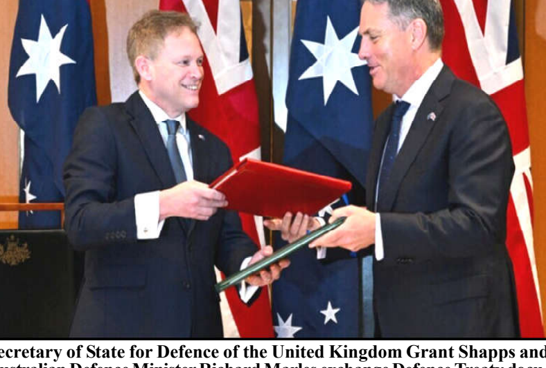
Secretary of State for Defence of the United Kingdom Grant Shapps and Australian Defence Minister Richard Marles exchange Defence Treaty documents during a meeting at Parliament House in Canberra.

On Wednesday, President Vo Van Thuong resigned due to unspecified violations that hurt the perception and reputation of the party and