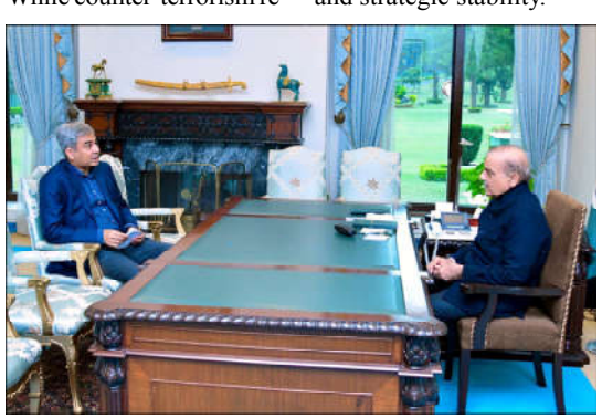
ISLAMABAD: Federal Minister for Interior, Narcotics Control and Chairperson Pakistan Cricket Board Syed Mohsin Raza Naqvi calls on Prime Minister Muhammad Shehbaz Sharif.