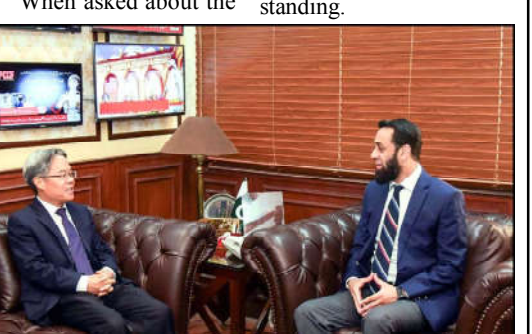
ISLAMABAD: Federal Minister for Information and Broadcasting, Attaullah Tarar exchanging views with Jiang Zaidong, Ambassador of the Peoples Republic of China during meeting held in Islamabad.

She said Pakistan values its close relations with the US and believes in constructive engagement with it. She said Pakistan respects the prerogative of legislative bodies to discuss international issues. She, however, said the deliberations of these legislative bodies should contribute promoting positive dynamics in bilateral ties based on mutual respect and under-