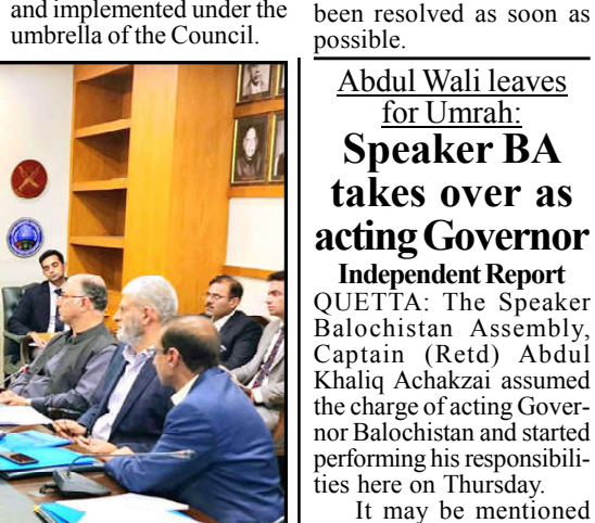
ISLAMABAD: Federal Minister for Interior Mohsin Naqvi chairing a meeting on matters related to Federal Investigation Agency.

country's resources drained down in shape of corrupmove bottlenecks in the intion. "This year's target of vestment process and since tax collection is Rs 9 trilthen nine meetings of the Apex Committee had been lion but its potential was over Rs 1.3 trillion. held besides more than 200 relevant meetings. Consecases of the taxes worth of quent to the meetings, he Rs 2.7 trillion were pendsaid a number of important ing either in the tribunals or decisions had been taken courts that should have and implemented under the