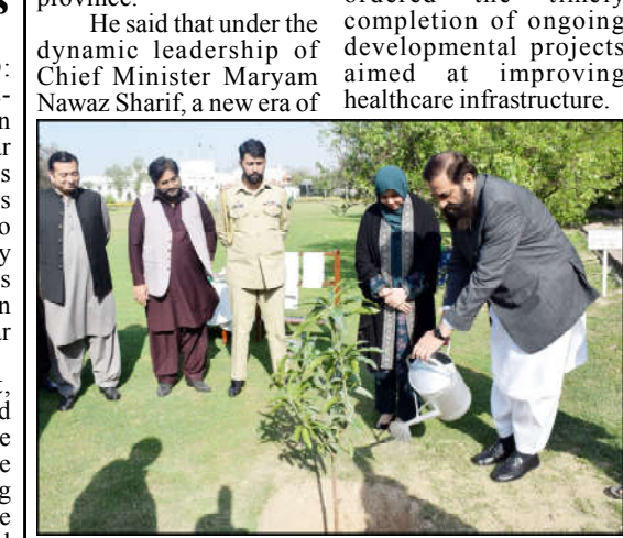
LAHORE: Punjab Governor Muhammad Balighur-Rehman along with his wife sapling a tree to inaugurate plantation campaign.