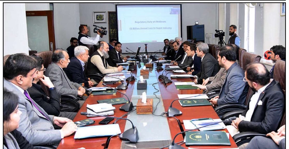
ISLAMABAD: Federal Minister for Commerce, Jam Kamal Khan, chairs significant meetings with representatives from the Sugar Mills Association and Ethanol Manufacturer Association to address pressing concerns affecting their industries.

They underscored the need for infrastructure improvements to enhance