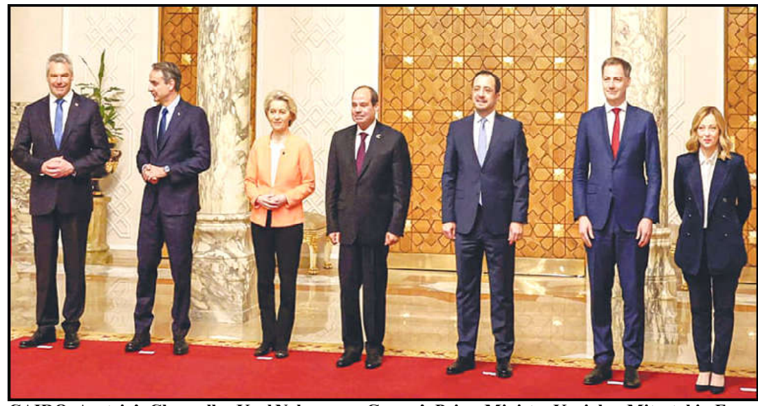
CAIRO: Austria's Chancellor Karl Nehammer, Greece's Prime Minister Kyriakos Mitsotakis, European Commission President Ursula von der Leyen, Egypt's President Abdel Fattah al-Sisi, Cyprus' President Nikos Christodoulides, Belgium's Prime Minister Alexander De Croo, and Italy's Prime Minister Giorgia Meloni posing for a photograph during their summit.

consolidated — no matter who wants to intimidate us, suppress us — nobody has ever succeeded in history, they have not succeeded now, and they will not succeed ever in the future," said Putin. Supporters chanted "Putin, Putin, Putin" when he appeared on stage and "Russia, Russia, Russia" after he had delivered his acceptance speech. Inspired by opposition leader Alexei Navalny, who died in an Arctic prison last month, thousands of opponents protested at noon against Putin at polling stations inside Russia and abroad.