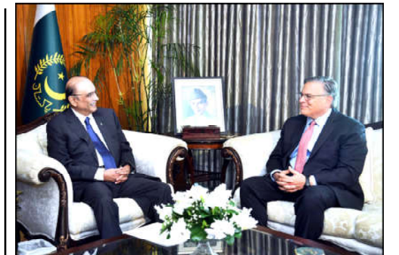
ISLAMABAD: The Ambassador of the United States of America to Pakistan, Donald Blome, calls on President Asif Ali Zardari, at Aiwan-e-Sadr.

On his X account the prime minister further posted that he looked forward to working with him (President Putin) to further strengthen Pakistan-Russian relations.