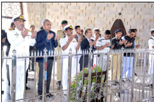
KARACHI: The Federal Minister for Interior Syed Moin Raza Naqvi offering Fataha at the mausoleum of father of the nation Quaid-e-Azam Mohammed Ali Jinnah during his first visit to the city.

Local residents promptly rushed to the site and retrieved bodies and the injured. The injured were shifted to nearby hospital for medical treatment. The local authorities and police also reached the site and started investigation into the cause of the incident.