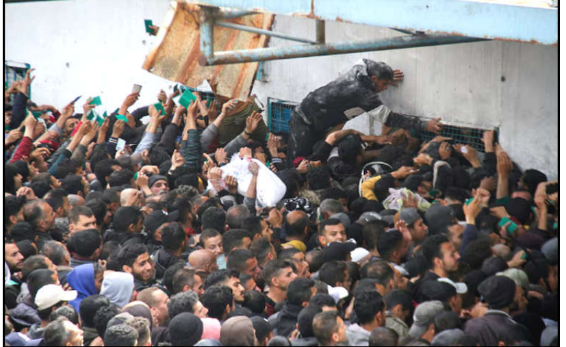
Palestinians gather to receive aid outside a UNRWA warehouse as Gaza residents face crisis levels of hunger, in Gaza City.