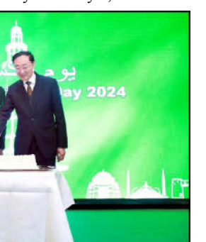
BEIJING: Ambassador of Pakistan to China, Khalil Hashmi and Vice Foreign Minister of the People's Republic of China, Sun Weidong cutting the cake in celebration of Pakistan National Day reception organised by Pakistan Embassy.

The information minister suggested that there should be a charter on "dos and don'ts of the red lines that should not be crossed", adding that political parties should discuss issues such as misogynistic abuse of women, cursing and mockery of martyrs, etc