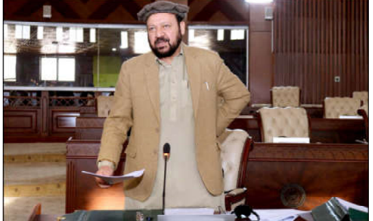
GILGIT: Chief Minister Gilgit-Baltistan Haji Gulbar Khan addressing during the 18th sitting of 18th Assembly session of Gilgit-Baltistan Assembly under the chair of Speaker Gilgit-Baltistan Assembly Nazir Ahmad Advocate.

forty people. Punjab Governor Muhammad Balighur Rahman said that we have to increase the number of trees and green areas in cities to eliminate the effects of environmental pollution. He said that I also ask the people of the province and especially the children to do your part in this campaign and do your part to make the country greener by planting more trees and focus on their growth along with planting to achieve the objectives of the plantation drive.