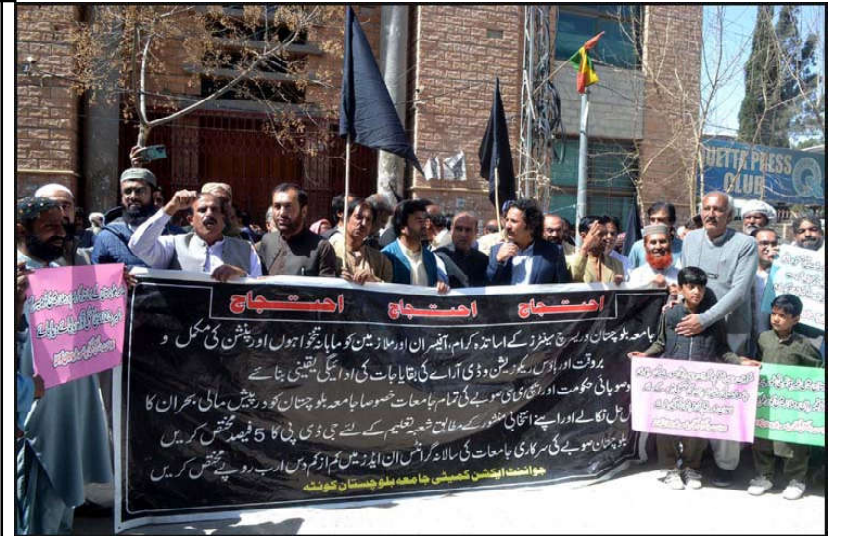
QUETTA: Members of Joint Action Committee University of Balochistan are holding protest demonstration against non-payment of their salaries.

MIRPUR (APP): Azad Jammu Kashmir President Barrister Sultan Mahmood Chaudhry, speaking at an Iftar party in his native village Khari Sharif near Mirpur city, emphasized the importance of strengthening the ongoing freedom movement against India on Monday. He stated that every Kashmiri has a national responsibility to contribute to the liberation struggle's success. Acknowledging the support he received from the people, Chaudhry highlighted his efforts to make Azad Jammu Kashmir a true base camp for the freedom