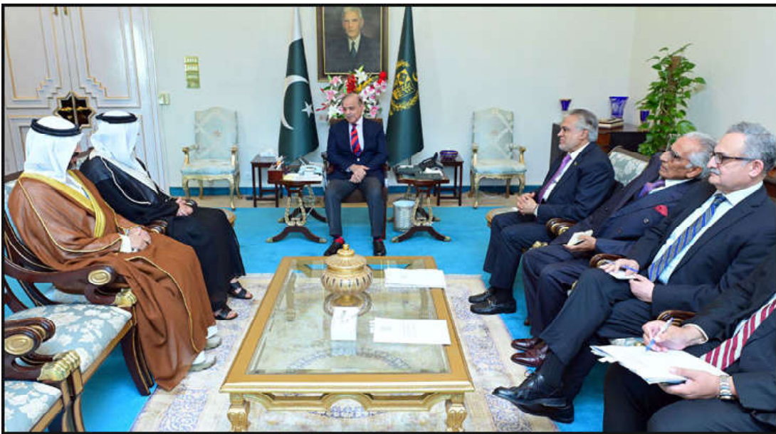
ISLAMABAD: Ambassador of the United Arab Emirates Amb. Hamad Obaid Ibrahim Salem Al-Zaabi calls on Prime Minister Muhammad Shehbaz Sharif, in the Provincial Capital.