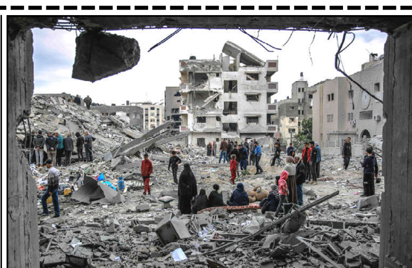
GAZA CITY: Palestinians inspect the rubble of a building after it was destroyed in an Israeli strike the night before in the Rimal neighbourhood. The head of Israeli intelligence is expected to lead ceasefire talks in Qatar in response to a new proposal from Hamas.

An exit poll will be published shortly after voting ends at 1800 GMT. Supporters of Alexei Navalny, who died in an Arctic prison last month, had called on Russians to come out at a "Noon against Putin" protest to show their dissent against a leader they cast as a corrupt autocrat. "Alexei was fighting for very simple things: for freedom of speech, for fair elections, for democracy and our right to live without corruption and war," Navalny's widow, Yulia, said in a message to a rally in Budapest on March 15. "Putin is not Russia. Russia is not Putin." There was no independent tally of how many of Russia's 114 million voters turned out at noon to show opposition to Putin.