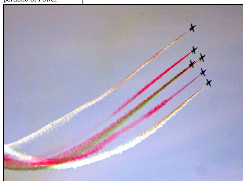
ISLAMABAD: Pakistan Air Force (PAF) jet demonstrating different skills during rehearsal ahead of the Pakistan Day parade on 23rd March in the Federal Capital.

The polling on these 11 seats is scheduled to be held on April 2, 2024 in the provincial assembly here.