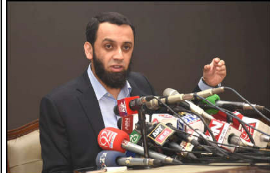
LAHORE: Federal Minister for Information and Broadcasting, Attaullah Tarar addressing a press conference at 180 h Model Town.

According to the notification of the Cabinet Division, the PM relieved Federal Minister for Petroleum Musadiq Masood Malik of the additional portfolio of Power.