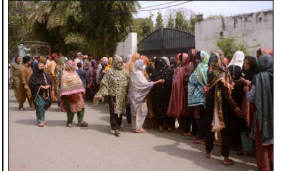
LAHORE: A large number of women in a queue to get flour bag on subsidies rate.