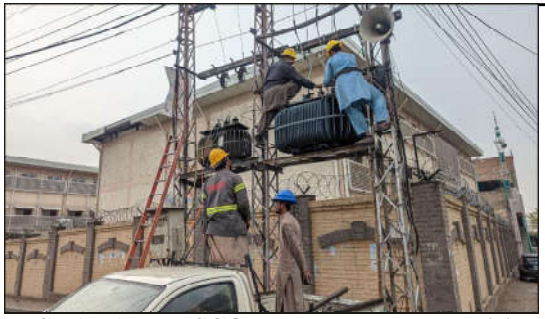
PESHAWAR: PESCO workers are busy repairing the transformer in the Tehsil area.

PESHAWAR (APP): Zahid Chanzab, Advisor to the Chief Minister Khyber Pakhtunkhwa on Tourism, Culture, Museums and Archeology, Sunday revealed that the tourism industry generates 30 billion dollars in revenue to the national economy, which is 6% of the country's GDP. "Nature has generously blessed our province with the world's best hill stations and tourist destinations and only focusing on this sector can revolutionize the economy of the province that can ameliorate the quality of life of the poor over here and the present PTI-led KP govt is quite serious to exploit all such vital sectors on crash grounds," he added. Trillion of rupees in income can be obtained from the tourism sector to spend on ameliorating a lot of the poor and contributing in restoration of the economy and infrastructure of the province, he maintained. He expressed this during his visit to the Khyber Pakhtunkhwa Culture and Tourism Authority (KPCTA) headquarters in Peshawar cantt wherein he went around various sections.