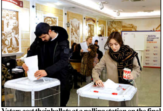
Voters cast their ballots at a polling station on the final day of the presidential election in Moscow, Russia.