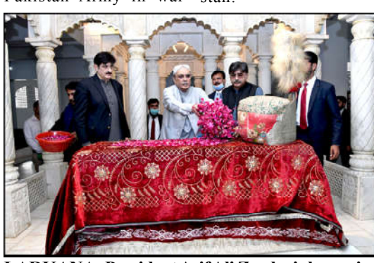
LARKANA: President Asif Ali Zardari showering flowers on the grave of Shaheed Zulfikar Ali Bhutto at his mausoleum in Garhi Khuda Bakhsh Bhutto.

dence in the Army. The COAS affirmed that Pakistan Army will continue to measure up to The Prime Minister the nation's expectations and members of the Cabiand will resolutely support the Government in addressing the security challenges facing Paki-