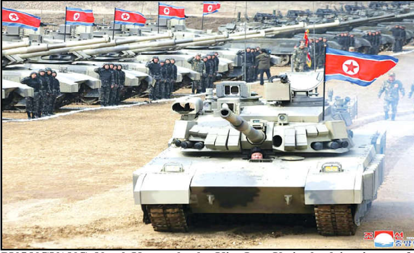
PYONGYANG: North Korean leader Kim Jong Un in the driver's seat of a new main battle tank after a training exercise for tank crews at an undisclosed location.