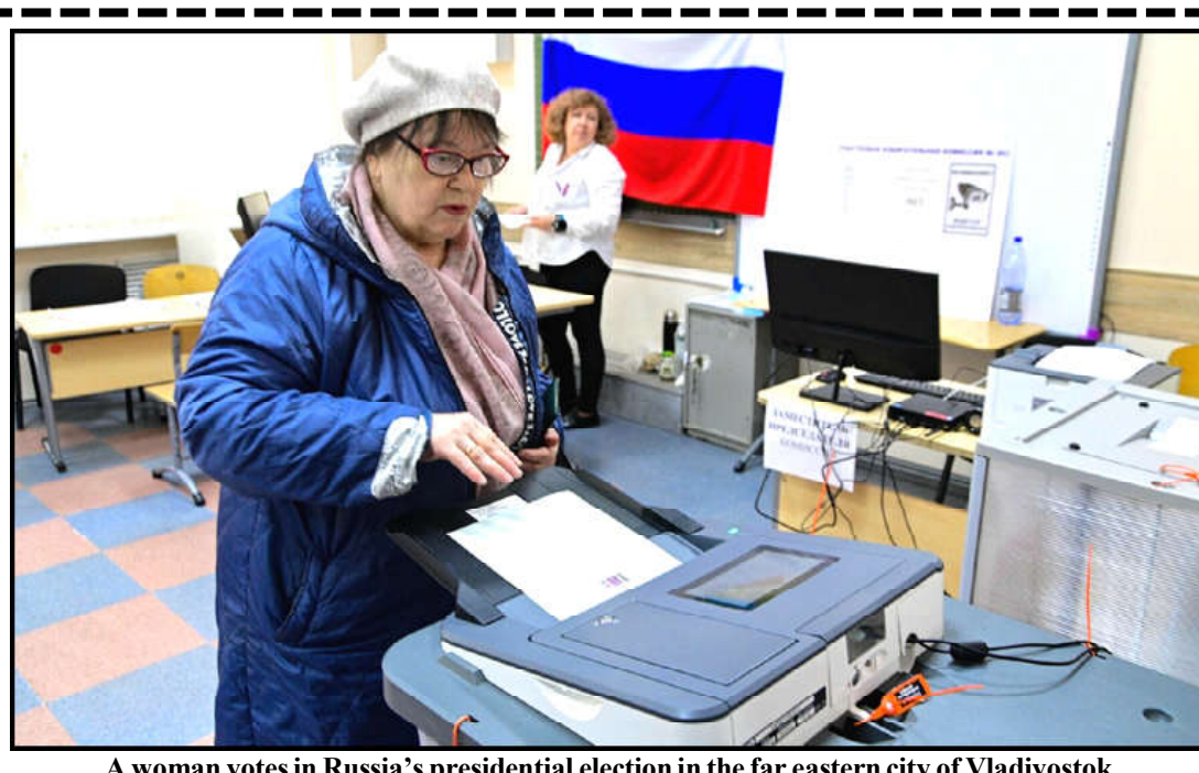
A woman votes in Russia's presidential election in the far eastern city of Vladivostok.

Two candidates who had hoped to run on a platform of calling for an end to the war in Ukraine, officially described by Russia as a "special military operation," were ruled ineligible.