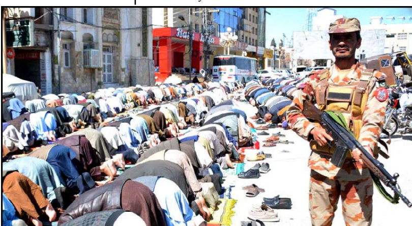
QUETTA: Security personal stan alert while Muslims offering first Friday prayers during the Muslim's holy month of Ramadan.