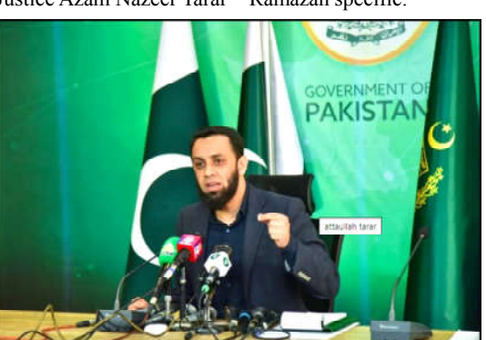
ISLAMABAD: Information Minister Attaullah

Responding to a calling attention notice moved by Naveed Qamar and others Minister for Commerce Jamal Kamal Khan said the temporary ban on export of bananas and onions is