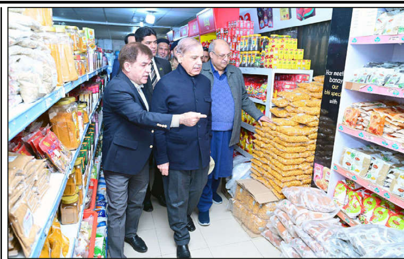
ISLAMABAD: Prime Minister Muhammad Shehbaz Sharif visits various special distribution points of Utility Stores Corporation set up with regard to PM's Ramzan Relief 2024.

The prime minister said he had appointed several teams that would pay surprise visits to various USC outlets to check the availability and quality of the food items adding that strict action would be taken against those involved in selling low quality items at the stores.