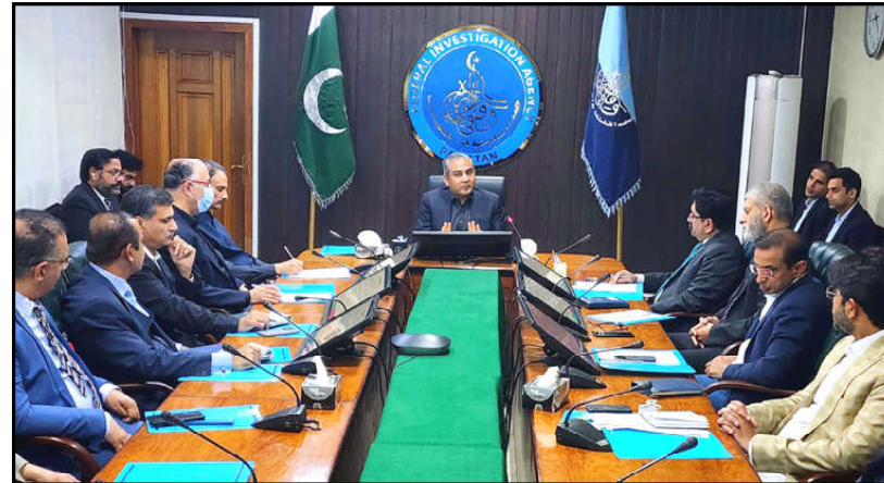
ISLAMABAD: Federal Minister for Interior, Mohsin Naqvi chairing a meeting at FIA headquarters.

He also asserted that the concept paper bases on the cut and paste would not be considered in future at all. Speaking at the meeting, Chief Minister inquired from the Secretary C&W that how many officers