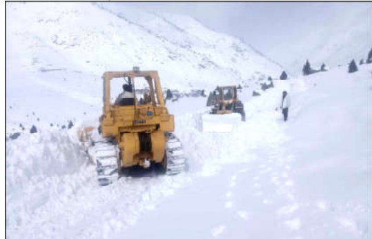
ASTORE: Heavy machinery being used to remove snow and boulders from the blocked road of Astore Valley by the staffer of Gilgit-Baltistan Disaster Management authority and Works Department after heavy snow fall and rain in area caused land sliding in diffident area.

ISLAMABAD (APP): Foreign Minister Ishaq Dar has received congratulatory messages from his counterparts of various countries on assuming his office. Foreign Minister of Czech Republic Jan Lipavsky, congratulating Ishaq Dar on his appointment as the Minister of Foreign Affairs of Pakistan said Czechia and Pakistan had long enjoyed friendly and constructive relations. Foreign Minister of Maldives Moosa Zameer also extended congratulations saying he was confident that the bilateral relations will continue to grow stronger under his leadership. Responding to his congratulatory message, Foreign Minister Dar posted on X expressed his gratitude to Moosa Zameer and said that he looked forward to working closely with him to promote cooperation between Pakistan and Maldives. Likewise Ukrainian FM Dmytro Kuleba congratulating Ishaq Dar on his appointment as Pakistan's 39th Foreign Minister wished him every success in his most responsible mission. "I look forward to expanding mutually beneficial bilateral and international cooperation between Ukraine and Pakistan", he added.