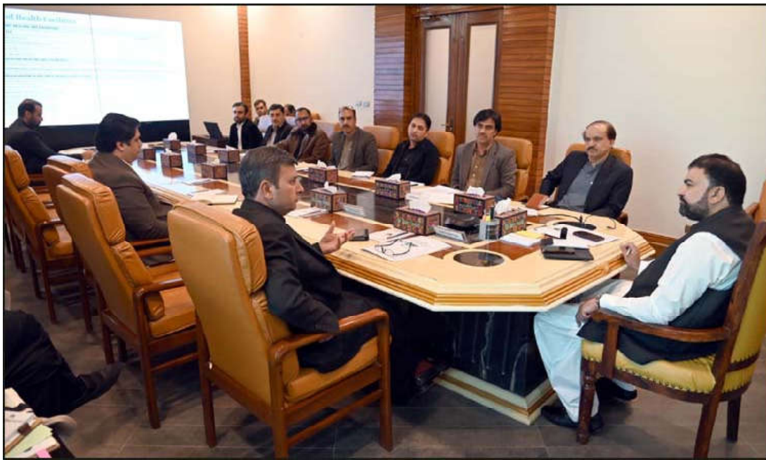
QUETTA: Chief Minister Balochistan Mir Safaraz Ahmed Bugti presiding over a meeting to review affairs of Health Department.