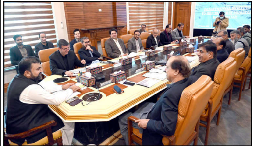
QUETTA: Chief Minister Balochistan Mir Sarfraz Ahmed Bugti presiding over a review meeting about Communication and Works Department

Welcoming Chief Minister Khyber Pakhtunkhwa Ali Amin Khan Gandapur, the prime minister said that all the four provinces were the components of the federation and when they moved together, the country achieved progress and development.