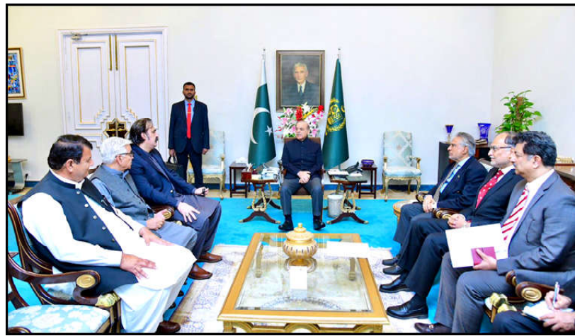
ISLAMABAD: Chief Minister Khyber Pakhtunkhwa, Ali Amin Khan Gandapur calls on Prime Minister Muhammad Shehbaz Sharif.

dren. Her wife and another child were also burnt and injured. The rescue teams and area police rushed towards the area on being informed, and shifted the deceased and injured to the Bolan Medical Complex Hospital. The necessary treatment is being provided to the injured, however, their condition is stated to be serious, said the hospital sources.