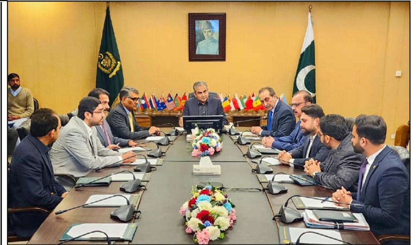
Federal Minister for Interior & Narcotics Control, Mohsin Naqvi chairing a meeting at Ministry of Narcotics Control in Islamabad.