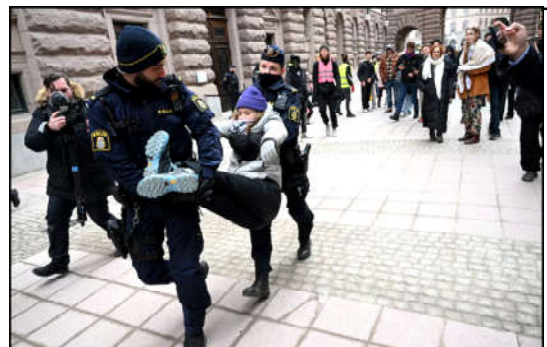
Greta Thunberg is removed by police officers as she demonstrates outside the Swedish parliament building together with a group of climate activists in Stockholm, Sweden.

warnings that Russia's aggression will not stop at Ukraine. "This ammunition will keep Ukraine's guns firing for a period, but only a short period," White House National Security Advisor Jake Sullivan told reporters as he announced the aid package. Sullivan added that the aid may only last a couple of weeks, leaving Ukraine outgunned in the face of a Russian war machine that is churning out arms and throwing troops at stalemated towns to force a breakthrough. "It is nowhere near enough to meet Ukraine's battlefield needs and it will not prevent Ukraine from running out of ammunition in the weeks to come." The shipment would include long-range US-made HIMARS rocket systems, anti-aircraft and anti-tank weapons, artillery shells and small arms ammunition, the Pentagon said.