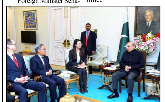
ISLAMABAD: Ambassador of the People's Republic of China Ambassador Jiang Zaidong calls on Prime Minister Muhammad Shehbaz Sharif.

Giving further details, it says thundershowers are expected in Chaman, Ziarat, Pishin, Kalat, Chagai, Sorab, Sibbi, Naseerabad, Mastung, Noshki and Loralai.