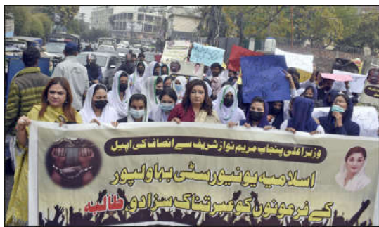
LAHORE: Teachers and students of Islamia University Bahawalpur are protesting against the alleged sexual harassment in front of Press Club in the Provincial Capital.