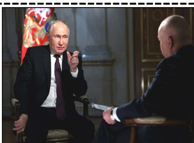
Vladimir Putin speaks during an interview in Moscow.

The war in Ukraine has triggered the deepest crisis in Russia's relations with the West since the 1962 Cuban Missile Crisis and Putin has warned several times the West risks provoking a nuclear war if it sends troops to fight in Ukraine. Putin sent tens of thousands of troops into Ukraine in February 2022, triggering full-scale war after eight years of conflict in eastern Ukraine between Ukrainian forces on one side and pro-Russian Ukrainians and Russian proxies on the other. In a U.S. election year, the West is grappling with how to support Kyiv against Russia, which now controls almost one-fifth of Ukrainian territory and is rearming much faster than the West and Ukraine.