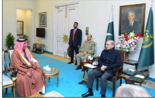
ISLAMABAD: Commander of Bahrain National Guard calls on Prime Minister Muhammad Shehbaz Sharif.

Mohtarma Benazir Bhutto, and the Pakistan People's Party workers who sacrificed their lives to establish this truth. It appreciated the determination with which President Asif Ali Zardari filed a presidential reference to reopen the case 12 years ago, and Bilawal Bhutto Zardari, who single-mindedly pursued it. The resolution lauded the Supreme Court of Pakistan for finally acknowledging and accepting the glaring injustice meted out to Shaheed Zulfikar Ali Bhutto 44 years ago in its judgment. In light of the historic judgment of the court, the resolution demanded that the unjust verdict given in the Shaheed Zulfikar Ali Bhutto case must be overturned. It also called for conferring the highest civil award, Nishan-e-Pakistan, upon Zulfikar Ali Bhutto. Furthermore, the resolution demanded the establishment of the Nishan-e-Zulfikar Ali Bhutto Award for workers and activists who have fought and sacrificed their lives for true democracy in Pakistan.