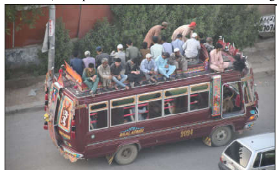
KARACHI: Passengers sit on the roof of a bus on MA Jinnah Road in Provincial Capital. Pakistan has one of the world's worst records for fatal traffic accidents, blamed on poor roads, badly maintained vehicles and reckless driving.

During the proceedings, a provincial law officer sought time for filing written reply to the petition while responding to a court query. He submitted that some members had taken oath on reserved seats. The reply will be filed to the extent of other members who had not sworn in yet, he added. At this stage, the petitioner's counsel requested the court to issue a stay order, adding that it was an important matter. However, the court declined the request.