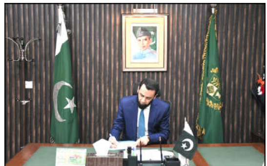
ISLAMABAD: Attaullah Tarar assumes charge as Federal Minister for Information and Broadcasting.

and Broadcasting. On his arrival at the Ministry of Information, Attaullah Tarar said the doors of the Ministry of Information would remain open for the journalist community. He stressed the need for the promotion of positive and constructive journalism in the country and strengthening the relationship between the government and the media. Attaullah Tarar said he will work together with the media to communicate the government's initiatives and policies to the people. He remarked that the media played the role of a bridge between the people and the government and this role needed to be played in a better manner.