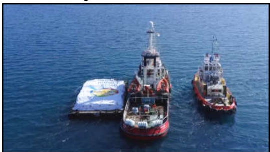
Aid ship sails, amidst a test to launch a new sea route from a port in Cyprus to deliver aid to residents of the Gaza Strip who are on the brink of famine, at sea.

Monitoring Desk LARNACA: A ship carrying 200 tonnes of aid for Gaza left Cyprus on Tuesday in a pilot project to open a sea route to deliver supplies to a population aid agencies say is on the brink of famine. The charity ship Open Arms was seen sailing out of Larnaca port in Cyprus, towing a barge containing flour, rice and protein. The mission was funded mostly by the UAE and organised by US-based charity World Central Kitchen (WCK). The journey to Gaza takes about 15 hours but a heavy tow barge could make the trip take considerably longer, possibly up to two days. Cyprus is just over 200 miles (320 km) north-west of Gaza. The US military said its vessel, the General Frank S Besson, was also en route to provide humanitarian relief to Gaza by sea. With aid agencies saying deliveries into Gaza have been held up by bureaucratic obstacles and in-