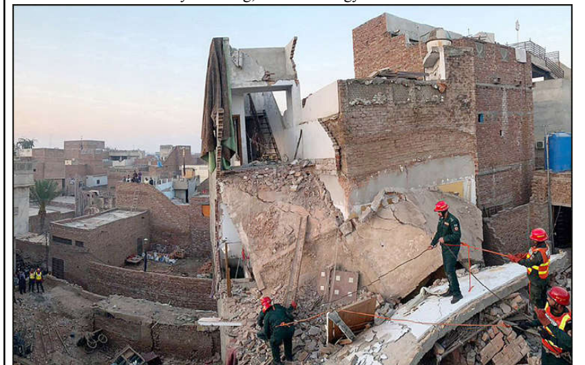
MULTAN: Rescue-1122 workers performing rescue operation at the cylinder gas blast spot in Mohala Jawadia near Haram Gate.