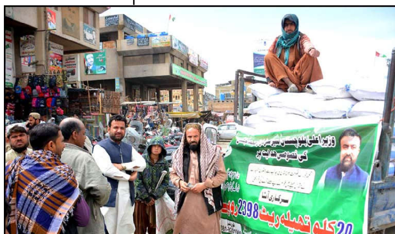
QUETTA: A large number of people gather for collecting relief flour bags during food aids distribution under the supervision of provincial government in connection of the Holy month of Ramadan-ul-Mubarak, at Meezan Chowk in Quetta.

PESHAWAR (APP): At least two cops embraced martyrdom while an ASI sustained injuries in an attack by terrorists on a police mobile in the jurisdiction of the Machni Gate area police station. According to SSP Operations Peshawar, Kashif Aftab Abbasi, the policemen were on routine patrolling when the terrorists ambushed and attacked the police mobile. The SSP said that a search operation was started in the area to trace the terrorists.