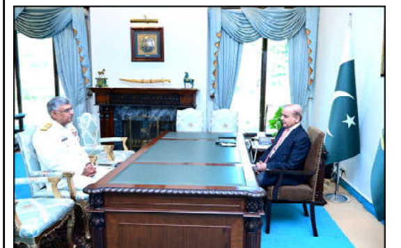
ISLAMABAD: Chief of Naval Staff, Admiral Naveed Ashraf calls on Prime Minister Muhammad Shehbaz Sharif.

ISLAMABAD (Online): Chief of Naval Staff Admiral Naveed Ashraf called on Prime Minister Muhammad Shehbaz Sharif in Islamabad Tuesday and discussed professional matters pertaining to Pakistan Navy. The Naval Chief also felicitated Shehbaz Sharif on assuming the office of the Prime Minister.