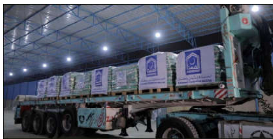
Ramzan Food Package for 15000 affected families is being dispatched to Gaza from Al-Khidmat Foundation.