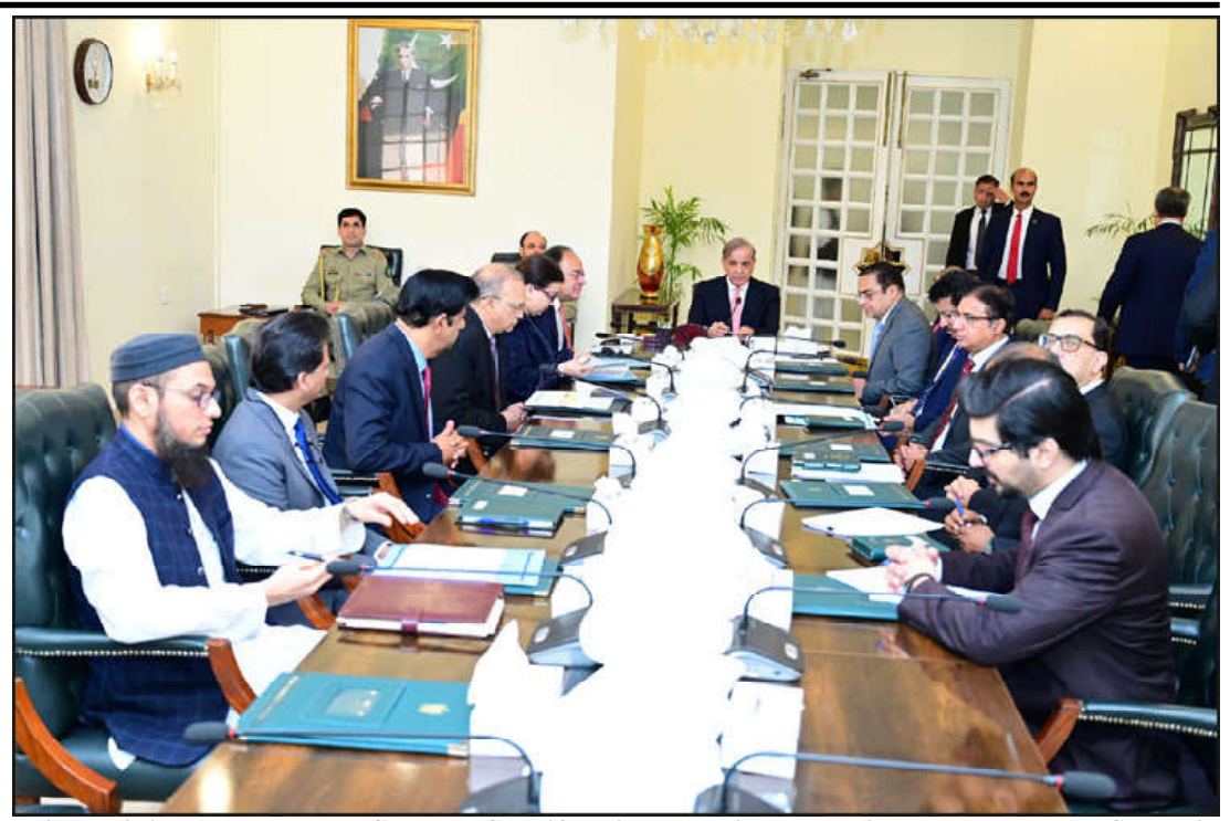
Prime Minister Muhammad Shehbaz Sharif chairs a meeting regarding IT and Telecom Sector in Islamabad.

The meeting was informed that during the previous year, an investment of $400 million was made in Pakistani startups.