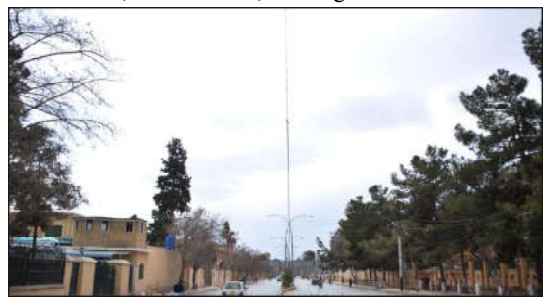
QUETTA: A view of desert looks on the road during 1st holy Ramadan-ul-Mubarak.

ISLAMABAD (INP): The Ministry of Health has confirmed the presence of the poliovirus in sewage lines spanning the four provinces of Pakistan. Twelve districts across the country have tested positive for polio in sewage samples, as revealed in a technical report received by the Ministry of Health. This brings the total number of polio-positive sewage samples for the current year to 46. Kohat, Quetta, Peshawar, and Sibi have also tested positive for polio. Further analysis identified polio-positive sewage in specific locations such as the Jacob Pumping Station in Hyderabad, Jacobabad Sadar Pumping Station, Sukhranka Pumping Station, Sabi Ganda Nala in Balochistan, Jatak Clay in Quetta, and Faqir Abad in Kohat. The Ministry of Health emphasizes the urgency of addressing the polio threat, especially given the rise in cases. Previous reports had confirmed polio in sewage samples from Islamabad and three provinces. The ministry reported a record 14 sewage samples testing positive for polio in seven cities across Sindh, KP, and Balochistan, bringing the total for 2023 to 112. Cities such as Karachi, Peshawar, Quetta, and Sukkur continue to harbor the poliovirus in their sewage.