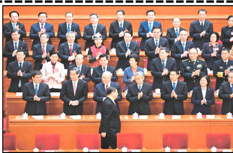
BEIJING: Delegates applaud as President Xi Jinping (centre) arrives for the closing session of the National Peoples Congress at the Great Hall of the People.

"life-saving relief for Palestinians in Gaza is coming in trickles—if it comes at all." Drawing attention to the threat of an Israeli assault on Rafah, Guterres warned that it could plunge Gaza into an even deeper crisis. He deplored that no party showed any respect for international humanitarian law during this war and as a result, "international humanitarian law lies in tatters." The UN chief recalled heartfelt pleas from families affected by the conflict, quoting a family member who said, "We are not here for condolences." We are not here for apologies. We are here for immediate action."