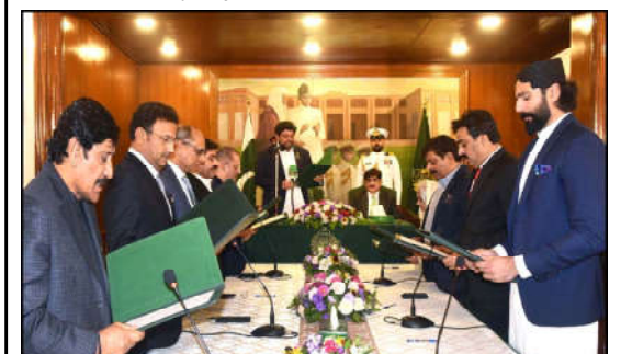
KARACHI: Sindh Governor, Kamran Tessori administering oath to provincial cabinet members of Sindh during oath taking ceremony held at Governor House in Karachi.

QUETTA (APP): Balochistan Chief Minister Mir Sarfraz Bugti expressed his deep sorrow over the death of Asafandiyar Wali's wife and mother of Aimal Wali and condoled with the bereaved family. In one of his statements, the chief minister prayed to Almighty to rest the departed soul in eternal abode with peace and granting courage to bereaved family members.