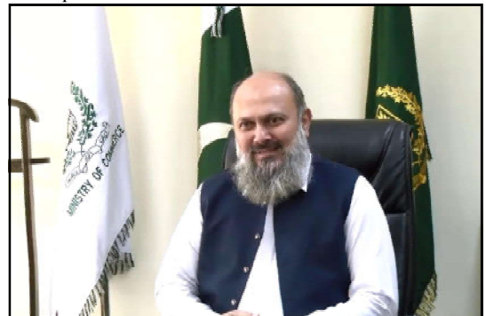
The Minister brings a wealth of experience to his new role. During his inaugural briefing, the Ministry's scope and objectives were outlined.