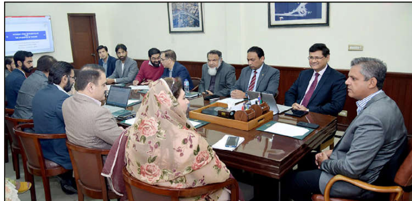
LAHORE: Punjab Transport Minister Bilal Akbar Khan presides over the meeting of department at Transport House.

said that the merger had increased the KP population manifolds but no the resources. It was told that the share of the province under NFC was 19.64 percent in proportion to the current population of the province, while the province was only getting 14.16 percent at the time. The finance department informed that according to the current population of the province, it should get Rs 262 billion annually in the form of NFC Award. Similarly, under the ten-year development plan of the merged districts, the province has so far received only 103 billion rupees out of 500 billion rupees.