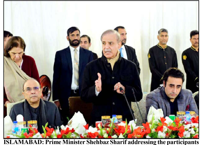
of the dinner reception hosted by him

Ph: 2841470/2841473 Vol: XIX No. 264, Shaban 26, 1445 AH Friday March 08, 2024, Pages 04, Price Rs. 15