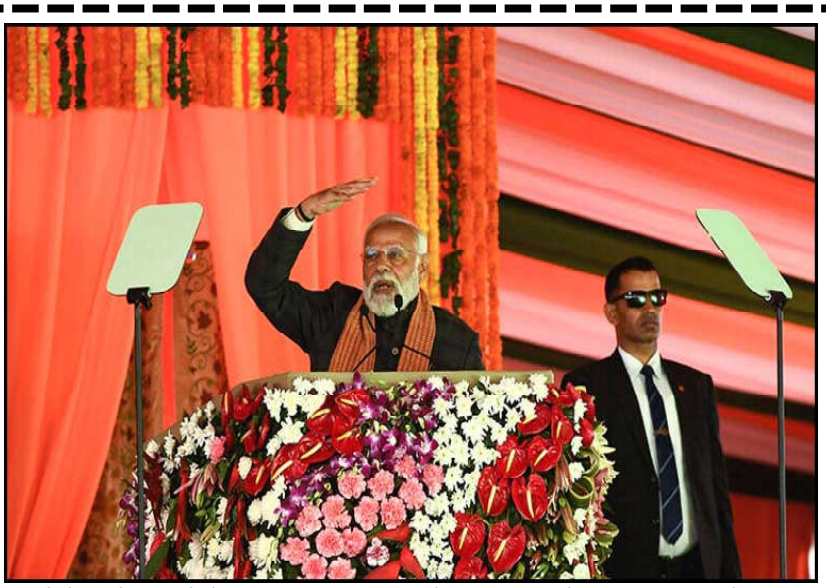
India's Prime Minister Narendra Modi speaks during a rally, as his bodyguard looks on at the Bakshi Stadium in Śrinagar.

Modi's government claims New Delhi's direct rule of Indian-occupied Kashmir brought about a new era of "peace and development", but critics and police and paramilitary many residents say it heralded a drastic curtailment of civil liberties and press Modi also remotely freedom.