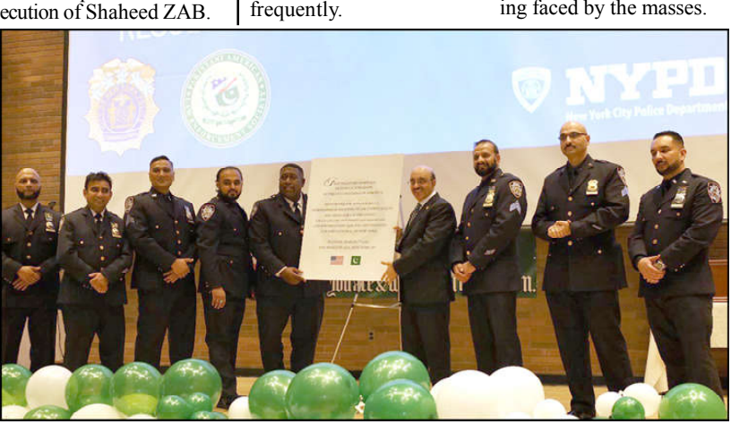
NEW YORK: Ambassador Masood Khan inaugurates the event "Pakistan Heritage and Resolution Month" being organized by New York Police De-

maining present there. He also directed to utilize all their capabilities