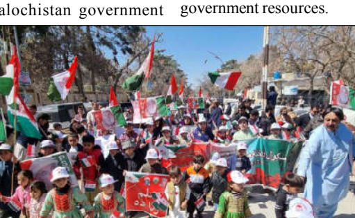
OUETTA: Students are holding demonstration in connection with the school admission campaign organized by the Pashtunkhwa Students