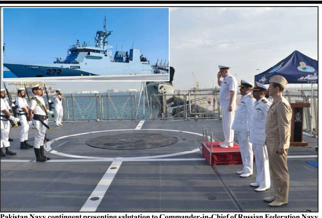
Pakistan Navy contingent presenting salutation to Commander-in-Chief of Russian Federation Navy Mubarak, under the packonboard PNS TABUK during Doha International Maritime Defence Exhibition 2024.