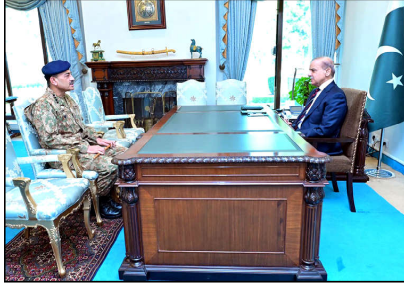
ISLAMABAD: Chief of Army Staff General Syed Asim Munir NI (M) calls on Prime Minister Muhammad Shehbaz Sharif.

PESHAWAR (APP): Prime Minister Muhammad Shehbaz Sharif here on Wednesday distributed a huge compensation financial package among victims of the recent torrential rains and flooding of Khyber Pakhtunkhwa. He on behalf of the Federal Government distributed Rs two million cheque among heirs of each deceased and Rs. 500,000 among each injured of the recent torrential rains and floods in different districts of the province including merged tribal districts. The prime minister handed over the compensation cheques during a function held here at Governor House. It was the first visit of the Prime Minister Muhammad Shehbaz Sharif to Khyber Pakhtunkhwa after assuming the office of the Prime Minister of Pakistan. Besides others, Khyber Pakhtunkhwa Governor, Haji Ghulam Ali, Members National Assembly, Khwaja Muhammad Asif, Engr Amir Muqam, Sardar Muhammad Yousaf, Murtaza Javed Abbasi, Attaullah Tarar, PML-N Leader Ishaq Dar, former Governor KP, Engr Iqbal Zafar Jhagra, senators, members provincial assemblies, Chairman NDMA Lt Gen Inam Haider Malik IGP KP Akhtar Hayat Gandapur and relatives of the rains victims were present on the occasion. A total of 40 people including 27 children died and 62 injured during recent torrential rains and floods in Khyber Pakhtunkhwa.