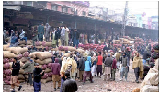
ISLAMABAD: A large number of people purchasing onion at Vegetable and Fruits Market.

potential of effective data utilization in contributing to sustained economic growth, societal welfare, poverty reduction, and improved living standards across the diverse SAARC region. During his speech, Mr. Ahmad shed light on the growing role of Big Data in central banking, financial inclusion, and how the SBP is incorporating Big Data analysis in policymaking. He also shared specific examples of how the central bank uses Big Data analytics for economic analysis, leveraging satellite imagery data, and harnessing the power of machine learning algorithms for fraud detection and prevention.