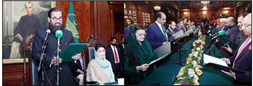
LAHORE: Governor Punjab Muhammad Balighur Rehman administering oath to 18-member new Provincial Cabinet. Chief Minister Maryam Nawaz is also present.