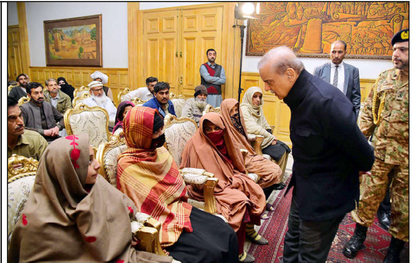
PESHAWAR: Prime Minister Muhammad Shehbaz Sharif interacting with the families of the deceased and injured in the wake of recent torrential rains and heavy snowfall.

ISLAMABAD (Online): Prime Minister Muhammad Shehbaz Sharif has emphasized robust planning and institutional structure to tackle natural calamities. He was talking to the affected of rains and floods in Khyber Pakhtunkhwa during his visit to Peshawar today. The Prime Minister said Pakistan is among the countries most vulnerable to climate change. He said Pakistan has faced disastrous floods during 2022 and recently the torrential rains in Khyber Pakhtunkhwa led to death of about forty people. The Prime Minister appreciated the role of Provincial Disaster Management Authority, the chief secretary, district administrations and all those who contributed in the effort to rescue and rehabilitate the rain affected people. He said the compensation amount has already been distributed among the injured and heirs of the deceased.