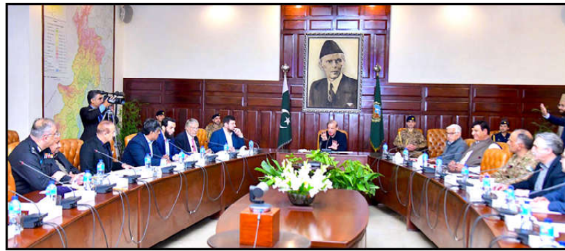
PESHAWAR: Prime Minister Muhammad Shehbaz Sharif chairs a meeting regarding recent torrential rains and heavy snowfall and the ongoing rescue and relief activities for the affected.

He noted with concern that billions of rupees are being spent on health and education sectors, however, it's outcome is not satisfactory. He also said that the absence of medical and teaching staff at their duty places is intolerable at all.