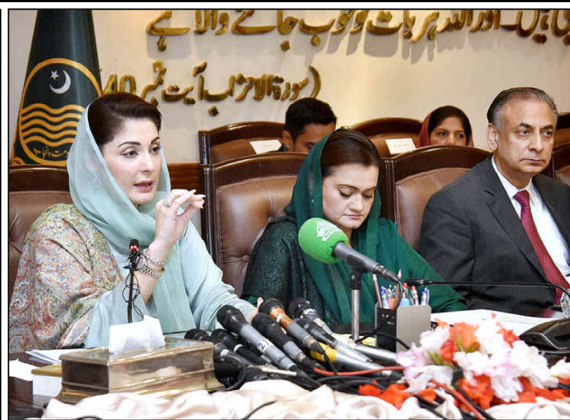
LAHORE: Chief Minister Punjab, Maryam Nawaz announcing the Ramadan Package in a press conference at Chief Minister House.

Ramazan relief package items including flour, ghee, sugar, rice, and gram flour, the CM directed the district administrations and the Punjab Food Authority to ensure quality of food items. Random checks on hamper content and digitalised delivery mechanisms with the PITB-developed applications would enhance transparency, she added. Maryam Nawaz said that a digitalised record of distribution of 6.5 million hampers, with a helpline (080002345), established for public feedback and complaints, would ensure timely and fair distribution among genuinely deserving people.