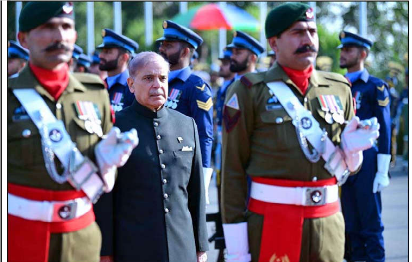
ISLAMABAD: Prime Minister Muhammad Shehbaz Sharif inspecting the Guard of Honor presented by a contingent of Pakistan's Armed Forces upon arrival at the Prime Minister House.

said that Zulfiqar Ali Bhutto decided to use our resources for the betterment of Muslim countries and he united the Muslim countries but unfortunately, he was hanged. He urged the government and masses to stay within your resources to get rid of foreign loans, adding that only this way we can get honor in the world. Senator Mohsin Aziz said that we should probe the issues within the Muslim Ummah as without resolving these issues, we cannot make progress and stand at the international level with honor. Senator Mohammad Humayun Mohmand said that Palestinian-injured Children were being operated on without anesthesia which is so painful that a human cannot bear it.