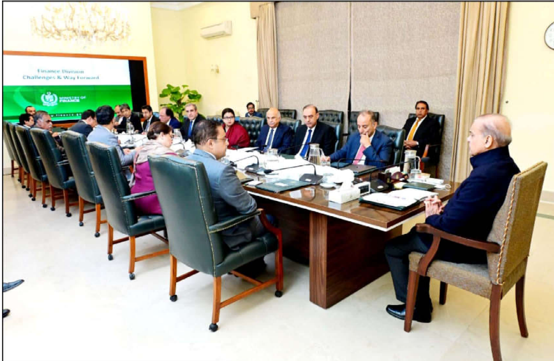
ISLAMABAD: Prime Minister Muhammad Shahbaz Sharif chairing a meeting on the matters related to economy

Ph: 2841470/2841473 Vol: XIX No. 261, Shaban 23, 1445 AH Tuesday March 05, 2024, Pages 04, Price Rs.15