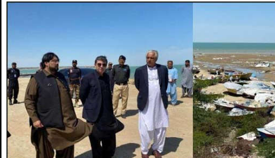
Chief Secretary Balochistan Shakeel Qadir Khan visiting different affected areas of Jewani.

play their part in making the Green Pakistan project a success. He said that we all need a clean and natural environment saying that natural disasters were increasing day by day as a result of climate change due to deforestation in Pakistan and climate change was being happened which was causing death and diseases for human health. To prevent these climate changes, it is necessary to plant more plants to make the environment like nature's desire.