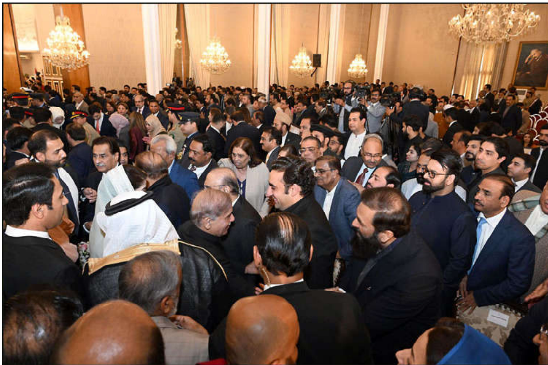
ISLAMABAD: Chairman Pakistan People's Party Bilawal Bhutto Zardari, shake hand with, Prime Minister Mian Muhaamad Shahbaz Sharif after the oath taking ceremony, at President House in the Federal Capital.