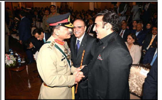
ISLAMABAD: Chief of Army Staff Syed Asim Muneer shake hand with Chairman Pakistan People's Party Bilawal Bhutto Zardari during the oath taking ceremony of Prime Minister Mian Muhaamad Shahbaz Sharif at President House in the Federal Capital.

Independent Report QUETTA: The Chief Minister Balochistan, Mir Sarfraz Ahmed Bugti participated in the oath taking ceremony of the new Prime Minister, Muhammad Shehbaz Sharif in Aiwan-e-Sadr Islamabad on Monday. The Chief Minister especially went to Islamabad to attend the oath taking ceremony of newly elected Prime Minister. Mir Sarfraz Bugti also greeted Muhammad Shehbaz Sharif on assuming the office of Prime Minister for second term.