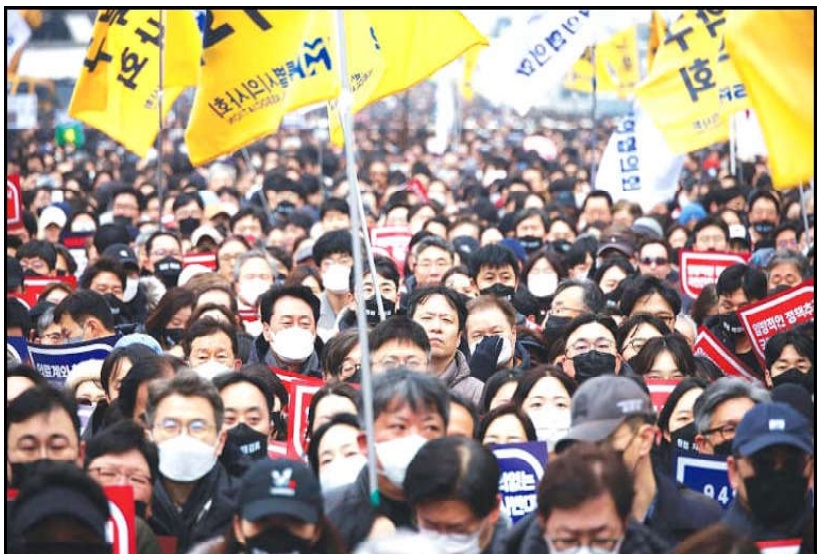
Children stand amid the rubble of a mosque and makeshift shelters that were destroyed in Israeli strikes in Deir El-Balah in central Gaza.