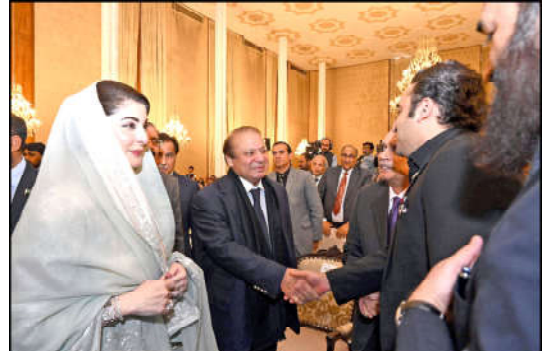
ISLAMABAD: Leader of Pakistan Muslim League (N) Mian Muhammad Nawaz Sharif shake hand with Chairman Pakistan People's Party Bilawal Bhutto Zardari after the oath taking ceremony of Prime Minister Mian Muhaamad Shahbaz Sharif at President House in the Federal Capital, Chief Minister of Punjab Maryam Nawaz Sharif also seen in the picture.