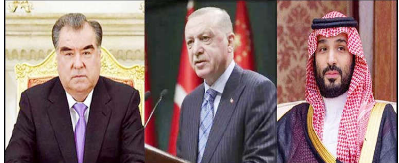
him success during the next five years of rule. Saudi Prime Minister and Crown Prince Mohammed bin Salman bin Abdulaziz Al-Saud and stan. According to the Saudi Press Agency (SPA), Crown Prince Mohammed bin Salman wished Shehbaz Sharif success, and the people of Pakistan steady

ISLAMABAD (APP): Different world leaders felicitated the newly elected Prime Minister Muhammad Shehbaz Sharif on assuming the office of the country's chief executive and wished progress and prosperity. Malaysian Prime Minister Anwar Ibrahim in separate messages on Monday congratulated Muhammad Shehbaz Sharif for taking oath as 24th prime minister of Islamic Republic of Pakistan. President Recep Tayyip Erdogan of Turkey on Monday called Prime Minister Muhammad Shehbaz Sharif and congratulated him on his election as the country's chief executive. The prime minister expressed his gratitude to President Erdogan for his gracious gesture of brotherhood and fraternity. He underlined that enduring people-to-people bonds, and strong religious and cultural linkages underpinned a robust Pakistan-Turkiye relationship. Prime Minister Shehbaz also conveyed that Pakistan looked forward to welcoming President Erdogan for the session of Pak-Turkiye High-Level Strategic Cooperation Council (HLSCC), being scheduled to be held in Islamabad in near future. Recalling strong bonds of friendship that exist between the governments and peoples of the two countries, both the leaders expressed their desire and commitment to work closely with each other to take the bilateral relationship to unprecedented heights of cooperation and fraternity.