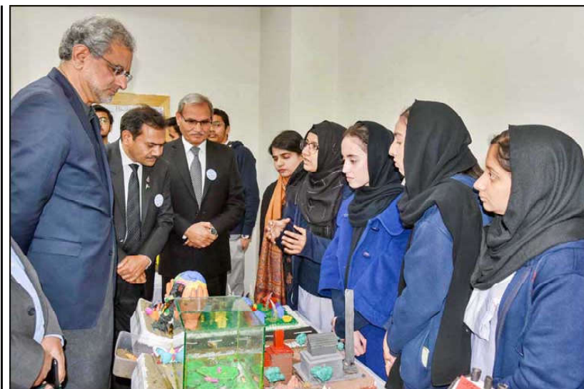
RAWALPINDI: Former Prime Minister Shahid Khaqan Abbasi along with Chaudhary Muhammad Akram keenly viewing Science & Arts Exhibition of Punjab College of Commerce.

perceived as a threat. He emphasized, "We do not believe in retaliatory actions, but reform is our duty." He expressed the desire for a system where no one can commit violence or injustice against anyone else, aiming for a better and fair system for the coming generations. Earlier, he offered condolences to the family of martyred SP Ijaz Khan in Sherpav village, Charsadda and met with the children of the martyred. He praised the bravery and sacrifices of the police in the line of duty.