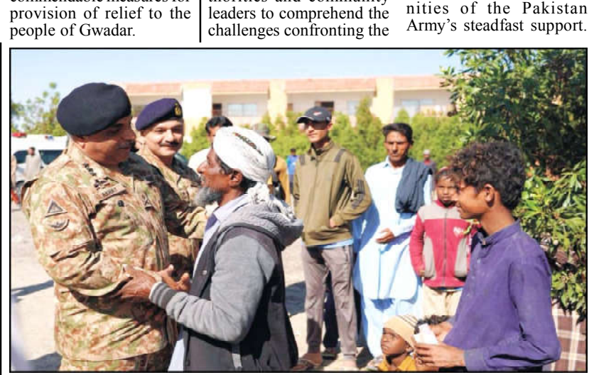
GWADAR: Corps Commander Balochistan Lt. General Rahat Naseem meeting with affectees during his visit to flood affected areas of Gwadar

Interacting with social and regional elders during his visit, Lieutenant General Rahat Naseem reiterated the unwavering commitment of the Pakistan Army to ensure the prompt delivery of relief and rehabilitation efforts in collaboration with civil administration and pertinent institutions. Emphasizing continuity in relief operations until normalcy is restored, the Corps Commander assured the affected communities of the Pakistan