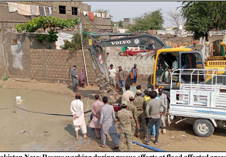
Pakistan Navy Rescue working during rescue efforts at flood affected areas of Gwadar

He added that the real victory would be the victory of the people's man-date and truth whether the rivals won by rigging and malpractices. He stressed that the PTI founder would be victorious and would take the throne of the prime spell doom for the country. minister of Pakistan one