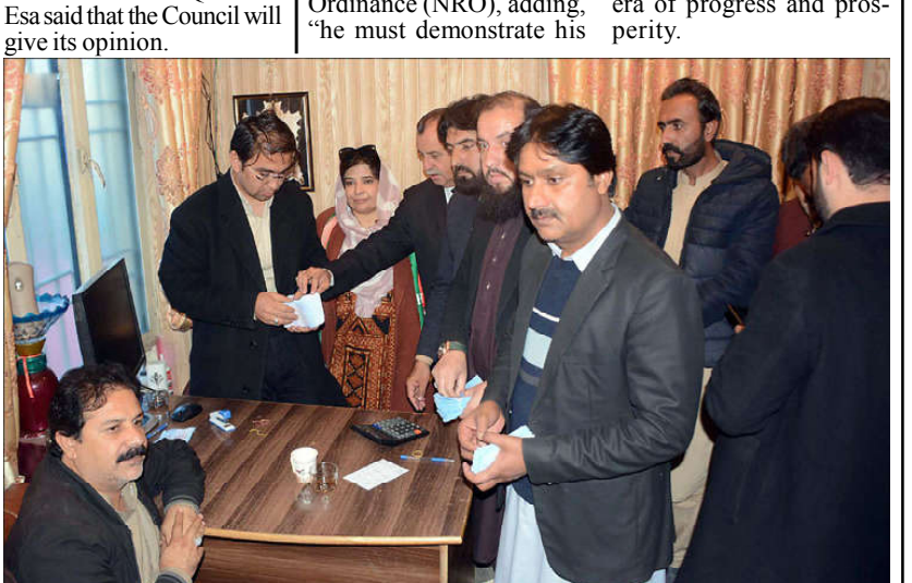
QUETTA: A view of counting of votes at the end of PTI inter-party election.

The era of Mian Nawaz Sharif was a golden era of progress and pros-