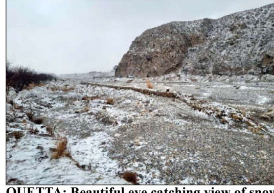
QUETTA: Beautiful eye catching view of snow covered area during the snowfall of winter season. which more decreases the temperature below in minus degree Celsius, at mountainous areas of

Aneeq further stated that this year, they pledge to serve the pilgrims diligently, and those selected through the written exam would demonstrate enhanced performance during the Hajj 2024