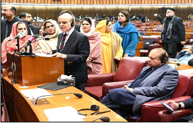
ISLAMABAD: Prime Minister Shahbaz Sharif address in the National Assembly after electing Prime Minister.

gaining 92 votes. "They put our leaders in jail, took our election symbol, rigged the elections, but we kept standing, and we will stand our ground," Omar Ayub Khan told parliament. Sharif, 72, first served as prime minister in 2022 at the head of a strikingly similar alliance which ousted