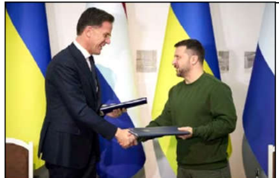
Ukraine's President Volodymyr Zelenskyy and Dutch Prime Minister Mark Rutte attend a ceremony of signing an agreement on security cooperation and long-term support between Ukraine and Netherlands, amid Russia's attack on Ukraine, in Kharkiv, Ukraine.

During his speech, Yoon said that Seoul would need international help for any prospect of unification with North Korea. "Unification is a challenging task that we cannot accomplish alone. The international community must pool its strength in a responsible manner," he said. Yoon's comments come after the North's leader Kim Jong Un in January called South Korea a "primary foe" and said unification was no longer possible.