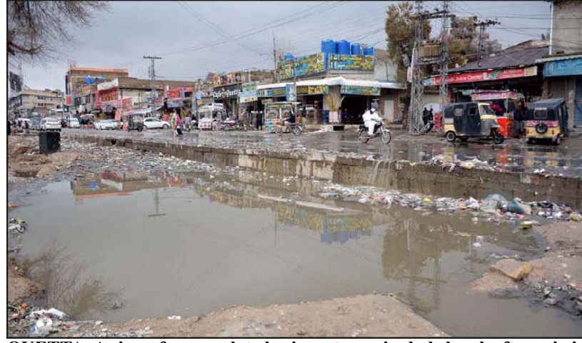
QUETTA: A view of accumulated rain water on imdad chowk after rain in Provincial Capital.