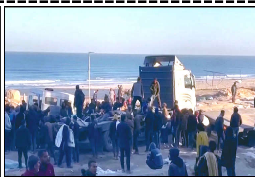
Palestinians transport casualties following Israeli fire on people waiting for aid in Gaza City.

Today, both Trump and incumbent President Joe Biden are due to pay dueling visits to the US-Mexico border Thursday as they try to win over voters on immigration.