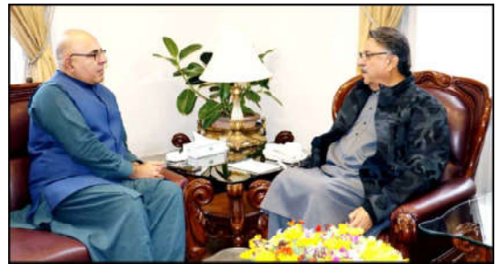
QUETTA: Caretaker Provincial Minister for Information Jan Achakzai meeting with Balochistan Governor Malik Abdul Wali Khan Kakar.

ISLAMABAD (APP): The elections would be held at time schedule given by Election Commission of Pakistan. "The caretaker government organized timely elections and today new assemblies have come into being in the country", Murtaza Solangi maintained. Democracy could not succeed without people's participation, Murtaza Solangi said and expressed the hope that the new government would meet the expectations of the people. He said as the Federal Minister for Parliamentary Affairs, it was an honour for him to participate in the meetings of the Parliament.