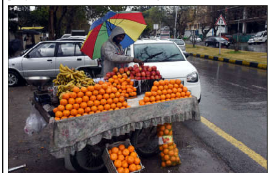
ISLAMABAD: A vendor hold umbrella as displaying fruits on his pushcart attraction for customers at a road during rain.

As a result, the Government of Pakistan is pleased to announce it has joined the other neighboring countries — the Kyrgyz Republic and the Republic of Tajikistan — in signing a Joint Declaration to thank the World Bank for its timely response in approving the "ring-fenced" resumption of construction in Afghanistan.