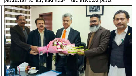
ISLAMABAD: A view of farewell ceremony organized at the Ministry of Parliamentary Affairs in honor of the Caretaker Minister for Information, Broadcasting and Parliamentary Affairs Murtaza Solangi.

They discussed about the matters about formation of government in Balochistan.