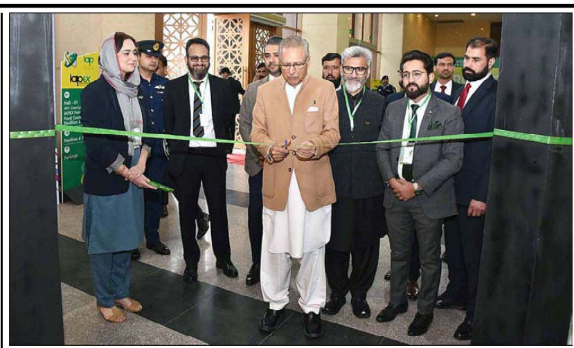
ISLAMABAD: President Dr. Arif Alvi inaugurating the building Materials Exhibition and Conference organizers by the Institute of Architects of Pakistan at Aiwan-e-Sadr.

Rafhan Maize Products witnessed a maximum increase of Rs 450.00 per share price, closing at Rs 8,850, whereas the runner-up was Mari Petroleum Company Limited with a Rs113.50 rise in its per share price to Rs2,462.05.