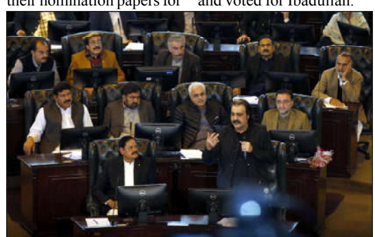
PESHAWAR: Ali Amin Gandapur speaks on the assembly floor after being elected as Chief Minister of Khyber Pakhtunkhwa, at KPK Assembly in Peshawar.

The speaker announced the results and declared that a total 108 members participated in the election of the Chief Minister. Ibadullah had the support of five members of the PPP, two of the PTIP and nine members of the PMLN, securing a total of sixteen votes. The number of members supported by PTI was 92, but Ali Amin Gandapur got 90 votes. In an unanticipated move, ANP member of assembly Arbab Usman participated in the voting process by refusing to accept the party president's decision and went to the lobby with the opposition and voted for Ibadullah.