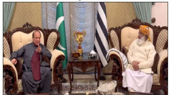
ISLAMABAD: PML-N Quaid Mian Muhammad Nawaz Sharif held a meeting with JUI-F Chief Maulana Fazl-ur-Rehman and discuss political situation of country.