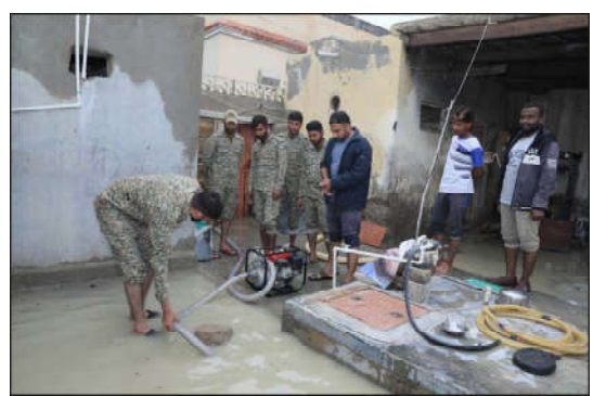
Pakistan Navy Workers during Rescue efforts at flood affected areas of Gwadar.