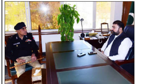
QUETTA: Inspector General Police Balochistan Abdul Khaliq Sheikh meeting with Balochistan Chief Minister Mir Sarfraz Ahmed Bugti.

Revealed in a report filed in the Delhi High Court, the IAF detailed findings from a Court of