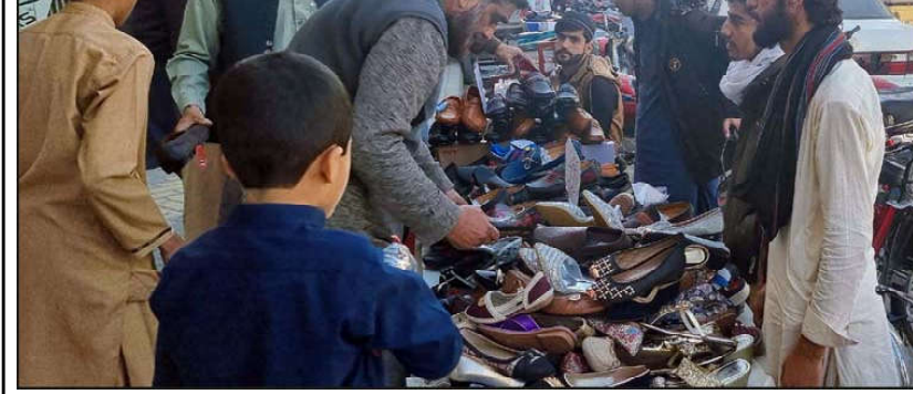
QUETTA: People are busy in Eid shopping ahead of Eid-ul-Fitar during the Holy Month of Ramadan-ul-Mubarak, in Quetta.