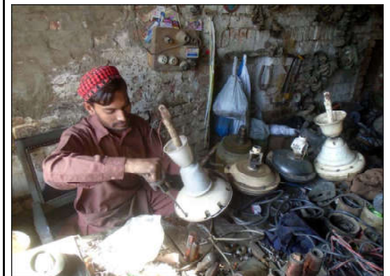
FAISALABAD: Workers cutting iron boilers on Maqbool Road, in the city.

Bilal Yasin said that providing all possible relief to the people was the first priority of the government.