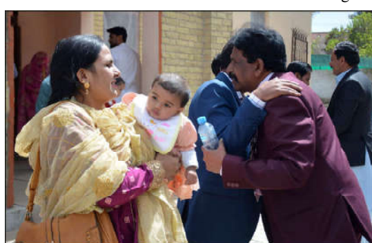
QUETTA: The Christian community member celebrated Easter with religious zest.

Meanwhile, the people exchanged greetings of Easter with each other.