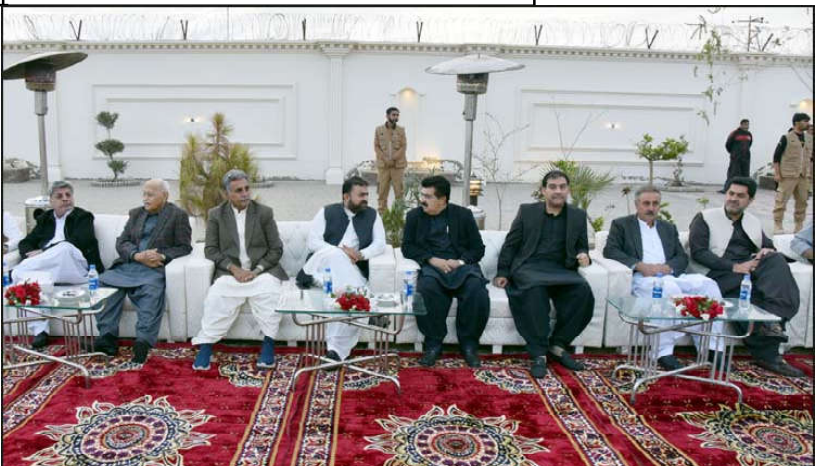
QUETTA: Balochistan Chief Minister Mir Sarfraz Ahmed Bugti, MPAs and others participating in the Iftaar Dinner hosted by former Chairman Senate and MPA Mir Muhammad Sadiq Sanjrani.

While we celebrate diversity of faiths as a source of strength and enrichment in our nation, let us join hands towards building a society that is tolerant and cohesive and together defeat the forces of discord that are trying to cause harm to the fabric of our society," PM Office Media Wing, in a press release, quoted the prime minister as saying.