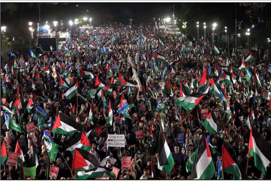
KARACHI: A large number of supporters of Jamat-e-Islami (JI) are gathered to attend rally against Israeli cruel and inhumane acts and express unity with the innocent people of Palestine, at Shahrah-e-Quaideen in Karachi.