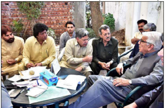
SIALKOT: Federal Defense Minister Khawaja Muhammad Asif is listening to the public's problems at his residence.

Ashrafi issued a resolute statement in response to the recent attack on Chinese guests in Besham, declaring that those responsible would face the full force of justice.