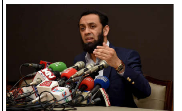
LAHORE: Minister for Information and Broadcasting Attaullah Tarar speaking at a press conference.

the people. "The Cabinet consist of experienced people, youths, seasoned politicians and technical