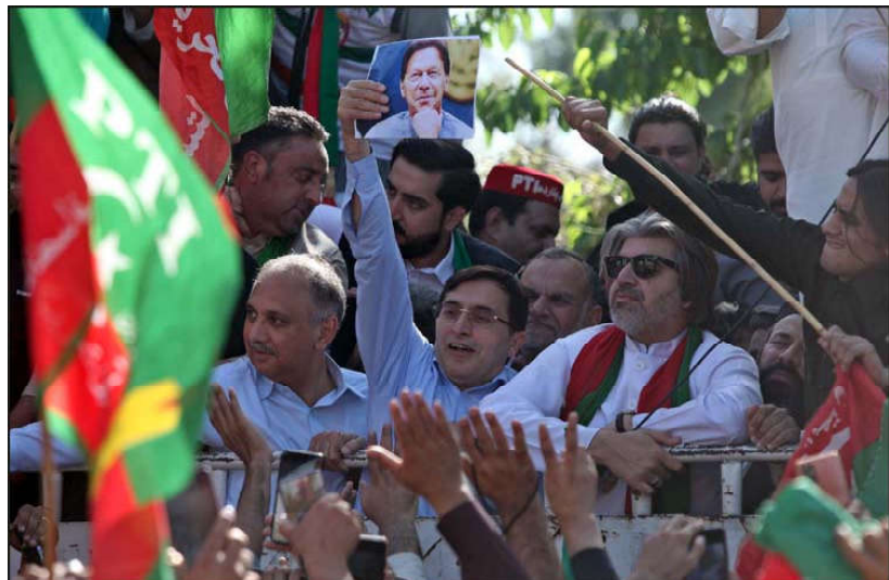
PESHAWAR: Activists of Tehreek-e-Insaf (PTI) are holding protest demonstration for release of Imran Khan, Former Prime Minister, at Peshawar press club.

He said that the BNP and its leadership has always voiced for the issues of the province including recovery of the missing persons and we are proud of Sardar Akhtar Mengal.