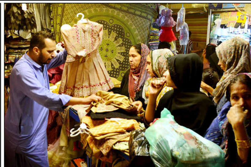
HYDERABAD: Women busy in Eid shopping at Resham Bazaar during upcoming Eid-ul-Fitr celebrations.

Meanwhile, the FBR had also cleared refunds amounting to Rs369 billion were as compared to Rs254 billion issued during the same period last year.