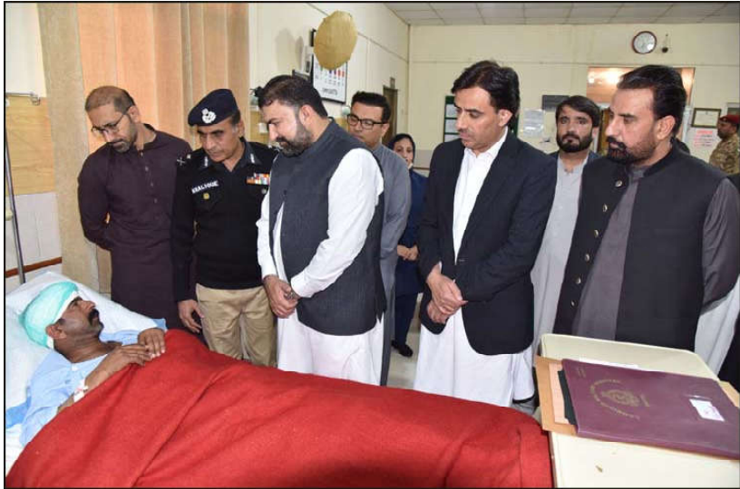
QUETTA: Balochistan Chief Minister Mir Sarfraz Ahmed Bugti enquiring about the health of Harnai blast victims.

Ph: 2841470/2841473 Vol: XIX No. 284, Ramzan 21, 1445 AH Monday April 01, 2024, Pages 04, Price Rs.15