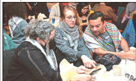
People look at election results at a monitoring centre set up in Dearborn by the Listen to Michigan watch party, a group which asked voters to vote 'uncommitted' instead of voting for President Joe Biden.

Biden's staunch support for Israel during its five-month war with Hamas, which has decimated Gaza, has sparked outrage and a well-organised backlash among progressive Democrats and Arab Americans, with Michigan as their epicentre.