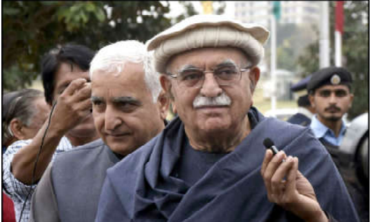
ISLAMABAD: Leader of Pashtunkhwa Milli Awami Party, Mahmood Khan Achakzai, arriving before the start of the inaugural session of the National Assembly, at the parliament house building in the Federal Capital.

central committee discussed the situation following recent elections in detail. He said that after discussion, it was decided that party would sit on opposition benches. He also said that as a mark of protest we also boycotted the assembly session and election proceedings for the speaker and deputy speaker. Dr. Abdul Malik Baloch said that we are democratic people and as such would continue our struggle in democratic manner.