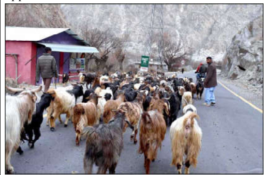
GILGIT: A shepherd guiding herd of goats heading towards grazing field near Nomal area.

The parties will evaluate potential opportunities in