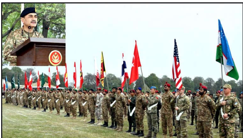
Chief of the Army Staff, General Syed Asim Munir addressing the closing ceremony of the Seventh Pakistan Army Team Spirit Exercise-2024 at Kharian.