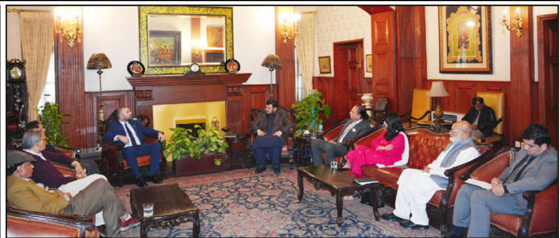
PESHAWAR: A delegation of Association of Small Medium Enterprises (BVMW) Germany meeting with Khyber Pakhtunkhwa Governor Haji Ghulam Ali.

He said that the surplus products of POF were sold in the civil market and the standards of POF products were not less than any international company.