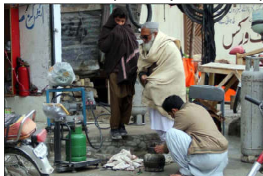
QUETTA: A man filling Liquefied Petroleum Gas (LPG) into cylinder at his shop in Quetta.

LAHORE (INP): Ameer Jamaat-e-Islami (JI), Sirajul Haq has expressed concerns over the future of democracy in the country has urged a national dialogue among political stakeholders to establish a transparent election mechanism. Addressing a press conference at Mansoorah on Thursday, he said the JI's Working Committee in its Wednesday meeting has unanimously deemed the Election 2024 as rigged and controversial, vowing to expose it democratically. Sirajul Haq had presided over the session of the JI's Majlis Aamal which discussed election and post-election's situation and future strategy. He said that the JI has already started efforts for holding of national dialogue to save the democracy and in this regard, it hosted a session of the observers and members of civil society.