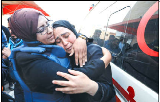
A member of the press consoles a woman outside Al-Aqsa hospital in Deir el-Balah.

Similar letters have also been presented to several other nations utilising US weaponry, as disclosed by a US official to Axios.