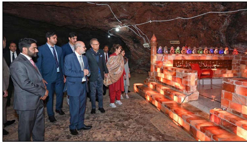
KHEWRA: President Dr Arif Alvi being briefed about salt mining during his visit to Khehra Salt Mine.