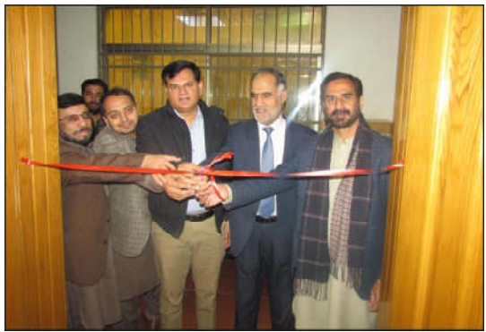
Training of Division and District Coordinators from Balochistan appointed for 7th Agricultural Census on 'Supervisor and Enumerators Management System held on Thursday.

ISLAMABAD (INP): The Election Commission of Pakistan (ECP) has appointed five Presiding officers to conduct election to the office of President of Pakistan, in Islamabad and four provincial capitals. According to Spokesperson of the ECP, these officers will receive nomination papers from candidates and chair meetings of the Parliament at the Parliament House, Islamabad, and the Provincial Assembly of the respective province during the scheduled polling for the Presidential Election. According to the notification, the Chief Justice of the Islamabad High Court will oversee the elections in the Senate and National Assembly in Islamabad. A Member of the Election Commission of Pakistan, Election Commissioner-I, will supervise polling in the Provincial Assembly of Punjab. The Chief Justice of the Sindh High Court will supervise the Presidential Elections in the Provincial Assembly of Sindh. Similarly, the Chief Justice of the Peshawar High Court will supervise the polls in the Provincial Assembly of Khyber Pakhtunkhwa.