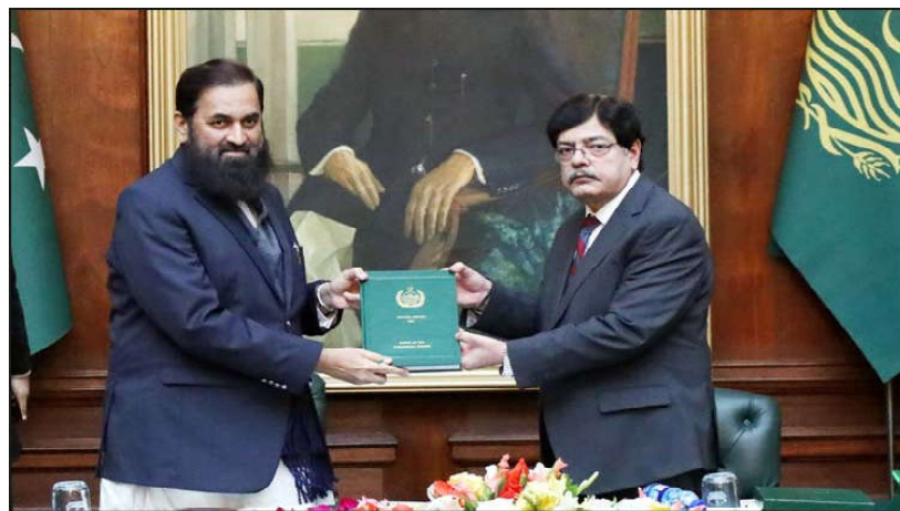
LAHORE: Ombudsman Punjab, Major (Rtd) Azam Suleman Khan presenting annual performance report of the Office to Governor Punjab Muhammad Balighur Rehman during a ceremony.

initiatives like complete digitalization of the Ombudsman Punjab office. He said that extending the offices of the Punjab Ombudsman to various districts and providing maximum relief to the people was commendable. Governor Punjab said that the decisions of the provincial ombudsman are written in Urdu which is easy for people to understand and they do not need to hire any lawyer for it. Governor Punjab further said,