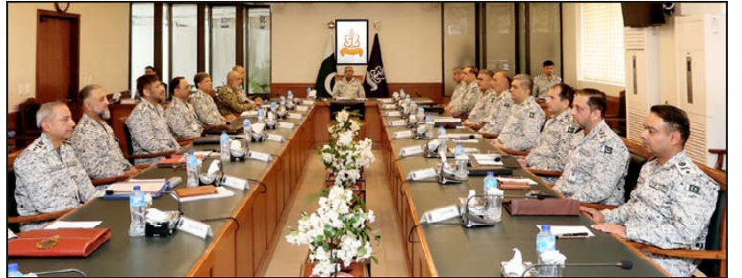
ISLAMABAD: Chief of the Naval Staff Admiral Naveed Ashraf chairing the Command and Staff Conference held at Naval Headquarters.

SPARK-2024 followed by Live Weapon Firing of Surface to Air Missile FM-90B reaffirming operational preparedness of Pakistan Navy to meet all challenges while safeguarding the maritime frontiers of Pakistan. He specifically appreciated the prolonged deployment of Naval assets in North Arabian Sea, Gulf of Aden and Bay of Bengal during the exercise. Command & Staff Conference is the apex decision making body of Pakistan Navy in which Chief of the Naval Staff along with all Principal Staff Officers and Field Commanders undertake review of Pakistan Navy's Policies and Plans.