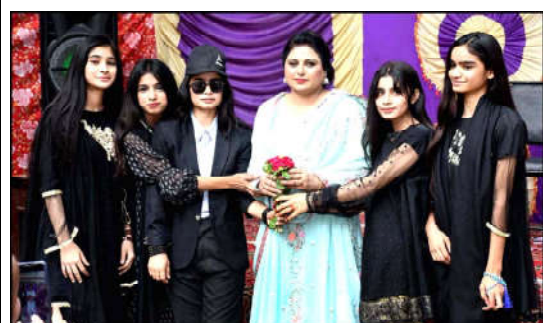
LARKANA: Student presents a bouquet to her teacher during a function at Govt little folks Girls High School Jinnah Bagh.