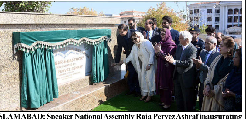
ISLAMABAD: Speaker National Assembly Raja Pervez Ashraf inaugurating Yadgar-e-Dastoor and Bagh-e-Dastoor infront of Parliament House.

This revelation comes on the heels of another audio leak featuring MQM-P leader Mustafa Kamal where discussions about a potential coalition government with PML-N were detailed. Kamal described an uncooperative attitude from PML-N during negotiations, alleging that PPP accused MQM-P of a completely fraudulent mandate