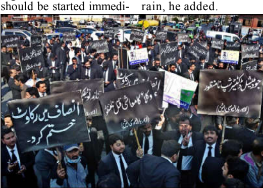
LAHORE: Members of Lahore Bar Association are holding protest demonstration for acceptance of their demands, held at GPO Chowk in Lahore.