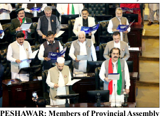
PESHAWAR: Members of Provincial Assembly (MPAs) are taking oath during the first session of the Provincial Assembly, at Khyber Pakhtunkhwa Assembly in Peshawar

measures, workers of political parties managed to enter the assembly hall.