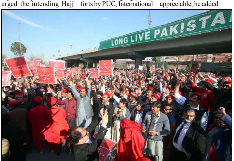
PESHAWAR: Activists of Awami National Party (ANP) are holding protest demonstration against alleged rigging in General Election 2024, outside Khyber Pakhtunkhwa Assembly in Peshawar.

He appreciated that all the arrangements made under the Government Hajj Scheme were in accordance with the Saudi instructions, while the private Hajj groups were also following suit. The cooperation of the Saudi Ministry of Hajj and Umrah, and the Saudi Embassy in Pakistan was also appreciable, he added.