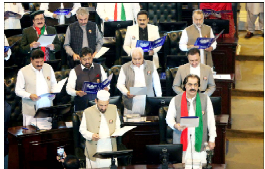
PESHAWAR: Members of Provincial Assembly (MPAs) are taking oath during the first session of the Provincial Assembly, at Khyber Pakhtunkhwa Assembly in Peshawar

PESHAWAR (APP): Newly elected 116 members of Khyber Pakhtunkhwa Assembly on Wednesday took oath amid uproar and anti party slogans by members. The proceeding of the house was chaired by Speaker Khyber Pakhtunkhwa Assembly Mushtaq Ghani with recitation from the holy Quran. Before taking the oath, the newly elected members of the provincial assembly chanted slogans against each other and threw shoes and pitchers on opposition benches. The Speaker took notice of the slogans of PTI workers in the house and directed them to remain silent. The house offered Fataha for father of Ali Amin Gandapur and other martyrs of security forces. Special arrangements including multimedia screens were installed inside and outside of the assembly hall for special guests and party members. The internet service was closed in the assembly premises due to security reasons. Despite strict security measures, workers of political parties managed to enter the assembly hall.