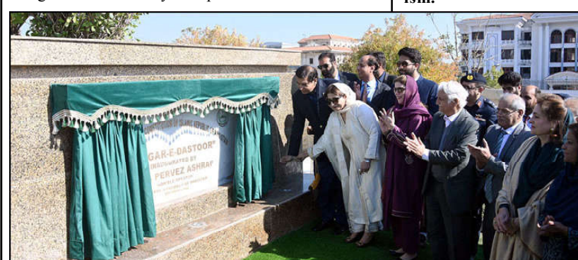
ISLAMABAD: Speaker National Assembly Raja Pervez Ashraf inaugurating Yadgar-e-Dastoor and Bagh-e-Dastoor in front of Parliament House.

Independent Report RAWALPINDI: Security forces conducted an intelligence based operation (IBO) in North Waziristan District, on reported presence of terrorists. According to ISPR, during the conduct of operation, intense fire exchange took place between troops and the terrorists, as a result of which six terrorists were killed, while one soldier also got injured. Weapons, ammunition and explosives were also recovered from the killed terrorists, who remained actively involved in numerous terrorist activities including target killing as well as extortion & abduction of innocent civilians.