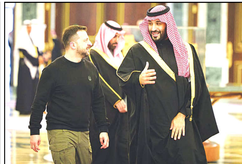
Ukrainian President Volodymyr Zelensky speaks to Saudi Crown Prince Mohammed bin Salman during a visit to Riyadh.

nancial instability. "The G7 should work together to explore a number of approaches: seizing the assets themselves, using them as collateral to borrow from global markets," she said. G7 officials say the group is due to meet on the sidelines of the Sao Paulo gathering to discuss support for Ukraine, as its grueling fight against Russia enters its third year. Ukraine has warned it desperately needs more military and financial assistance, as a fresh $60 billion US package remains stalled in Congress. That has cast a spotlight on the estimated $397 billion in Russian assets frozen by the West, ranging from central bank assets to yachts.