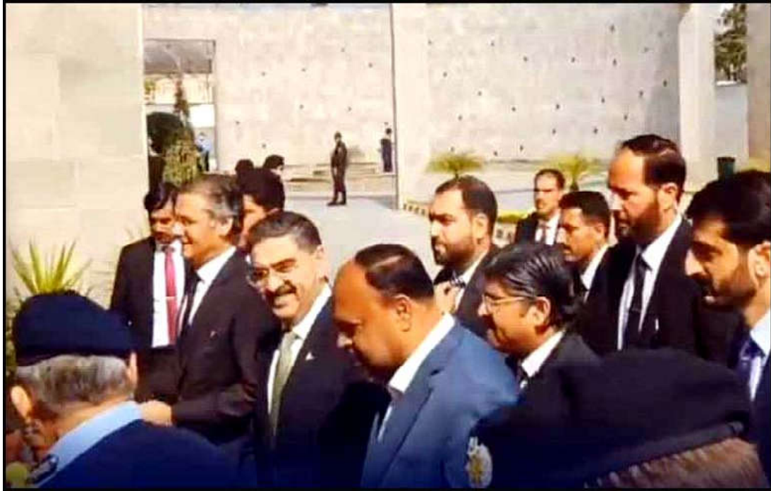
ISLAMABAD: Caretaker Prime Minister (PM) Anwar ul Haq Kakar appeared in Islamabad High Court (IHC) in missing Baloch students case being summoned by the court.

Vol. XIV No. 49 Reg. mails-B / ID-445 Thursday February 29, 2024, Shaban 18, 1445 A.H. Ph: 2158688, 2158997 Pages 4: Rs. 12