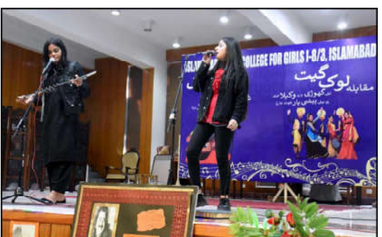
ISLAMABAD: Students of Model College performing in a competition held in connection with Students week celebration.

ISLAMABAD (APP): The Islamabad Food Authority (IFA) has instructed all businesses dealing with food within the Islamabad Capital Territory to obtain a license to ensure the safety and cleanliness of food consumed by citizens. Under the guidance of the Deputy Commissioner of Operations Food, this directive aimed to enhance public health standards and guarantee the quality of edibles circulating in the region, said the spokesman of ICT, Dr. Abdullah Tabassum. The issuance of food licenses has commenced to streamline compliance with the new regulation. Any entity involved in food-related activities, ranging from production to distribution, must obtain this essential license to operate legally. Failure to comply could result in penalties or cessation of operations, he added. To facilitate the process, applicants need to visit the IFA office located at Multipurpose Sports Center, F6 Markaz, Islamabad.