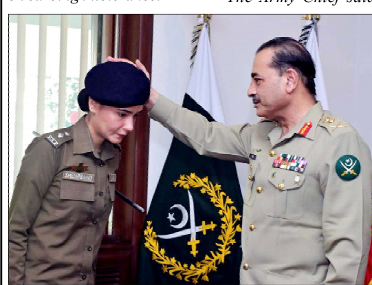
He further emphasized upon the rule of law and advised against taking law in one's hands when legal avenues are available for women as an invaluable part of Pakistan's society and their respect is enshrined in our religion as well as our ethos.