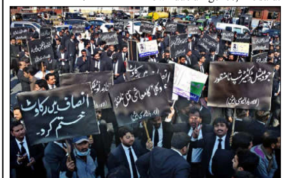
LAHORE: Members of Lahore Bar Association are holding protest demonstration for acceptance of their demands, held at GPO Chowk in Lahore.

ISLAMABAD (INP): The Pakistan Tehreek-e-Insaf (PTI) has asked the International Monetary Fund to factor in the country's political stability in any further bailout talks, two people familiar with the matter said on Wednesday. The PTI has sent a letter to the IMF detailing its position, two senior sources in the party said, adding more details would be made public in due course. The IMF has yet to receive the letter, the lender