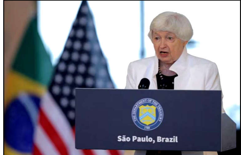
U.S. Treasury Secretary Janet Yellen speaks during a press conference to highlight her key priorities for the G20 Finance Ministers and Central Bank Governors meetings, in Sao Paulo, Brazil.

(missile) weapons were prepared to launch towards... the Red Sea," CENTCOM said, adding that the drone was already airborne. Those strikes, made between the hours of 4:45 pm and 11:45 pm Sanaa time (1345 GMT to 2045 GMT), were done "in self-defense", it said. "CENTCOM determined that they presented an imminent threat to merchant vessels and to the US Navy ships in the region." Over the weekend, US and British forces carried out strikes against 18 Houthi targets across eight locations in Yemen, including weapons storage facilities, attack drones, air defense systems, radars and a helicopter, according to a joint statement.