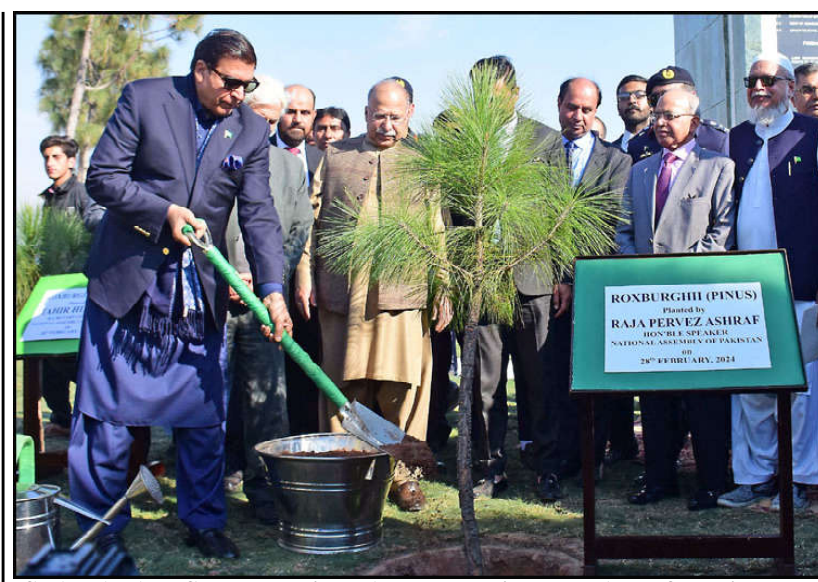
ISLAMABAD: Speaker National Assembly Raja Pervez Ashraf planting a sapling of Roxburghii (Pinus) after the inauguration ceremony of Yadgar-e-Dastoor monument on a green belt along Constitution Avenue in the Federal Capital.