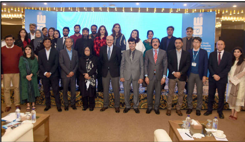
ISLAMABAD: Participants posing for a group photograph after seminar titled "Determining the Health Cost of Inadequate Water, Sanitation and Hygiene in Pakistan, at a local hotel in the Federal Capital.