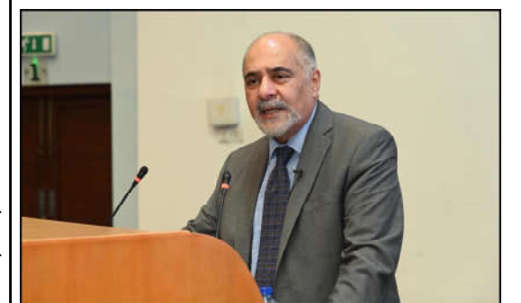
ISLAMABAD: Chairman IPO-Pakistan addressing the Seminar on Intellectual Property as Empowerment through knowledge and wealth creation at NUST University.

ISLAMABAD (APP): Chairman IPO-Pakistan addressing the Seminar on Intellectual Property as Empowerment through knowledge and wealth creation at NUST University.