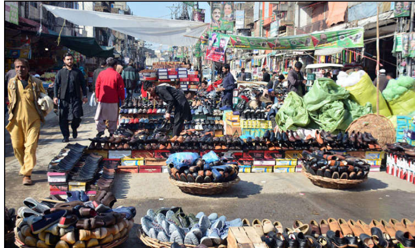
RAWALPINDI: A vendor is displayed shoes attraction for customers alongside a road at Raja bazaar, in the city.