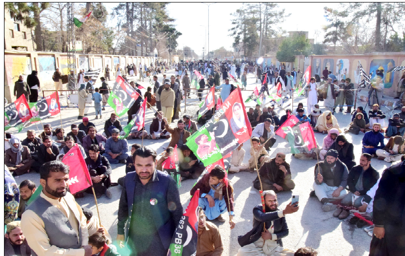
QUETTA: Activists of different political parties staging sit-in in front of DC Office against alleged rigging in elections