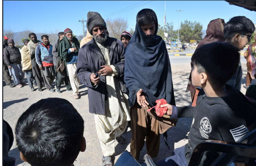
ISLAMABAD: A large number of people in queue to get free food at G-11.