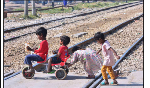
HYDERABAD: Children enjoy riding toy bicycle while crossing railway track near railway station.

declared Khawaja Asif winner. The results of form 45 are held by us. The petitioner has requested the court to order for releasing the result as per form 45. The court should order EC to stop issuing the result. The court should order for recounting besides nullifying form 47 result. It is pertinent to mention here Khawaja Asif had defeated Reehana Dar in big electoral encounter in NA-71 Sialkot.