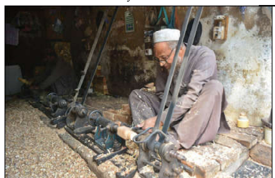
HYDERABAD: A carpenter busy in making part of a traditional bed (charpai) at his workplace

The farmers should also use approved varieties of cotton including FH-333, CKC-6, CKC-3 and Hataf-3 as these varieties have sufficient resistance against seasonal diseases and pest attack. He said that the farmers should ensure the number of cotton plants up to 12,000 per acre to get bumper yield. The agriculture department has activated its field staff to visit farms and guide the growers about cotton cultivation by using latest techniques, he added.