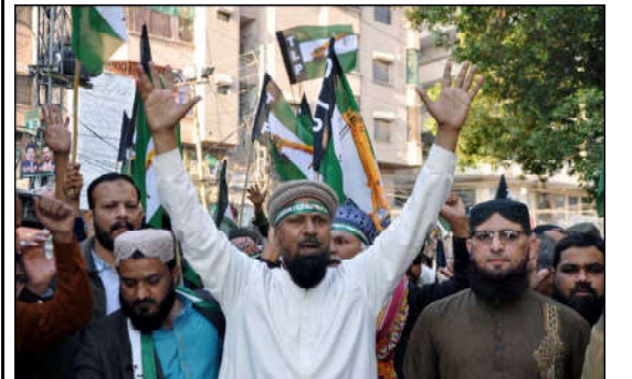
HYDERABAD: Activists of Tehreek-e-Labbaik Pakistan (TLP) are holding protest demonstration against alleged rigging in General Election 2024, outside District Election Commission Office.