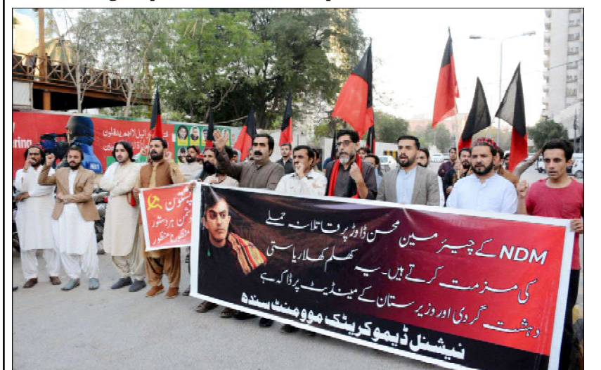
KARACHI: Members of National Democratic Movement are holding protest against attacked on NDM Chairman Moshin Dawar, held at Karachi press club