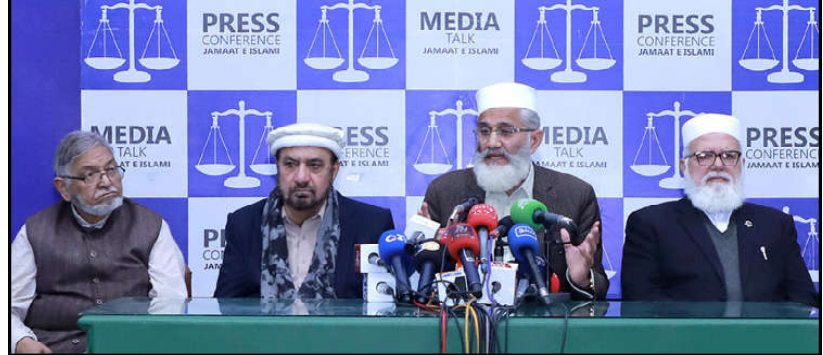
LAHORE: Amir Jamaat-e-Islami Sirajul Haq addressing a Press conference