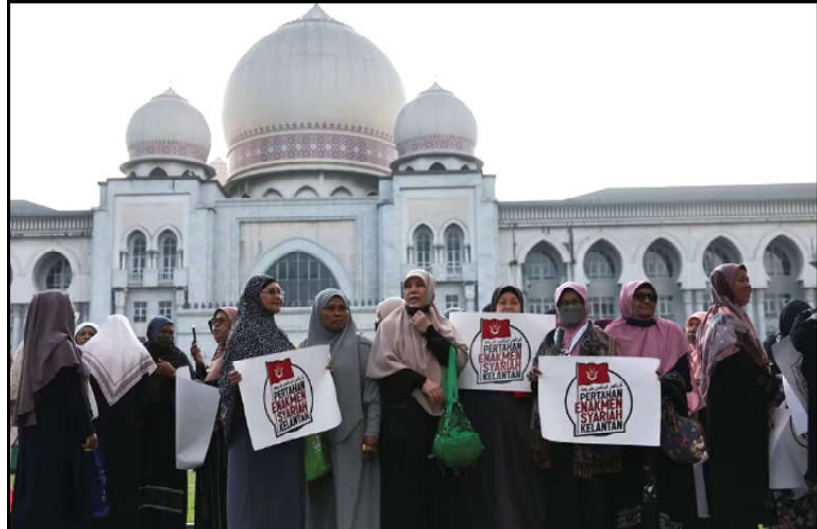
Muslim women hold placards as they stand in protest outside the Palace of Justice on the day the country's federal court delivers verdict in a constitutional case challenging the legality of some Islamic laws in Kelantan state, in Putrajaya, Malaysia.

UKRAINE (Internews): Democrats have promised a vote on Thursday on a bill to give military aid to Ukraine after Senate Republicans blocked a border security bill that included the funding. Tucker Carlson has said his interview with Russian President Vladimir Putin will be broadcast on Thursday night. Israeli Prime Minister Benjamin Netanyahu has rejected Hamas' terms for a ceasefire as "delusional".