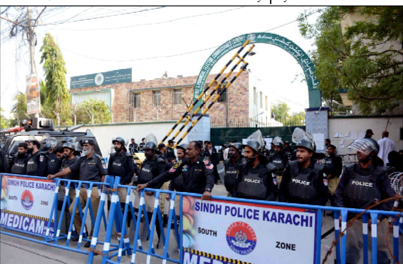
KARACHI: Police officials are standing high alert to avoid untoward incident during the protest demonstration of Jamat-e-Islami (JI) and Tehreek-e-Insaf (PTI) against alleged rigging in General Election 2024, outside Provincial Election Commission Office in Karachi