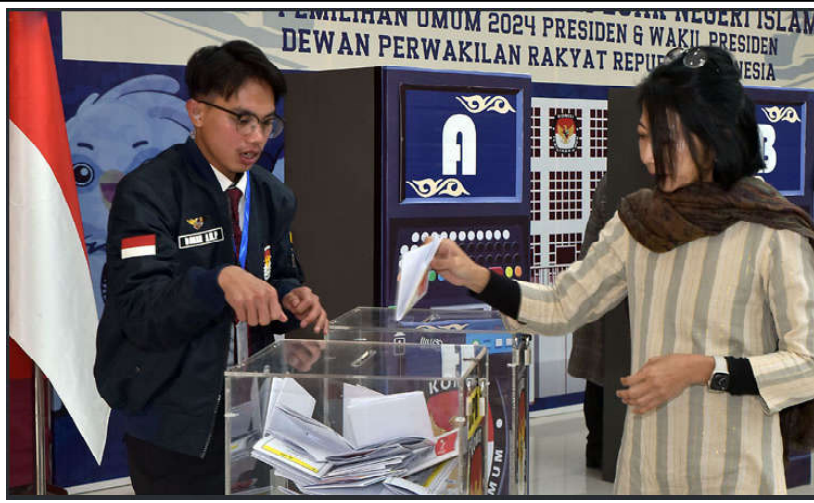
ISLAMABAD: Indonesian citizens and their families residing in Pakistan use their right to vote for "Indonesian Elections" at the Embassy of the Republic of Indonesia.