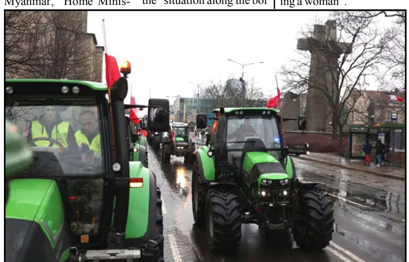
Polish farmers slow down traffic on a road with tractors during a protest over price pressures, taxes and green regulation, grievances shared by farmers across Europe, in Poznan, Poland.

activity began around 5:30 a.m. and the with the eruption itself starting 30 minutes later, it added. A plume of smoke rose 3 km into the air, according to the Met Office. Still, Reykjavik's international airport, around 20 km to the north west of the fissure, was operating as normal, airport operator Isavia said. The nearby Blue Lagoon - a luxury geothermal spa - closed its doors on Thursday due to the volcanic outbreak. The previous eruption in the area started on Jan. 14 and lasted roughly two days, with lava flows reaching the outskirts of the Grindavik fishing town, whose nearly 4,000 inhabitants had been evacuated, setting some houses alight. Thursday's eruption took place some way from Grindavik and was unlikely to pose a direct threat to the town, Icelandic geophysicist Ari Trausti Gudmundsson said.