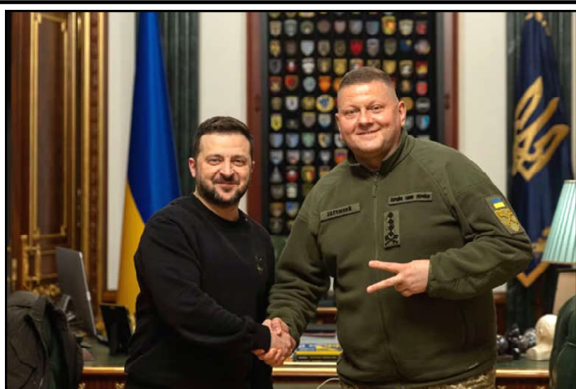
Ukraine's President Volodymyr Zelenskyy and Commander in Chief of the Ukrainian Armed Forces Valerii Zaluzhnyi shake hands and pose for a picture during their meeting, amid Russia's attack on Ukraine, in Kyiv, Ukraine.

LONDON (Internews): British Prime Minister Rishi Sunak declined to apologise for a gender identity jibe at opposition leader Keir Starmer, which drew criticism in the light of the widely reported recent murder of a transgender girl. Sunak's Conservatives, trailing badly in opinion polls ahead of an election this year, have increasingly sought to weaponise identity politics and cast the Labour Party as excessively liberal or "woke". On Wednesday, Sunak said Labour's leader had changed course on "defining a woman".