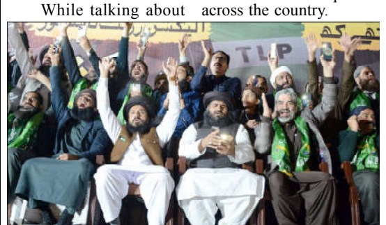
LAHORE: Chief of Tehreek-e-Labaik Pakistan Hafiz Saad Rizvi leading a sit-in against elections results at Mall Road