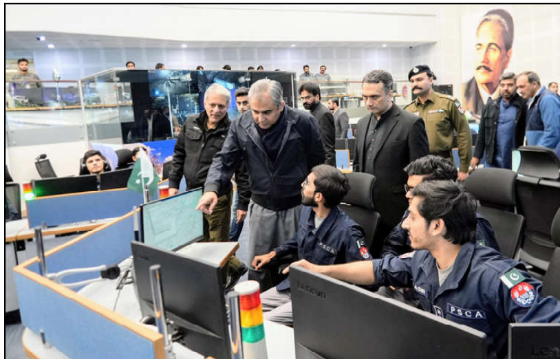
LAHORE: Caretaker Chief Minister Punjab Mohsin Raza Naqvi during his visit to Anti-graded Command, Control and Communication Centre setup in Punjab Safe Cities Authority.

The police, administration and the law enforcement agencies jointly maintained the law and order in the province, he mentioned. "Excellent security arrangements in every city of Punjab including Lahore had been made," he added. The IG Police, Secretary Home, CCPO Lahore, MD PSCA and officials concerned were also present. Meanwhile, Punjab Caretaker Chief Minister Mohsin Naqvi inaugurated the state-of-the-art Police Khidmat Markaz 'Abshar' at Shadman (Jail Road) here on Saturday. He visited the Khidmat Markaz and undertook a test drive by sitting in the driving simulator. He inspected the counters being established for the facilitation of the general public.