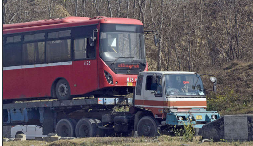
ISLAMABAD: A heavy trailer is carrying an out of order Metro Bus on his way at Srinagar Highway in the Federal Capital.

It has been said in the objection that decision has not been made on the application given to ROs as yet and they can come to high court direct. No written evidence is available regarding allegations leveled by the petitioners.