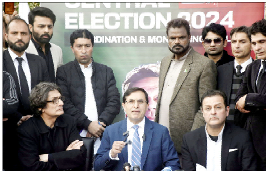
ISLAMABAD: Chairman of Pakistan Tehreek-e-Insaf (PTI) Gohar Khan addressing a press conference at PTI central secretariat