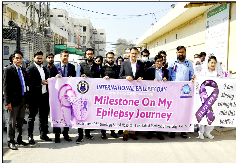
FAISALABAD: Participants hold a banner during a walk on the eve of International Epilepsy Day, at Allied Hospital in the city

Continued from page 1 Quaid (PML-Q) 7, and PML-Z 1. For the Sindh Assembly, PPP secured 84 seats, independent candidates 13, MQM-P 28, GDA 2, and Jamaat-e-Islami 2, out of the total 129 constituencies’ results. In Khyber Pakhtunkhwa, independent candidates clinched 90 provincial assembly seats, PML-N 5, PPP 4, JUI 7, JI 3, Awami National Party (ANP) and PTIP one each, out of 112 seats. In Balochistan, PML-N secured 9 seats, PPP 11, JUI 9, independent candidates 6, JI 1, Awami National Party 2, Balochistan Awami Party (BAP) 4, and one each by Balochistan National Party-Awami and National Party (NP), as per the results announced for 48 seats so far. According to the ECP, over 128 million registered voters were scheduled to exercise their democratic right by casting votes for candidates participating in elections for the national and provincial legislatures. The polling was held for 265 seats of the National Assembly and 590 seats of provincial assemblies. Voting took place on 51 seats of the Balochistan Assembly, 128 out of 130 seats of the Khyber Pakhtunkhwa Assembly, 296 out of 297 seats of the Punjab Assembly, and 130 seats of the Sindh Assembly. Polling was held in 855