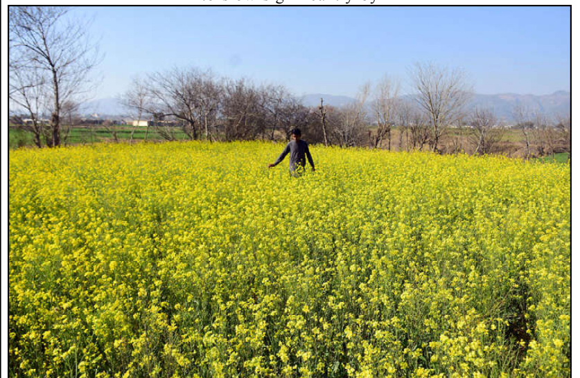
ISLAMABAD: A man is walks in mustard field at Golra rea.

into generating images as well as texts in answers to simple prompts, basing themselves on data trawled from the internet. Crucially, Gemini will be available through an easy-to-see link on the company's Google app on iPhones, signaling that the AI chatbot is becoming an integral part of its consumer experience on par with search. Google also said it was releasing Gemini Ultra 1.0, its most powerful generative AI model yet, which will be available as an advanced chatbot for $20 a month in 150 countries — but only in English.