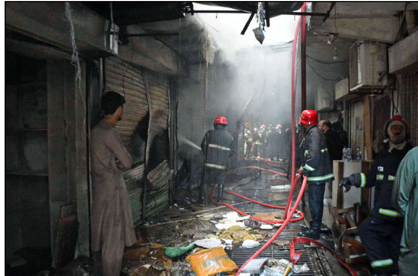
RAWALPINDI: Firefighters douse the blaze at Raja bazaar Mughal Sarai Market in the city, A blaze erupted on the third floor of the Rajabazaar Mughal Sarai Market in Rawalpindi, causing damage to around 25 shops.