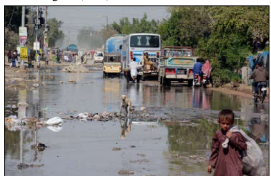
KARACHI: Inundated road by overflowing sewerage water, creating problems for residents and commuters, showing negligence of concerned authorities, at Korangi S.M Muneer road.