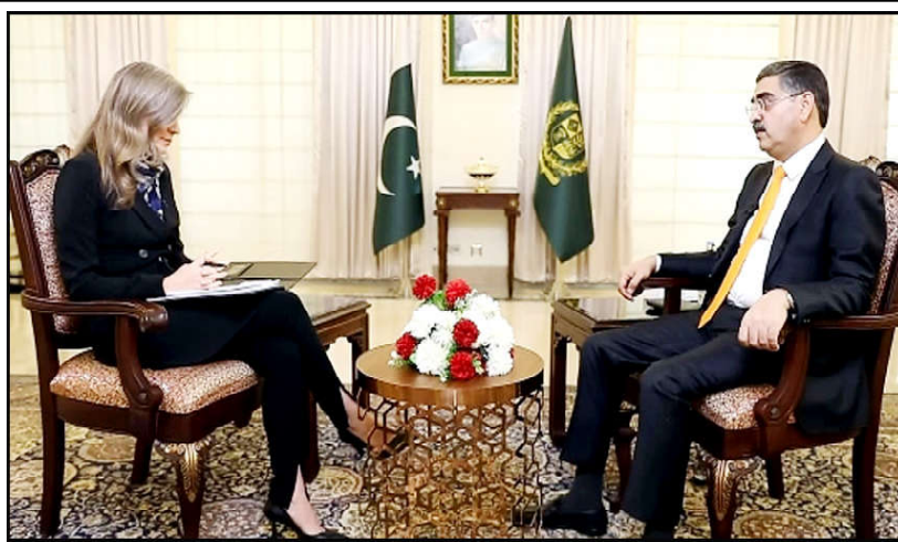
ISLAMABAD: Caretaker Prime Minister Anwaar-ul-Haq Kakar giving interview to Turkish broadcaster TRT.

As the people of Pakistan have reposed their combined trust in the Constitution of Pakistan, it is now incumbent upon all political parties to reciprocate the same with political maturity and unity. As we move forward from this national milestone we must reflect on where the country stands today and where our rightful place should be in the comity of nations, he added.