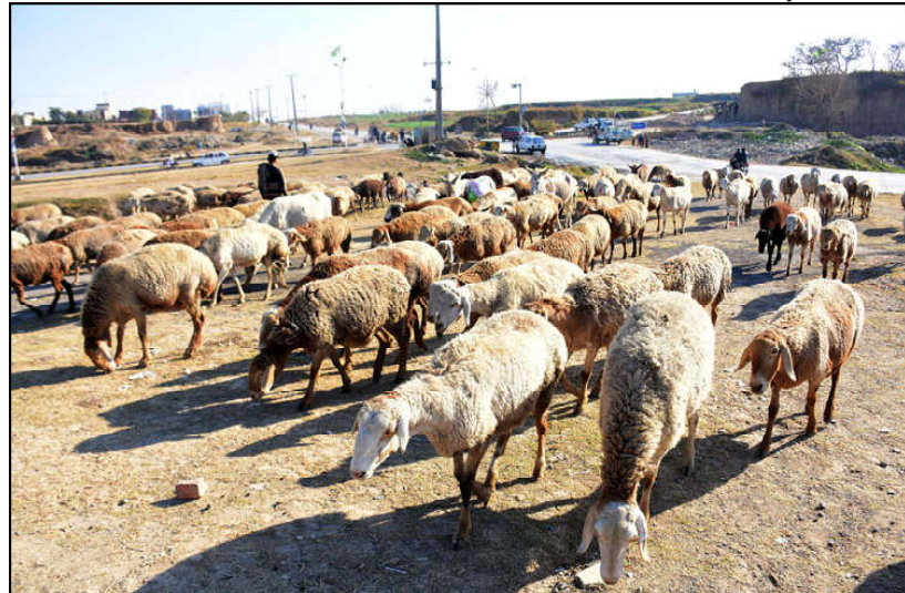
ISLAMABAD: A vendor on his way while displaying a herd of sheep to attract the customers in the Federal Capital.

FAISALABAD (APP): A membership renewal campaign of the Faisalabad Chamber of Commerce & Industry (FCCI) for the year 2024-25 has started which would continue till March 31. An FCCI spokesman said here on Saturday that the members have been requested to contact the FCCI.