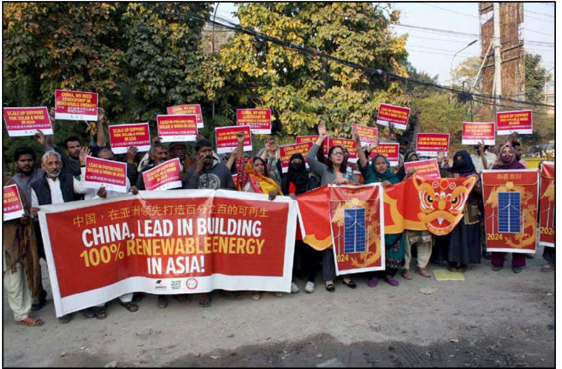
LAHORE: Members of Kissan Rabita Committee are holding protest demonstration for acceptance of their demands, held at Lahore press club.

integrated transport system and excellent logistics infrastructure. "Despite economic disruptions in the Arabian Gulf, the logistics sector in the UAE continued to occupy the fast lane in recent years. Though the logistics sector outperforms other major industries, it is now a crucial enabler in the country's economic diversification efforts," industry analysts said. Agility survey respondents highlighted the UAE and Saudi Arabia as leaders among the GCC countries in economic diversification.