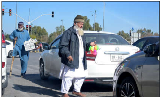
ISLAMABAD: An aged man is selling plastic toys on a busy road.

Efforts are ongoing to ensure the safety of residents and businesses in the vicinity, as well as to mitigate any potential risks associated with the aftermath of the incident.