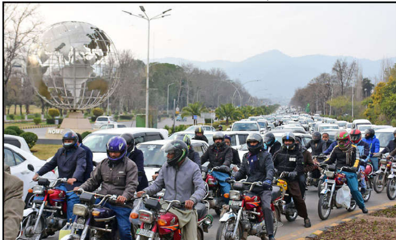
ISLAMABAD: A view of traffic stalled at the Constitution Avenue due to VVIP movement during PSL cricketer arriving at a local hotel in the Federal Capital.