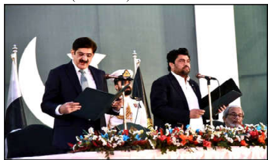
KARACHI: Governor Sindh, Kamran Khan Tessori administering the oath to the Newly-elected Chief Minister Sindh, Syed Murad Ali Shah.