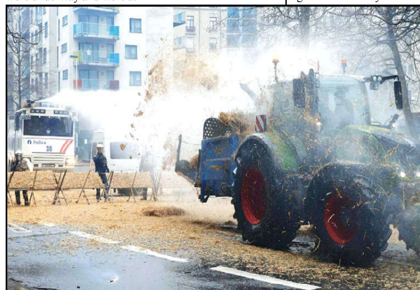
BRUSSELS: A tractor discharges hay onto police officers during a protest called by farmers' organisations against the European Union's agricultural policies.