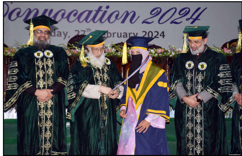
ISLAMABAD: Vice Chancellor ISRA University giving gold medal to a student during 5th Convocation 2024 of ISRA University, in the Federal Capital.

He said that PTI's actions have led to their own downfall, as according to the Constitution and Law, holding intra-party elections could have avoided in this situation.