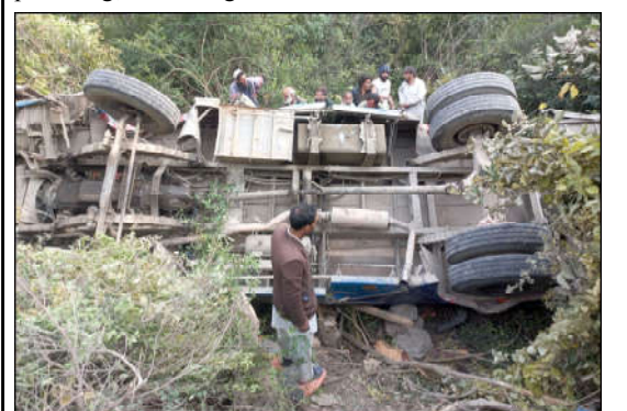
HARIPUR: People rescue victims of a passenger bus accident at a road, as a passenger bus fell into a ravine in Sarbrot area of Haripur, more than 12 people died and 15 people were injured.

storytelling. Moreover, PFA will also target school-going children for their medical screening and nutrition training. He said that the teams will conduct medical tests of children and employees regarding body mass index, weight, skeletal muscle mass and height free of cost. He further said teachers and parents will also be trained to eat healthy and nutritious food daily for the good health of children. Muhammad Asim said that promoting a healthy lifestyle is the top priority of the Punjab Food Authority. He said that PFA will ensure the availability of nutritious food everywhere from street food to school canteens for children. "If today's children are healthy, tomorrow's future will be bright," he said.