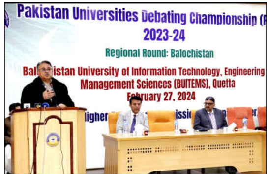
QUETTA: Governor Balochistan Malik Abdul Wali Khan Kakar addressing participants of a ceremony of Pakistan Universities Debating Championship 2023-24 organized by Higher Education Commission at BUITEMS