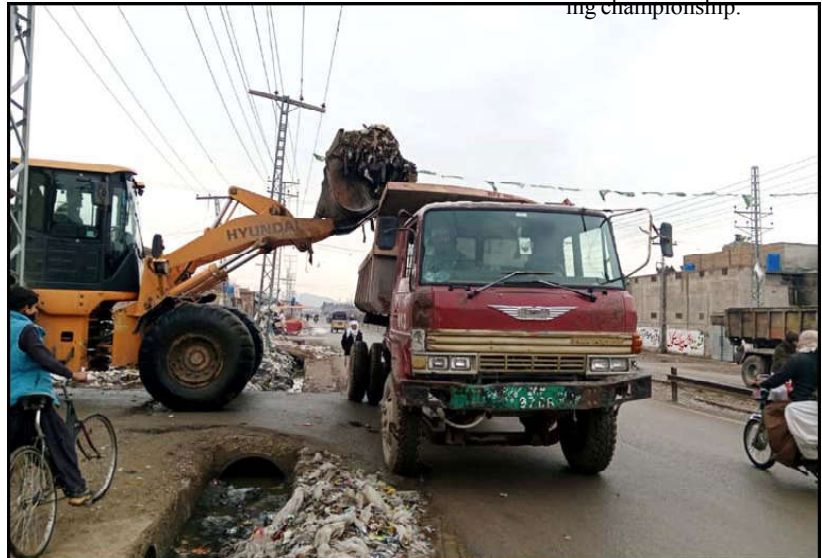
QUETTA: Workers of Quetta Metropolitan Corporation (QMC) are busy in picking up garbage with heavy machinery during the rains of winter season, in Quetta.