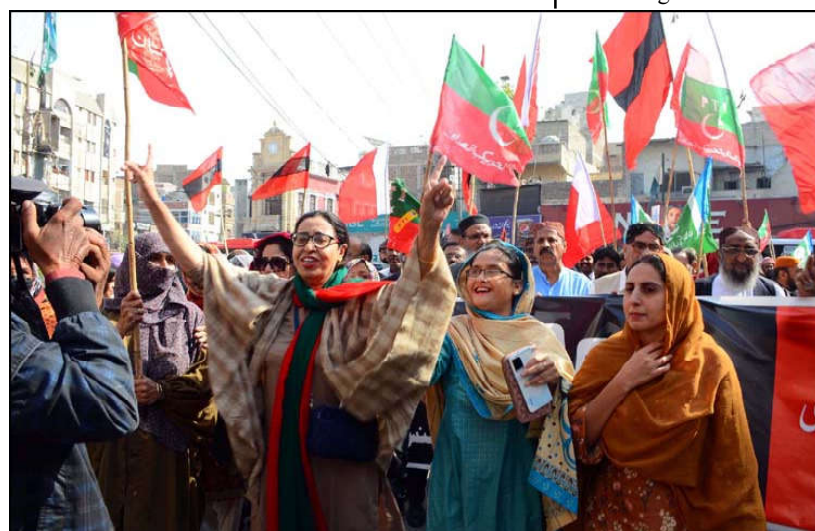
HYDERABAD: Activists of Tehreek-e-Insaf (PTI) are holding protest demonstration against alleged rigging in General Election 2024, at Hyderabad press club.

RAWALPINDI (APP): Anti-Narcotics Force (ANF) while conducting seven operations across the country managed to recover over one ton drugs and arrested nine accused, said an ANF Headquarters spokesman here on Tuesday. He informed that 1 kg Ice drug and 766 grams heroin were recovered from the possession of a passenger going to Bahrain at Faisalabad Airport. 969 grams Ice was recovered from a passenger going to Doha at Peshawar Airport. In the third operation, 192 kg hashish was recovered from an accused netted near Burhan Interchange.