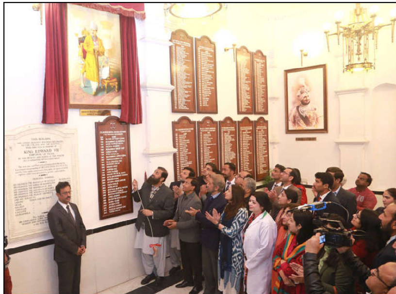
LAHORE: Governor Punjab Muhammad Balighur Rahman unveiling the portrait of Nawab Sir Sadiq Muhammad Abbasi, Nawab of Bahawalpur, in recognition of his services at King Edward Medical University.