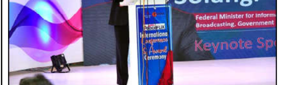
He was addressing the Peace-FLIX International Conference in Islamabad Tuesday.