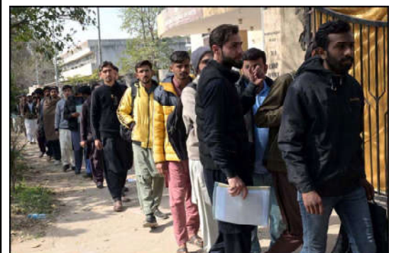
ISLAMABAD: A large number of people submitting visa forms for Korea at Manpower office.