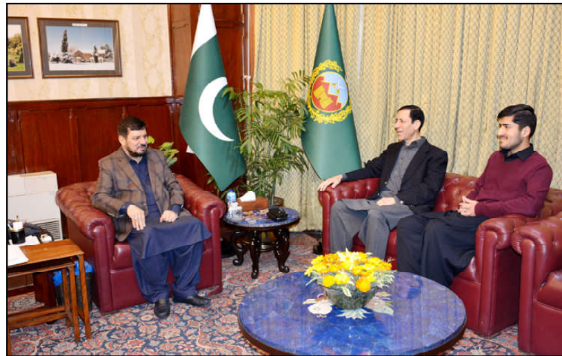
PESHAWAR: Caretaker Chief Minister Khyber Pakhtunkhwa Justice (Retd) Syed Arshad Hussain during a farewell meeting with Khyber Pakhtunkhwa Governor Haji Ghulam Ali.