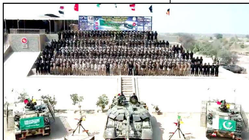
On job training of Royal Saudi Land Forces with Pakistan Army concludes in Multan.

The Chief Minister said that necessary directives have been issued to the district administration to provide clean drinking water on emergent basis.