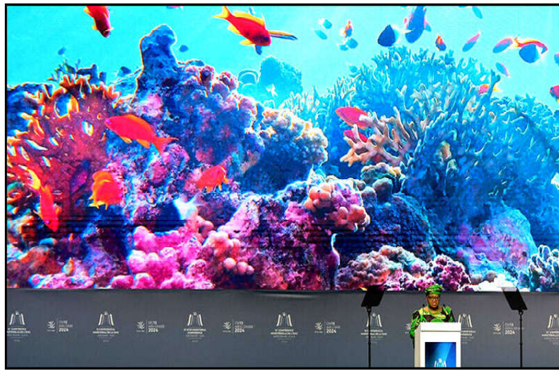
Director general of the World Trade Organization (WTO) Ngozi Okonjo-Iweala addresses delegates during a session on fisheries subsidies during the 13th WTO Ministerial Conference in Abu Dhabi.

"The unfolding situation after October 7 proves once again that, without addressing the root cause of the Israeli-Palestinian conflict, there can be no peace in the region," he said, describing the occupation of Palestinian territories as "the real obstacle to peace" and urging the judges to declare it illegal. Israel, which is not taking part in the hearings, has said the court's involvement could be harmful to achieving a negotiated settlement, calling the questions posed to the court prejudicial. Palestinian factions have also come under international pressure to end their own divisions over their response to Israel's occupation, the war in Gaza and what political system might follow it. Earlier on Monday, the Arab League's secretary general Ahmed Aboul Gheit described the occupation as "an affront to international justice" in a statement read out by a representative. The League called upon the ICJ, also known as the World Court, to "confirm the illegality of this occupation and unambiguously rule on the legal consequences for all parties, especially those who turn a blind eye, facilitate, assist, or participate in any way in perpetuating this illegal situation". Last week, Palestinian representatives asked the judges to declare Israel's occupation of their territory illegal and said the court's opinion could help reach a two-state solution to decades of Israeli-Palestinian conflict that has now devastated Gaza.