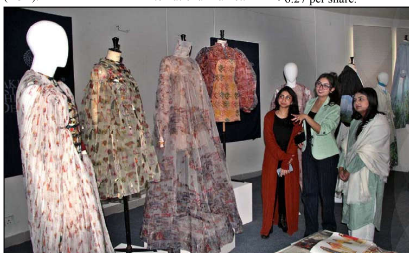
LAHORE: Visitors take keen interest at stalls during Clothes Exhibition in connection of the 1st Business Plan Competition 2024 organized by Pakistan Institute of Fashion and Design, held at Johar Town in Lahore.