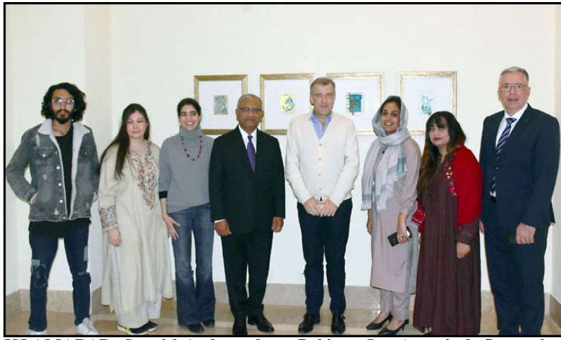
ISLAMABAD: Spanish Ambassador to Pakistan Jose Antonio de Ory posing for a group photograph along with artists during different artists painting exhibition titled "Chaharbagh" at a local hotel in the Federal Capital.

In the United States, we follow the widely used "3P" paradigm – prosecution, protection, and prevention – and I am glad to see that it is universalized here as well – to combat human trafficking worldwide.