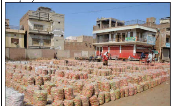
MULTAN: Vendor displaying tomato bags for bidding at Vegetable Market.