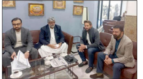
QUETTA: Renowned cricketer Shahid Afridi meeting with Caretaker Chief Minister Balochistan Mir Ali Mardan Khan Domki at Quetta airport.