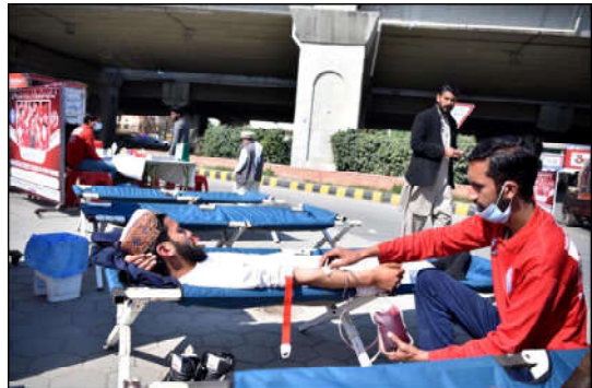
RAWALPINDI: Volunteers of Pakistan Sweet Home organized blood donation camp at Murree Road People Donating Blood for thalassemia patients.