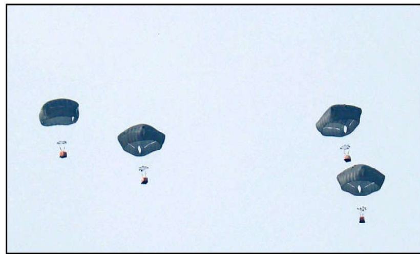
AID is being dropped by a Jordanian military aircraft over Rafah, southern Gaza Strip.

fensive in Ukraine. "The court has determined Orlov's guilt and orders a sentence of two years and six months [...] in a general regime penal colony," the judge said. Orlov was accused of discrediting the Russian army in a column written for the French online publication Mediapart, and fined in October after a first trial.