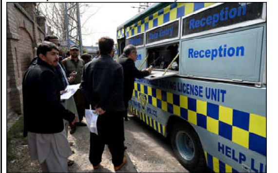
PESHAWAR: Traffic warden making driving licenses through DL-Van for journalists in front of Press Club.