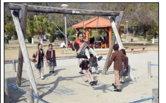
ISLAMABAD: Children are enjoying swing at Japanese Park in the Federal Capital.

Secondly, the minister said, the shortage of staff was another factor contributing to the pendency of claims, as there were currently 94 employees working against the sanctioned strength of 127 posts in FEB&GIF.