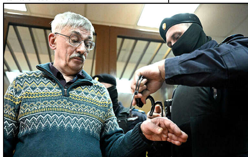
A police officer puts handcuffs on Oleg Orlov, the 70-year-old human rights campaigner and co-chair of the Nobel Prize winning Memorial group, after Orlov was sentenced to two and a half years in jail on charges of repeatedly "discrediting" the Russian army, in Moscow.