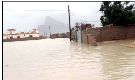
GWADAR: View of stagnant rain water after flash flood caused by heavy downpour of winter season, in Gwadar.