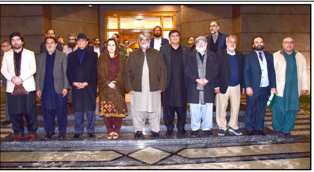
QUETTA: Caretaker Chief Minister Balochistan Mir Ali Mardan Khan Domki in a group photo with Caretaker Provincial Cabinet

Leaders of Treasury as well as Opposition benches also extended greetings to the newly elected chief minister after announcement of the election result