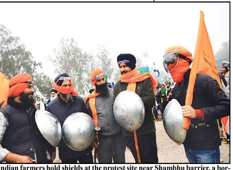
Indian farmers hold shields at the protest site near Shambhu barrier, a border between East Punjab and Haryana states.