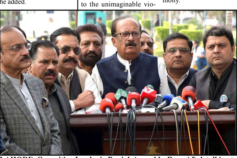
LAHORE: Opposition Leader in Punjab Assembly, Rana Aftab talking to media persons, outside Punjab Assembly in Lahore.