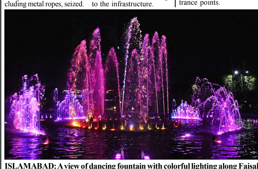
ISLAMABAD: A view of dancing fountain with colorful lighting along Faisal Avenue in the Federal Capital.

replied that after returning home from outside, the residents should also change their dress and have a shower to ensure that the March, he said, adding, the increase in pollen levels can washed away.