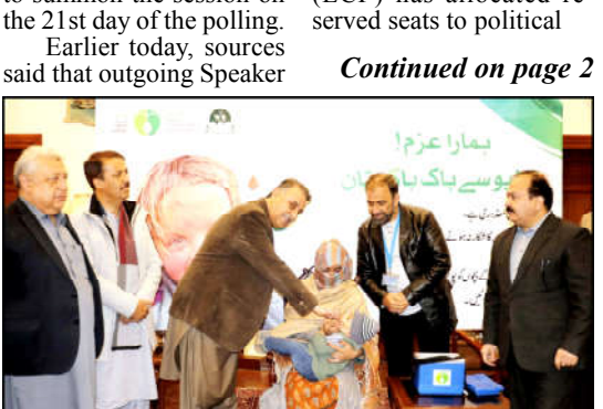
OUETTA: Governor Balochistan Malik Abdul Wali Khan Kakar inaugurating 7-days Anti-Polio campaign 2024 by administering drop to a child

While the Election Commission of Pakistan (ECP) has allocated re-