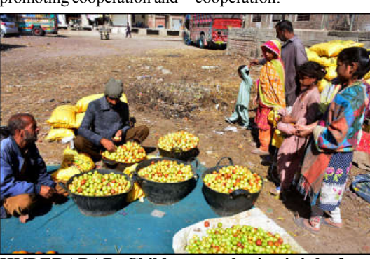
HYDERABAD: Children purchasing jujube from vendor at fruits market.