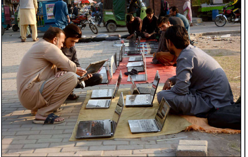
LAHORE: Vendors selling laptop at roadside setup in the Provincial Capital.

enabling customers to collect international remittances in their easypaisa wallets, we aimed to empower them with greater control over