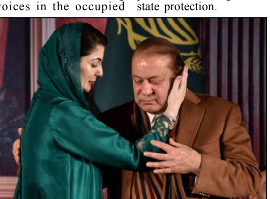
LAHORE:Newly-elected Chief Minister Punjab Maryam Nawaz gives congratulatory hug to her Father Former Prime Minister Nawaz Šhareef after taking oath at Governor House.

Mushaal pointed out that the dirty and ugly face of India was exposed by the National Crime Records Bureau (NCRB), which revealed that India had recorded 275 cases of custodial rape between 2017 and 2022, adding that these incidents, documented across various states, involve perpetrators from law enforcement, armed forces and other custodial facilities, reflecting a misuse of power under the guise of