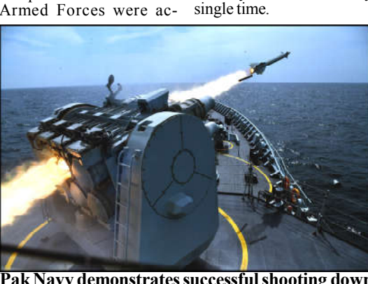
Pak Navy demonstrates successful shooting down of aerial target by Surface to Air Missile.

As a state committed to peace, we shall continue to emphasize the importance of peaceful coexistence with our neighbours. Any aggression against the people of Pakistan, our sovereignty and territorial integrity, will however be responded immediately, with full might and without any hesitation. Every single time.