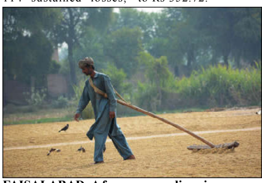
FAISALABAD: A farmer spreading rice crop on the ground for drying purpose.

Company Limited witnessed a maximum increase of Rs 35.00 per share price, closing at Rs 1,080.00, whereas Some 345 companies the runner-up was transacted their shares in Sazgar Engineering the stock market; 207 of Limited with a Rs 24.61 them recorded gains and rise in its per share price