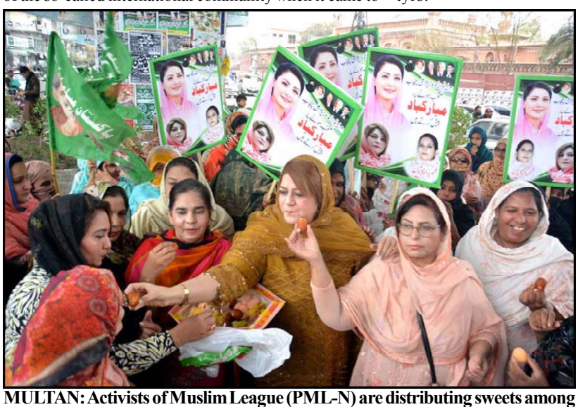
each other after Maryam Nawaz elected as Chief Minister Punjab during celebration demonstration, in Multan.