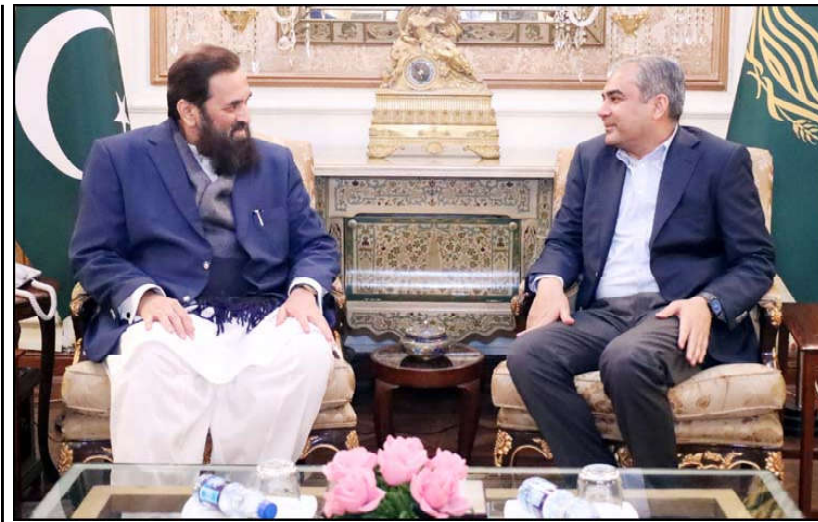
LAHORE: Caretaker Chief Minister Punjab Mohsin Naqvi in a meeting with Punjab Governor Muhammad Balighur Rehman.