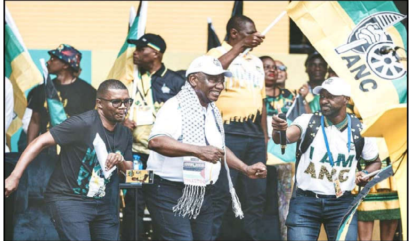
DURBAN: South African President Cyril Ramaphosa, wearing a checkered scarf with the word Palestine printed on it, sings and dances on stage during an election rally at the Moses Mabhida Stadium.