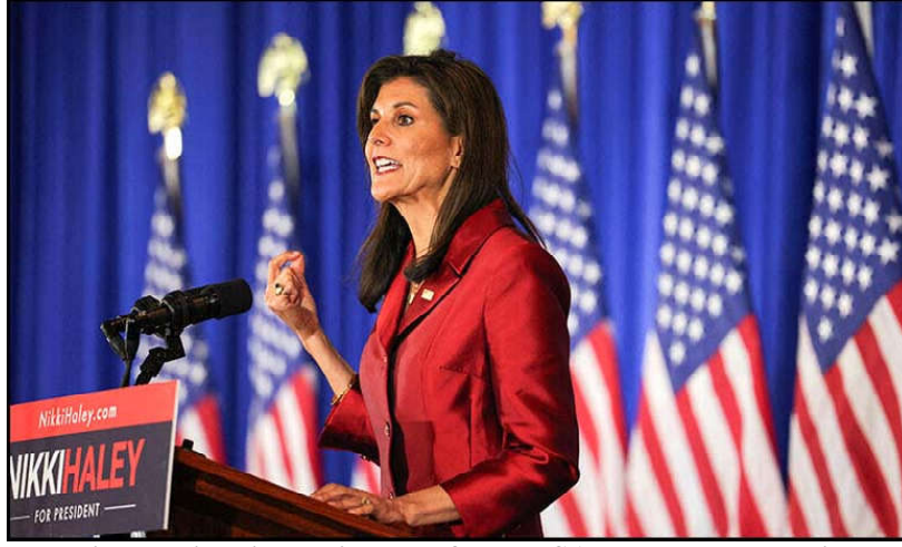
Republican presidential candidate and former US Ambassador to the United Nations Nikki Haley speaks on stage at her watch party during the South Carolina Republican presidential primary election in Charleston, South Carolina.

corruption and mismanagement. Yet the party remains a formidable machine, with supporters at all levels of government across most of the country, and many South Africans retain proud memories of its lead role in the anti-apartheid struggle. "Over the next three months we will explain to millions of our people why the ANC remains the party of choice in the 2024 election."