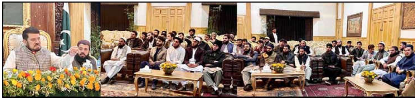
PESHAWAR: Khyber Pakhtunkhwa Governor Haji Ghulam Ali talking to a delegation of students of Peshawar University Campus at Governor House.

RAWALPINDI (APP): Anti-Narcotics Force (ANF) Pakistan while conducting 32 operations across the country managed to recover over 1215 kg drugs and arrested 36 accused during last week, said an ANF Headquarters spokesman. He informed that ANF in a successful operation also busted a drug dealer group and arrested eight accused. He said that the raids were conducted simultaneously in three major cities of the country and the gang members were rounded up. The gang members were involved in selling CBD oil-laced vapes through online platforms, he added. Eight people were arrested targeting the inter-provincial drug dealer group involved in the distribution of vapes. During the operation, vapes filled with hashish oil, CBD oil, THC oil and cigarette rolls made from hemp plant were recovered. Apart from this, marijuana oil, opium and other illegal materials including marijuana were also seized. The accused were involved in illegal activities under the guise of selling natural products and medicines. E-commerce platforms were being used to supply drugs, the spokesman informed. The accused used to import prohibited items from foreign countries through cargo companies. ANF strives to enforce government.