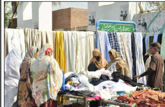
FAISALABAD: Women buying clothes from a Sunday Market in People's Colony, Faisalabad.

BEIJING (Xinhua/APP): The Agricultural Development Bank of China, the country's rural policy bank, has unveiled a guideline to step up credit support for China's Green Rural Revival Program, as part of efforts to promote rural revitalization. Greater support will be given to improve rural living conditions, protect and conserve the ecological environment, increase the coverage of infrastructure and public services in rural areas, and build digital villages, the lender said. It further pledged to broaden channels for farmers to help them increase their income, while keeping loan risks under control. In 2023, the bank had issued loans totaling 488 billion yuan (about 68.67 billion U.S. dollars) to key areas of the Green Rural Revival Program, data showed. The bank said it will target financial demands in key areas of the program, which highlights living condition improvements and the modernization of agriculture and rural areas, while also exploring effective means of providing financial support for the program.