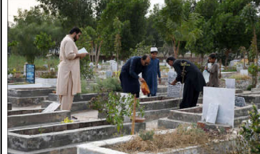
HYDERABAD: People are offering prayer at the grave of their loved one on the occasion of Shab-e-Barat at the graveyard.