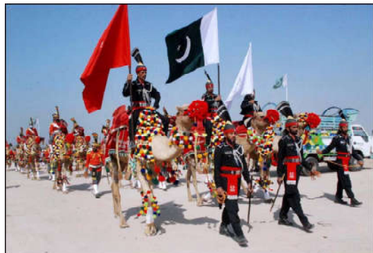
BAHAWALPUR: Rangers Cholistan Camel band presenting their skills at a ceremony held in connection with 19th TDCP Cholistan Desert Rally 2024 at Cholistan desert Jeep Rally.