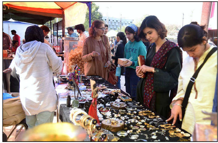
LAHORE: Women purchasing artificial jewelry from the stall during the Lahore Literary Festival at Al Hamra.