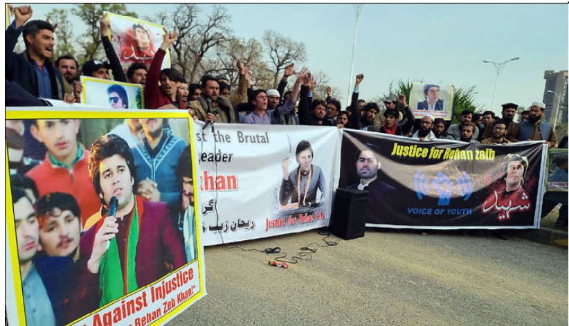
ISLAMABAD: Activists from Tribal District Bajaur protest against the killing of a young political leader.