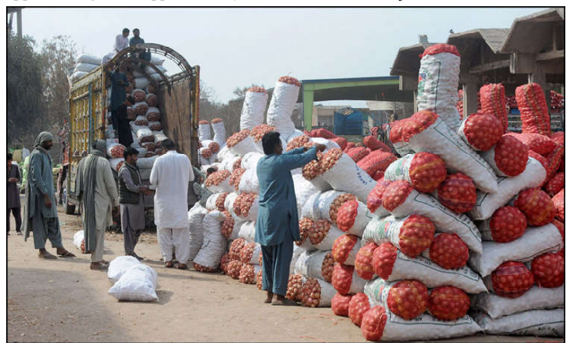
MULTAN: Laborers are unloading onions from the delivery truck at Vegetable Market.