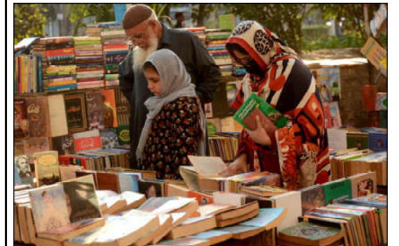
LAHORE: People selecting and purchasing old books from a roadside setup at Mall Road.

PESHAWAR (INP): Pakistan Tehreek-e-Insaf (PTI) candidate for Khyber Pakhtunkhwa (KP) chief minister office, Ali Amin Gandapur has said that he was not in favour of making verbal claims and pledges but will prove his eligibility through good governance. Interacting with a private news channel on Sunday, he said that uplifting the country's economy was among the top priorities of PTI and it would present pro-people budget. Ali Amin Gandapur said that he would spare no efforts to provide maximum relief to the people of province, ensuring law and order, restoration of health cards and to improve the education system of KP. He said the PTI founder picked a team that won the world cup [in 1992] and he would adopt same passion to elect the provincial cabinet. The PTI's candidate for KP CM's slot said that 55 percent of the newly-elected members of his party were those who won for the first time. The recent elections have exposed the turncoats and separated them from those who were loyal to the party, he added.