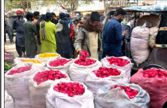
HYDERABAD: A vendor displaying the rose flowers to attract the customers in connection with shab-e-barat at flowers market.