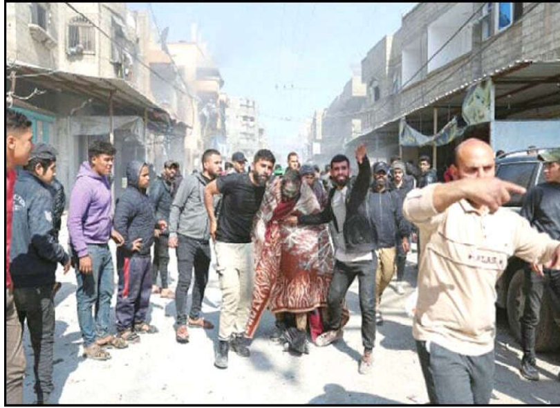
Palestinians help an injured man at the site of a strike on a house in Rafah.

camp, tempers are rising and on Friday dozens of people held an impromptu protest. "We didn't die from air strikes but we are dying from hunger," said a sign held by one child. In the camp, bedraggled children waited expectantly, holding plastic containers and battered cooking pots for what little food is available. Residents have taken to eating scavenged scraps of rotten corn, animal fodder unfit for human consumption and even leaves. Gaza's health ministry said a two-month-old baby identified as Mahmud Fatah had died of "malnutrition". "The risk of famine is projected to increase as long as the government of Israel continues to impede the entry of aid into Gaza," as well as access to water.