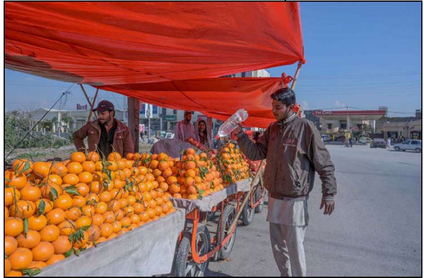
ISLAMABAD: A vendor busy sprinkling water on Oranges to keep them fresh at Khanna Pul.

He said that the factories were burning prohibited materials in their boilers while the kiln houses were operating without zigzag technology.