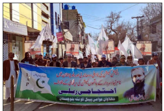
QUETTA: Members of Jhalawan Awami Penal (JAP) are holding protest demonstration against alleged rigging in General Election 2024, at Quetta press club.