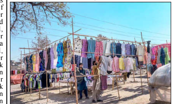
ISLAMABAD: A vendor displaying second-hand clothes to attract customers at Khanna Pul.

"By equipping these women engineers with specialized training, we not only open new career avenues for talented individuals but also enhance team engagement, motivation, and decision-making within companies."