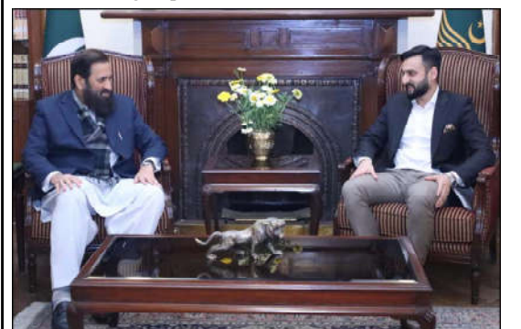
LAHORE: Caretaker Provincial Minister, Ibrahim Hasan Murad paid a farewell call on Governor Punjab Muhammad Balighur Rehman at Governor House.