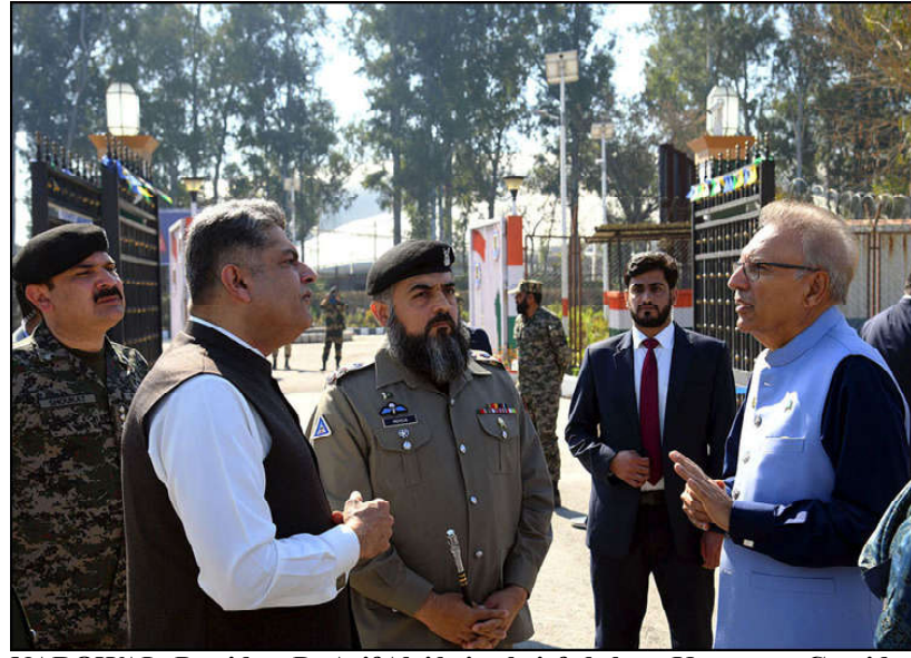
NAROWAL: President Dr Arif Alvi being briefed about Kartarpur Corridor at Zero Line/International Border.