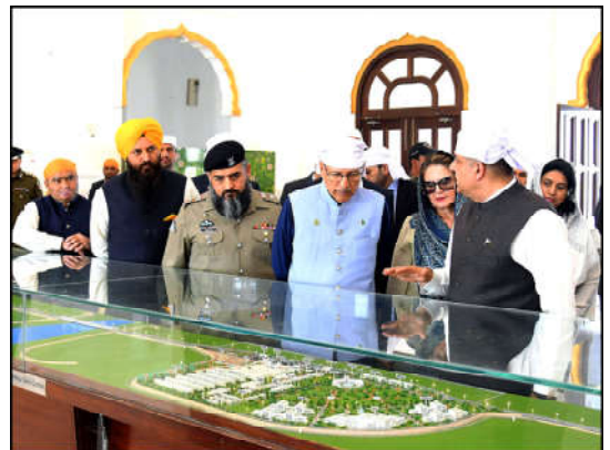
NAROWAL: President Dr. Arif Alvi being briefed about the Kartarpur Corridor.