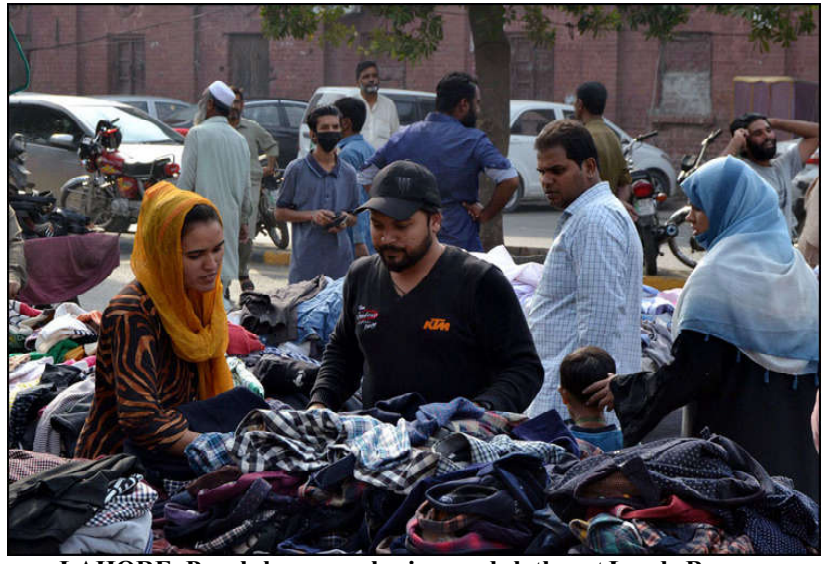
LAHORE: People busy purchasing used clothes at Landa Bazaar.