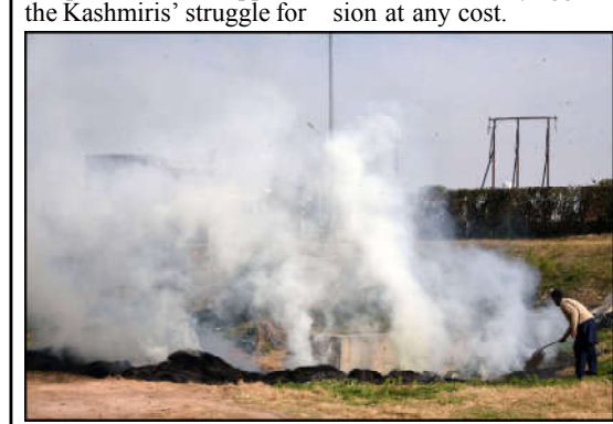
ISLAMABAD: A view of smoke rising in garbage dump on green belt along Islamabad Expressway, as needs to attention for concern authority, in the Federal Capital.