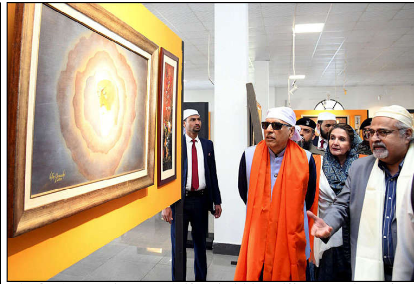
NAROWAL: President Dr Arif Alvi visiting different sections of the Kartarpur Corridor.