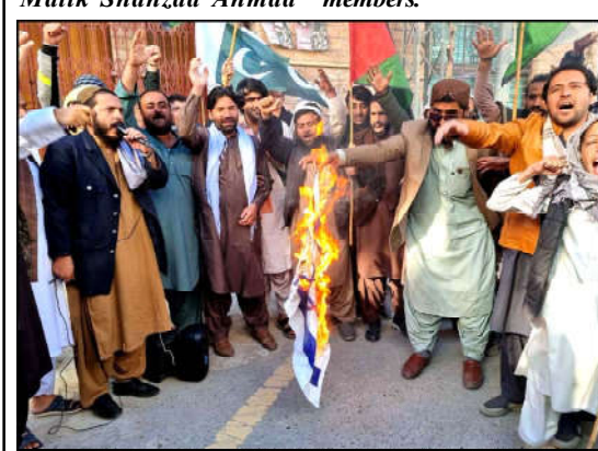
QUETTA: Members of Pakistan Youth Ittehad holding protest demonstration against Israeli cruel and inhumane acts and express unity with the innocent people of Palestine, at Quetta press club.

ISLAMABAD (INP): The Judicial Commission of Pakistan (JCP) has recommended the elevation of Balochistan High Court (BHC) Chief Justice Naeem Akhtar Afghan to the Supreme Court and appointment of Justice Malik Shahzad Ahmad