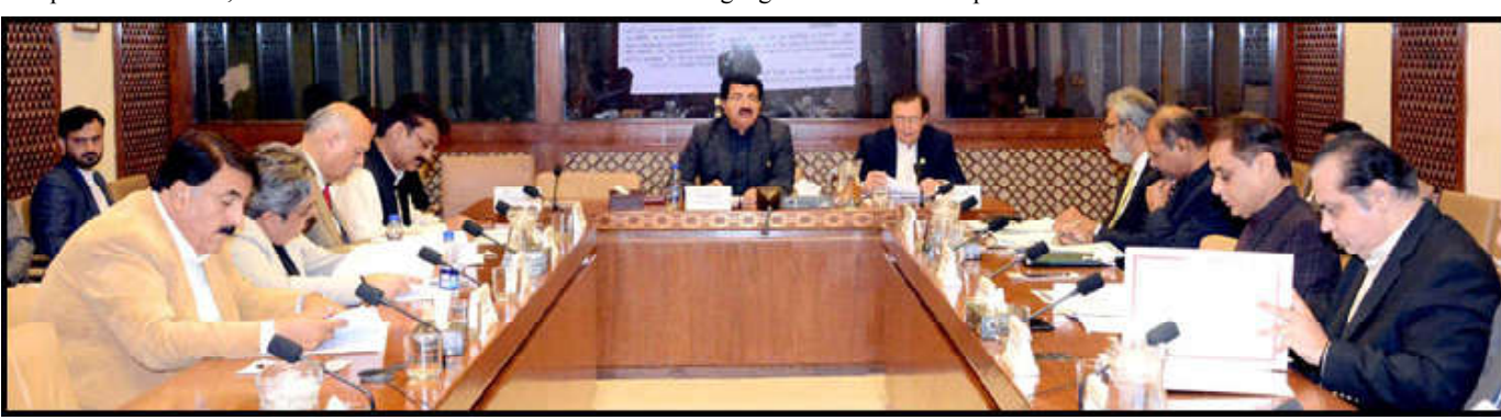
Chairman Senate, Muhammad Sadiq Sanjrani presiding over a meeting of the Senate Finance Committee at Parliament House, Islamabad.

ISLAMABAD (APP): After successfully making their way to the Lower House of the Parliament, so far 70 newly elected members (MNAs) have completed their registration process at the Secretariat. The process of registration of the newly elected MNAs was continued in the facilitation center established in the National Assembly Secretariat, the Spokesperson of the National Assembly said in a news release. He said the Facilitation Center had been established in Committee Room No. 2 of the National Assembly.