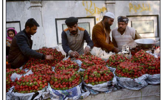
LAHORE: Vendors arranging and displaying strawberry to attract the customers.