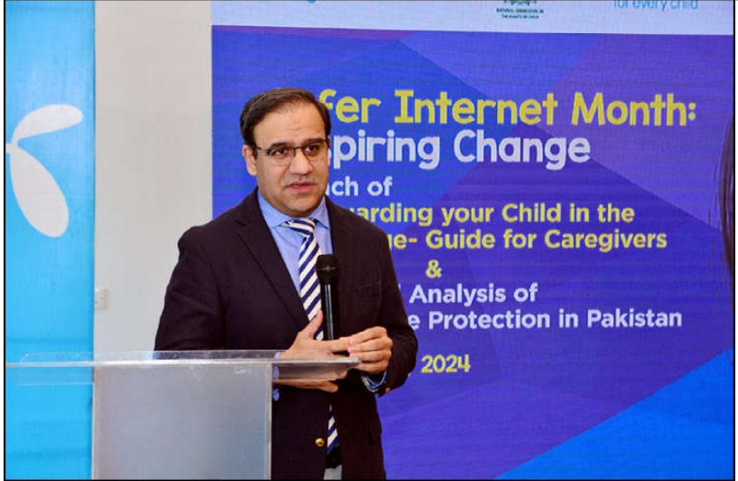
Caretaker Federal Minister for IT and Telecommunication, Dr. Umar Saif addressing launching ceremony of parental guide titled "Safeguarding Your Child in the Digital Age" at Telenor Headquarters in Islamabad.

Following competition assessment, CCP concluded that the proposed transaction involves the acquisition of shares and does not suggest any substantial lessening of competition or the creation or strengthening of a dominant position in the relevant market. Restructuring will ensure the Breakfast Cereal business is consolidated under one arm and result in future profitability.