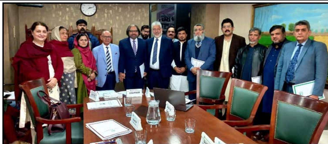
Senator Irfan-ul-Haque Siddiqui, Chairman Senate Standing Committee on Federal Education & Professional Training and members of the committee in a group photo with Officials of the Ministry during a meeting of the Committee at Parliament House Islamabad.

This endeavor by the National Highway and Motorway Police in collaboration with the Federal Directorate of Education underscores the commitment to instill a culture of road safety awareness and responsible driving practices among the youth. The lecture stood as a testament to the unified effort to ensure the safety and well-being of motorists and pedestrians alike, contributing to the broader goal of minimizing road accidents and promoting safer commutes within the community.