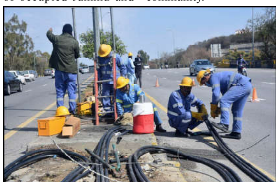
ISLAMABAD: IESCO Workers Busy In Repairing Power Cables at Srinagar Highway in the Federal Capital.

The statement underscored the longstanding injustice faced by the people of occupied Jammu and