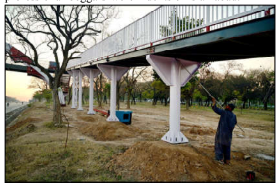
ISLAMABAD: Worker busy paint on the pedestrian bridge at Srinagar Highway in the Federal Capital.

This ongoing initiative reflects the commitment of district administration to maintain order and address societal challenges. With daily supervision, these efforts signify a proactive approach toward creating a safer and more organized environment for the residents of Islamabad.