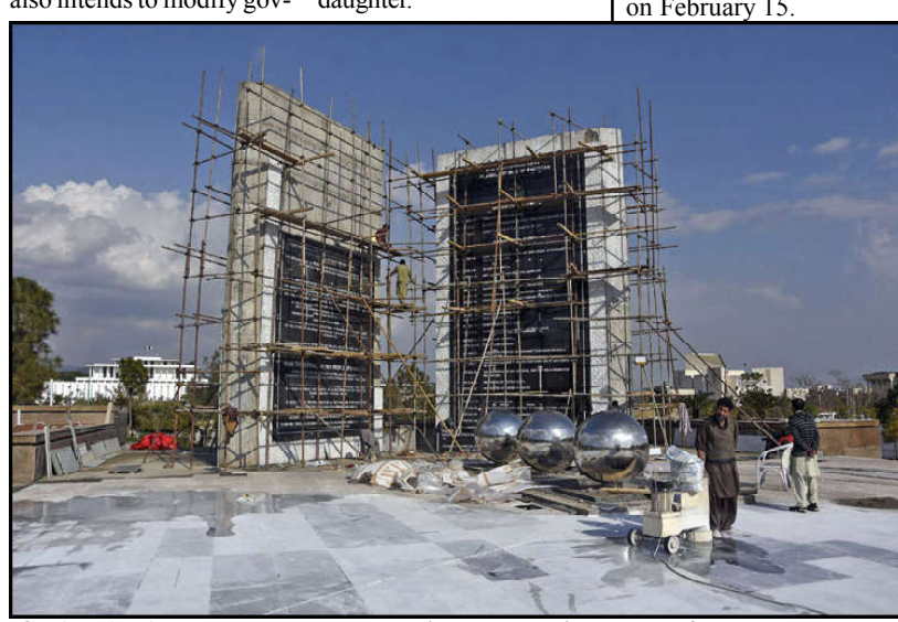
ISLAMABAD: Labourers are busy in construction work of Yadgar-e-Dastoor on a green belt along Constitution Avenue in the Federal Capital.

This rule currently allows a government house allocated to a retired federal employee to be assigned to their employed son or daughter.