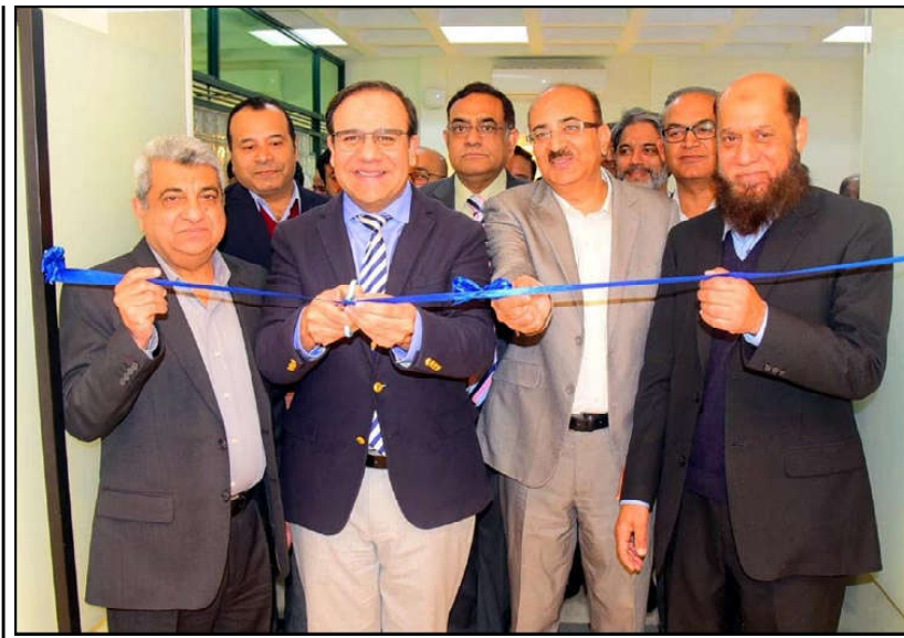
Caretaker Federal Minister for IT and Telecommunication, Dr. Umar Saif cutting ribbon to inaugurate Data Center at PTA Headquarters in Islamabad.

growth. The serious issue of 26 million out-of-school children required combined efforts and mosques could be utilized to impart education to these children, he added. The president mentioned Bangladesh, India and Sri Lanka where the literacy rate among the children was higher than Pakistan. He also cited the precedent of China that lifted about 700 million people out of poverty by focusing on health and education sectors. "The State can show the path but it is the responsibility of all stakeholders of the society to share the responsibility by addressing issues in the education and health sectors," he added. President Alvi further stressed upon focusing on priorities and continuity of policies which required public involvement.