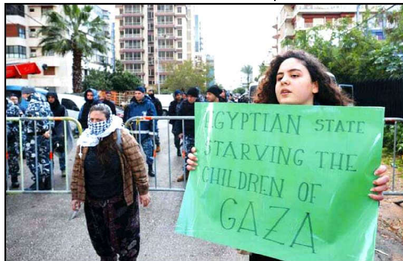
Lebanese activists block the road leading to the Egyptian embassy in Beirut during a protest on Monday against the closure of the Rafah crossing between Egypt and the Gaza Strip.

The vessels will have orders only to fire on the militants if they attack first and will not be authorized to shoot pre-emptively. The operational command is to be in the Greek city of Larissa.