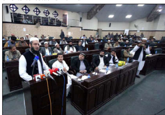
PESHAWAR: Peshawar Mayor, Zubair Ali delivering speech during the session of City Council in Peshawar.