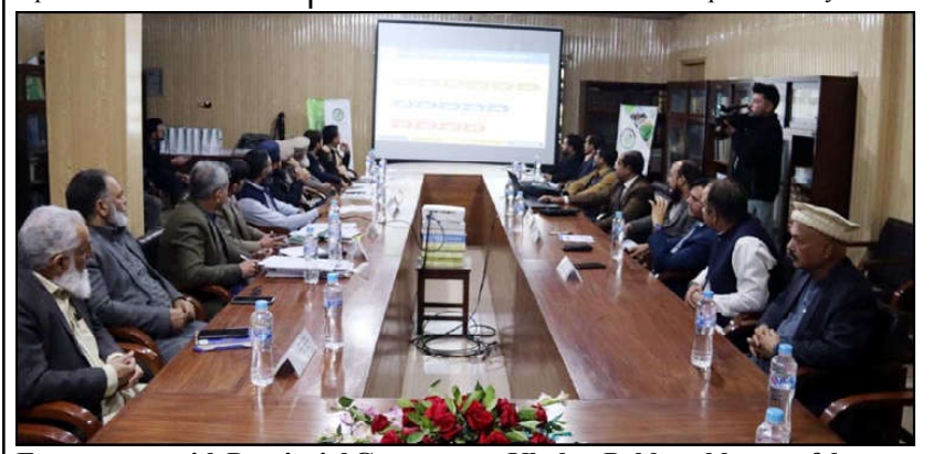
Engagement with Provincial Government Khyber Pakhtunkhwa on February 20, 2024 for the conduct of 7th integrated digital agricultural census.