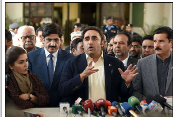
ISLAMABAD: Chairman Pakistan People Party Bilawal Bhutto Zardari talking with media persons after the attending hearing of former Prime Minister Zulfikar Ali Bhutto case at Supreme Court in the Federal Capital.