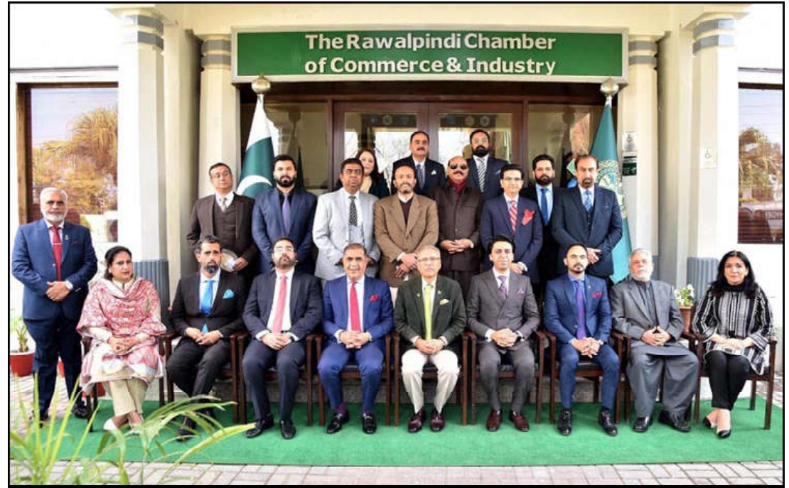
RAWALPINDI: President Dr. Arif Alvi in a group photo with the members of the Rawalpindi Chamber of Commerce & Industry, at National Health Summit on Dental Hygiene.

Azerbaijani Embassy, expressing Azerbaijan's consideration in participating in possible joint projects also under Pakistan's SIFC. He advocated for the establishment of preferential and transit trade agreements between the two countries and identified tourism as a promising area for collaboration, citing Azerbaijan's reception of tens of thousands of Pakistani tourists every year. The Ambassador highly appreciated ten times increase in direct and indirect, with contribution of SOCAR Trading, trade turnover in last two years.