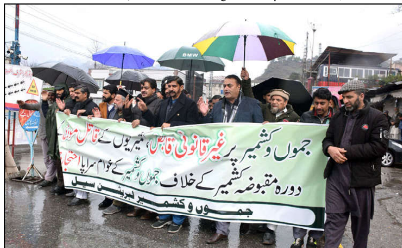
MUZAFFRABAD: Activists of Jammu Kashmir Liberation Cell shouting slogans during protest against Indian Prime Minister Narendra Modi on his arrival to Jammu and Kashmir, in the city.

PESHAWAR (APP): The Election Commission (EC) of Pakistan has notified the names of candidates returned on Khyber Pakhtunkhwa provincial assembly constituencies including PK-20 Bajaur II and PK-21 Bajaur III. According to the notification, Anwar Zeb Khan and Ajmal Khan have been returned on Bajaur PK-20 and PK-21 respectively. Anwar Zeb Khan secured 12917 votes while Ajmal Khan secured 16712 votes. The number of votes polled in PK-20 is 40507 and 39827 in PK-21. Both the candidates have contested elections as independents. The independent candidates may join a political party within three days of issuance of notification under clause 3 of Article 106 of the constitution, said the notification issued here Tuesday.