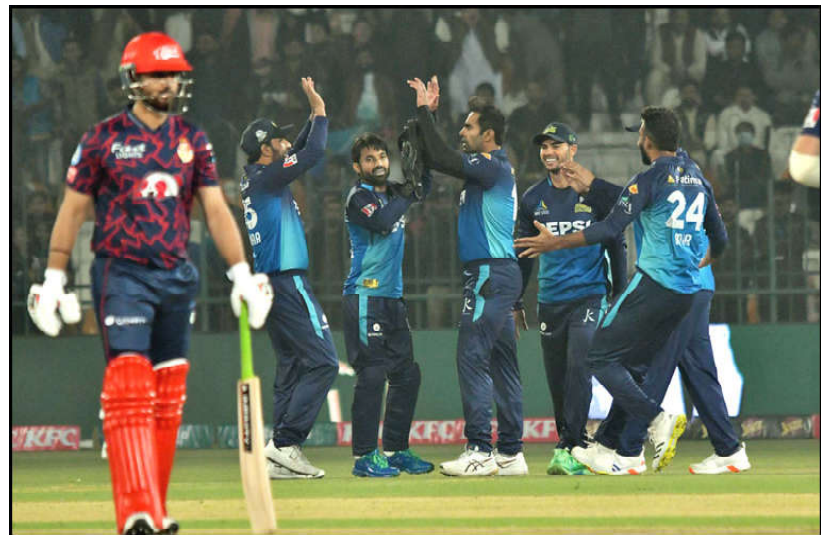
MULTAN: Multan Sultans team players celebrating after taking the wicket of Islamabad United batsman Colin Munro during the PSL Twenty20 cricket match between Multan Sultans and Islamabad United at the Multan Cricket Stadium.

He said that X formerly Twitter had been