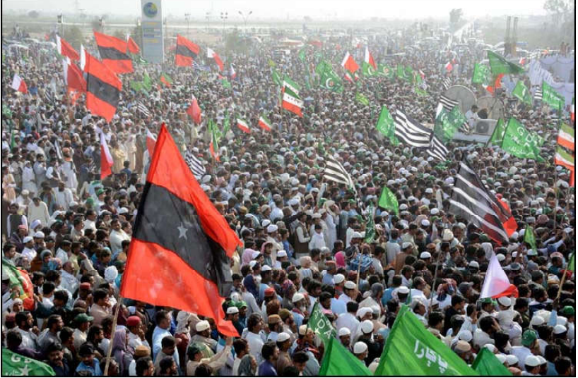
SUKKUR: Leaders and supporters of Grand Democratic Alliance (GDA) are holding protest demonstration against alleged rigging in General Election 2024, at Moro National Highway road in Sukkur.