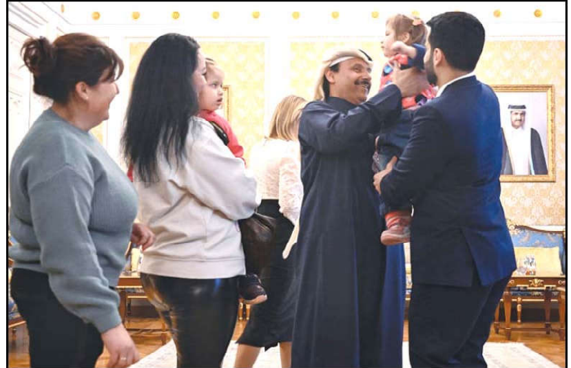
Ambassador of Qatar to Russia Sheikh Ahmed bin Nasser Al Thani and Russia's presidential commissioner for children's rights Maria Lvova-Belova (unseen) interact with Ukrainian children, at the Qatari embassy in Moscow.