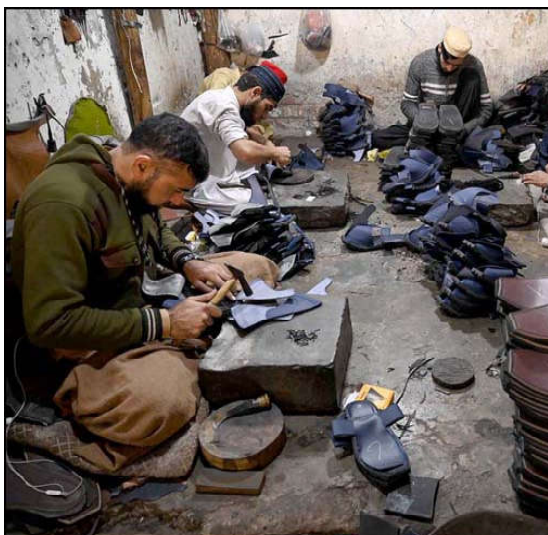
PESHAWAR: Cobblers preparing traditional shoes (Peshawari Chappal) at his workplace.

The augmentation of new 250 MVA auto transformer would benefit the industrial, rural and urban consumers of the GEPCO region, besides increasing the system reliability.