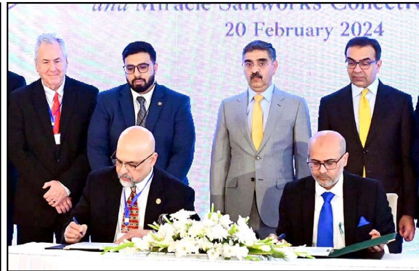
ISLAMABAD: Caretaker Prime Minister Anwaar-ul-Haq Kakar witnesses the signing ceremony between Pakistan Mineral Development Corporation and Miracle Saltworks Collective Inc. (USA) for joint venture agreement for the value addition and export of pink salt.

The Senators while addressing the adjournment motion moved by Senators Muhammad Tahir Bizinjio, Sardar Muhammad Shahiq Tareen, Mushtaq Ahmed, Syed Ali Zafar and others regarding the situation arising out of the results of