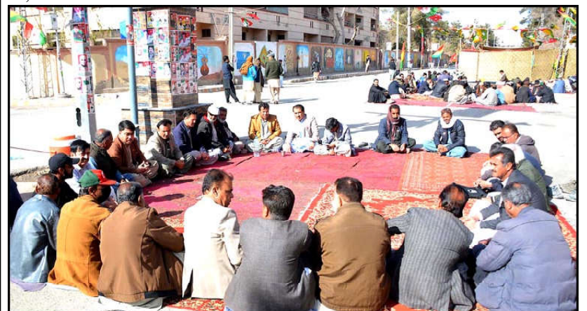
QUETTA: Activates of four Political Party Ittihad hold sit-in in front of RO office for recent General Election.

Meanwhile, the Chaman-Quetta highway was reopened following negotiations between the government high ups and dharna committee.