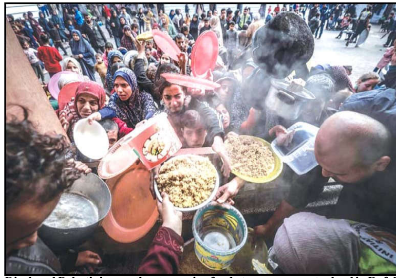
Displaced Palestinians gather to receive food at a government school in Rafah in the southern Gaza Strip, amid ongoing strikes by Israeli forces.

"It's very difficult to see these scenes of people just being cut off," he said, saying food supplies were limited. "It's heartbreaking to see that there are people in health facilities who are not able to be treated correctly," he said.