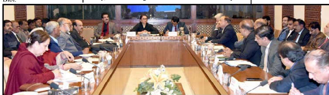
Senator Saadia Abbasi, Chairperson Senate standing Committee on Cabinet Secretariat Presiding over a meeting of the Committee at Parliament House Islamabad.

The AC was accompanied by the Market Committee Secretary, and other stakeholders.