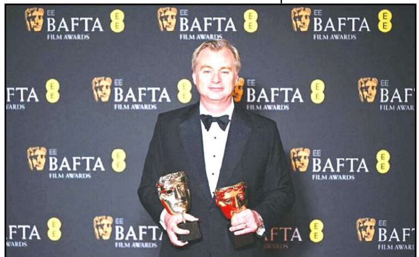
LONDON: British film producer and director Christopher Nolan poses with the award for Best film and Best director for "Oppenheimer" during the British Academy's film awards ceremony.

Monitoring Desk ATHENS: Greek farmers were expected to drive into Athens with tractors on Tuesday to protest outside parliament over the impact of rising energy costs, competition from abroad and recent flooding. Their protest echoes grievances in other parts of Europe, including France, Belgium, the Netherlands, Poland and Italy, where farmers have staged similar demonstrations. Greek farmers' unions have been in negotiations.