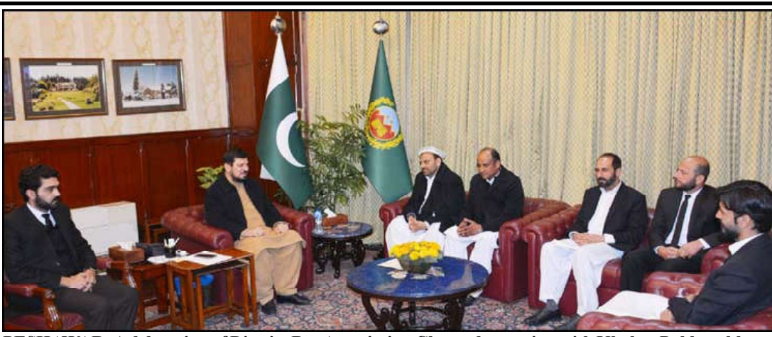
PESHAWAR: A delegation of District Bar Association Charsada meeting with Khyber Pakhtunkhwa Governor Haji Ghulam Ali.

revenue through sale of Markhor Trophy Hunting was witnessing increase by each passing year. For the first time when the scheme was launched in 1990 the hunting permits were sold at price of US dollar 15000 and later gradually the amount increased as foreign hunters kept on coming to Khyber Pakhtunkhwa. "Once Markhor was critically endangered wild specie in Pakistan, but due to proper conservation efforts based on monetary gains through sale of hunting permits to foreign hunters, the country has now largest population of the animal," he apprised. Under the scheme a sense of ownership is being inculcated among communities as 80 percent of revenue generated is spent on development schemes in respective areas of hunting through mutual understanding of local elders. Twenty percent of the revenue generated goes into national kitty. President Gahirat Conservancy Chitral, Faizur Rehman.