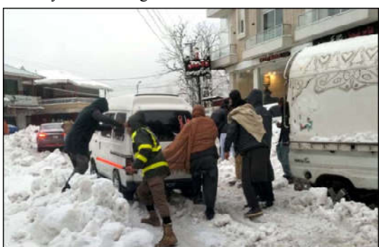
ABBOTTABAD: Rescue officials trying to remove a vehicle stuck in snow covered area after the heavy snowfall of winter season, which more decreases the temperature below in minus degree Celsius, at Nathiagali area in Abbottabad.

Addressing the gathering, the first lady underscored the collective responsibility to nurture both environment and mental health, noting that a significant portion of the country's population grappled with mental health challenges, with many unable to seek professional help. She advocated for the regular organization of floral art events to not only beautify surroundings but