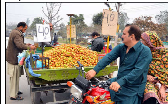
FAISALABAD: A street vendor is selling Jujube (Bair) on his pushcart along a road in the city.

However, the imports of Liquefied Natural Gas (LNG) increased by 4.82 percent from $ 2,192.489 million last year to $ 2,298.144 million while the import of Liquefied Petroleum Gas (LPG) went up by 1.47 per cent in the first seven months and stood at $434.991 million as compared to $428.687 in the corresponding period in 2022-23. Meanwhile, on a year-on-year basis, the petroleum group imports witnessed an increase of 0.03 percent.