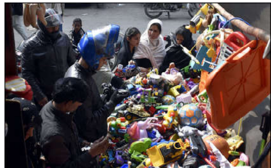
LAHORE: People are busy buying secondhand toys at a Landa bazaar in Provincial Capital.

The overall trade deficit in goods and services was recorded at $13,503 million during the current fiscal year compared to the deficit of $17,264 million.