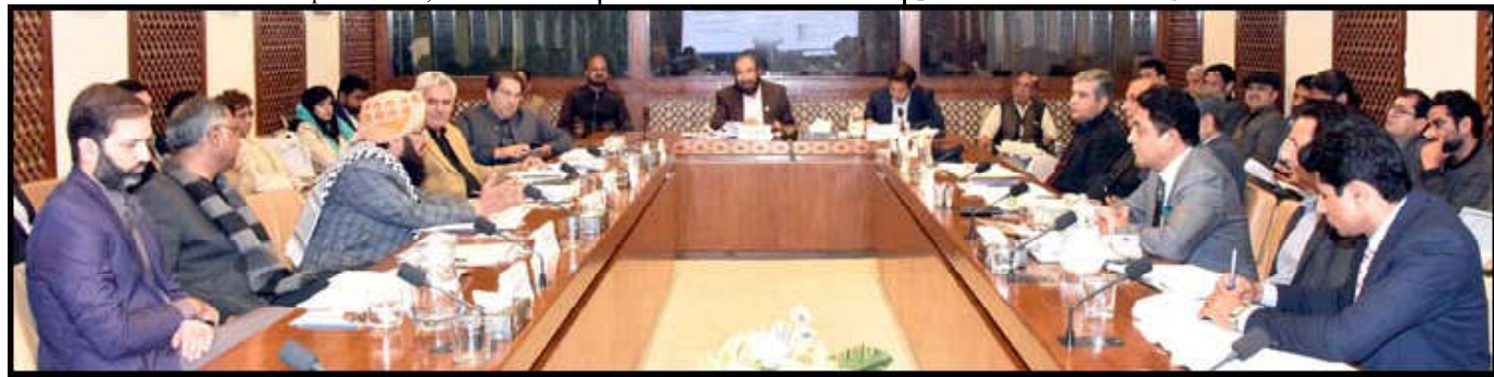
Senator Hidayatullah Khan, Chairman Senate Standing Committee on Housing and Works Presiding over a meeting of the Committee at Parliament House, Islamabad.

power—is a challenge posed by us as we conclude the World Social Forum 2024. The power imbalance that fosters systematic and structural inequalities and the compounding crises that comes along with it, drives us to lose our fear to stand up and speak up against all forms of injustices. It must be understood as a systemic design that leads to gross violations of human rights for a vast majority of the global population. The statement further narrated: The wealth of billionaires built on the material exploitation of workers who struggle to access basic services, appears to have grown twice as much wealth as the rest of the world even during the time of a global health crisis, where most of the people struggled to make ends meet. This highlights that we need to redistribute power, put the people at the heart of just, equal and sustainable world we want. The CSO statement said: At a time when survival and recovery become a privilege for most of us, the richest 1% have continued to remodel economic systems.