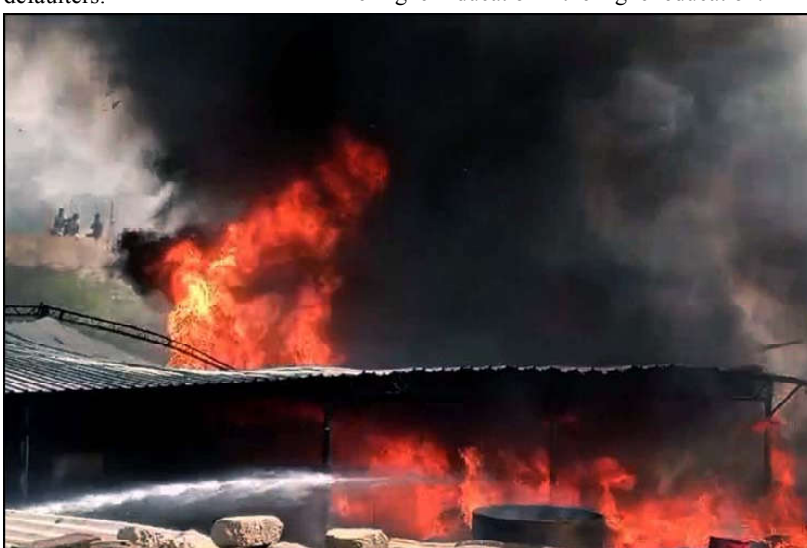
KARACHI: View of site after a fire broken out incident at a candle manufacturing factory as the fire brigade officials are busy in extinguishing fire and rescue operation, located on Korangi Ibrahim Hyderi area in Karachi.

however, the final decision would be taken by the party chairman. Gandapur said that after coming to power, he would take measures to make the province financially and economically self-sufficient, adding that restoration of the Sehat Card, provision of soft loans to youth for businesses and legal struggle for a due share of the province under net hydel profit and National Finance Commission (NFC) award.