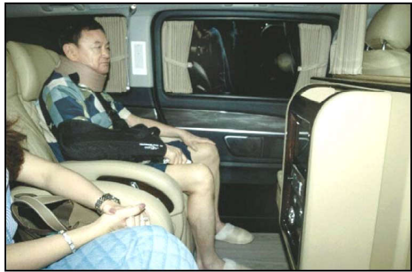
Former Thai Prime Minister Thaksin Shinawatra arrives at his family compound following his release.

The United States, Israel's top ally, says it is still working with mediators Egypt and Qatar to try to broker another cease-fire and hostage release agreement. But those efforts appear to have stalled in recent days, and Netanyahu angered Qatar, which has hosted Hamas leaders, by calling on it to pressure the militant group.