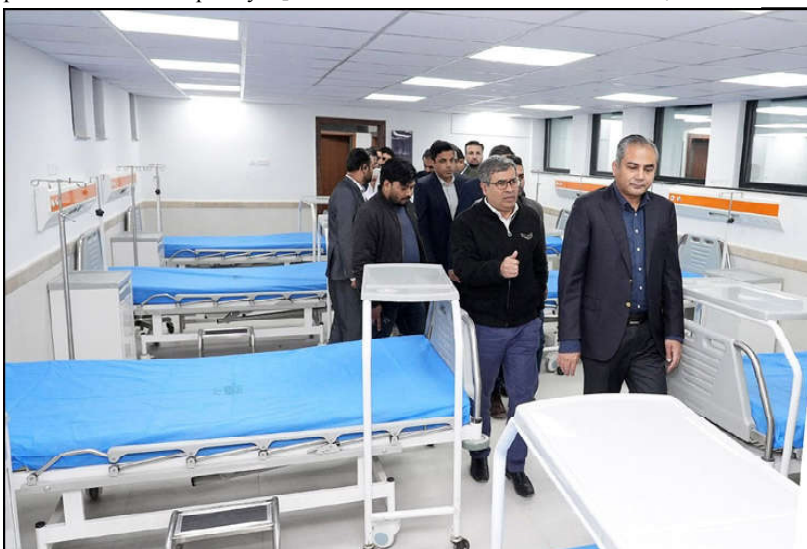
LAHORE: Caretaker Chief Minister Punjab Mohsin Naqvi inspecting the Newly Installed Beds after inauguration of upgraded Surgical Block, Medical Block and Admin Block at Services Hospital.

remarking that he wouldn't even send an enemy there for treatment. He praised the rapid transformation of Services Hospital into a state-of-the-art facility within 4 and a half months. The ongoing upgradation covers an area of 3 lakh 11 thousand square feet, including the addition of 24 new, state-of-the-art operation theaters, in the 1600-bed hospital. Mohsin Naqvi applauded the hard work of Provincial Minister Mansoor Qadir, Secretary Communication and Works, and the Health Department.