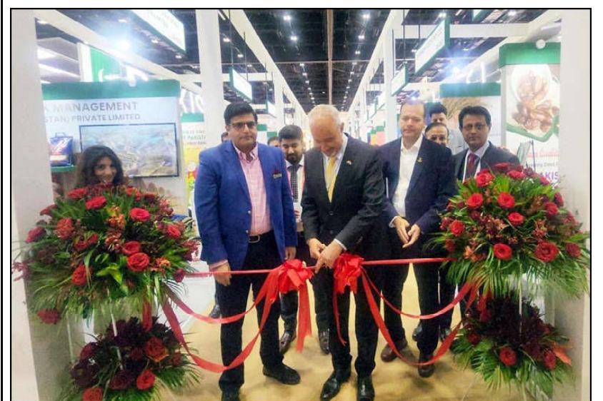
DUBAI: Ambassador, Faisal Niaz Tirmizi, Pakistan's Envoy to the UAE inaugurates the Pakistan Pavilion during Gulf Food Exhibition at World Trade Centre.