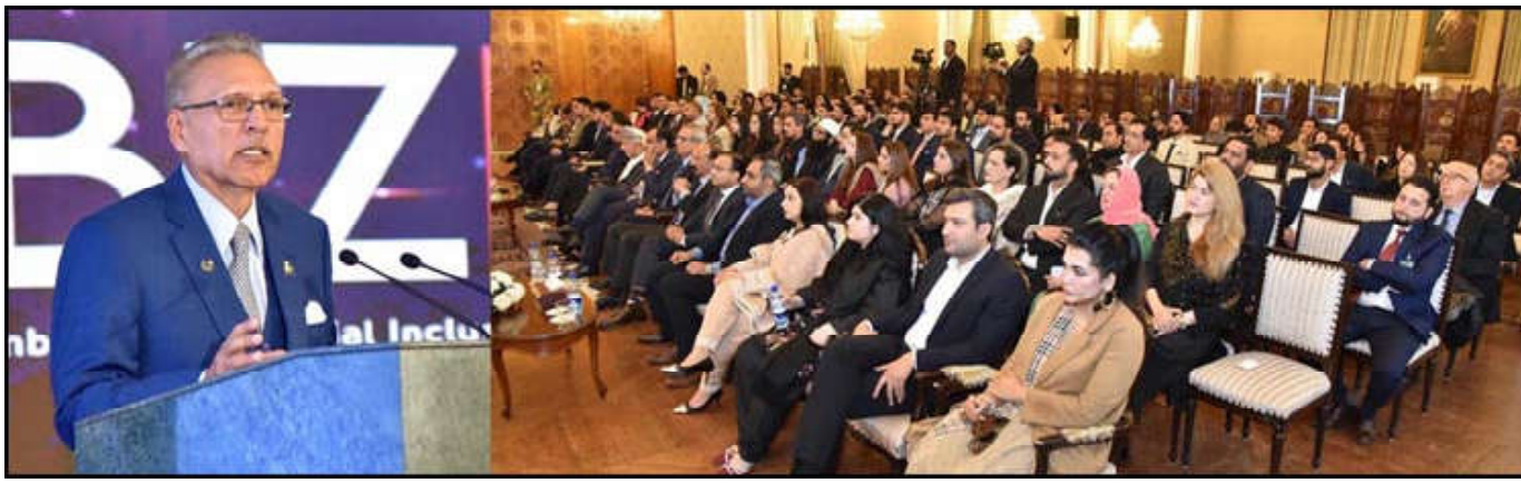
ISLAMABAD: President Dr. Arif Alvi addressing the 3rd edition of Hosting Business Net 2024, a platform to promote financial inclusion and digital transformation, at Aiwan-e-Sadr.