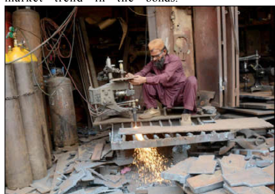
LAHORE: A blacksmith is busy at his workplace cutting large pieces of iron and making molds.

The official added that the directorate had set a target of Rs 75 billion for the new financial year 2023-24 for Islamic finance bonds.