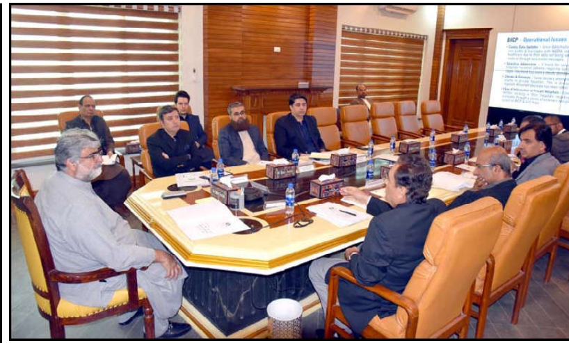
QUETTA: Caretaker Chief Minister Balochistan Mir Ali Mardan Khan Domki presiding over a meeting to review performance and activation of Balochistan Health Card Program.