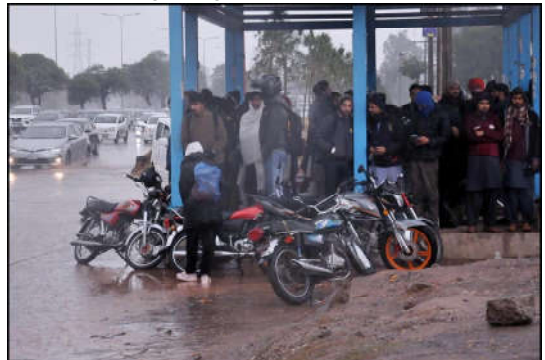
ISLAMABAD: People stand under the Bus Stop Shelter waiting to stop rain at Express way.

gime breaking all records of committing atrocities against civilians. Despite the systematic violation of their rights, Kashmiris remained steadfast in their resistance, refusing to surrender to Indian military might. For them, there is no option but to continue the struggle for their inherent rights and freedom. Daily life in IIOJK is marked by oppression and bloodshed, with Kashmiris bearing the brunt of the Modi government's repressive measures. The international community's silence on the matter only emboldens the Indian government to intensify its repression further, exacerbating the suffering of Kashmiris. The resolution of the Kashmir dispute in line with internationally accepted norms of justice remains the only viable solution to end the bloodshed and restore peace.