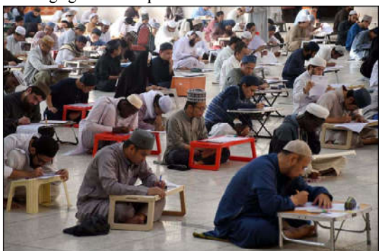
KARACHI: Pakistani and foreign religious students take their annual exams sitting on the floor of the Jamia Binoria Islamic seminary, in Provincial Capital