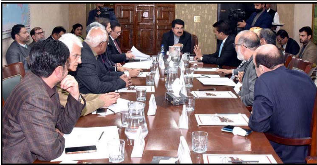
ISLAMABAD: Chairman Senate, Muhammad Sadiq Sanjrani presiding over a Senate House Business Advisory Committee meeting at Parliament House.