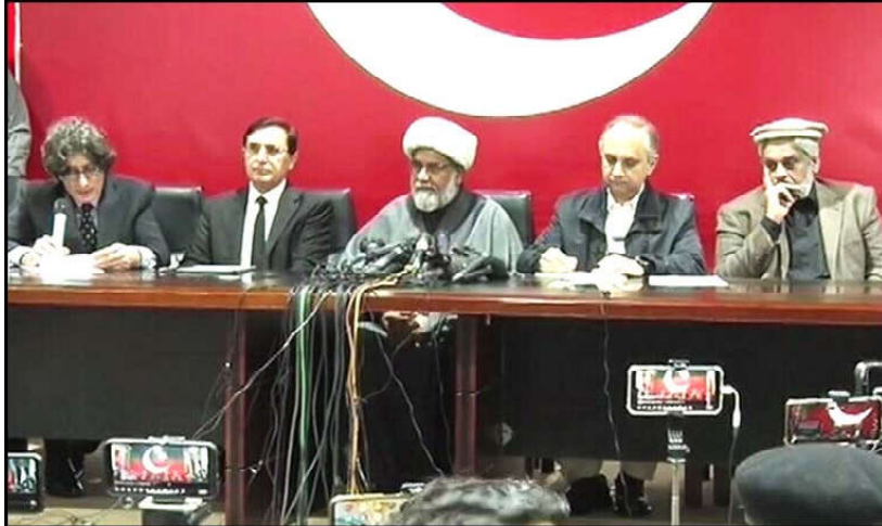
ISLAMABAD: Leaders of Pakistan Tehreek-e-Insaf (PTI) and Sunni Ittehad Council (SIC) addressing a Press conference