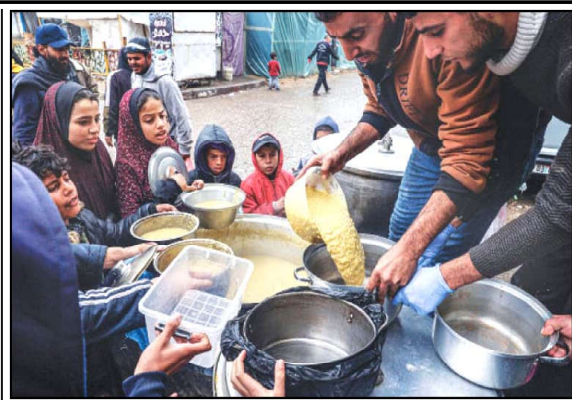
Volunteers distribute rations of lentil soup to displaced Palestinians in Rafah in the southern Gaza Strip.

MADRID (Internews): Voters went to the polls in Spain's northwest region of Galicia on Sunday in a close-run race where polls have suggested the opposition conservative People's Party (PP) could lose an absolute majority that it has held for 15 years. The PP have ruled the region for all but four of the past 35 years and their leader, Alberto Nunez Feijoo, is a former Galician regional government chief.