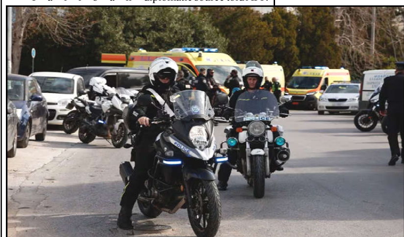
Police secure the area around the building of a shipping company following a shooting and while a police operation is underway in the suburb of Glyfada, in Athens, Greece.

WASHINGTON (Online): The United Nations Security Council (UNSC) will meet on Tuesday to demand an immediate humanitarian ceasefire in Gaza.