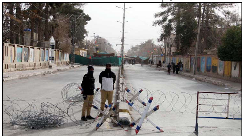
QUETTA: Security officials are standing high alert to avoid untoward incident as security has been high alert due to protest of four-party alliance against alleged rigging in General Election 2024, outside DC Office in Quetta.