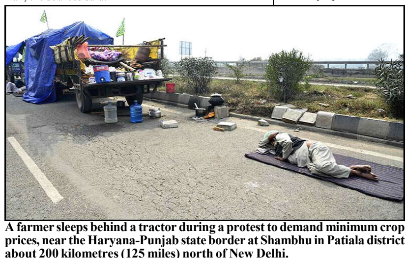
A farmer sleeps behind a tractor during a protest to demand minimum crop prices, near the Haryana-Punjab state border at Shambhu in Patiala district about 200 kilometres (125 miles) north of New Delhi.

While one faction did not initially agree to Qaani's request, most others did. The next day, elite Iran-backed group Kataib Hezbollah announced it was suspending attacks.