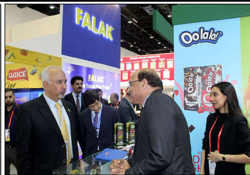
DUBAI: Ambassador, Faisal Niaz Tirmizi, Pakistan's Envoy to the UAE while talking to a Pakistani exhibitor during the Gulf Food Exhibition at Pakistan Pavilion, World Trade Centre.

FAISALABAD (APP): Agricultural scientists have stressed the need for collaborated efforts and enhanced work on climate resilient, high yielding and fortified varieties in order to ensure food and nutrition security amid the challenges of changing climate, ever-increasing population and productivity. They were