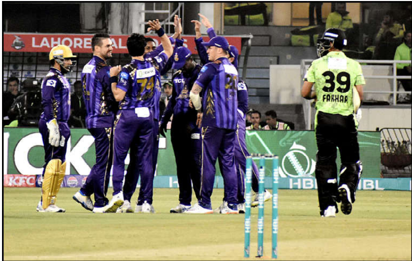
LAHORE: Quetta Gladiators' team players celebrates after Lahore Qalandars Sahibzada Farhan dismissals during Pakistan Super League (PSL) Twenty20 cricket match between Lahore Qalandars and Quetta Gladiators at the Gaddafi Cricket Stadium, in Provincial Capital.

During the meeting with Shahbaz Sharif, the US ambassador appreciated the role of Pakistan in the stability and peace of the region. He assured that the United States will urge Pakistan's neighboring countries to play their role as well.