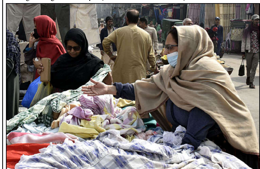
LAHORE: Women are busy buying secondhand curtains at a Landa bazaar in Provincial Capital.

He said the rolling stock being procured under this project would be capable of running at a speed of 160 km/h whereas the department had a dedicated fleet of 55 diesel-electric locomotives of 4000-4500 HP for freight operation to cater maximum haulage at high speed.