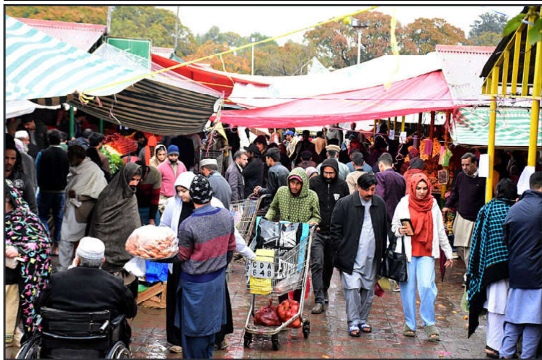
ISLAMABAD: People are busy in purchasing grocery at Sunday weekly bazaar at Aabpara area during rain in the Federal Capital.