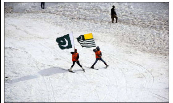
BAGH: Skiers take part in the Ganga Choti Winter Sports Festival near Bagh, Azad Jammu and Kashmir (AJK).

SIALKOT (APP): Four persons were killed and one got injured after a car collided with the wall of Mart, due to overspeed at Daska-Sambrial Road late last night. According to a rescue spokesperson, the accident occurred at Daska-Sambrial Road near Adam-Kay Stop, late last night where a speedy car collided with the wall of the Mega Mart after hitting the divider.