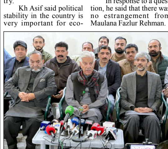
SIALKOT: Former Minister Defence Khawaja Asif, addressing media persons at his residence at cantt.