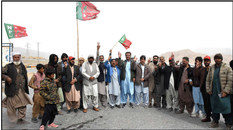
QUETTA: Workers of Char Jamaati Ittihad hold a protest against the alleged interference in the elections.