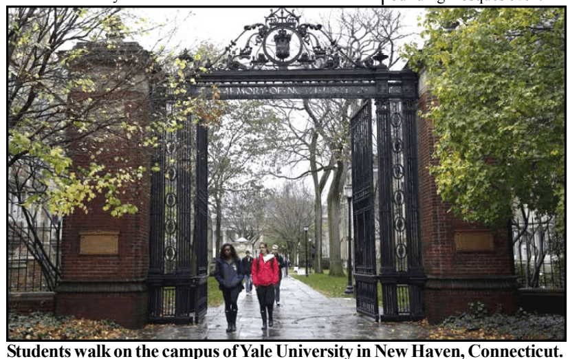
Students walk on the campus of Yale University in New Haven, Connecticut.