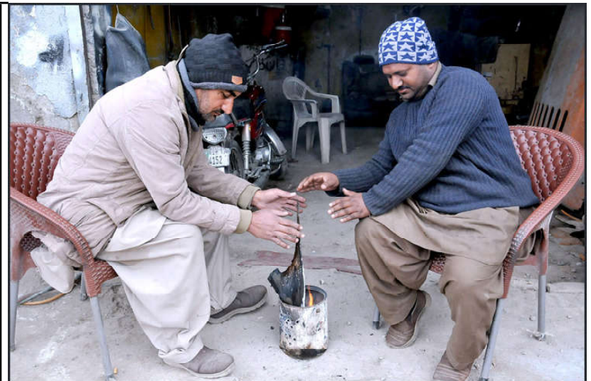
ISLAMABAD: Mechanics sit around the fire to warm their hands as the temperature drops due to rain in the city.

Moreover, 169 news bulletins have been aired on Web TV, while 30 road safety programs have also been aired to educate citizens about road safety, which plays an important role in educating citizens about the rules and regulations of road safety. As Islamabad Capital Police is responsible for the protection of life and property of the citizens, it also provides opportunities to keep them fully aware of the regular situations and events of Islamabad Capital Police.