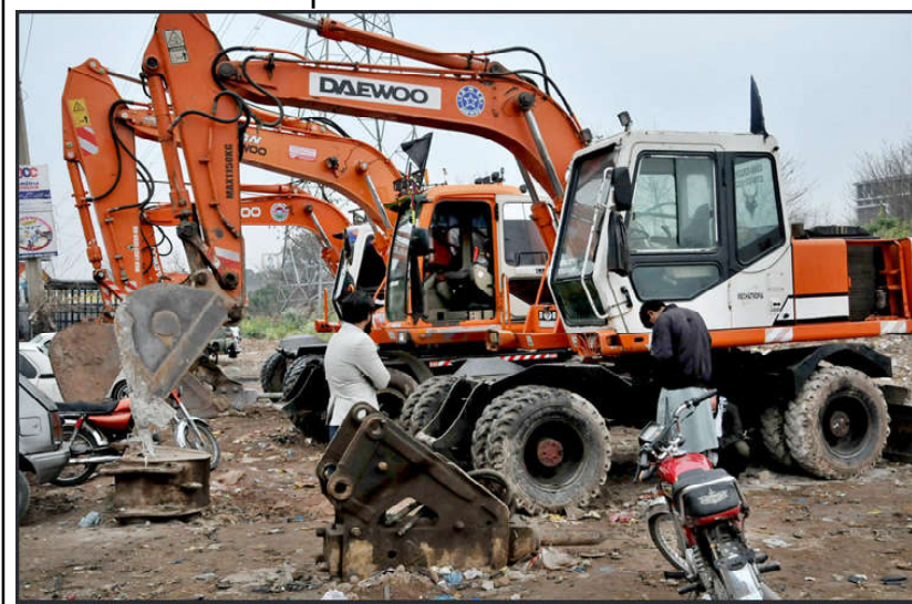
ISLAMABAD: A mechanic repairs an excavator at his work place.

lem nor a land dispute that can be resolved by military and brutal acts. Contrary to this, it added, Kashmir is purely a political dispute that has been recognized by the United Nations and its Security Council as an issue of right to self-determination. The statement, taking a dig at the so-called and puppet Hindutva Bharatiya Janata Party regime for its heinous criminal record in IIOJK, said the freedom and peace-loving people of Jammu and Kashmir only want their political and birthright to self-determination, which is a peaceful and democratic formula for settlement of the lingering Kashmir dispute. The statement appealed to the United Nations Secretary General, António Guterres, to help settle the Kashmir dispute according to the resolutions of the World Body and the aspirations of the Kashmiri people and put pressure on India to stop human rights violations in IIOJK.