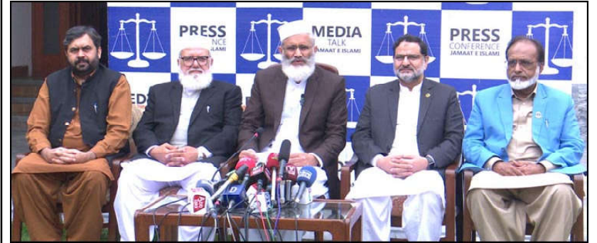
LAHORE: Ameer Jamaat-e-Islami Sirajul Haq addressing a Press conference.