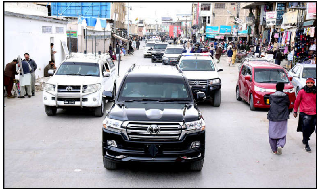
QUETTA: Caretaker Chief Minister Balochistan Mir Ali Mardan Khan Domki visiting different roads and shopping centers of Quetta city