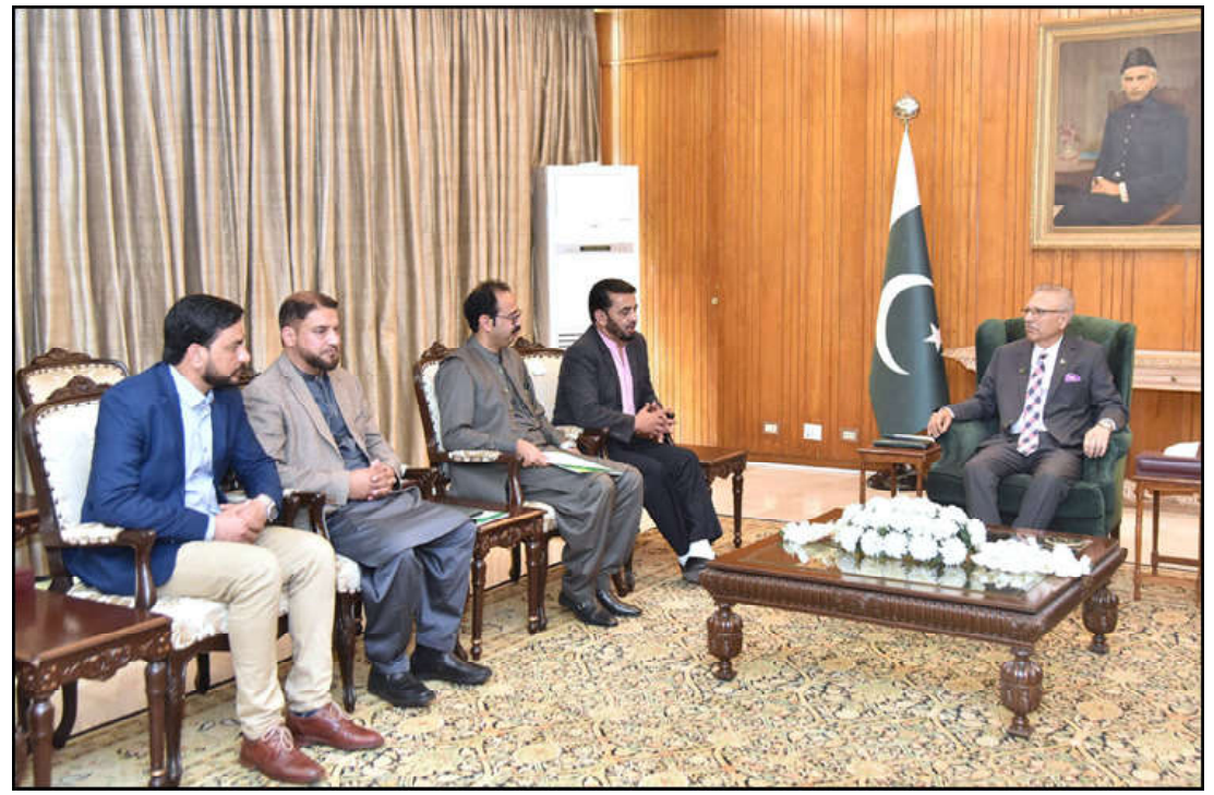
ISLAMABAD: A delegation of READ Foundation call on President Dr Arif Alvi, at Aiwan-e-Sadr.

political activists and parties, also calling for the release of all Kashmiri political prisoners and activists. "As far as Yasin Malik is concerned, we have expressed our serious concerns about his prolonged and continued imprisonment. We have condemned the illegal and fictitious cases in which he has been framed and we have also rejected the basis of awarding him the death penalty," she added. "Pakistan will continue to extend political, diplomatic and moral support to our Kashmiri brothers and sisters for the just and peaceful settlement of the Jammu and Kashmir dispute in accordance with the UN Security Council Resolutions," she reiterated.