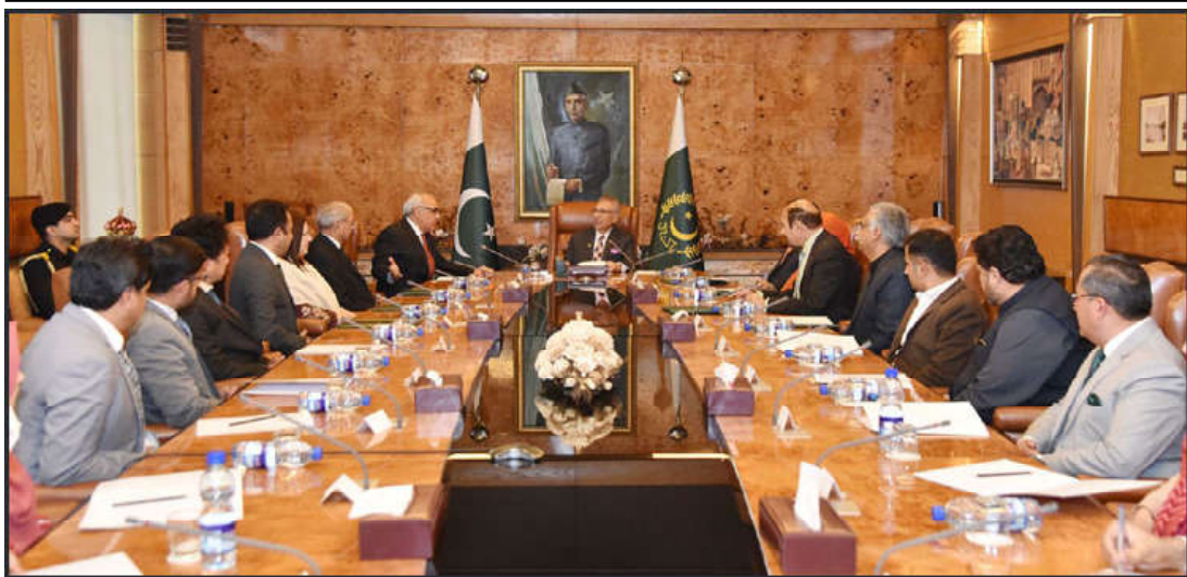
A delegation of Karakoram International University, Gilgit Baltistan and University of Batistan, Skardu, called on President Dr. Arif Alvi, at Aiwan-e-Sadr, Islamabad.