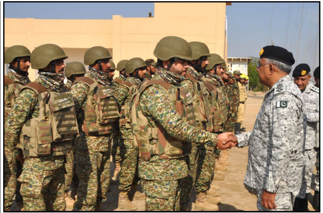
Chief of the Naval Staff Admiral Naveed Ashraf interacting with troops at forward post during exercise SEAPARK 2024.