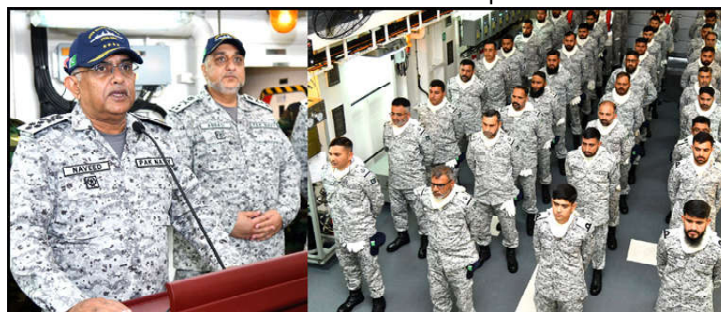
Chief of the Naval Staff Admiral Naveed Ashraf addressing the troops onboard PN ship during exercise SEASPARK 2024

In the meeting, Ishaq Dar, while giving a briefing on the joint meeting of the coordination committees of the PML-N and PPP, said, "There has been progress in matters regarding government formation, while the third meeting of the coordination committees will be held on Friday."