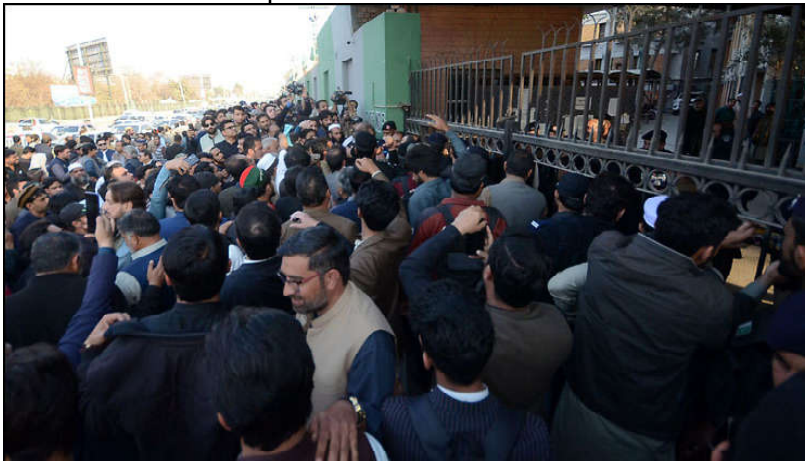
PESHAWAR: Supporters of the Pakistan Tehreek-e-Insaf hold protest on alleged rigging in the general election outside the Deputy Commissioner office.

filed by the accused and announced the verdict on completion of arguments by the defence counsel and prosecution. The National Accountability Bureau had filed a reference against Parvez Elahi and 13 others on the charges of "misusing authority and receiving kickbacks" in Gujrat's development projects. The bureau had accused the former chief minister and others of receiving Rs1.2 billion as kickbacks in 116 development projects.