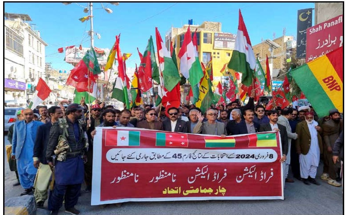
QUETTA: Members of Four-Party Alliance are holding protest demonstration against alleged rigging in General Election 2024, outside DC Office in Quetta.

Following a hike of Rs13.55 per liter in petrol prices from February 1, authorities are now contemplating an increase in the price of high-speed diesel.