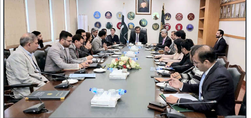
ISLAMABAD: Federal Minister for Interior Dr. Gohar Ejaz chairing a meeting on Integrated Sanitation and Water Supply System for Islamabad and Rawalpindi.

Minister for Information and Broadcasting Murtaza Solangi, who also attended the meeting, said improvement of groundwater level is very important.