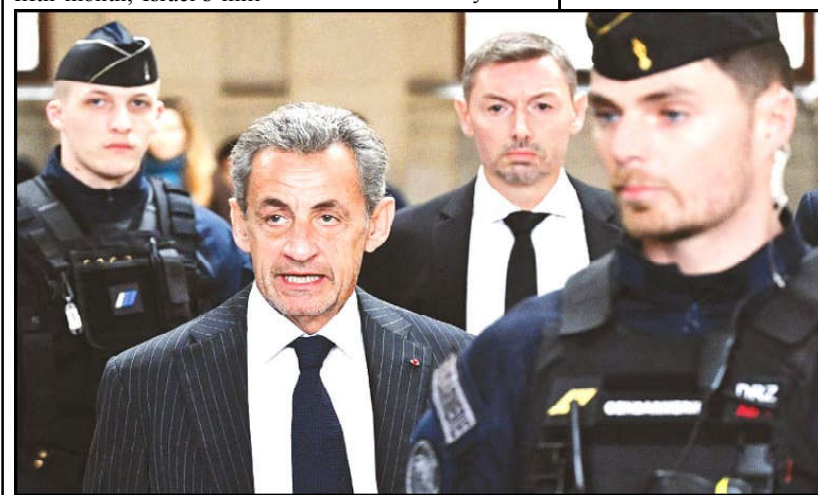
PARIS: Former French president Nicolas Sarkozy arrives for the verdict on his appeal in the so-called 'Bygmalion' case over illegal campaign financing.