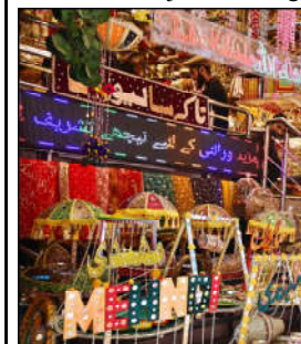
RAWALPINDI: A vendor displaying the different kinds of decorative stuff using during marriage ceremonies at his workplace.

the Motorway with connectivity options to Attock refinery, Chakpirona, and Faqirabad, completing the infrastructure supply chain from Karachi to Peshawar. This project may be called a flagship project spearheaded by FWO jointly supported by PSO and ISGS. The 477 km long pipeline aims to ensure a smooth supply chain of petroleum products from Karachi to Peshawar with an initial carrying capacity of 7 MTPA, extendable to 10 MTPA. The pipeline is expected to significantly reduce traffic congestion.