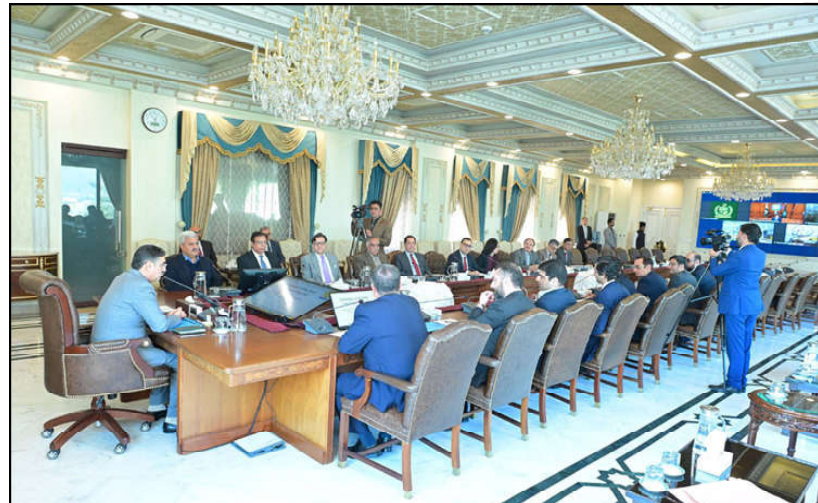
ISLAMABAD: A delegation of Pakistan Association of Large Steel Producers (PALSP) and Industrialists of KP led by Senator Noman Wazir call on caretaker Prime Minister Anwaar-ul-Haq Kakar.