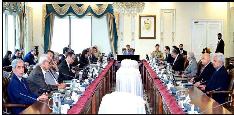
ISLAMABAD: Caretaker Prime Minister, Anwar-ul-Haq Kakar chairs a meeting of the Caretaker Federal Cabinet, in Islamabad.