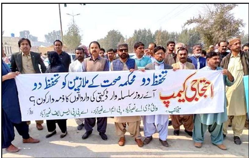
NASEERABAD: Members of Pakistan Medical Association (PMA) are holding protest demonstration for acceptance of their demands, held at Allahwala Chowk in Naseerabad.