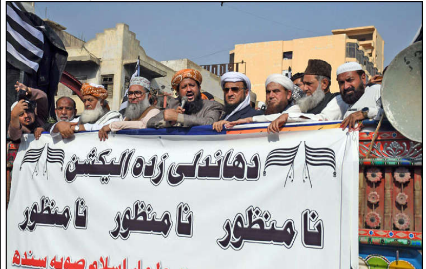
KARACHI: Supporters of Jamiat Ulema-e-Islam protest against alleged vote-rigging in some constituencies in the parliamentary elections, outside of the Pakistan Election Commission office, in provincial capital.

provided a comprehensive briefing on neighbourhood care/community policing and security measures in place at KATI. The IGP Sindh examined proposals to establish Korangi Industrial Area as a model zone for community policing and issued further directives accordingly. He announced the allocation of an additional 200 police personnel to enhance security at KATI, underscoring the importance of leveraging technology for robust security measures.