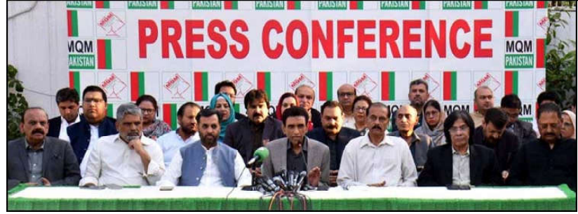
KARACHI: Muttahida Qaumi Movement (MQM-P) Convener, Khalid Maqbool Siddiqui along with other leaders and party workers addressing a press conference, at Bahadurabad Markaz in Karachi.