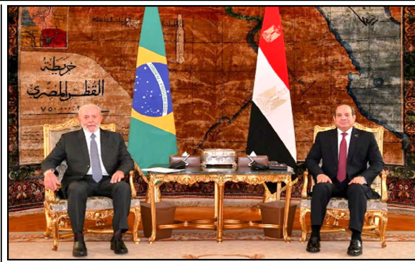
Egyptian President Abdel Fattah el-Sisi meets with Brazilian President Luiz Inacio Lula da Silva to discuss the latest developments in the Gaza Strip amid the ongoing conflict between Israel and the Palestinian Islamist group Hamas, at the Ittihadia presidential palace in Cairo, Egypt.