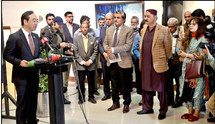
ISLAMABAD: The ambassador of Japan, WADA Mitsuhiro addresses the inaugural ceremony of the exhibition titled Yakishime Earth Metamorphosis organized by The Japan Foundation, Embassy of Japan in Pakistan with the collaboration of PNCA at Pakistan National Council of the Arts.