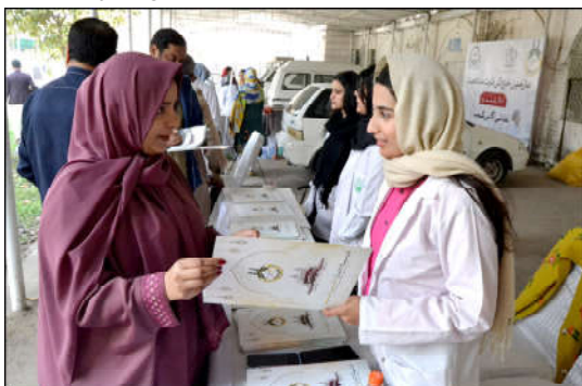
LAHORE: The pilgrims of Hajj are being guided with all possible efforts by the Ministry of Religious Affairs on the styles of medical camp and training camp in Hajj Camp.