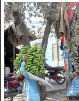
MULTAN: Labourers off-loading bunches of bananas from delivery truck at Fruit Market.