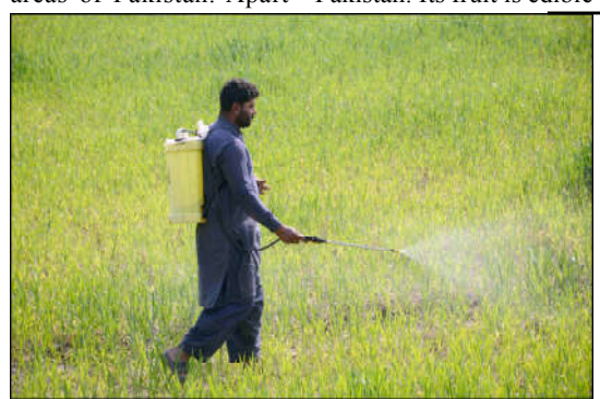
FAISALABAD: A farmer spraying pesticides on the crop to protect them from insects at his field.