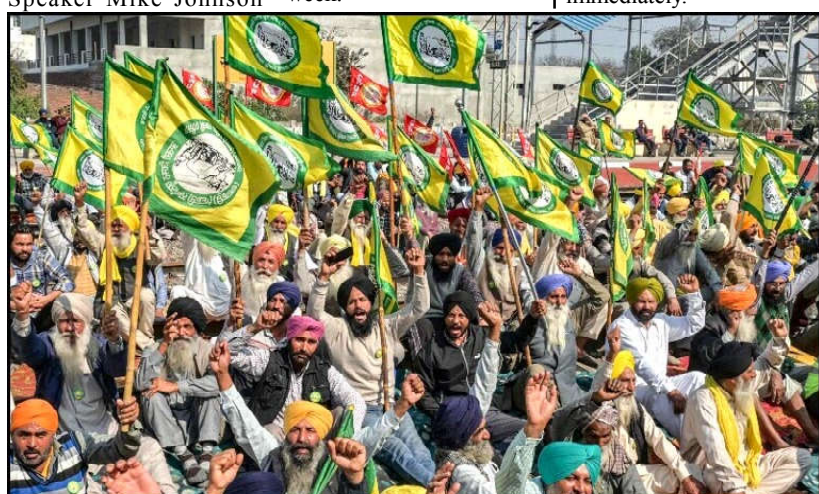
Members of the farm union Bharatiya Kisan Union (Ekta Ugrahan) block railway tracks and shout slogans during a protest to demand minimum crop prices at a railway station in Rajpura, India.

suffered last week when a similar effort fell short. Republican Representative Steve Scalise, who missed last week's vote while he received treatment for cancer, provided the deciding vote on Tuesday. Republicans hold a slim 219-212 majority in the House. "Secretary Mayorkas has willfully and consistently refused to comply with federal immigration laws, fuelling the worst border catastrophe in American history," John-son said following the vote. A poll last month showed that immigration was voters' No 2 concern, following the economy. No Democrat backed Tuesday's impeachment, while three Republicans — Representatives Ken Buck, Tom McClintock and Mike Gallagher — defied their leadership in voting 'no'. They also voted against impeachment last week.