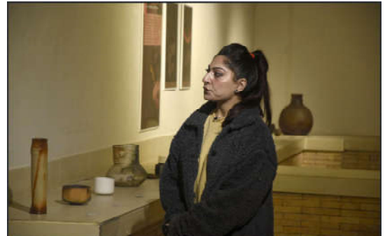
ISLAMABAD: A woman visitor take keen interest in pottery and ceramics during exhibition titled "YAKISHIME Earth Metamorphosis" at Pakistan National Council of the Arts, organized by embassy of Japan, in the Federal Capital.

Additionally, she pointed out that many beggar children, including young and teenage girls, are particularly vulnerable to child abuse, as well as various forms of crimes and harassment.