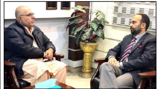
QUETTA: Caretaker Provincial Minister for Information Jan Achakzai meeting with Caretaker Home Minister Mir Muhammad Zubair Jamali

At first, Khan insisted that the US had him removed — a claim that the Joe Biden administration vehemently rejected. However, the ex-prime minister later shifted the blame to Gen Bajwa.