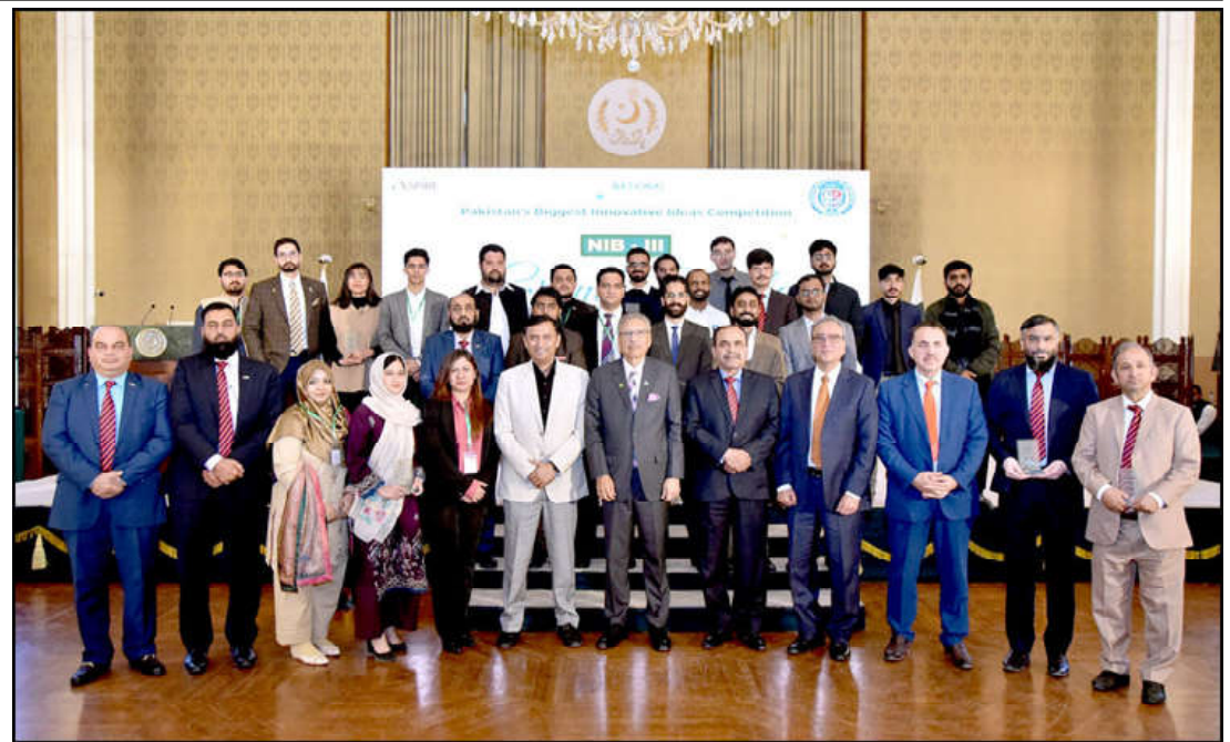
ISLAMABAD: President Dr Arif Alvi in a group photo with the winners and organizers of the National Idea Bank Season III, at Aiwan-e-Sadr.

policies to improve world ranking in other areas as well. He said some 26.2 million children were currently out of school across the country. The president pointed out that this area too needed proper attention as without developing human resource, the country could not compete with the world. He also raised questions about the validity of the recent polls, asserting that the introduction of electronic voting machines (EVMs) could have averted the chaos surrounding the election results.