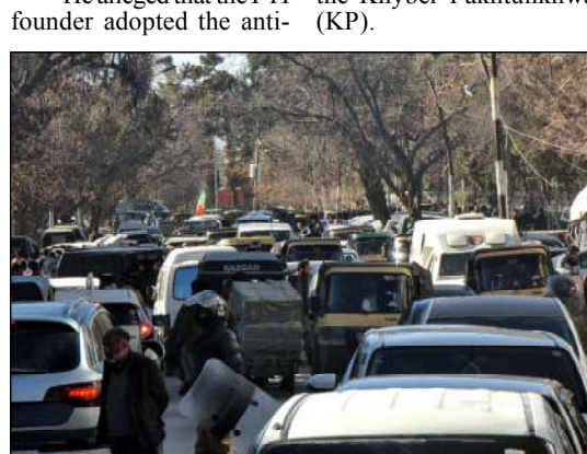
QUETTA: A large numbers of vehicles stuck in traffic jam due to negligence of traffic police staffs and illegal parking, in Quetta.