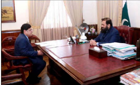
LAHORE: Ombudsman Punjab, Major (Rtd) Azam Sulaiman meeting with Governor Punjab Muhammad Balighur Rehman at Governor House.

expenditures. The launch of electric bikes can overcome the problems of exertion and would not take much time to reach their destinations, he added. E-bike supply program is a government pilot project aiming to capitalize on the market and promote electric bike usage in the country, he mentioned. Replying to a question, he said that in the first phase, we will distribute e-bikes through a balloting scheme facilitated by the Bank of Punjab. According to him, the province administration was tackling environmental issues and the public was welcoming the 'Green Wheels' program. Meanwhile, the students of Punjab also hailed the historic Punjab government's initiative and said that the Green Wheels program was taking place and marking a significant milestone in the province.