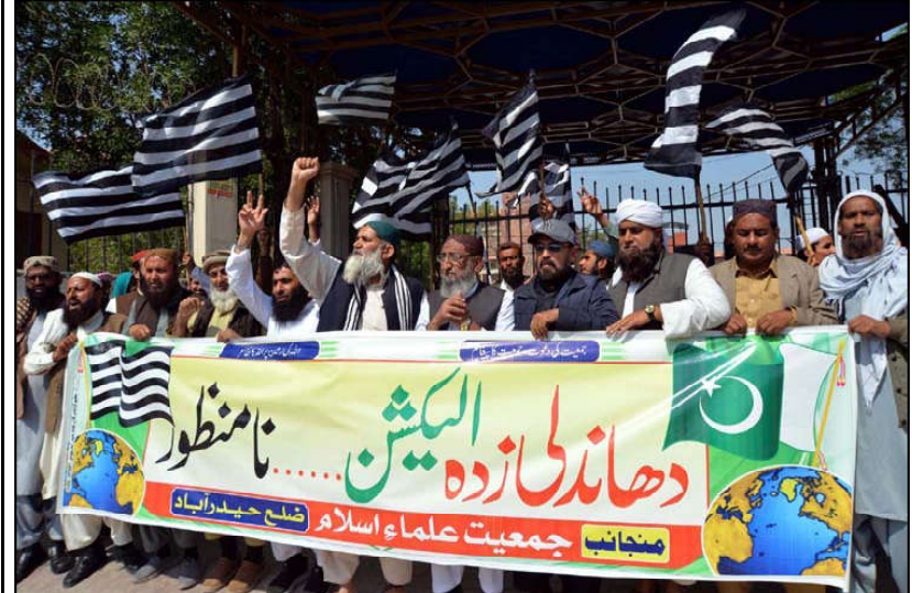
HYDERABAD: Activists of Jamiat Ulema-e-Islam (JUI-F) are holding protest demonstration against alleged rigging in General Election 2024, outside Shahbaz Building in Hyderabad.

ISLAMABAD (APP): At least four persons were killed and eight others seriously injured in a road accident on Wednesday when a truck overturned due to a tyre burst near the Motorway Sial Mor, Sargodha. According to a private news channel, people in the truck were going to Kot Momin when the accident occurred due to a tyre burst. The rescue officials reached the spot immediately after the incident. According to the police, four persons lost their lives on the spot while eight others were seriously injured, the dead bodies and injured have been shifted to Tehsil Headquarters Hospital.