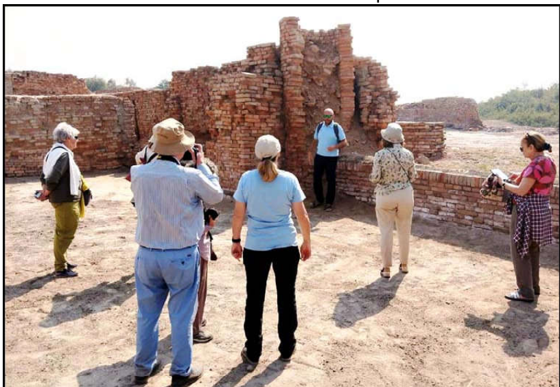
MOHENJO DARO: A tourist delegation from Italy and British are visiting and expressed keen interest in the historical ruins of the World Heritage Monuments of Mohenjo Daro.