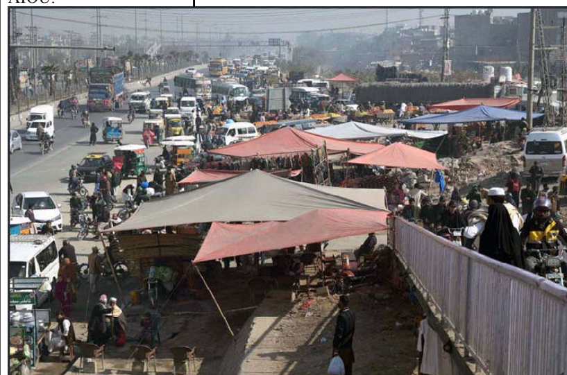
ISLAMABAD: A view of encroachment on road causing problems for traffic and pedestrians at Pirwadhai.