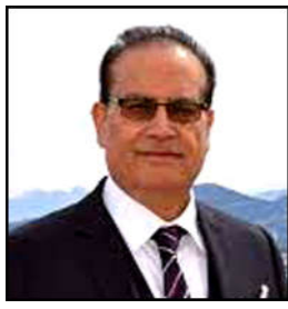
By Qamar Bashir Press Secretary to the President (Rtd); Former Press Minister at Embassy of Pakistan to France; Former MD, SRBC

It is only its disastrous mismanagement of the election process that is to blame for the growing controversy over rigging, not the media, which simply fulfilled its responsibility by acting as a check on the counting process. The government should accept this simple fact and move on.