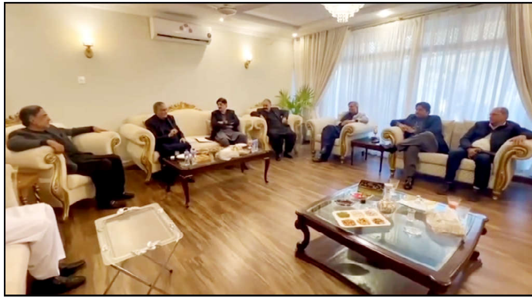
A view of consultative meeting of the nominated representatives of Pakistan Muslim League (N) and Pakistan People's Party held in Islamabad

PTI faces a challenge after the Election Commission of Pakistan (ECP) stripped the party of its "bat" symbol, compelling it to field candidates as independents who contested on various symbols. Consequently, despite securing seats in the provincial legislatures of Khyber Pakhtunkhwa, the PTI may not obtain reserved seats for women and minorities unless its members align with one of the parties that contested the recent elections.