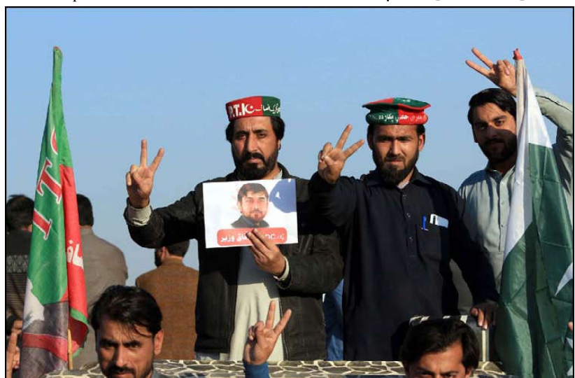
PESHAWAR: Activists of Tehreek-e-Insaf (PTI) are blocked road as they are holding protest demonstration against alleged rigging in General Election 2024, at GT road in Peshawar.

SUKKUR (APP): A five-day polio vaccination campaign will start on February 26, in which the polio vaccine will be administered to children up to the age of five. Deputy Commissioner (DC) Sukkur, Fayyaz Hussain Mahesar on Wednesday chaired a meeting in the committee room of his office to review arrangements. The meeting was attended by all concerned officers including representatives of the WHO, Roraty and Red EPI. The Deputy Commissioner Mahesar said that no child up to the age of five should be deprived of the polio vaccine during the anti-polio campaign. He emphasized the need for monitoring of members of mobile teams.