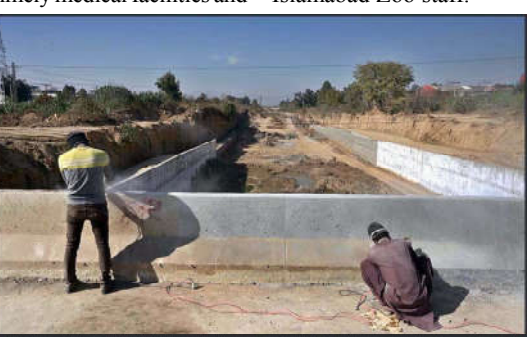
ISLAMABAD: Labourers busy in construction work of bridge on under construction 10th Avenue during development work in Federal Capital.

ISLAMABAD (Online): Islamabad High Court (IHC) has reserved judgment on the petitions seeking nullification of notification regarding success of candidates in NA-46, 47 and 48 after hearing the arguments. Chief Justice (CJ) IHC Aamir Farooq reserved the judgment after hearing the arguments. The CJ IHC remarked notification has come but if later the decision on petition pending in Election Commission (EC) comes different later then what will happen. Tribunals have not been constituted therefore, court is authorized to hear this case. According to petitioner final results were compiled despite stay order of EC. As per the petitioner EC issued order despite its own stay order. EC knew that the application is pending with it. The counsel for EC said EC had written in its order if consolidation has not been made then it should be stopped.