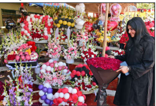
ISLAMABAD: A woman is buying red rose flower bouquet at flower market on Valentine's Day, in the Federal Capital.