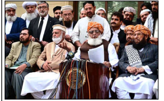
ISLAMABAD: President of Jamiat Ulema-e-Islam (F), Maulana Fazal Ur Rehman addresses a media talk at G-6/4.

The decision came in response to the joint request for a recount by the Pakistan Peoples' Party (PPP) and the National Party, highlighting the intensity and importance of the electoral contest in the region.