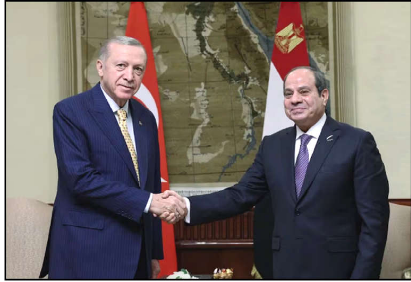
President Tayyip Erdogan meets with Egypt's President Abdel Fattah al-Sisi in Cairo, Egypt.