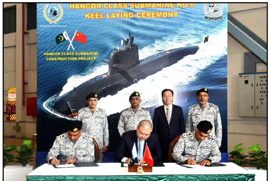
Officials of Pakistan Navy, Karachi Shipyard and China Shipbuilding & Offshore Intl signing the milestone certificate during Keel Laying Ceremony of 6th HANGOR Class Submarine at Karachi Shipyard

ISLAMABAD (Online): The important decision of PPP on the matter of formation of government has come to fore as the party has decided to take chairmanship of standing committees instead of ministries. Talking to private TV channel, PPP leader Syed Khurshid Shah has said we will take the committees of ministries which will be taken by PML-N. Committees are more powerful than ministries. He further said that we will take constitutional slots from PML-N, he added.