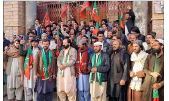
QUETTA: Activists of Tehreek-e-Insaf (PTI) are holding protest demonstration against alleged rigging in Election 2024, at Quetta press club.

ISLAMABAD (APP): Caretaker Federal Minister for National Health Services, Regulations and Coordination, Dr. Nadeem Jan Wednesday said that the provision of quality medical facilities to the public was a top priority of the government. Talking to a Private news channel, the minister said that the government was introducing health reforms to cover essential primary healthcare services and secondary-level hospital care. He said all possible resources were being utilized for lessening the economic burden and raising the living standard of deprived segments of society. He underlined that the remarkable initiative of the government will tangibly reduce the burden on hospitals and thus will improve the quality of service delivery across the health system. He said that the government also promoted a culture of research in the healthcare sector, adding that Pakistan needs more efforts towards providing high-quality, cost-effective healthcare. The government is committed to transforming the country's entire healthcare landscape, he said, adding that ultimate goal of the government was to use digital technology for harmonization and integration of health-related to improve the health status and well-being of our people. Replying to a question, he said that the public was the asset of a country and considering that the caretaker government was investing in human capital.