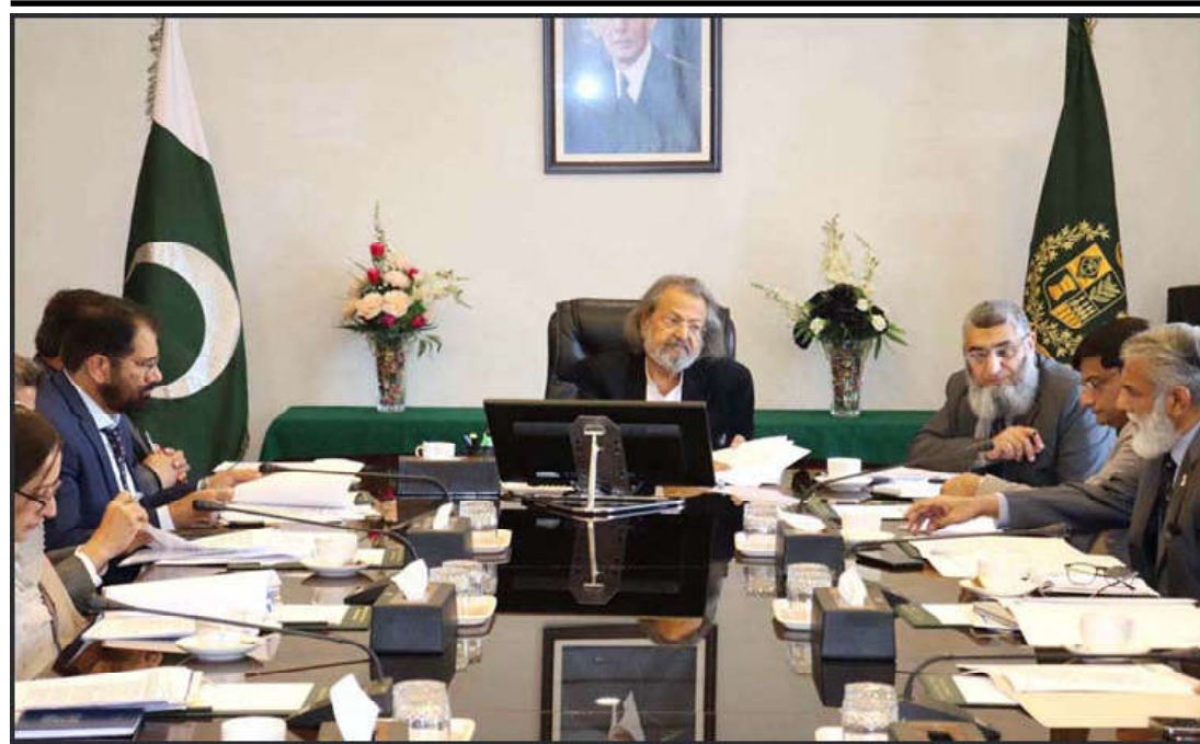
ISLAMABAD: Federal Minister Madad Ali Sindi chairs a meeting. The meeting was attended by DG FDE and senior representatives from HEC in addition with senior officials from Ministry of Education.