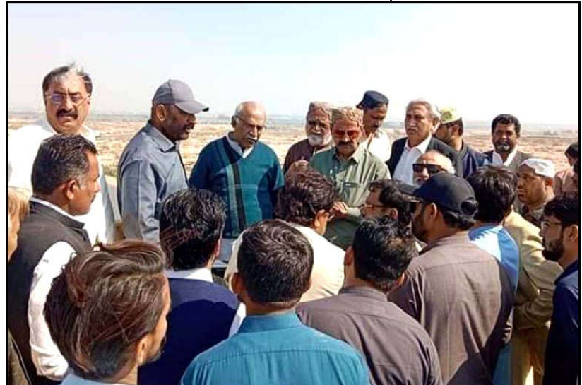
HYDERABAD: Grand Democratic Alliance (GDA) Leader, Safdar Abbasi inspecting the site for protest against alleged rigging in General Election 2024, in Hyderabad.