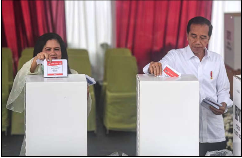
President Joko Widodo and First Lady Iriana cast their ballots at a polling station during the general election in Jakarta, Indonesia.

The prisoners have been detained by Hamas since Oct 7 to pressure Israeli forces to stop unending assaults on the people of Palestine.