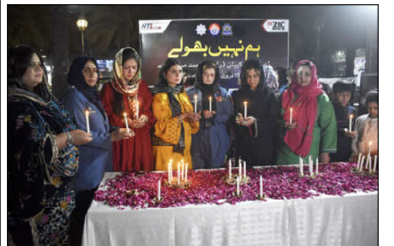
LAHORE: Women police and members of civil society lit candles during candle light vigil to pay tribute to the martyrs of police officers at Faisal Chowk, in the Provincial Capital.

appear in the court. One day exemption plea from attendance was filed on his behalf. The court accepted the plea. The court while summoning the arguments on the petition for permanent exemption of Hamza Shehbaz from attendance adjourned the hearing till March 12. Shehbaz Sharif and Hamza Shehbaz are charged with constructing nullah from national kitty. NAB Lahore has filed reference in AC Lahore.