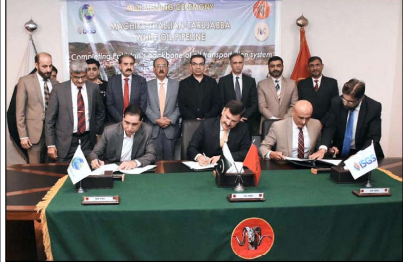
ISLAMABAD: The signing ceremony of MoU between the Stakeholders on Consortium Formation for Machike-Thallian-Tarujabba White Oil Pipeline Project at SIFC Secretariat, PM Office.

KARACHI (INP): Pakistan Muslim League-Nawaz leader and former Sindh governor Muhammad Zubair said that the Pakistan People's Party (PPP) will accept all key positions and will not take responsibility for anything. In an exclusive interview with a private TV news channel, Muhammad Zubair stated that there is no alternative for the PML-N other than accepting the conditions of the PPP, and the PML-N will attempt to include the PPP in the cabinet. He mentioned that without the cooperation of the PPP, a simple majority cannot be achieved for forming the government in the centre. Zubair stated that the PPP will only vote to elect the Leader of the House, and the Pakistan Tehreek-e-Insaf members will sit in the opposition.