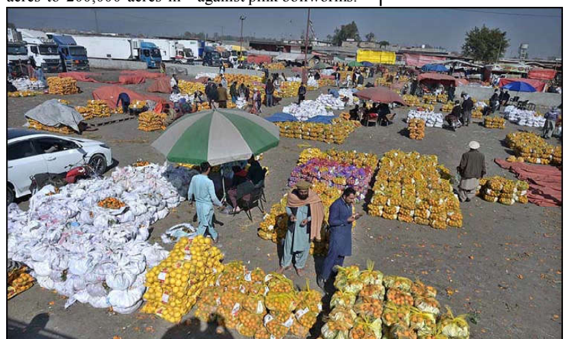
ISLAMABAD: Vendors displaying oranges to attract the customers at Fruit & Vegetable Market in Federal Capital.

hoods. In its continuous pursuit to community welfare, EDOTCO Pakistan also introduced the Occupational Health and Safety (OHS) school program, a pioneering step in promoting health and safety awareness. The program was piloted in Islamabad and the Manshehra District, reflecting the company's proactive stance in creating a safer and more health-conscious environment. Implemented initially at the Manshehra Public School & College in April 2023, and subsequently at the Pehli Kiran Schools.