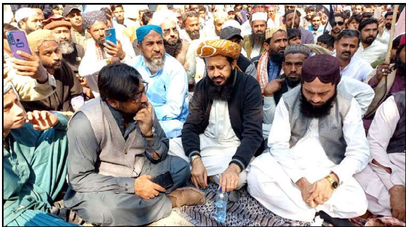
LARKANA: Activists of Jamiat Ulema-e-Islam (JUI-F) and Grand Democratic Alliance (GDA) are holding protest demonstration against the alleged rigging in General Elections 2024, in Larkana.

ing any religion and acts of hate and violence on the basis of religion or belief must be universally outlawed; The UN must make appropriate changes in its counter-terrorism architecture and sanctions regimes to cover new and emerging forms of terrorism like right wing and Islamophobic extremism and terrorism; Ensure that the fight against counter terrorism is not misused to violate human rights. Take action to stop the desecration of the Holy Quran, demolition of mosques, publication of blasphemous content, and allowing ethnic cleansing and mass murder of people of one particular faith. The UN General Assembly establish a body to promote the universal consideration and balanced implementation of all four pillars of the Global Counter Terrorism Strategy