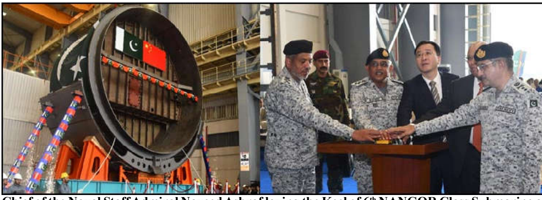
Chief of the Naval Staff Admiral Naveed Ashraf laying the Keel of 6th HANGOR Class Submarine at Karachi Shipyard.