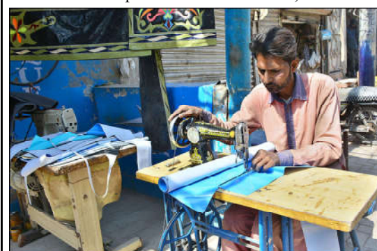
HYDERABAD: A tailor stitching an auto leather seat cover at his workshop.

uninterrupted power supply during the Holy month of Ramadan. Under this program, shutdowns were also availed on 500kV and 220kV transmission line circuits in the south region. During these shutdowns, he mentioned, the cleaning, washing of insulators, tightening of nut/bolts of line hardware and replacement of disc insulators with RTV coated Disc Insulators on Red, Yellow and Blue phases were carried out. The spokesman elaborated that a total of 73,493 disc insulators were washed/cleaned at 459 locations, 9,804 disc insulators were replaced at 55 locations, more than 688 braces and 570 nuts and bolts were installed, two damaged disc insulator strings (132kV C.B E5Q1 and E7Q1 C.B Yellow Phase).