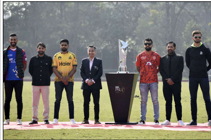
LAHORE: Captains of PSL teams poses with PSL-9 trophy during inauguration ceremony of PSL-9 in Provincial Capital.

glory. Mohsin Naqvi said: "It is a pleasure to announce that PSL is entering its ninth season, and I am proud to say that PSL continues to be a success story for Pakistan cricket. "Today, as we unveil this Orion trophy, we look forward to a month-long celebration of the beautiful game of cricket and the excitement and drama that accompanies it. "PSL connects to the hearts of people of Pakistan, who cherish every