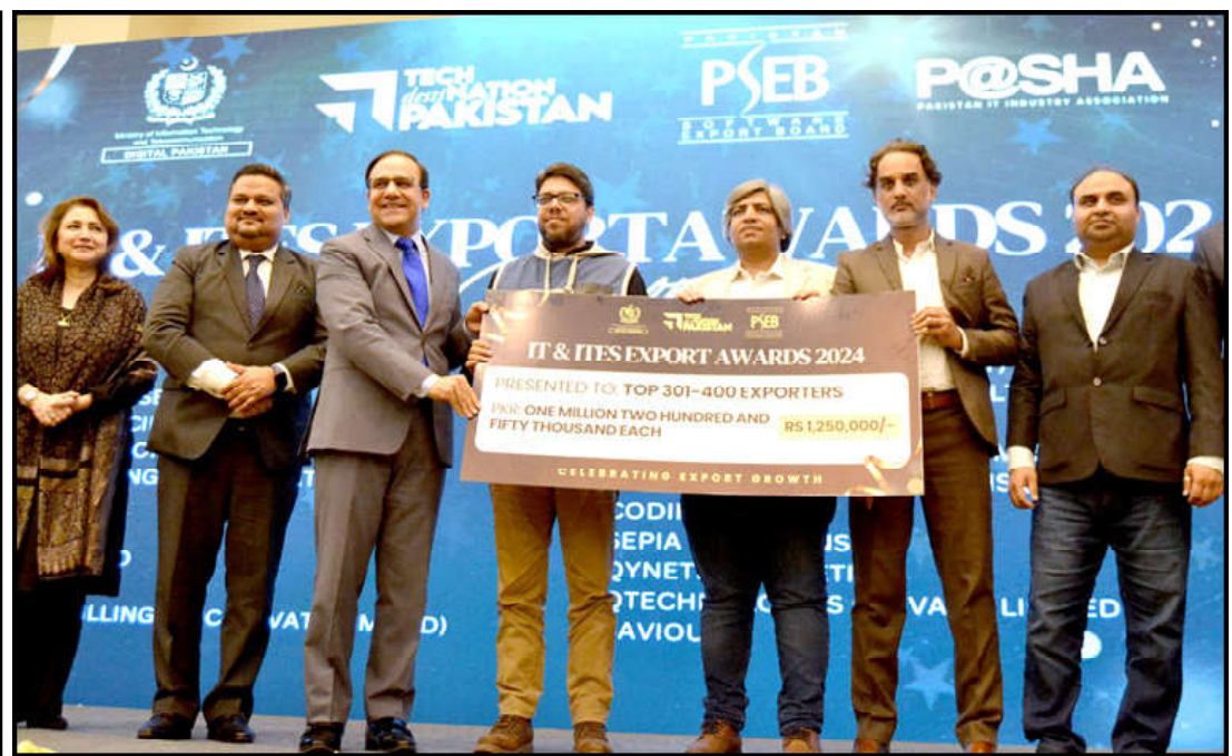
LAHORE: Federal Minister for IT and Telecommunication Dr. Umar Saif distributing cheques to position holder IT experts on the occasion of IT and ITES Export Awards 2024 ceremony.

duly recognised in Pakistan and internationally. Ambassador Sohail Mahmood noted that Pakistan has made significant strides in reducing absolute poverty, with rates dropping from 61.6% in 1998-99 to 21.5% in 2021-22. However, multidimensional poverty remains high at 39%, highlighting deprivation in health, education, and standard of living. Recent events, including the COVID-19 pandemic and floods, have exacerbated these challenges, particularly affecting rural communities where necessities are scarce. Shoaib Sultan Khan has been instrumental in addressing challenges and uplifting rural communities, particularly through his leadership in the Rural Support Program. Since 1982, he has played a transformative role in various impactful programs across Pakistan, India, and South Asia, positively impacting millions of lives. Shoaib Sultan Khan, while shedding light on poverty alleviation and the role of rural support programs, emphasized that Pakistan's rural support programs are among the oldest in the region. These programs are widely acknowledged for their success and have served as a model and inspiration for similar initiatives in South Asia, including India.