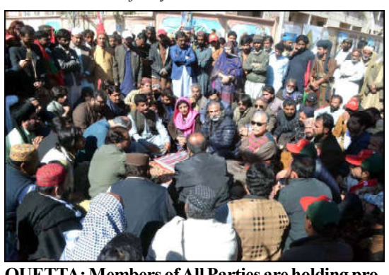
QUETTA: Members of All Parties are holding protest demonstration against alleged rigging in General Election 2024, outside DC office in Quetta.