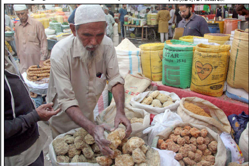
KARACHI: An elder vendor is selling Jiggery (Gur) at Lea Market in Provincial Capital.

ISLAMABAD (APP): Pakistan Railways has generated revenue worth over Rs 6.84 million through utilizing its 23 saloons and inspection coaches for commercial purposes, during the last four years. "At present, Pakistan Railways has only 23 saloons and inspection coaches with different dignitaries of the country who are entitled to use these saloons when needed," an official in the Ministry of Railways told APP. Giving the details, he said, "Two highly luxurious coaches have been allocated for the Prime Minister's Secretariat while four coaches have been allocated for the Minister for Railways, Secretary/Chairman of Railways, and another senior official in the ministry." The official said, "Only one saloon has been allocated to the federal government while one each has been allocated to the Governors of Sindh, Balochistan, Punjab, and the provincial governments." In addition, eight saloons had been allocated for the Railway.