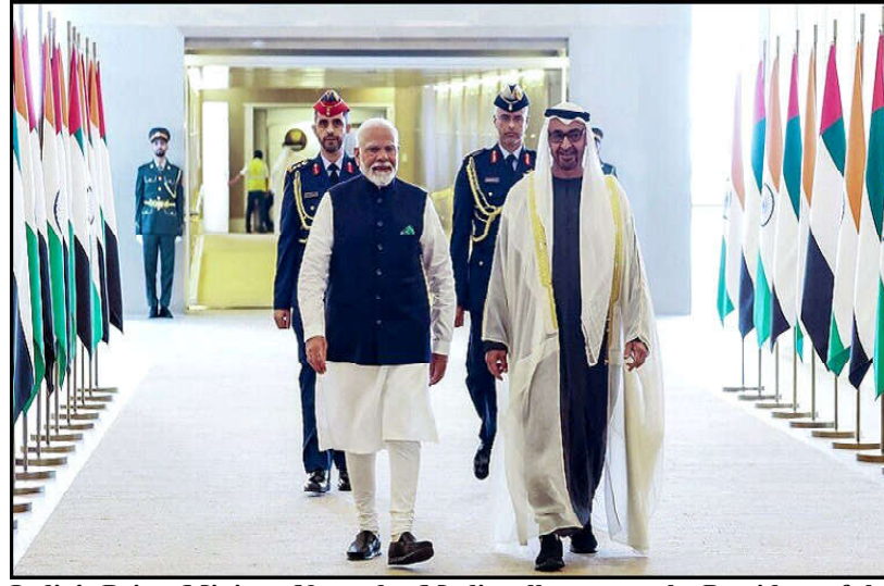
India's Prime Minister Narendra Modi walks next to the President of the United Arab Emirates Sheikh Mohammed bin Zayed Al Nahyan during a ceremonial welcome upon his arrival in Abu Dhabi for a two-day visit to the UAE.