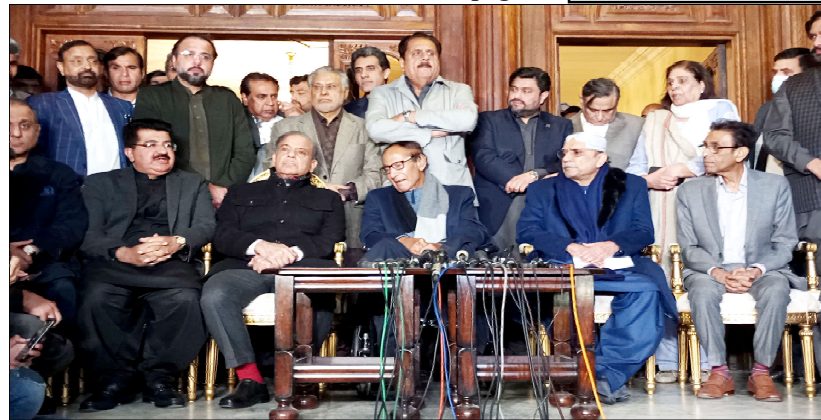
ISLAMABAD: President PML-N Muhammad Shahbaz Sharif, Co-Chairman PPP Asif Ali Zardari, President PML-Q Chaudhary Shujaat Hussain, MQM's Khalid Maqbool Siddiqui and BAP's Sadiq Sanjrani addressing a joint press conference