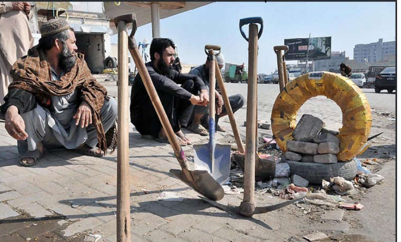
ISLAMABAD: Labourers along with their tools sitting on roadside waiting for clients to be hired for work during morning time at Khanna Pull.