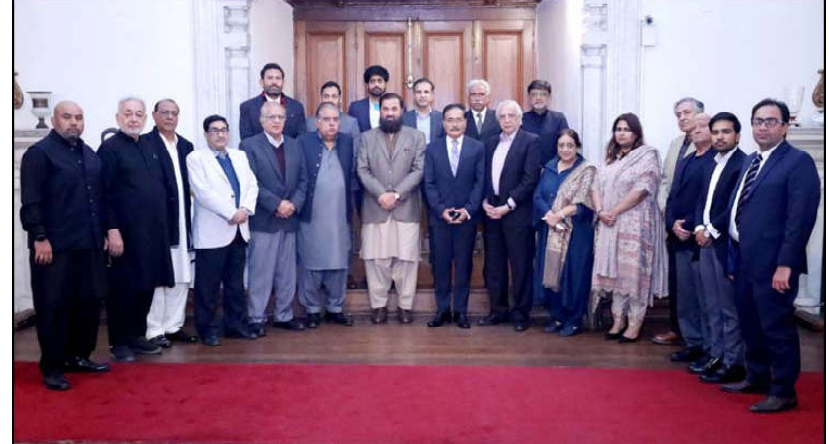
LAHORE: Governor Punjab Muhammad Balighur Rehman in a group photo with delegation of Pakistan Industrial and Traders Association Front (PIAF) at Governor House which led by Chairman (PIAF), Senator Zafar Iqbal Chaudhry.