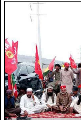
HUB: Members of All Parties are holding protest demonstration against alleged rigging in General Election 2024, in Hub.