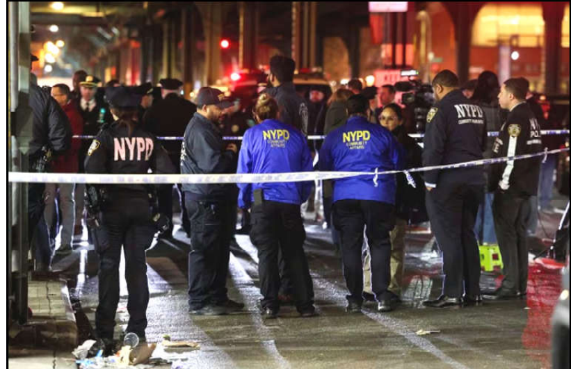
Members of the New York Police Department (NYPD) investigate the scene of a shooting at the Mount Eden Avenue subway station in the Bronx borough of New York City, U.S.