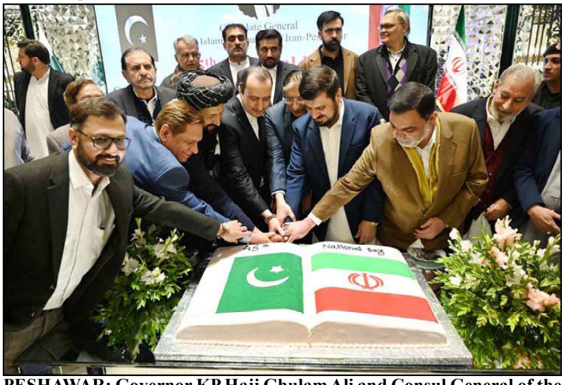
PESHAWAR: Governor KP Haji Ghulam Ali and Consul General of the Islamic Republic of Iran Ali Banafsheh Khah along with other officials cutting cake during 45th National Day of Iran last night.

revenue, budget, grants, and expenses. This system marks a significant step forward in streamlining campus management and ensuring that educational institutions comply with government quotas and regulations. Furthermore, Governor Haji Ghulam Ali also announced the imminent launch of an online complaint redressal mechanism. This platform also aims to offer swift responses to aggrieved students regarding quota issues within ten days and ensuring that grievances are addressed promptly and efficiently.