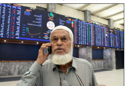
KARACHI: A stock broker watches share prices during a trading session at the Pakistan Stock Exchange (PSX) in the Provincial Capital.

ISLAMABAD (APP): The 100-index of the Pakistan Stock Exchange (PSX) turned around to bullish trend on Tuesday, gaining 161.61 points, a positive change of 0.26 percent, closing at 61,226.93 points against 61,065.32 points the previous trading day. A total of 435,549,576 shares valuing Rs 15,972 billion were traded during the day as compared to 349,975,051 shares valuing Rs 12,745 billion the last day. Some 355 companies transacted their shares in the stock market; 188 of them recorded gains and 139 sustained losses, whereas the share prices of 28 remained unchanged. The three top-trading companies were K-Electric Limited with 65,824,727 shares.