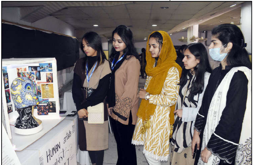
LAHORE: Students visiting on stall during All Pakistan science Technology Engineering and Math system exhibition at University of Engineering and Technology in Provincial Capital.