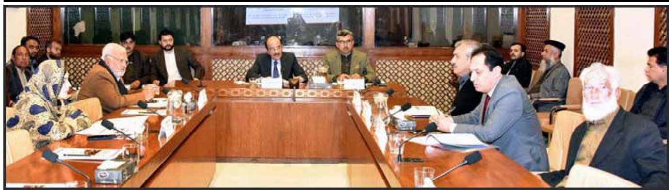
ISLAMABAD: Senator Kamil Ali Agha, presiding over a meeting of the Senate Standing Committee on Communications at Parliament House.