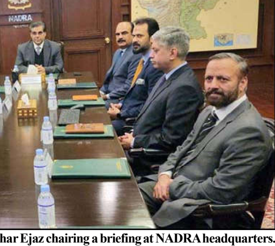
ISLAMABAD: Federal Minister for Interior Dr. Gohar Ejaz chairing a briefing at NADRA headquarters.