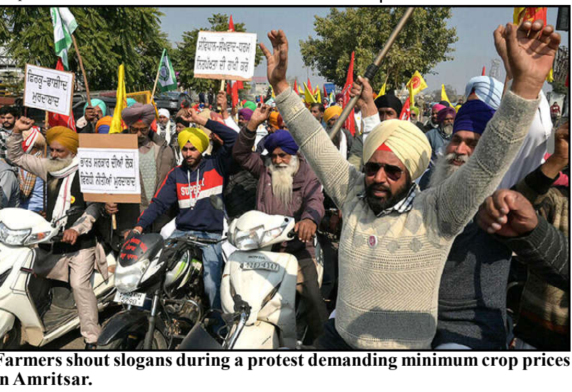
Farmers shout slogans during a protest demanding minimum crop prices in Amritsar.

BRUSSELS (Internews): Antwerp, one of Europe's biggest ports, said on Tuesday that there was disruption at the site due to protests from Belgian farmers - the latest in a series of European-wide demonstrations from farmers demanding better pay and working conditions. "Farmers' actions are causing major disruption in the Antwerp port area," said the port operator in an update on its website, adding there were blockades at five different locations in the area.