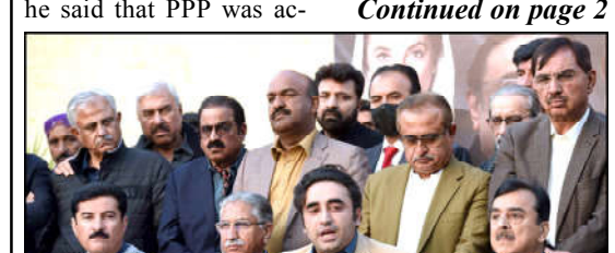
ISLAMABAD: Chairman of Pakistan People's Party (PPP) Bilawal Bhutto Zardari addresses a press conference.

He said the reality was that his party did not have a mandate to form the government in the federation, adding that the PML-N and the independents had greater numbers in the Centre. "I will not be putting myself forward for the candidacy of the prime minister," he said. Continued on page 2