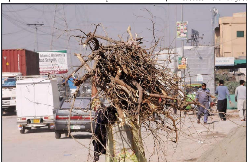
ISLAMABAD: Elder woman carrying dry wood branches on her head for domestic use.

When contacted, a senior official of the concerned authority said that the teachers are paid a specific amount for performing duties during the centralized exams of Class V and VIII. However these payments were pending with the AGPR.