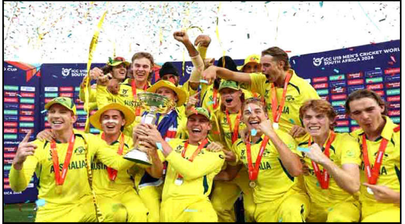
Australia Under-19 team pose for a photograph with the ICC Under-19 Men's Cricket World Cup 2024 trophy after beating India in the final