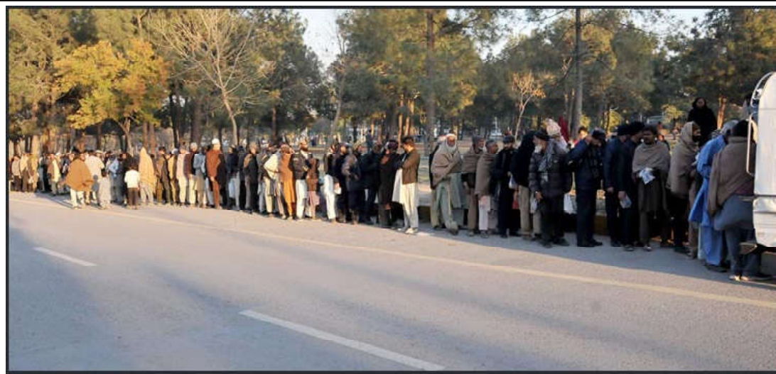
ISLAMABAD: A large number of people in queue to get free food at F-11.

He further said that Pakistan, being a victim of this menace, was against terrorism in its all forms and manifestations.