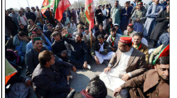
PESHAWAR: Supporters of the Pakistan Tehreek-e-Insaf (PTI) political party gather to protest as they allege rigging in the general elections, in Peshawar, Pakistan, 11 February 2024.