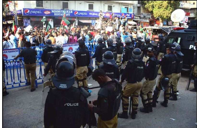
KARACHI: Police officials are standing high alert to avoid untoward incident during the protest demonstration of Tehreek-e-Insaf (PTI) against alleged rigging in General Election 2024, outside Provincial Election Commission Office in Karachi.