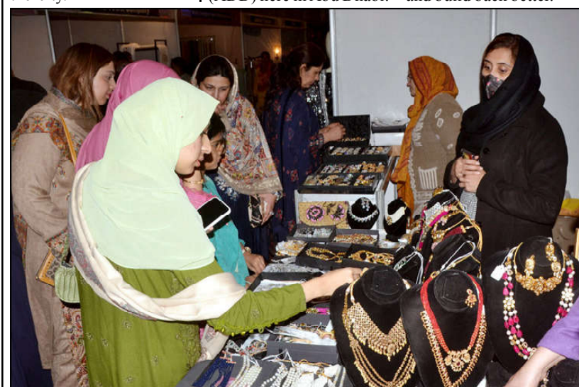
MULTAN: Visitors taking interest in the displayed stuff on a stall during the Bleu fair organized by the Women Chamber of Commerce.