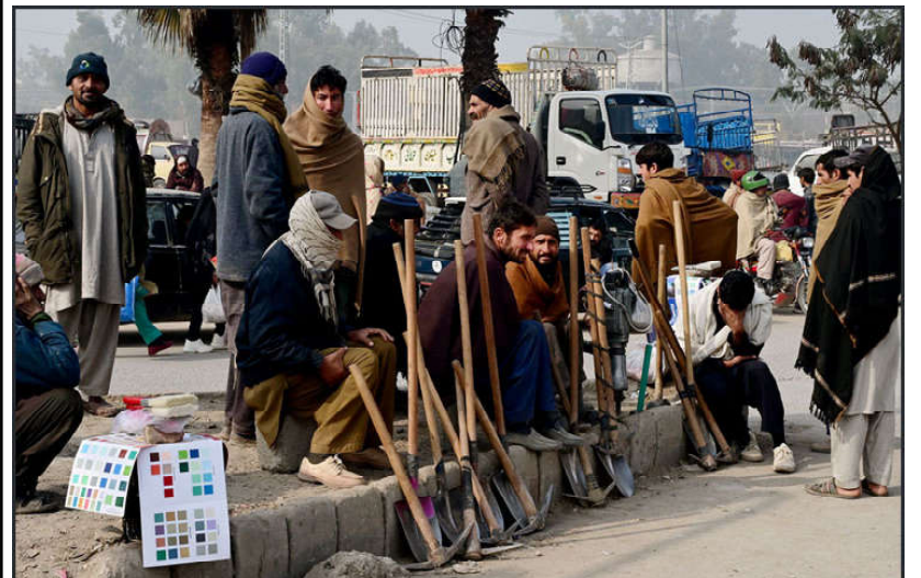
ISLAMABAD: Labourers along with their tools sitting on roadside waiting for clients to be hired for work during morning time.

ISLAMABAD (APP): Today (Sunday) is the sixth death anniversary of Asma Jahangir Advocate, great human rights champion. She died on February 11, 2018. Asma Jahangir, who was born on January 27, 1952, in Lahore, had earned numerous honours, including the Right Livelihood Award, Hilal-i-Imtiaz, Sitara-i-Imtiaz, Ramon Magsaysay Award, Martin Ennals Award for Human Rights Defenders, and the UNESCO/Bilbao Prize for the Promotion of a Culture of Human Rights.