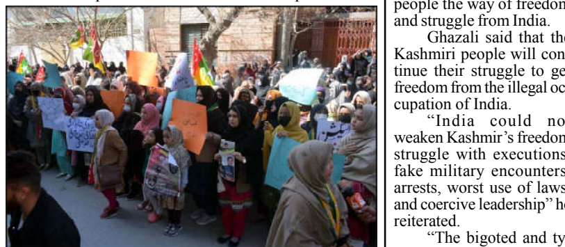
QUETTA: Activists of Hazara Democratic Party (HDP) are holding protest demonstration against rigging in General Election 2024, at Quetta press club.