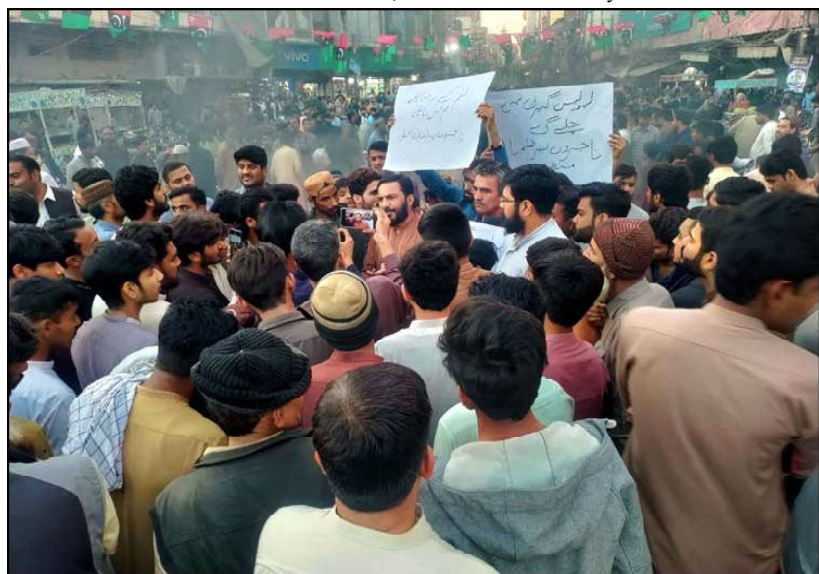
SUKKUR: Traders of Mobile Market are burn tires and blocked road as they are holding protest demonstration against high handedness of police, at Ghanta Ghar Chowk in Sukkur.