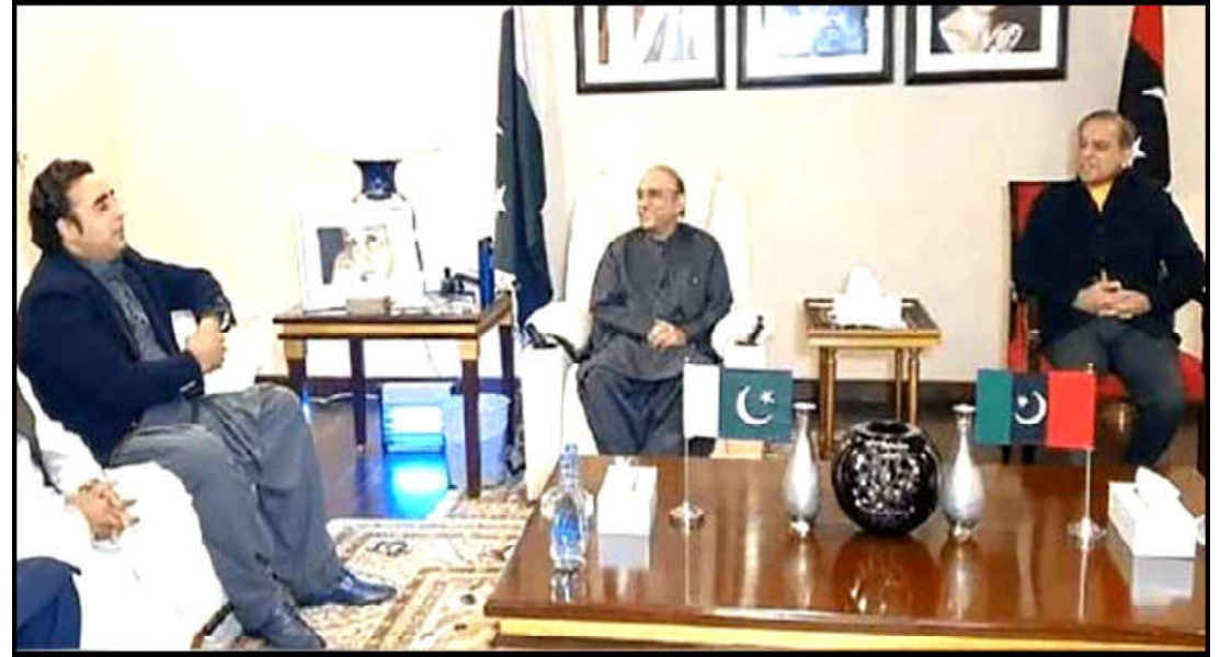
LAHORE: President PML (N) Muhammad Shahbaz Sharif meeting with Chairman Pakistan Peoples Party Bilawal Bhutto Zardari and Co-Chairman Asif Ali Zardari.

The statement added that key points of discussion included the assessment of Pakistan's overall situation, deliberations on future political strategies, and the exchange of recommendations aimed at promoting stability and progress across the board.