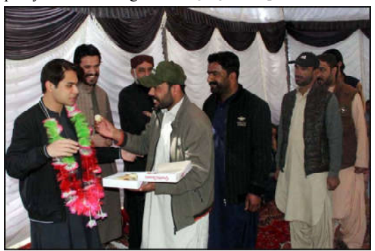
QUETTA: Nawabzada Jamal Khan Raisani celebrates with supporters after his victory in the General Election 2024, in Quetta.