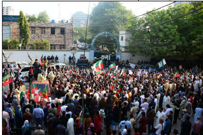
KARACHI: Activists of Tehreek-e-Insaf (PTI) are holding protest demonstration against alleged rigging in General Election 2024, outside Provincial Election Commission Office in Karachi.

day featured renowned Qawwals Saleem and Waseem Sabri. On the second day of the three-day festival, 32 sessions are lined up to explore diverse themes in art, literature, language, politics and poetry. On the third and final day, 35 sessions were scheduled, to pay tribute to prominent women from various fields. The festival reflected delving into world affairs, societal shifts, politics, literary nuances, linguistics, and events shaping different nations. On the final day, the international festival attracted rather bigger turnout as compared to the inaugural day. Faiz Foundation Trust Chairperson Salima Hashmi said told the audience that the title of the exhibition had been espoused from a line of a ghazal of Faiz Ahmed Faiz "Dil Na Umeed Tou Nahi.