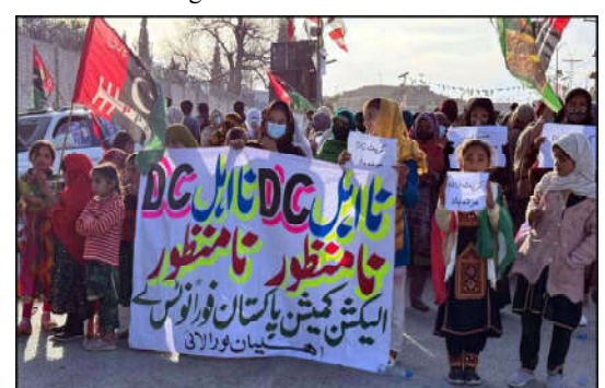
LORALAI: Activists of Peoples Party (PPP) are holding protest demonstration against alleged rigging in General Election 2024, outside DC Office.