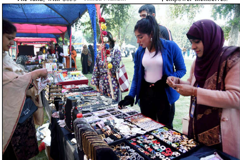
LAHORE: Women visiting stall during Faiz Mela at Al-Hamra.