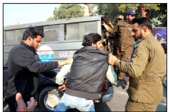
LAHORE: Police officials are arresting the workers of Tehreek-e-Insaf (PTI) who came to protest against rigging in General Election 2024, at Liberty Chowk in Lahore.