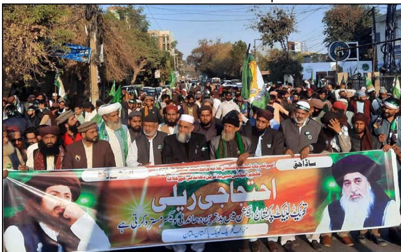
MULTAN: Activists of Tehreek-e-Labbaik (TLP) are holding protest demonstration against alleged rigging in General Election 2024, in Multan.

role in the formation of a coalition government in centre after winning 17 NA seats and 28 seats in Sindh Assembly, he said. Similarly, six seats in the National Assembly, 22 seats in Punjab, 3 in Sindh and 5 seats in Balochistan have been clinched by independent candidates while JUIF bagged four seats in National Assembly, 10 seats in Balochistan and eight seats in KP. PMLQ has bagged three seats in National Assembly and 7 seats in Punjab Assembly while two each NA seats of Istehkam Pakistan Party and Balochistan National Party will also matter in coalition government.