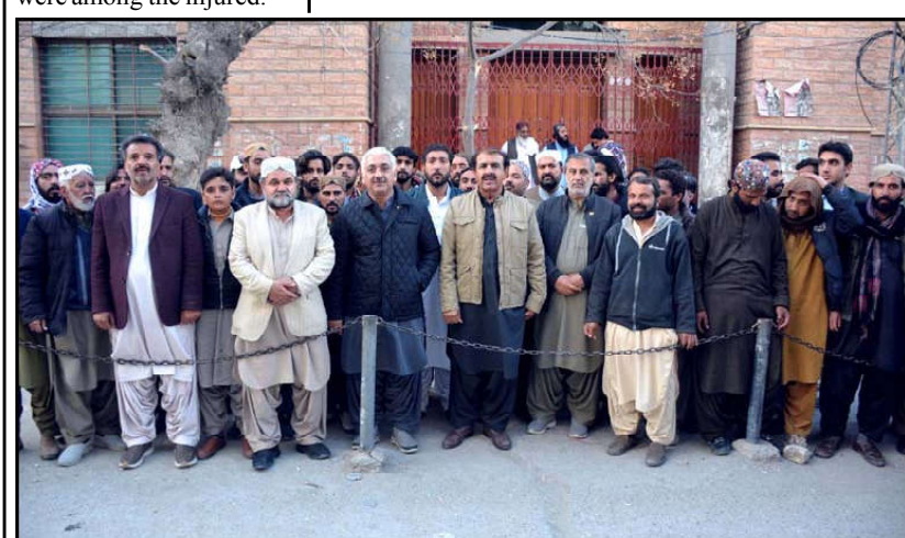
QUETTA: Activists of Balochistan National Party holding a protest against alleged rigging in the general elections.

"Sanitization operation is being conducted to eliminate any other terrorist found in the area. Locals of the area appreciated the operation and expressed their full support for the security forces to eliminate the menace of terrorism," the ISPR said.