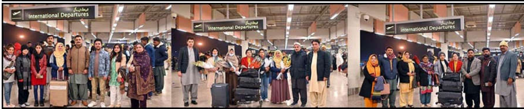
First set of Pakistanis among batch of 600 start Overseas Careers post landmark agreements by Ministry of Overseas Pakistanis and Human Resource Development.