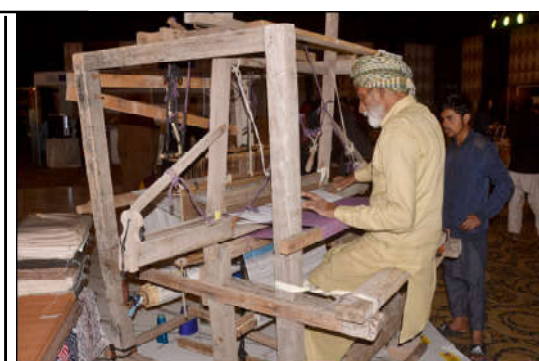
MULTAN: An artisan demonstrating his skills during the Bleu fair organized by the Women Chamber of Commerce.