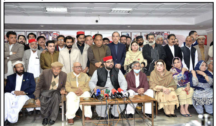
PESHAWAR: President Awami National Party (ANP) Aimal Wali Khan along with other party leaders addressing a Press conference at Bacha Khan Markaz.

To a query about delay in results of some constituencies of the province, the Minister maintained that the delay in results was caused mainly due to the play in areas and logistic issues. He said that results of elections are declared late because of the logistic issues.