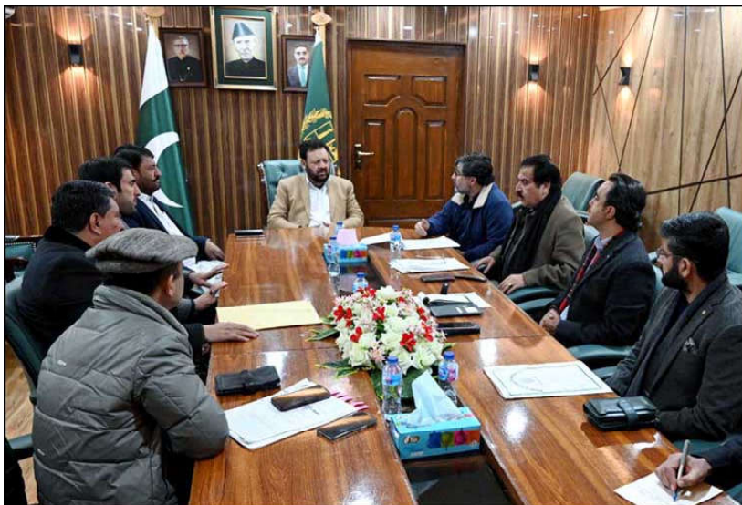
GILGIT: Chief Minister Gilgit-Baltistan Haji Gulbar Khan presiding over the meeting regarding the Chitral Express way at CM Secretariat.