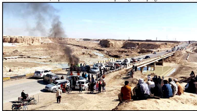
QUETTA: Activists of Jamiat Ulema-e-Islam (JUI-F) are burning tires and blocked road as they are holding protest demonstration against alleged rigging in General Election 2024, at Syed Hameed Crossing Bridge located on Qila Abdullah area of Balochistan.