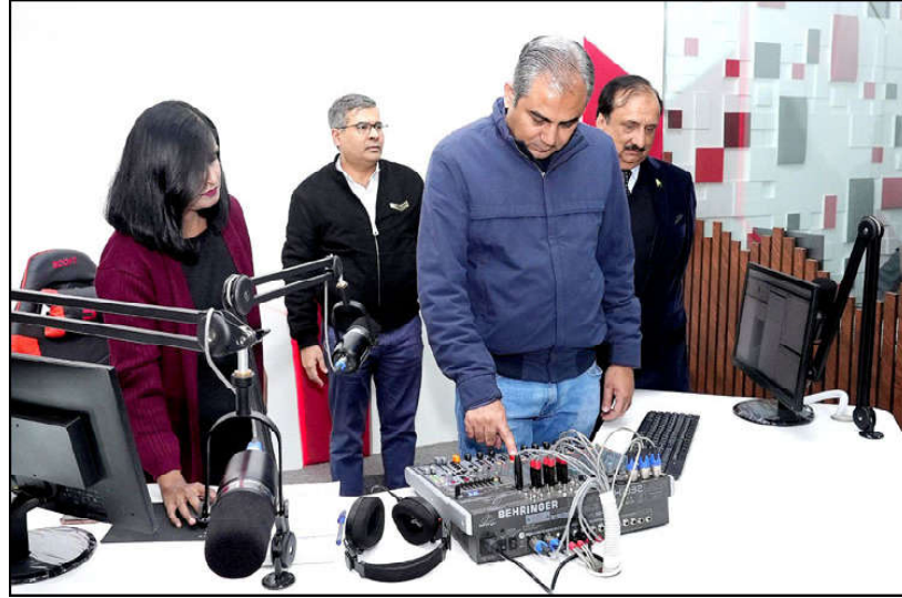
LAHORE: Caretaker Chief Minister Punjab Mohsin Naqvi inaugurates FM Radio "Sehat Zindagi" during his visit to Primary and Secondary Healthcare Department.

health sector. Naqvi apprised that various hospitals had been upgraded in a short span of time while upgradation of few other hospitals was in their final phases of completion. The hospitals which have not been upgraded yet, would be upgraded in the next phase. The CM said, "We have provided non-available facilities in the hospitals. We will arrange new operation theatres, MRI machines and other facilities in collaboration with the private sector." The CM also inaugurated Human Resource Information and Management System (HRIMS), Health Information and Service Delivery Unit (HISDU). He inaugurated the van especially being prepared for the video link along with the coaster project.