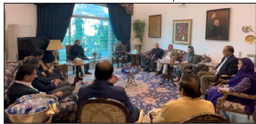
LAHORE: A delegation of MQM Pakistan meeting with PML-N Quaid Muhammad Nawaz Sharif and President Shahbaz Sharif.