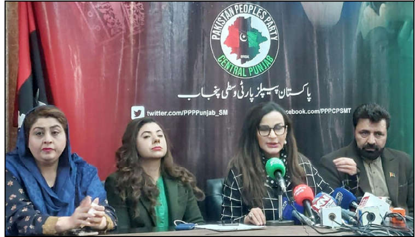
LAHORE: Senior leader of PPP Sherry Rehman addressing a press conference.