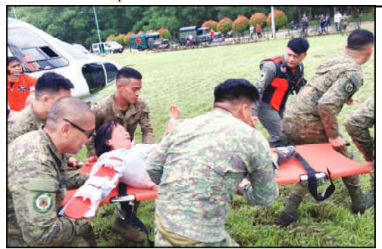
TAGUM (Philippines): Soldiers transfer an injured person to a hospital after evacuation from Maco region which was hit by landslides.