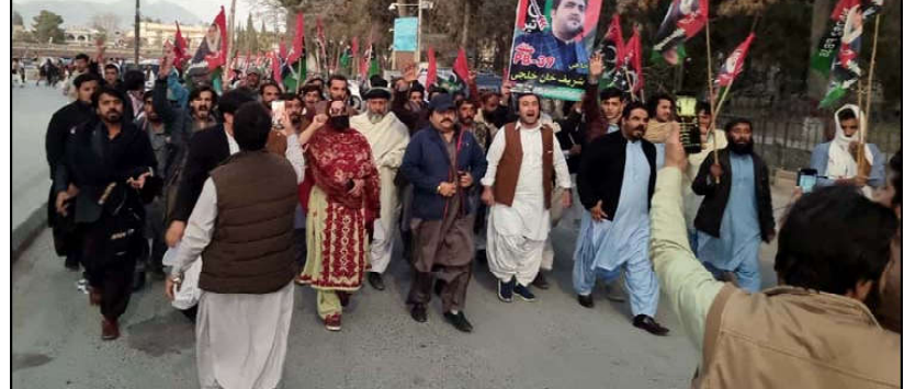
QUETTA: Activists of Peoples Party (PPP) are holding protest demonstration against rigging in General Election 2024, outside DC Office in Quetta.

disputable proof of his triumph and decried the alleged rigging as unprecedented. Expressing concern over the apparent theft of the people's mandate, Basharat urged the Election Commission of Pakistan to intervene promptly. He warned against the excessive declaration of successful candidates as unsuccessful by returning officers, emphasizing the need to uphold electoral integrity. In the broader context of post-election developments, independent candidates have emerged as the frontrunners in the National Assembly, surpassing established parties like the Pakistan Muslim League-Nawaz (PML-N) and the Pakistan Peoples Party (PPP).