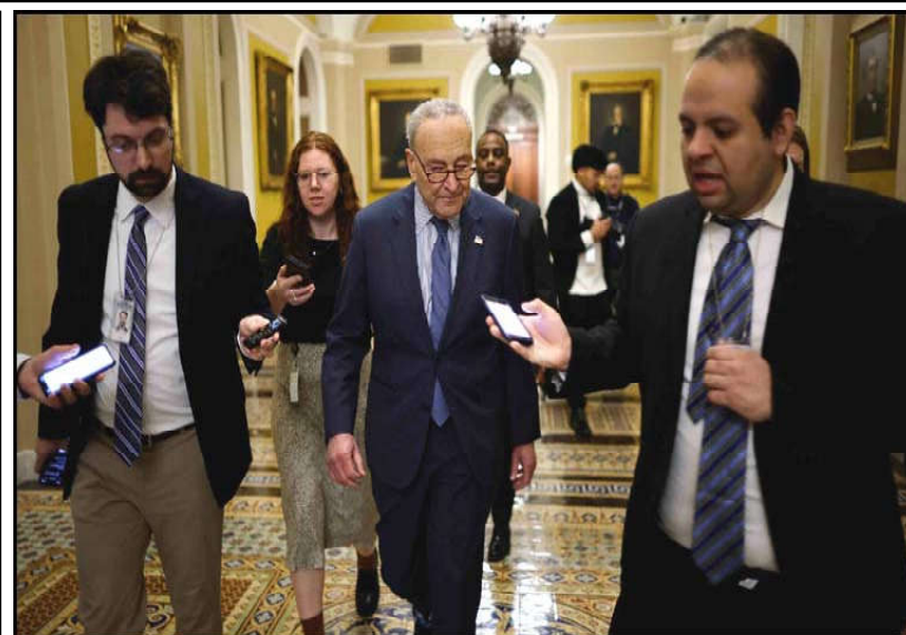
US Senate Majority Leader Charles Schumer (D-NY) talks to reporters as he walks to his office at the Capitol in Washington, DC.

1967 war: the West Bank including East Jerusalem, and the Gaza Strip. The statement added that "Israeli aggression" against the Gaza Strip must also stop and Israeli forces must withdraw from the territory. The United States had led months of diplomacy to get Saudi Arabia to normalise ties with Israel and recognise the country until the Gaza crisis began in October, leading Riyadh to shelve the matter in the face of Arab anger over Israel's offensive. This news agency reported last week that Saudi Arabia would be willing to accept a political commitment from Israel to create a