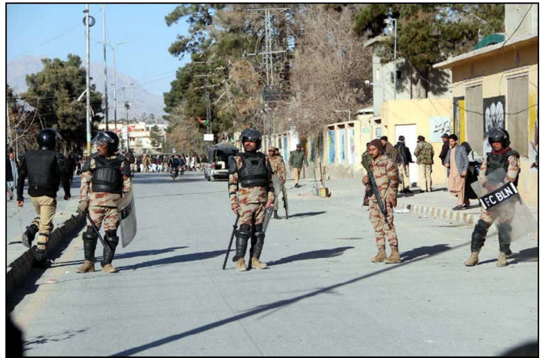
QUETTA: Security officials are standing high alert to avoid untoward incident during the protest demonstration different political party against rigging in General Election 2024, outside DC Office.

crucial dual role as both a place of worship and a Madrasah for students, as well as housing the sacred resting place of revered figures. "The construction and consecration of the 'Ram Temple' at the site of the demolished Babri Mosque in Ayodhya, followed by the recent incident at the Akhoni mosque, underlines the critical need for the swift implementation of the Secretary-General's Action Plan on the Protection of Religious Sites. "We request you to accelerate efforts to address this urgent matter, ensuring the safeguarding of religious sites in India.