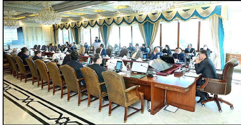
ISLAMABAD: Caretaker Prime Minister Anwaar-ul-Haq Kakar chairs a meeting of the Federal Cabinet.

Earlier, workers warmly welcomed PML-N Quaid on his arrival at party's secretariat in model town.