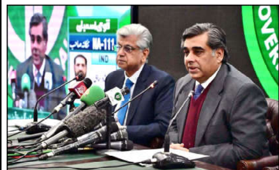
ISLAMABAD: Caretaker Federal Minister for Information Murtaza Solangi and Caretaker Interior Minister Gohar Ejaz addressing a press conference at PID Media Center.