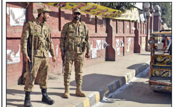
LAHORE: Park Army soldiers stand alert outside a polling station during the country's parliamentary elections, in the Provincial Capital.

ISLAMABAD (APP): A delegation of Commonwealth observers expressed satisfaction with the transparency of the polling process in Pakistan on Thursday. Ahead of the elections, various observers, journalists, and stakeholders invited by the Election Commission of Pakistan from abroad have begun assessing the voting situation. A 25-member Commonwealth Observers Group visited various polling stations in Islamabad, including those in constituency NA-47. Speaking to the media, the head of the Commonwealth observer group said that they are satisfied with the polling process for the general elections. In response to a question, the head of the delegation, Dr. Goodluck Jonathan, said that elections and voting processes have historically