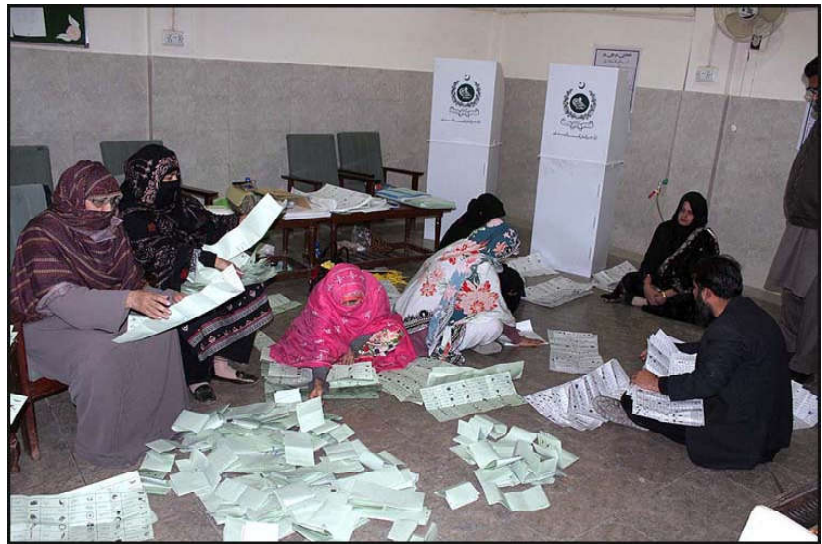
QUETTA: Polling staff counting votes in a polling station at Postal Colony during General Elections-2024.

Mobile service was suspended partially in different areas of the country including Islamabad due to security threat on the occasion of general election 2024.