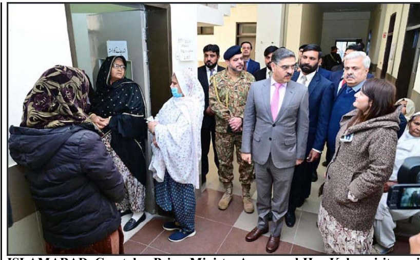
ISLAMABAD: Caretaker Prime Minister Anwaar-ul-Haq Kakar visits various polling stations for the General Elections 2024 in Islamabad and Rawalpindi.

The ISPR stated that the armed forces alongside other law enforcement agencies (LEAs) are proud to have played a pivotal role in providing security during the conduct of the sacred electoral process.