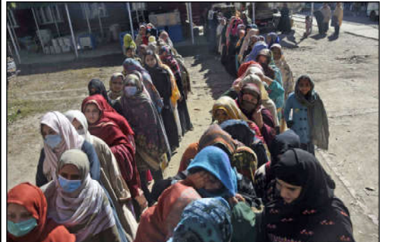
RAWALPINDI: A large number of women stands in a queue wait their turn to cast their vote outside a polling station during Pakistan's national elections in the city. Millions of Pakistanis began voting February 8 in an election marred by allegations of poll rigging, with the country's most popular politician in jail and a military-favoured candidate tipped to win.