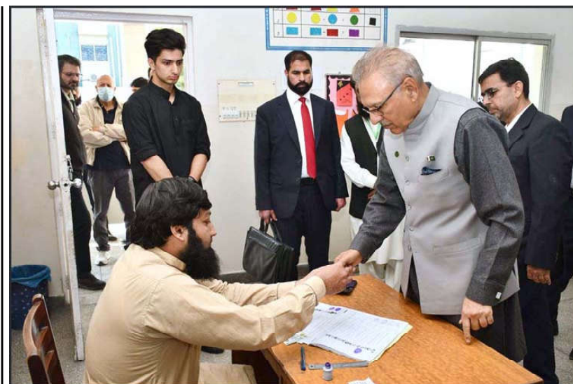
KARACHI: President Dr. Arif Alvi being marked his thumb before issuing ballot paper in polling station during General Election-2024.

Ukraine or the preoccupation of the Western world with China as a competitor, as a challenger to the existing order, and so on," Masood Khan said. "Now, in addition to Ukraine and the Indo-Pacific politics, you have the Middle East." "So, Kashmir is no more on the radar screen of the international community, and yet the oppression continues there," he added. "So, I've always said this is a blind spot, and this is very dangerous, this is very perilous for the international community because the Kashmiris' freedoms are as sacrosanct as the freedoms of any people in any part of the world." Pakistani officials have also often drawn connections between the Kashmir dispute and the Israeli-Palestinian conflict, owing to some common historical roots, it was pointed out. Masood Khan too referenced these commonalities, but also the "dissimilarity" as well, noting particularly how Palestinians, despite their ongoing struggle for self-determination, have garnered global support and even observer status at the United Nations.