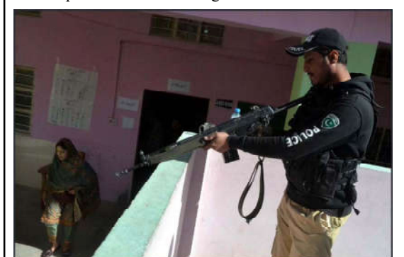
QUETTA: Security officials are standing high alert to avoid untoward incident as security has been tightened at a polling station during General Election 2024.

ISLAMABAD (INP): Pakistan Tehreek-e-Insaf (PTI) Spokesperson has strongly condemned the suspension of internet and mobile services throughout the country on polls day, reflecting a small measure of fear that the power-wielders and their side kicks in the government are suffering from. PTI Spokesperson, in his strongly-worded statement, blasted the Election Commission of Pakistan (ECP) for its inability and failure to ensure transparency and credibility of the elections. He demanded that mobile phone and internet services should be restored immediately across the country and people should be allowed to exercise their constitutional and fundamental right to vote, as the ECP's 8300 SMS service also became unavailable due to the suspension of mobile services. PTI Spokesperson continued that suspension of mobile phone and internet services on election day was part of the systematic conspiracy to deprive people of their constitutional right to vote by reducing voter turnout after sensing an overwhelming and historic turnout in general elections.