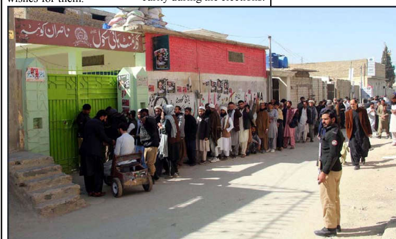
QUETTA: Voters are in queue waiting to cast their votes at a polling station during General Election 2024.

ISLAMABAD (APP): Chief Election Commissioner (CEC) Sikandar Sultan Raja expressed his gratitude and congratulations to the nation for the successful conduct of the election. In a special message, he thanked the people of Pakistan for fulfilling their constitutional and national responsibility, state news channel PTV reported. Sultan Raja extended his appreciation to all stakeholders involved in the electoral process, including federal and provincial caretaker governments, political parties, security agencies, police, civil administration, Pakistan Army.