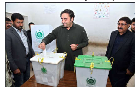
LARKANA: Chairman PPP Bilawal Bhutto Zardari casts his vote in Shaheed Major Mujahid Mirani Government Boys Primary School Polling Station Naudero in the constituency NA-194 and PS-10 during General Elections-2024.

He stated people should come out of homes