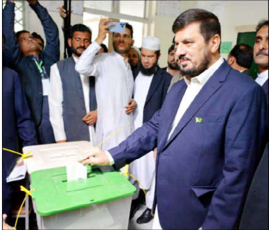
PESHAWAR: Khyber Pakhtunkhwa Governor Haji Ghulam Ali casting his vote during General Election 2024.

KARACHI (APP): Sindh Governor Kamran Khan Tessori, has congratulated the local administration and law enforcement agencies (LEAs) for playing their effective role in holding peaceful elections 2024. The Governor monitored the election process throughout the day, and was also in touch with the LEAs and administration, said a spokesperson of the Governor's house here on Thursday. He lauded the role of the Election Commission of Pakistan (ECP), for conducting the elections in a peaceful environment. He said the media had also played vital role for excellent coverage of the polling process. He said that the overall peaceful conduct of the elections in the province is the result of joint efforts of all the stakeholders. He said the voters also deserve appreciation who exercised their right to vote for their favourite candidates. He hoped that next elected government would resolve the problems of the masses of this country.