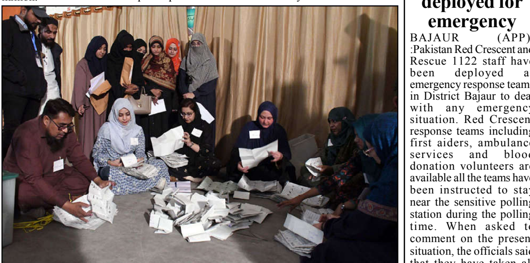
KARACHI: Members of polling staff start counting the votes after the polls closed for parliamentary elections, in the Provincial Capital.

ABBOTTABAD (APP): To ensure transparency and oversight, foreign observers, Commissioner Hazara Division Syed Zaheer-ul-Islam, and Deputy Commissioners from all districts visited polling stations to assess the voting process. The law enforcement agencies, particularly the police department, implemented stringent security measures, contributing to the maintenance of peace and order at the polling stations. In addition to the presence of over 3,000 policemen in Abbottabad and more than 2,400 in Haripur, security duties were effectively carried out by the Pakistan Army and FC. The general elections process in Hazara Division on Thursday concluded peacefully without any incident. The election commenced at 8:00 AM, and polling stations across the eight districts of Hazara remained operational until 5:00 PM, ensuring a smooth electoral process. A total of 2,862 polling stations were established throughout the division where 3,430,456 male and female voters exercised their right to vote. No untoward incidents were reported from any polling station, indicating a peaceful atmosphere conducive to democratic participation.