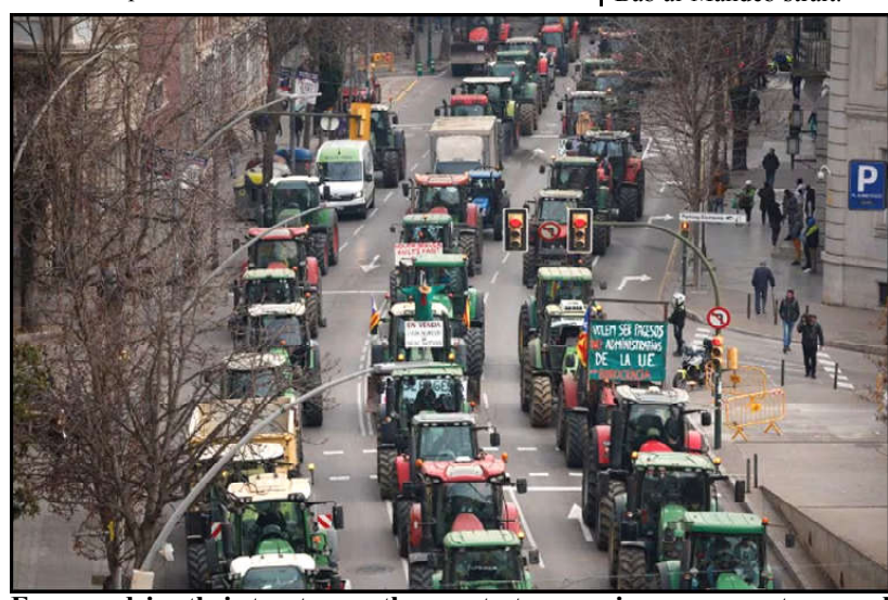
Farmers drive their tractors as they protest over price pressures, taxes and green regulation, grievances shared by farmers across Europe, in Girona, Spain.

Monitoring Desk DUBAI (INP): A British-owned cargo ship was damaged in a drone attack off rebel-held Yemen, a maritime security firm said on Tuesday, the latest in dozens of incidents in the Red Sea.