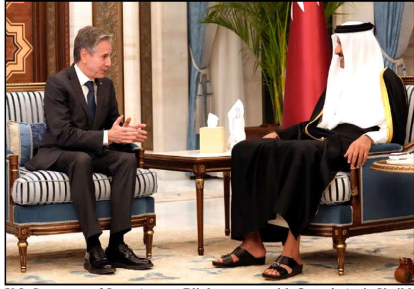
U.S. Secretary of State Antony Blinken meets with Qatar's Amir Sheikh Tamim bin Hamad Al Thani at Lusail Palace, in Doha, Qatar.