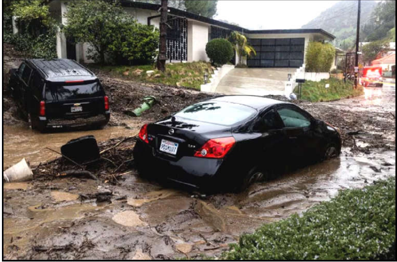
Rain falls over cars stuck by a mudslide, caused by an ongoing rain storm in Studio City, California.

more than half of Gaza's 2.3 million people have sought refuge and are now living in increasingly miserable conditions. U.N. humanitarian monitors said Tuesday that Israeli evacuation orders now cover two-thirds of Gaza's territory, driving thousands more people every day toward the border areas.