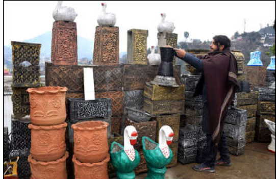
MUZAFRABAD: A vendor is displayed fancy plants pots attraction for customers at his nursery in the city.

European Central Bank president Christine Lagarde joined the chorus of criticism at the World Economic Forum in Davos, Switzerland, last month. "Many economists are actually a tribal clique," she said, referring to a lack of openness to other scientific disciplines. "They quote each other—men more than women but that's another story," the former IMF chief and French finance minister said. "But they don't go beyond that world because they feel comfortable in that world." Economists need to get out of their comfort zone of Excel spreadsheets and rigid models, some economists say about their own kind. The world "has changed a little bit", Peter Vanden Houde, chief eurozone economist at ING bank, said sarcastically.