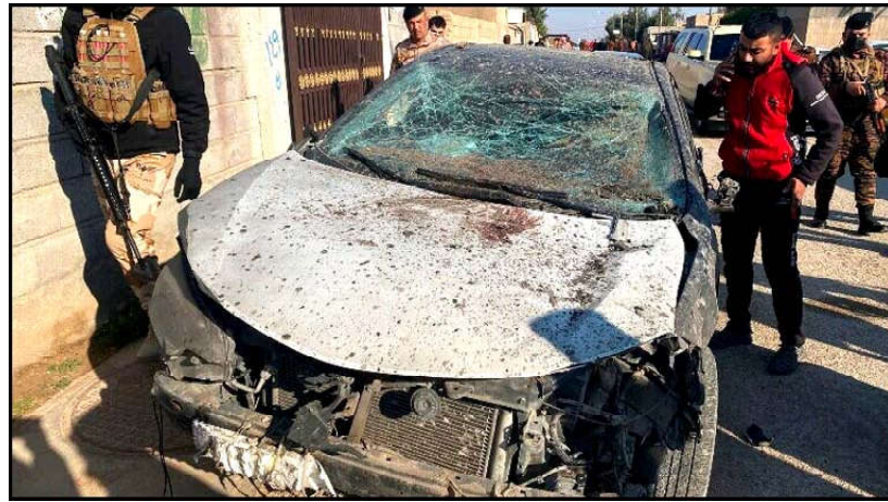
Security forces inspect a damaged car at the site of a U.S. airstrike in Al-Qaim, Iraq.