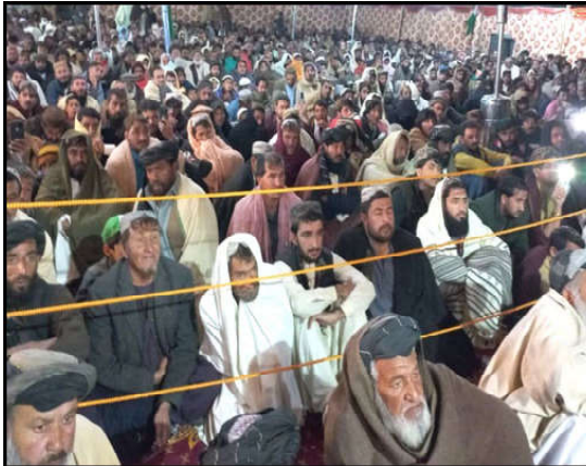
KILLAABDULLAH: Chairman PkMAP Mehmood Khan Achakzai addressing a public meeting in connection with general elections

ISLAMABAD (APP): A total of 1,688 candidates will contest for 16 National and 51 Provincial Assembly general seats from the province of Balochistan on February 8. Notable figures in the lineup of candidates comprise Maulana Fazlur Rahman, who heads Jamiat Ulema e Islam-Fazl (JUI-F), Senate Chairman Sadiq