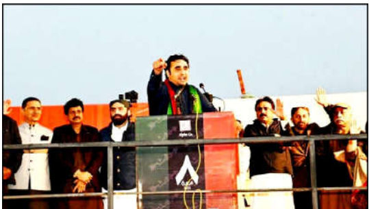
HYDERABAD: Chairman PPP Bilawal Bhutto Zardari addressing a meeting.