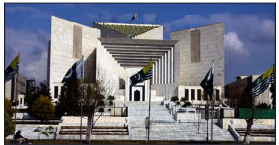
ISLAMABAD: A view of Pakistani and Kashmiri flags displayed alongside Constitution Avenue in front of Supreme Court, in connection with Kashmir Solidarity Day in the Federal Capital.

ISLAMABAD (APP): YFK International Kashmir Lobby Group hosted "Pedal for Peace: Kashmir Solidarity Day Cycle Rally" to show solidarity with the people of Indian Illegally Occupied Jammu and Kashmir (IIOJK). The rally, commencing at D Chowk and culminating at the Islamabad Press Club, was organized in commemoration of Kashmir Solidarity Day, seeking to raise awareness and highlight the urgency for international support in addressing the challenges faced by the Kashmiri population. The event provided a platform for community leaders, activists, and organizers to address the participants, sharing insightful perspectives on the current situation of IIOJK. All the participants gathered at the Islamabad Press Club where speeches were featured that underscored the broader context of Kashmir Solidarity Day. The participants of the rally collectively conveyed a message that the people of Pakistan stand with the people of IIOJK. More than 100 cyclists holding placards in support with people of IIOJK participated.