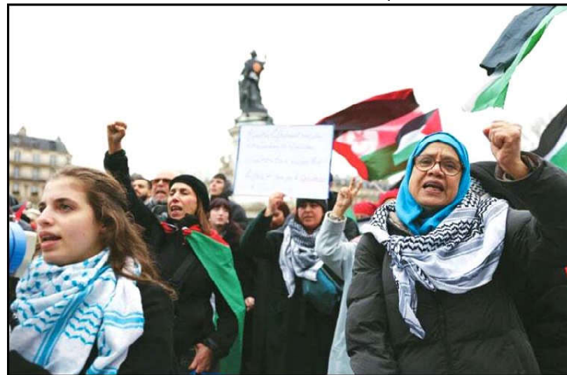
PARIS: People, some holding up the Palestinian flag, shout slogans in support of Palestinians during a demonstration.

shipped weapons to Moscow for use in Ukraine. Moscow's foreign ministry spokeswoman Maria Zakharova said this week the heightened tension on the Korean peninsula was "primarily due to the brazen policy of the United States and its allies, including the Republic of Korea and Japan", referring to South Korea by its official name. Zakharova made the remarks when asked about South Korean President Yoon Suk Yeol's recent description of the North as the only country in the world that has legislated the preemptive use of nuclear weapons.