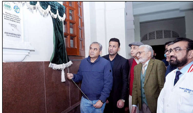
LAHORE: Caretaker Chief Minister of Punjab Mohsin Naqvi inaugurates up gradation and renovation of Punjab Dental Hospital.

According to details, with the financial assistance of UNHCR Pakistan, Sindh Rural Support Organization-SRSO arranged a program at village Moriiani and after formal assessment distributed the dignity Kits amongst the women of that village. Speaking on the Muhammad Panjal the DM of SRSO depicted that not only this but under this project SRSO had trained 20 women for Beautification Course of Beauty Parlour and sewing Course to 20 women and also distributed multiple kits amongst them. SRSO would continue its positive efforts to promote the women by empowering them through multiple aspects including technical support.