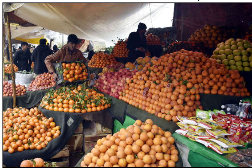
LAHORE: A vendor is displayed fruits at his stall attraction for customers at Shadman Sunday weekly bazaar in Provincial Capital.