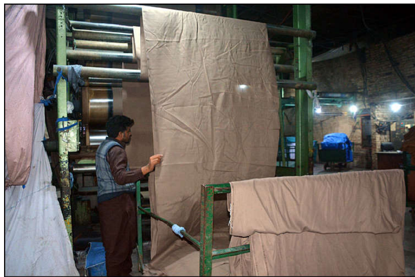
FAISALABAD: A worker is busy in his work at a local Textile mill in the city.

seeds. He further informed that only 2% of Pakistan's potato seed requirement was being fulfilled locally and we relied on importing 98% of its seed demand. With the implementation of this cutting-edge facility, Pakistan is poised to achieve self-sufficiency in potato seed production, he added. Dr Ali said that the aeroponic technology, which can yield 50 to 60 potato seeds per plant compared to just five from conventional methods.