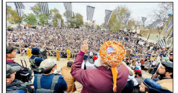
LUKY MARWAI: Quaid Jamiat Maulana Fazlur Rehman is addressing the election rally.

The distribution of printed ballot papers comprises 5% single-column, 50% double-column, 30% three-column, 11.15% four-column, and 2.4% five-column formats, gearing up for the scheduled February 8 polls. Political parties and independent candidates are actively participating in campaigns, with the election drive slated to conclude on February 6 at 12 pm.