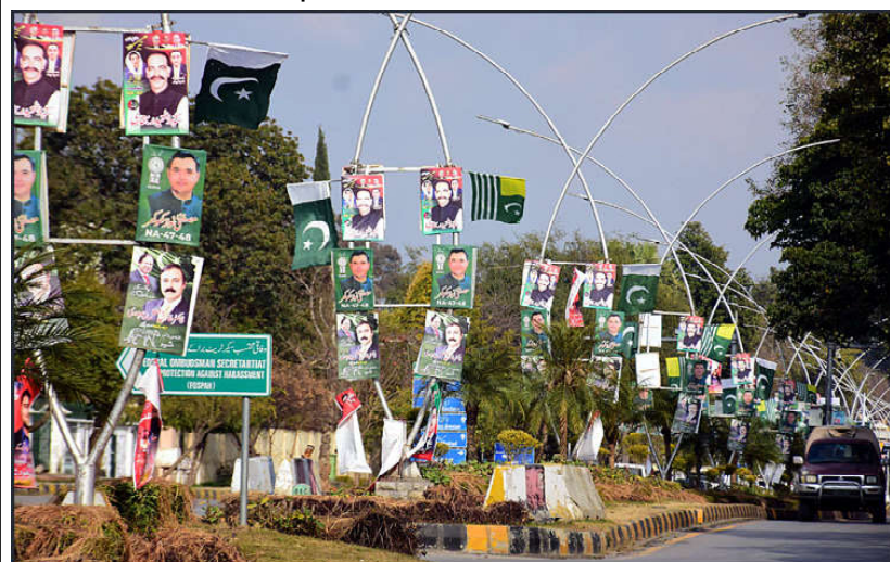
ISLAMABAD: A view of political parties displayed banners on street light poles alongside a road in the Federal Capital, ahead of upcoming general election 2024.