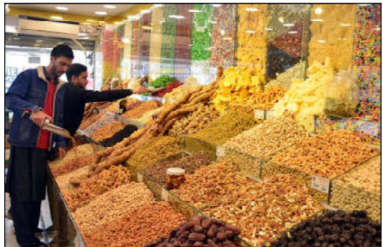
RAWALPINDI: A vendor is displaying dry fruits attraction for customers at his shop in the city.