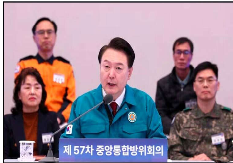
South Korean President Yoon Suk Yeol presides over the central integrated defence meeting in Seoul, South Korea.