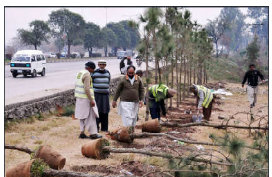
ISLAMABAD: CDA workers busy planting trees on greenbelt at Expressway in the Federal Capital.