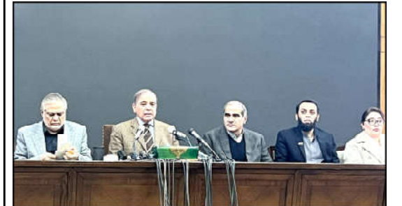
LAHORE: President PML(N) Mian Shahbaz Sharif along with other party leaders addressing a press conference.