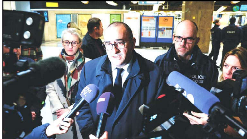
PARIS: A police official speaks to the media after a man carrying a knife wounded three people at the Gare de Lyon train station.

Monitoring Desk MANILA: The Philippine government is ready to use "authority and forces" against attempts to divide the nation, a security official said Sunday, after former President Rodrigo Duterte threatened to separate some southern islands from the rest of the archipelago. Duterte has called for the independence of his hometown Mindanao from the Philippines as his alliance with President Ferdinand Marcos Jr disintegrated this week over disagreements around efforts to amend the constitution. Marcos said amending the 1987 constitution was meant to ease foreign investments, but Duterte accused him of using constitutional change to stay in power.