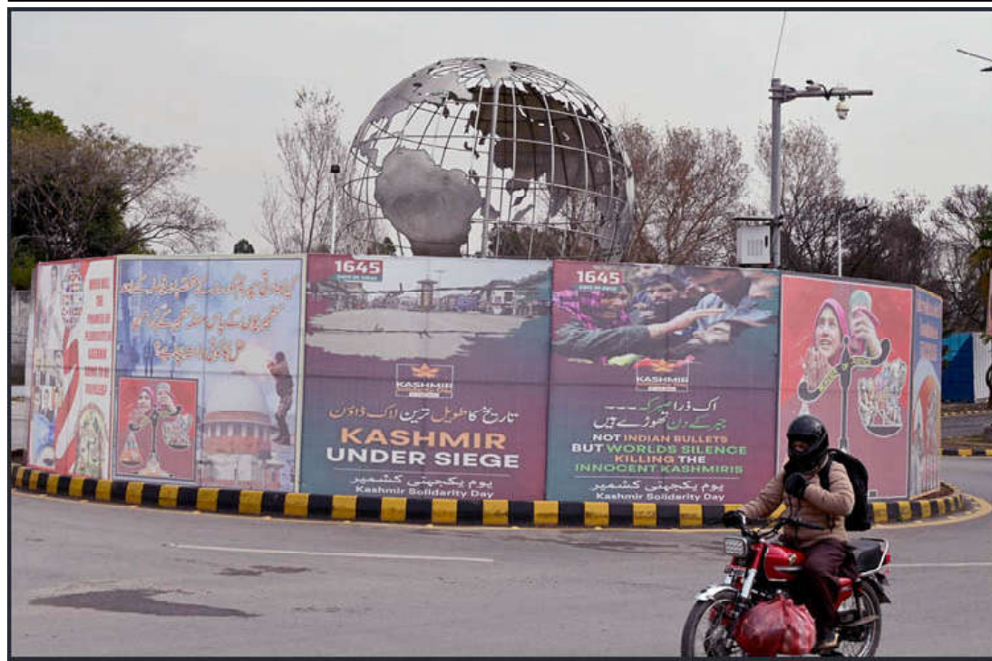
ISLAMABAD: A view of huge banners displayed in connection with Kashmir Solidarity Day at Constitution Avenue.