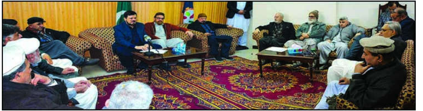
PESHAWAR: Khyber Pakhtunkhwa Governor Haji Ghulam Ali talking to Gem Stone traders during his visit to All Pakistan Commercial Exporter Association at Namak Mandi.

should get the support of students who have graduated from universities who are familiar with modern technology, so that the youth can get employment with the precious stones of the province. Exports can be increased along with introducing tourism at the global level, the Governor said, during his visit to the office of All Pakistan Commercial Exporters Association (APCEA) located in Namak Mandi, a congested area of inner city Peshawar. During the meeting with the representatives and officials of the present and