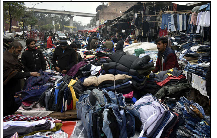
LAHORE: People are busy buying warm clothes and jackets in Landa bazaar at Shadman Sunday weekly bazaar in Provincial Capital.

opportunities in value addition in the mines and minerals sector for Chinese investors and ensured full facilitation from the KP government side. Through this MoU both parties may, to the best of their mutual endeavor and capabilities, strive to enhance investment in value addition in the mining sector of KP Province, provide specific project information, identification of joint venture partners, facilitating procedural matters with respective authorities remaining within respective legal mandate. Similarly, partners may conduct matchmaking meetings.