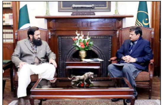
LAHORE: Provincial Minister for Education Mansoor Qadir meeting with Punjab Governor Muhammad Baligh-ur-Rehman.

Governor Punjab said that it was a moment of pride and honor that Sadiq Public School Bahawalpur has completed 70 years. He said that being an alumnus of the school, he has a great affiliation with the institution.