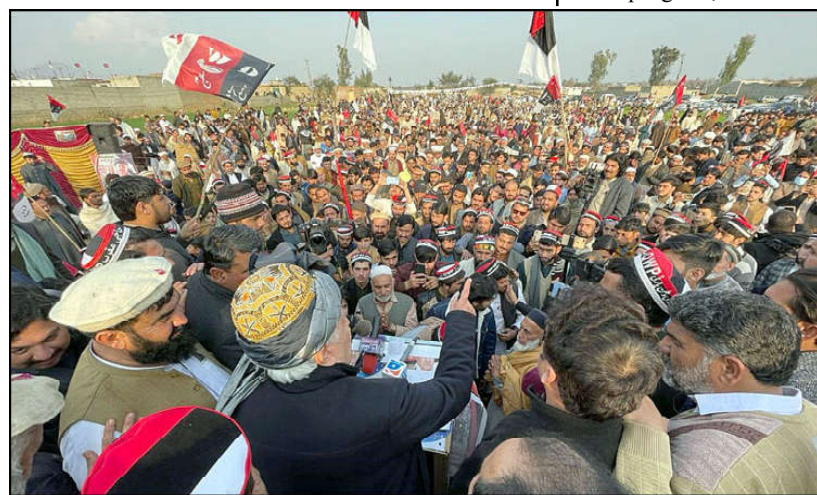
Chairman Qaumi Watan Party (QWP) Aftab Ahmad Khan Sherpao addressing during a public gathering (Jalsa) in the city.

The area police took the bodies into custody while an investigation is under progress, he added.