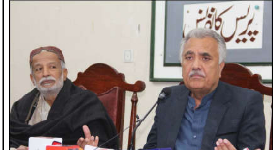
QUETTA: Central leader of National Party Senator Mir Kabir Muhammad Shahi addressing a Press conference

The humanitarian assistance flight destined for Gaza will land in Al-Arish, Egypt, where the Pakistan's Ambassador will take charge of the supplies and oversee their transportation.