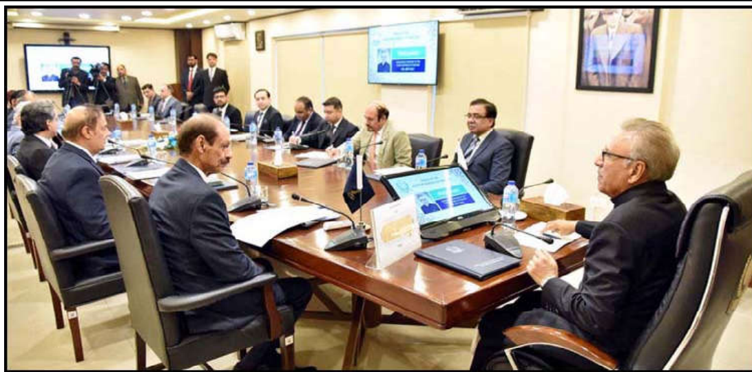
ISLAMABAD: President Dr Arif Alvi being briefed about the role and performance of the Auditor General of Pakistan (AGP), during his visit to AGP Office.

audit process more effective." It was informed that the Auditor General had completed 95% compliance audits in the fiscal year 2022-23. Improvements in audit and accounting processes would promote transparency, accountability and good governance, the meeting was told. Similarly it was informed that steps were underway to incorporate advanced technology platforms and artificial intelligence tools into the audit process.