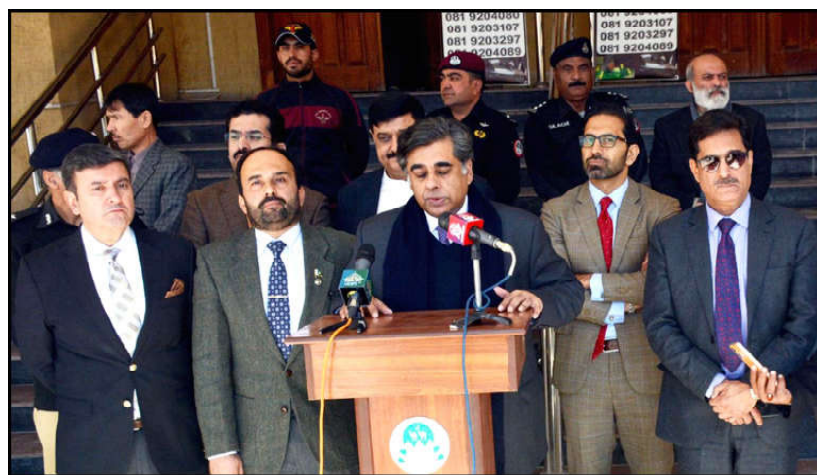
QUETTA: Caretaker Interior Minister Dr. Gohar Ejaz addressing a Press conference regarding holding of peaceful elections