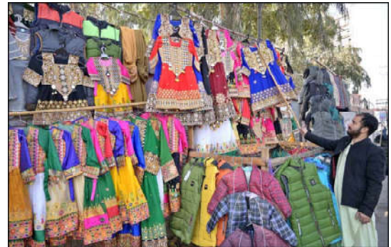
SARGODHA: A vendor displaying traditional children clothes to attract the customers at City Road.