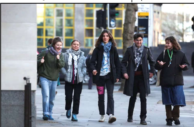
Climate activist Greta Thunberg walks on the day of her trial at Westminster Magistrates' Court in London, Britain.