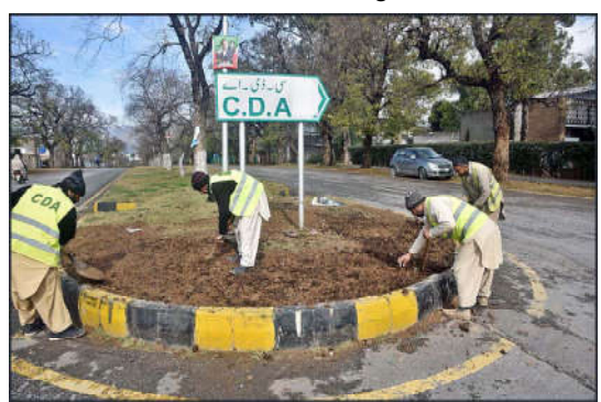
ISLAMABAD: CDA workers busy in preparing center path of road for plantation in the Federal Capital.

caretaker government has worked to establish a heritage channel under the Culture Division to preserve and promote the collection of folk literature of Pakistani languages, especially children's folk literature. He said the scope of culture is unlimited, adding, every nation who is staying connected with their culture are the ones that develop the most. Replying to a question, he said caretaker government had taken revolutionary steps for promotion of art and culture with introducing various project including heritage channel.