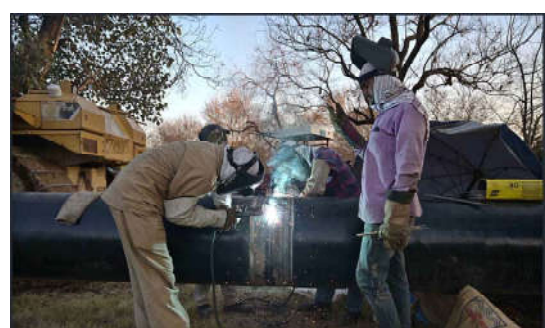
ISLAMABAD: Workers welding pipes of gas line at Aabpara area in the federal capital.

briefed the ICCI head about the initiatives of his institution. He said that Bahria is working to groom today's youth into tomorrow's leaders. He said that Bahria is providing an environment for promising minds to come together, develop new ideas and make significant contributions to the country's economic development. He said that academia has cutting-edge research while industry faces many challenges, therefore, close cooperation between Bahria and ICCI would help resolve issues of industry and produce innovative products for exports.