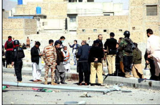
QUETTA: Police officials cordoned off the area and are ascertaining the nature of the blast after the explosion, at Spinny road in Quetta.