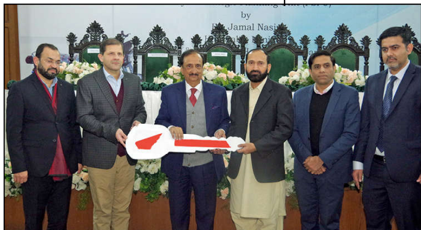
LAHORE: Provincial Minister for Primary & Secondary Healthcare Dr. Jamal Nasir distributing motorcycles keys amongst the Monitoring Staff of department.