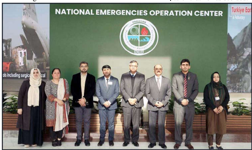
ISLAMABAD: Group photo of Kohsar University Delegation at National Emergencies Operation Center (NEOC) of NDMA.

He further said that the highlight of the meeting was the unanimous approval of a robust security plan for the impending elections. A collaborative effort is set to unfold, with the Pakistan Army, Pakistan Rangers, sensitive institutions, and the police working in unison to execute the approved security blueprint. This strategic alliance aimed to ensure a secure and smooth electoral process, marking a pivotal step towards a transparent and protected democratic exercise in 2024, he concluded.