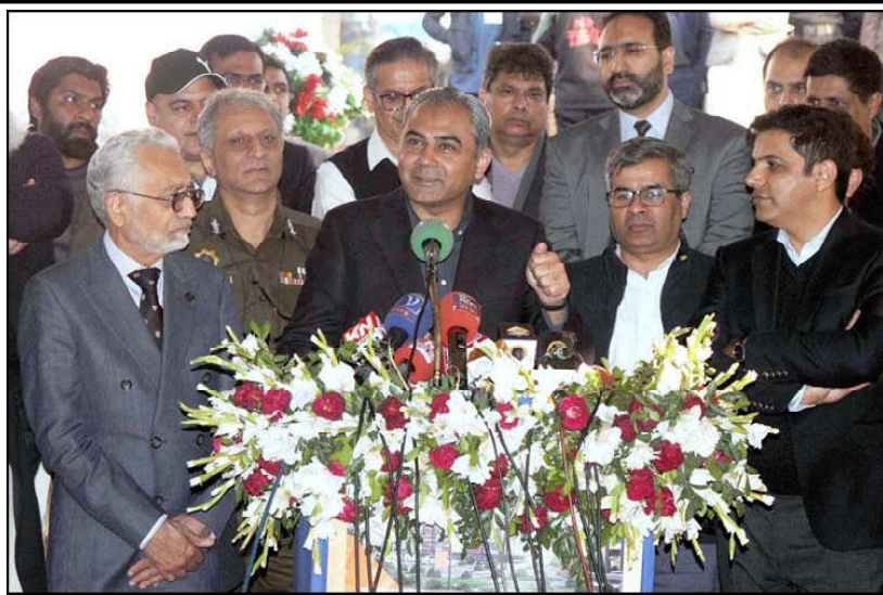
MULTAN: Caretaker CM Punjab Mohsin Naqvi talking to media persons during his visit to Nishtar Hospital 02.

Soon after the information, area police rushed there and dacoits opened fires upon the police while seeing coming towards them, police also fired in return. As a result of exchange of firing, one dacoit was gunned down on the spot.