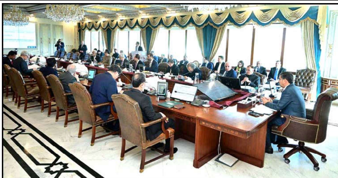
ISLAMABAD: Caretaker Prime Minister Anwaar-ul-Haq Kakar chairs a meeting of the Caretaker Federal Cabinet.