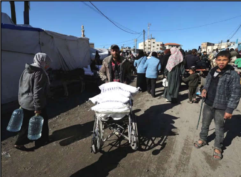
A Palestinian man carries bags of flour distributed by the United Nations Relief and Works Agency (UNRWA), amid the ongoing conflict between Israel and Hamas, in Rafah in the southern Gaza Strip.

Monitoring Desk WASHINGTON: Members of the House of Representatives on Thursday will launch the first bipartisan caucus on Myanmar to pressure US administrations to act on the crisis in the Southeast Asian country since the military staged a coup three years ago, according to a statement. Republican Bill Huizenga of Michigan and Democrat Betty McCollum of Minnesota will chair the Congressional Burma Caucus, which the statement from the two lawmakers said was intended to bolster congressional support.