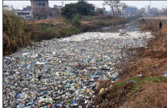
ISLAMABAD: A view of garbage dump in a Nalla on a green belt alongside Islamabad Expressway near Kurri road, as needs to attention for concern authority.

For news and information related to the election, YouTube's recommendation system will prominently surface content and relevant context from authoritative sources, including local and national news sources on the homepage, in search results, and the "Up Next" panel, to connect people to high-quality election news and information.