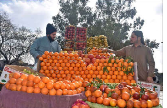
ISLAMABAD: A vendor displaying fruits to attract the customers at his roadside.