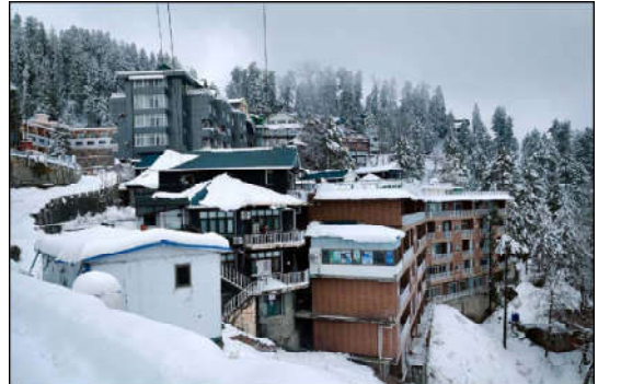
ABBOTTABAD: An eye-catching view of a snow covered area during the heavy snowfall of winter season, which more decreases the temperature below in minus degree Celsius, at Galyat area.

Under the plan the health department would also coordinate with Rescue 1122 to deal with any emergency situation.