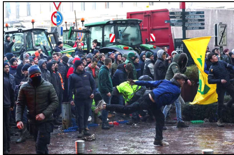
A person throws eggs towards the police officers as Belgian farmers use their tractors to block the European Union headquarters, as they protest over price pressures, taxes and green regulation, grievances shared by farmers across Europe, on the day of the EU summit in Brussels, Belgium.