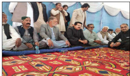
CHAGAI: Chairman Senate Muhammad Sadiq Sanjrani meeting with tribal elites in connection with election campaign at Sanjrani House