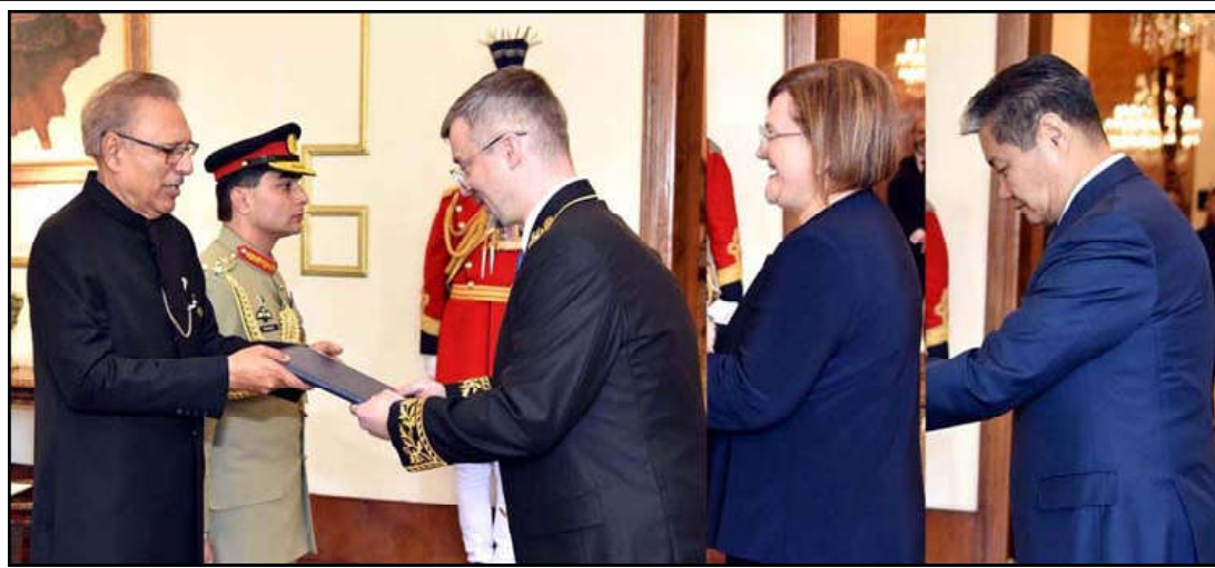
ISLAMABAD: The Ambassadors-Designates of Russia, Italy and Mongolia presenting their diplomatic credentials to President Dr. Arif Alvi, at Aiwan-e-Sadr.