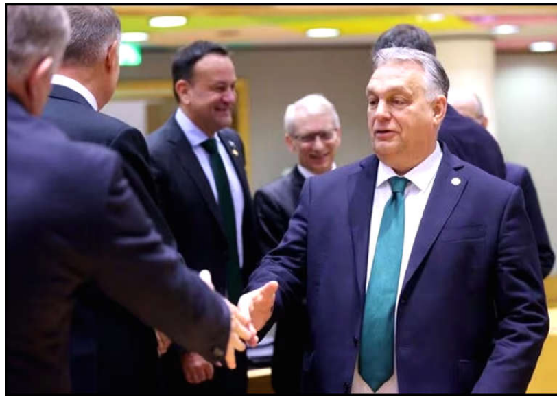
Hungary's Prime Minister Viktor Orban attends a European Union summit in Brussels, Belgium.