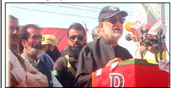
KHARAN: President Balochistan National Party Sardar Akhtar Jan Mengal addressing a public meeting in connection with general elections

He expressed gratitude to the ambassador of Kazakhstan in Pakistan and Caretaker Minister for Culture and Heritage Jamal Shah for inviting him to speak on the screening of "Kazakh Khanate".