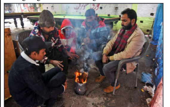
ISLAMABAD: Youngsters are sitting around fire keep warm them during rainy weather in the Federal Capital.