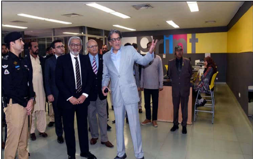
KARACHI: Caretaker Sindh Chief Minister, Justice (Retd) Maqbool Baqar is being briefed by officials about digital Library during his visit at Habib University in Karachi.

She appealed to the people of Hyderabad to vote for PPP candidates.