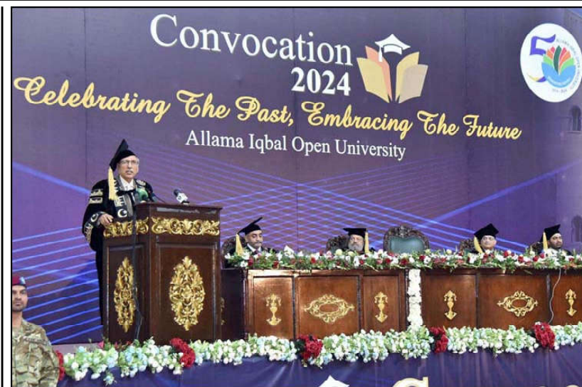
ISLAMABAD: President Dr. Arif Alvi addressing the convocation of Allama Iqbal Open University (AIOU) at Jinnah Convention Centre.

the exploitation of wealth in the world to ensure a person his due right, eventually leading to peace and unity. He advised passed-out graduates to continue the struggle for the pursuit of knowledge in practical life. He also asked the women graduates to opt for the practical life even after getting married. He said in today's era of technology, women could simultaneously manage their jobs and family life. The president said Pakistan was declared as world's 5th best-performing country during COVID-19 due to timely and prudent strategies of the government. Recalling the leadership's decision to establish the AIOU in 1970s, the president said the university had been playing a key and leading role in imparting education to the people, especially in remote areas. Earlier, the president conferred degrees and medals to the fresh students.