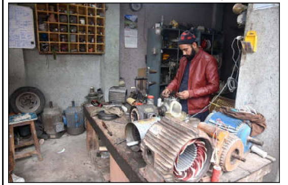
RAWALPINDI: A mechanic busy in winding and repairing motors at his shop in a local market.

As the climate bank for Asia and the Pacific, ADB is deeply committed to helping our developing members de-fossilize their economies, progress along their climate transition pathways, and achieve their net-zero goals.