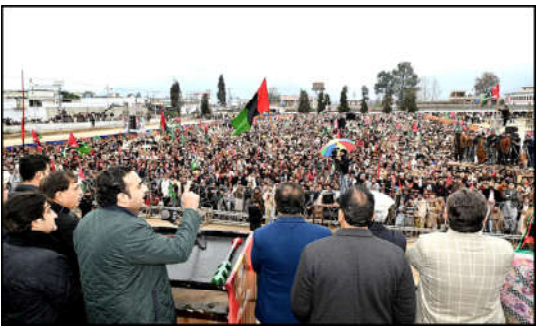
Chairman Pakistan People's Party Bilawal Bhutto Zardari is addressing the election rally of Pakistan People's Party in Malakand district.