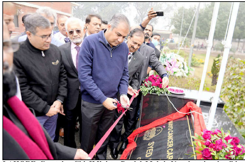
LAHORE: Caretaker Chief Minister Punjab Mohsin Naqvi cutting the ribbon to inaugurate Mayo Cancer Care Hospital Manawa.

CM Naqvi while addressing the inaugural ceremony of the Mayo Cancer Care Hospital apprised that the first complete cancer care hospital of Punjab has been established.