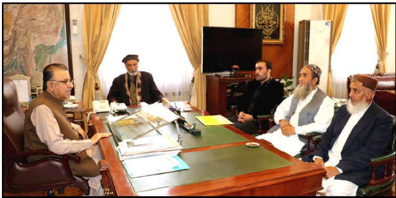
QUETTA: Representatives of different areas meeting with Governor Balochistan Malik Abdul Wali Khan Kakar