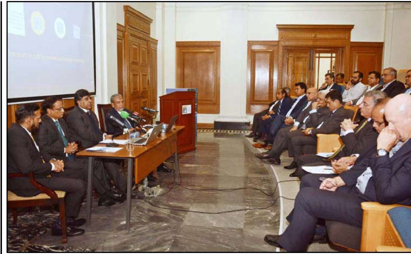
KARACHI: Federal Minister for Interior, Commerce, Industries, Overseas Pakistanis and Investment, Dr. Gohar Ejaz addressing to foreign and local investors at Overseas Chamber of Commerce and Industry Karachi.

The price of the Euro decreased by 35 paise to close at Rs 302.33 against the last day's closing of Rs 302.68, according to the State Bank of Pakistan (SBP). The Japanese Yen remained unchanged and closed at Rs 1.89, whereas a decrease of 59 paise was witnessed in the exchange rate of the British Pound, which traded at Rs 354.26 compared to the last closing of Rs 354.85. The exchange rates of the Emirates Dirham and the Saudi Riyal decreased by 02 paise each to close at Rs 76.09 and Rs 74.52.