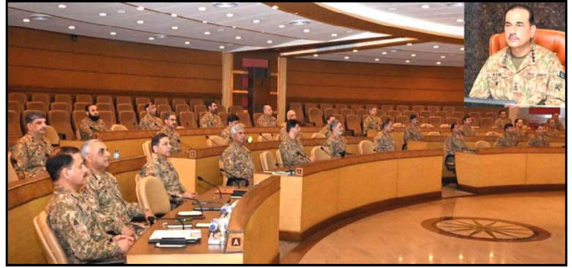
RAWALPINDI: Chief of Army Staff (COAS) General Syed Asim Munir chairing the 262nd Corps Commanders' Conference (CCC) at the General Headquarters.