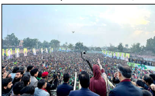
NAROWAL: Senior Vice President PML-N Maryam Nawaz addressing a public gathering in Zafarwal.

He also said that all resources are being mobilized for restoration of peace.