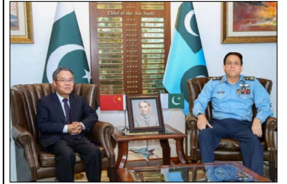
The dignitaries underscored the necessity of revitalizing the framework for operational training across all domains, emphasizing the paramount importance of preparedness and seamless coordination in the face of evolving security challenges. The Air Chief shared

broad contours of the PAF's modernization drive in order to transform Pakistan Air Force into a Next Generation Air Force through induction of niche technologies with a special focus on indigenization and revamping of training. Highlighting the significance of the longstanding strategic partnership between the two countries, he emphasized that the PAF leadership wished to further deepen the existing aviation cooperation and exchanges with China in the fields of human resource and technology so as to jointly address shared security challenges. He further said, "Pakistan values its strong diplomatic, economic, defence relationship and time-tested friendship with China which are based on convergence on all important issues relating to regional peace."