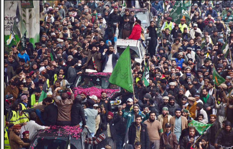
RAWALPINDI: Chief of Tehreek-e-Labbaik Pakistan Saad Hussain Rizvi waving to his supporters during election campaign rally at Murree road in the city, ahead of upcoming general election 2024.

In addition to the interchange, the project encompasses the construction of a flyover and tunnel.