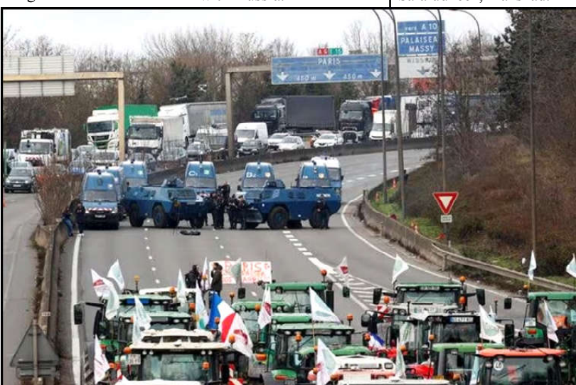
Members of the French Gendarmerie stand near armoured vehicles, as tractors park on the A6 highway during a protest over price pressures, taxes and green regulation, grievances shared by farmers across Europe, near Chilly-Mazarin, near Paris, France.

The rules on fallow land were part of the grievances that have led to protests by farmers in France, Belgium and elsewhere in recent weeks.