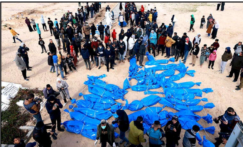
Civilians watch as Gaza-based Palestinian Health Ministry workers bury the bodies of unidentified Palestinians whose date of death is not known after they were returned by Israel earlier on the same day through the Kerem Shalom crossing, at a mass grave east of Rafah in the southern Gaza Strip.

Secretary of State Antony Blinken said that the response "could be multi-leveled, come in stages, and be sustained over time."