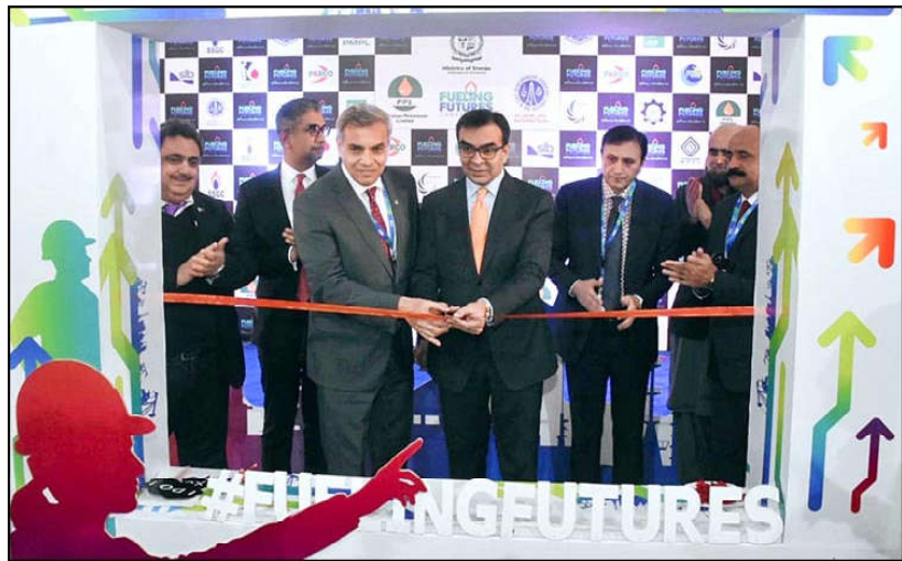
ISLAMABAD: Minister for Energy Muhammad Ali inaugurating Oil, Gas and Minerals Career Expo.

He also urged for giving the ICCI representation in the Export Development Fund, besides setting up a facilitation desk of the Passport Office at its office and a separate immigration counter at airports for the taxpayers. ICCI Senior Vice President Faad Waheed requested the government to announce a special package.