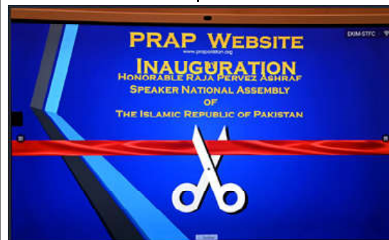
ISLAMABAD: Speaker National Assembly Raja Pervez Ashraf Launching the Web Portal for the Parliamentary Reporters Association (PRA).

These powers can be utilized by ROs and DROs during the general elections for national and provincial assemblies in Punjab, Sindh, Khyber Pakhtunkhwa, and Balochistan until the official announcement of final results for the candidates.