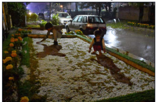
ISLAMABAD: Children are playing with Hail outside their house at sector I-8 after the heavy Hail Storm in the Federal Capital.

The court said that high court rules and section 352 of criminal procedure will be applicable only when sessions court passes order in regard to venue.