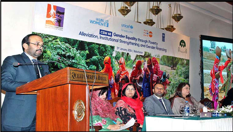
QUETTA: Balochistan Caretaker Minister for Home and Tribal Affairs Mir Muhammad Zubair Jamali addressing a consultation on gender issue organized by National Commission on the Status of Women.

NCSW holds pre-NCSW 68 consultation with provincial stakeholders: Zubair Jamali reiterates interim Govt's resolve to empower women economically