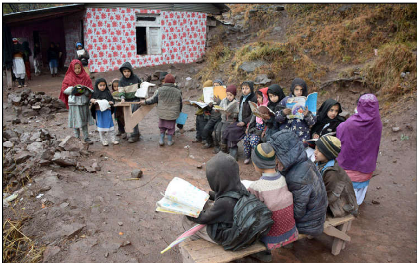
HATTIAN BALA: Students are attending their class outside Government Primary Schools for Girls Nandar area, during cold weather.