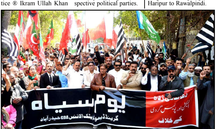
HYDERABAD: Workers of GDA, PTI, JUI(F), JI and Awami Tehreek hold a protest rally against alleged rigging in general election 2024 and observe Black Day against torture and arrest of the workers of Sindhyani Tehreek and JUI (F) during a rally in Karachi.

Police say hat the passenger bus was going from Haripur to Rawalpindi.