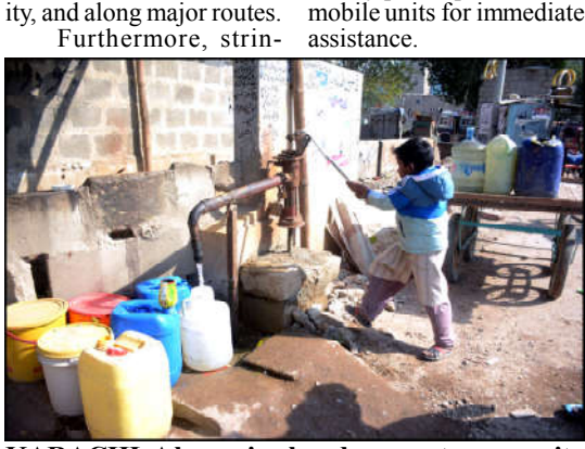
KARACHI: A boy using hand pump at community water well to collect drinking water.

Citizens are urged to promptly report any suspicious activities or items, such as bags, parcels, or vehicles, seen within or near the shrine premises, or along major routes, to nearby police personnel or mobile units for immediate