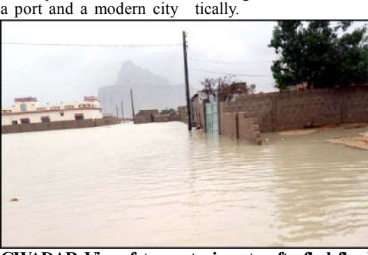
GWADAR: View of stagnant rain water after flash flood caused by heavy downpour of winter season, in Gwadar.