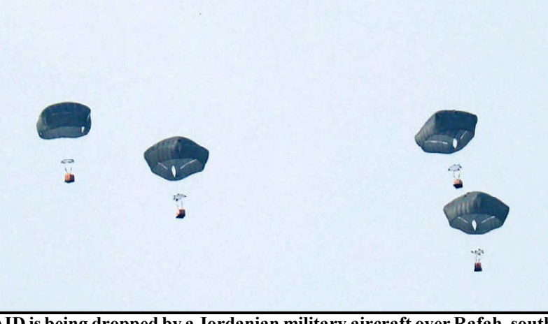
AID is being dropped by a Jordanian military aircraft over Rafah, south-

The train, running at 100 kilometres per hour, was captured in a video that went viral on social media. The incident happened after the train stopped at a railway station in Jammu for a crew change, local media reports said. But it began moving down a slope after the driver and his assistant got off. All road crossings on the route were closed to prevent accidents.