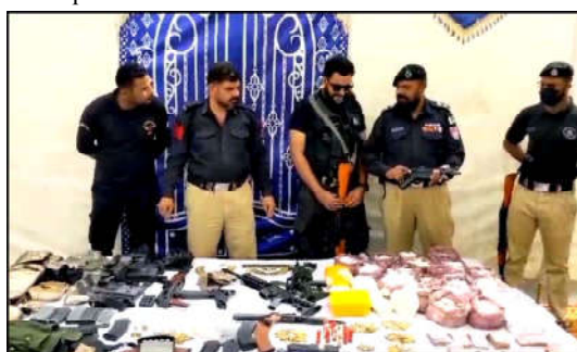
KARACHI: Police officials are showing arrested alleged accused criminals and recovered seized weapons and drugs to media persons during press conference held at Keamari District Police Station in Karachi.

The seized buses and illicit items utilized in the smuggling attempt have been handed over to law enforcement authorities. while the apprehended in-