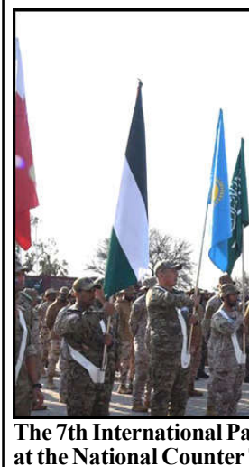
The 7th International Pakistan Army Team Spirit Exercise-2024 was opened at the National Counter Terrorism Centre at Pabbi.

The notification of the successful independent candidate Khizr Hussain Mazari from the Punjab Assembly seat PP 297 has also been issued.