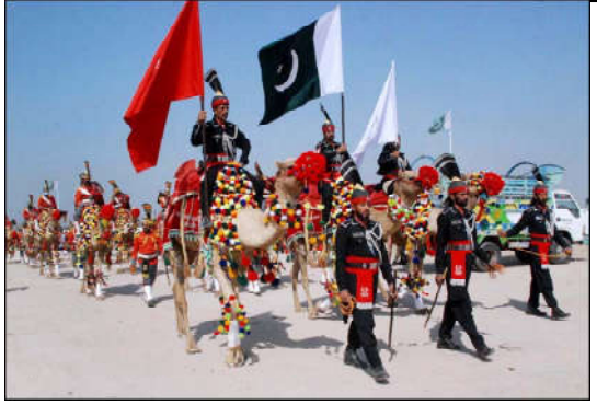
BAHAWALPUR: Rangers Cholistan Camel band presenting their skills at a ceremony held in connection with 19th TDCP Cholistan Desert Rally 2024 at Cholistan desert Jeep Rally.