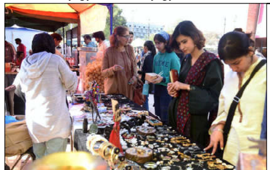
LAHORE: Women purchasing artificial jewelry from the stall during the Lahore Literary Festival at AlHamra.