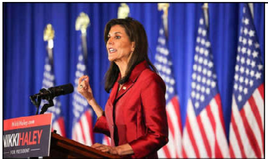
Republican presidential candidate and former US Ambassador to the United Nations Nikki Haley speaks on stage at her watch party during the South Carolina Republican presidential primary election in Charleston, South Carolina.

head to the city of Ballarat, 95 km (60 miles) west of the state capital, Melbourne. Australia is in the grips of an El Nino weather pattern, which is typically associated with extreme phenomena such as wildfires, cyclones and droughts. More than 15 bushfires were burning in Victoria on Sunday, with the most serious blaze, ranked at the second highest danger rating, near several remote towns, according to the state's emergency authority. State authorities have said there are concerns about the weather this week particularly Wednesday into Thursday when extreme heat is forecast that could further fan the fires.