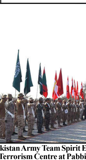
The 7th International Pakistan Army Team Spirit Exercise-2024 was opened at the National Counter Terrorism Centre at Pabbi.

A total of 20 friendly countries including military observers are participating in the event. Major participants include Pakistan, Bahrain, Jordan, Kazakhstan, Kingdom of Saudi Arabia, Maldives, Morocco, Qatar, Sri Lanka, Thailand, Türkiye, United States of America and Uzbekistan while Azerbaijan, Belarus, China, Myanmar, Germany, Indonesia, Japan and Oman will witness the exercise as military observers.