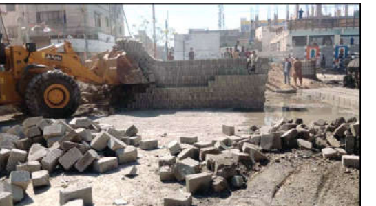
KARACHI: Anti encroachment operation in progress removed illegal encroachment during anti encroachment drive under the supervision of Karachi Development Authority (KDA) located on Korangi Town area in Karachi.