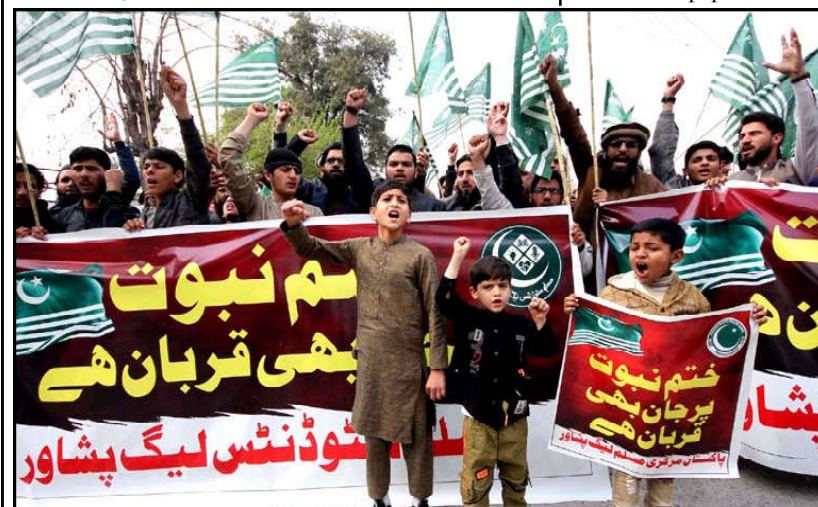
PESHAWAR: Members of Muslim Students League and Muslim Youth League are holding protest demonstration for acceptance of their demands, at Peshawar press club.