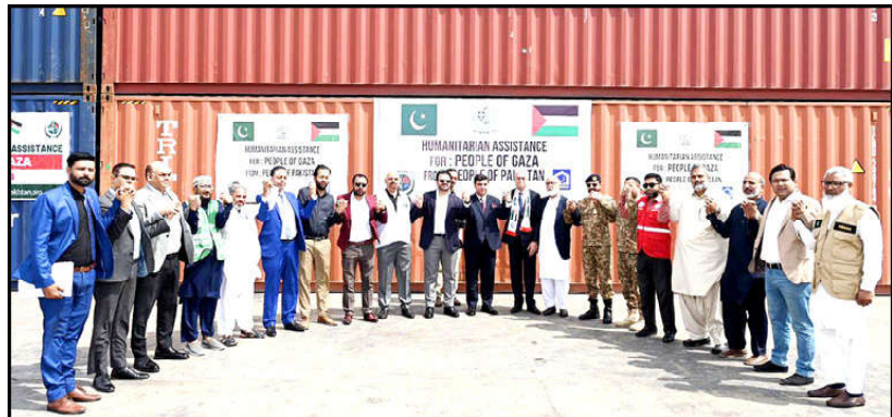
ISLAMABAD: 7 th consignment of relief goods being dispatched for the people of Gaza from Government of Pakistan.

Azam Mohammed Ali Jinnah, sat in this assembly, adding that Liaquat Ali Khan waved the Pakistani flag here. He said that the assembly, in line with the constitution, would complete the next five years.