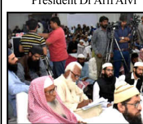
KARACHI: Federal Minister for Religious Affairs & Interfaith Harmony Aneeq Ahmed addressing the gathering at Jamia Abi Bakar Al Islamia Karachi.