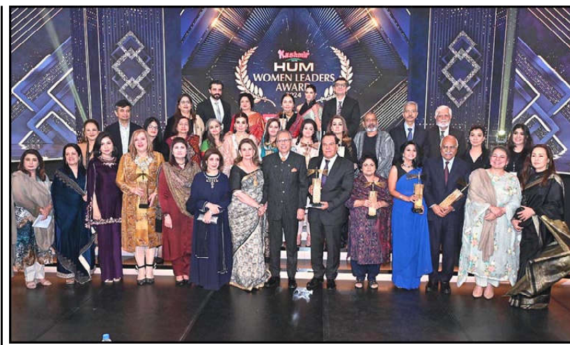
ISLAMABAD: President Arif Alvi, in a group photograph, with the organizers & recipients of the awards at the 5th edition of HUM Women Leaders Awards-2024 ceremony held at the Jinnah Convention Center.