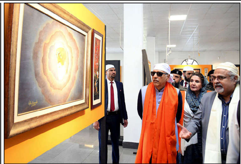
NAROWAL: President Dr Arif Alvi visiting different sections of the Kartarpur Corridor.

He said that as a provincial minister, he made various reforms in his respective departments, which increased the revenue of the departments.