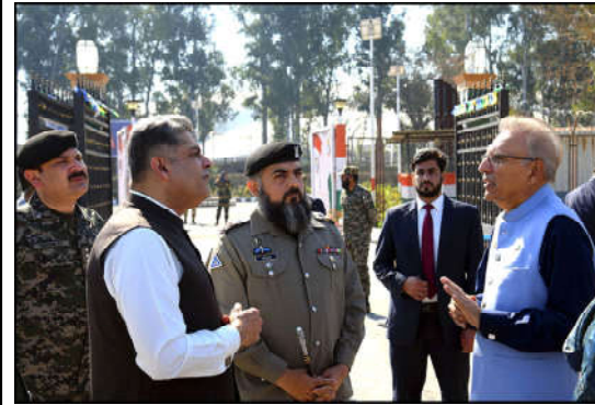
NAROWAL: President Dr Arif Alvi being briefed about Kartarpur Corridor at Zero Line/International Border.

ISLAMABAD (APP): Caretaker Minister for Religious Affairs and Interfaith Harmony Aneeq Ahmed Friday said that all possible facilities will be provided to Pakistani pilgrims during this year's hajj where special training programs were also being conducted at the district level through camps managed by the religious affairs ministry. In an exclusive interview with PTV news channel, he said that under the supervision of the Pakistan Hajj mission special catering companies were being arranged to feed pilgrims under a government scheme and will ensure quality and safety standards at every step. Minister said that this year Pakistan Hajj mission is offering simplified transportation services to Pakistani pilgrims with standard buses ensuring round-the-clock, adding that, the transport department will fully dedicate themselves to the sacred duty. A comprehensive transportation guidelines had also been issued at each building, he added. The caretaker government had introduced several new services for the pilgrims to help them perform the rituals with comfort and ease, he mentioned. Monitoring Cell has been put in place to closely monitor and address any potential issues of the private Pilgrims, he said, adding, furthermore, various other specialized units, such as a Wheelchair Desk have been established to cater to the specific needs of different groups of pilgrims.