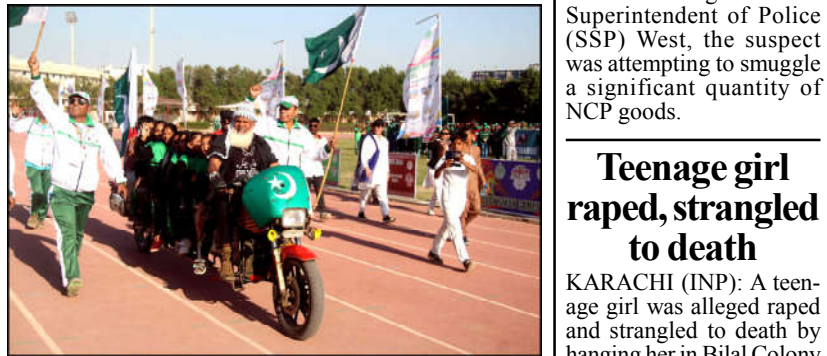
KARACHI: Players arriving to attend inauguration ceremony of 18th Sindh games at National Coaching center, in Provincial Capital.