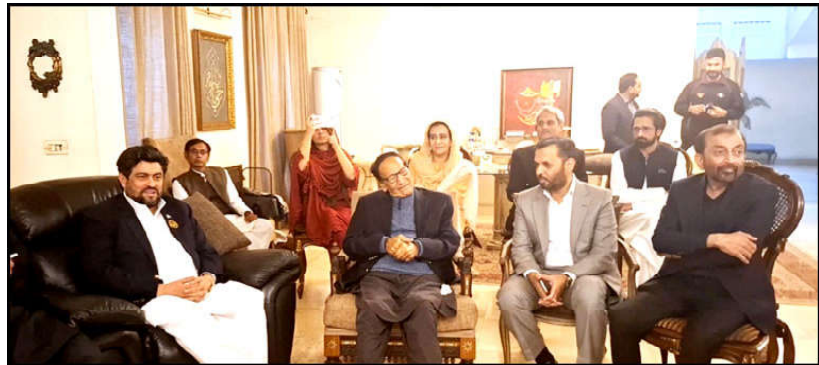
LAHORE: A delegation of MQM including Governor Sindh Kamran Khan Tessori, Syed Muustafa Kamal and Farooq Sattar meeting with President PML-Q Chaudhry Shujaat Hussain.

The newly elected PPP members of Sindh Assembly including former CM Murad Ali Shah, Sayed Qaim Ali Shah, Faryal Talpur and others were attended the parliamentary party meeting.