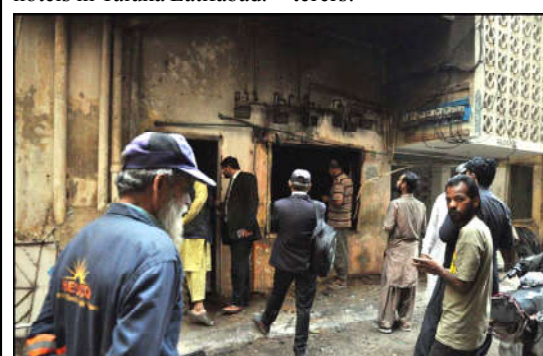
HYDERABAD: View of damages after gas cylinder blast in a house, near Gul Centre in Hyderabad.