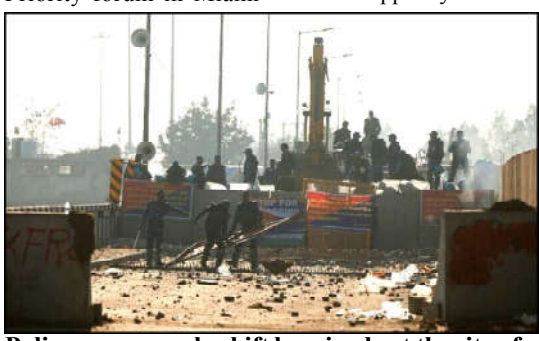
Police move a makeshift barricade at the site of a protest as farmers march towards New Delhi to push for better crop prices promised to them in 2021, at Shambhu Barrier, the border between Punjab and Haryana states, India.

Monitoring Desk STOCKHOLM (Internews): About 62,000 persons are active in, or have connections to, criminal networks in Sweden, the police said on Friday, where the authorities have struggled for years to contain violence linked to organised crime. Deadly shootings have more than tripled over the past decade in this Nordic nation of 10 million people.