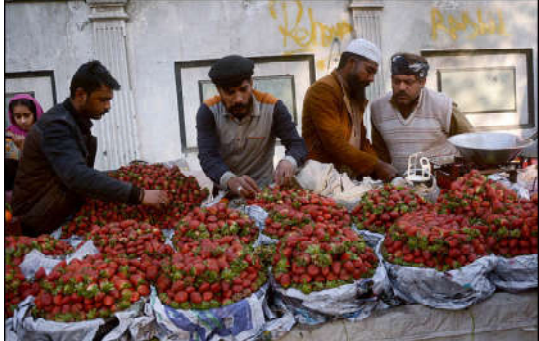
LAHORE: Vendors arranging and displaying strawberry to attract the customers.