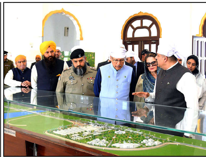
NAROWAL: President Dr. Arif Alvi being briefed about the Kartarpur Corridor.

Shehbaz Sharif said that ensuring economic stability in the country was his top priority. He said that country could not tolerate instability, adding that continuous steps would be taken to strengthen the country and provide relief to people.