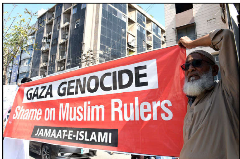
KARACHI: Activists of Jamaat-e-Islami hold a banner during protest against Israel attack on Ghaza outside a mosque, in the Provincial Capital.

bined 20 billion kilowatt hours each year, satisfying the production and residential electricity use of two million people while saving energy equivalent to 6.24 million tons of standard coal," the Global Times learned from China National Nuclear Corporation. In July last year, Unit 5 (C-5) of the Chashma Nuclear Power Plant broke ground, marking the 7th nuclear reactor exported from China to Pakistan. "Pakistan is on the right side of history by standing with China as the game changer. CPEC's second phase will unveil record development and economic uplift in the country," said Senator Mushahid Hussain Sayed, Chairman of the Senate Standing Committee on Defense.