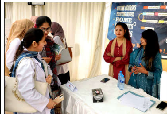
HYDERABAD: Participants visiting a stall during Job fair at Isra University.

He urged the Pakistan and Saudi Arabia to focus on further improving bilateral trade and investment relations that would create new jobs and bring prosperity to both countries.