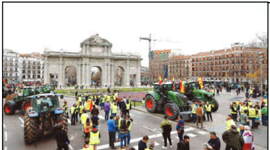
Farmers riding tractors arrive in front of Madrid's Puerta de Alcalá square during a protest against the European Union's agricultural policy.