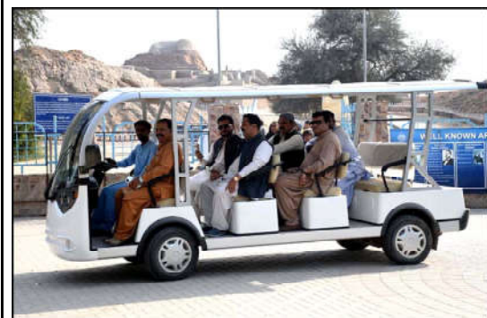
LARKANA: People visiting at the world famous archaeological site of Moen-Jo-Daro.