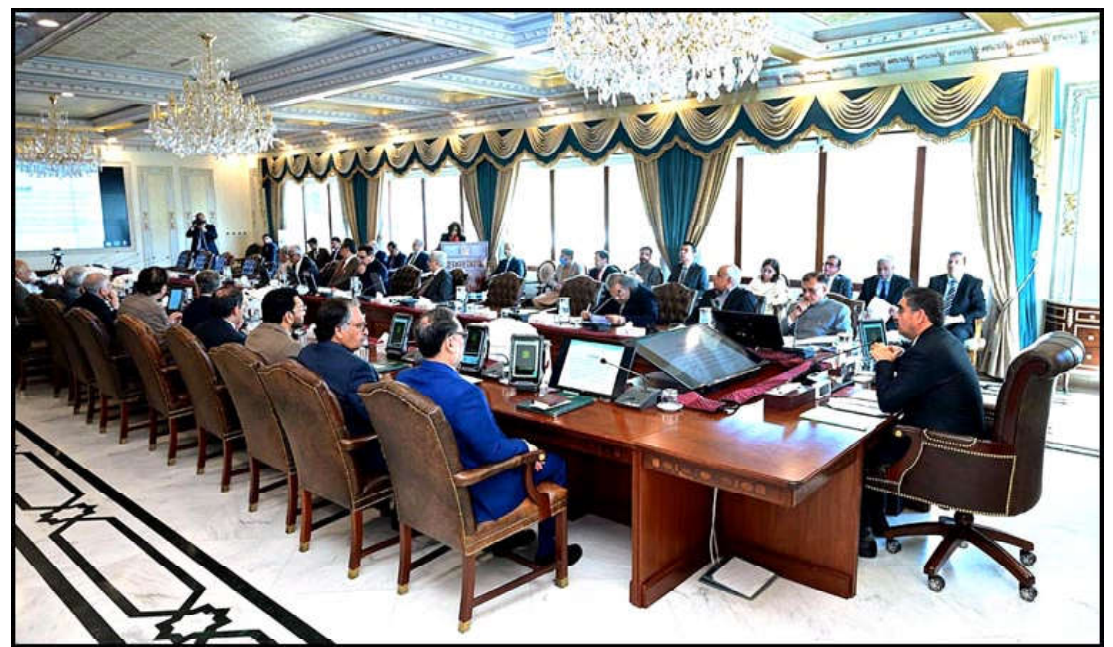
ISLAMABAD: Caretaker Prime Minister Anwaar-ul-Haq Kakar chairs a meeting of the Caretaker Federal Cabinet.

Appreciating the prudent leadership of Prime Minister Kakar on behalf of the federal bureaucracy, the cabinet secretary said that he had taken important difficult decisions in interest of the country, which would have far-reaching results.