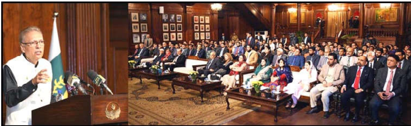
LAHORE: President Dr. Arif Alvi addressing the recognition ceremony of officers of the Federal Insurance Ombudsman and representatives of insurance companies, at Governor House.