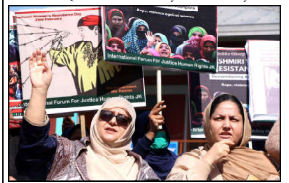
MUZAFFRABAD: Women activists of International Forum for Justice shouting slogans during protest ahead of Kashmiri Women's Resistance Day 23rd February, in the city.

The Sindh governor and MQM leaders lauded the prime minister for the steps taken by his government for the economic stability in the country.