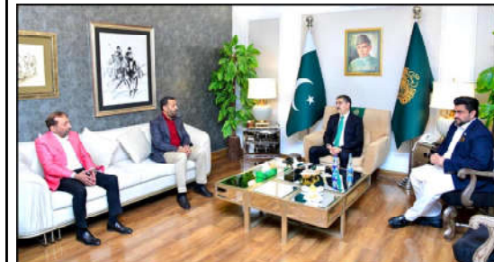
ISLAMABAD: Governor Sindh Kamran Khan Tessori meeting with Caretaker Prime Minister Anwaar-ul-Haq Kakar, MQM leaders Dr. Farooq Sattar and Mustafa Kamal also present in the meeting.

The minister said that social media platforms X (formerly Twitter), YouTube, Facebook and Instagram had been continuously used for propaganda, lies, defamation of government officials and harassment, and the companies owning these platforms would have to control this illegal activity.