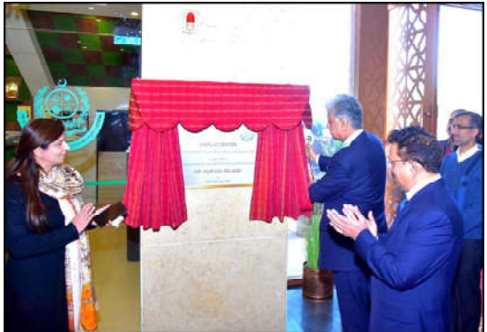
ISLAMABAD: Mr. Murtaza Solangi, Caretaker Federal Minister for Information and Broadcasting inaugurating a 'Display Centre' at Directorate of Electronic Media and Publications (DEMP).

According to the Constitution of the Islamic Republic of Pakistan, this matter is settled. Every Muslim is entrusted with safeguarding the sanctity of the finality of the holy Prophet (PBUH).