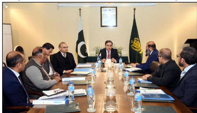
Caretaker Federal Minister for IT and Telecommunication, Dr. Umar Saif chairing 6th Board of Directors meeting of National Information Technology Board (NITB) in Islamabad.