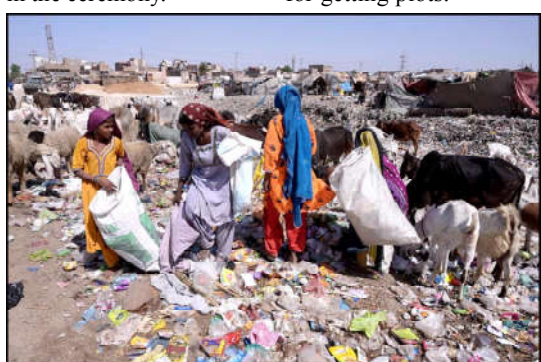
HYDERABAD: Gypsy women searching the valuable items from heap of garbage at Latifabad area.