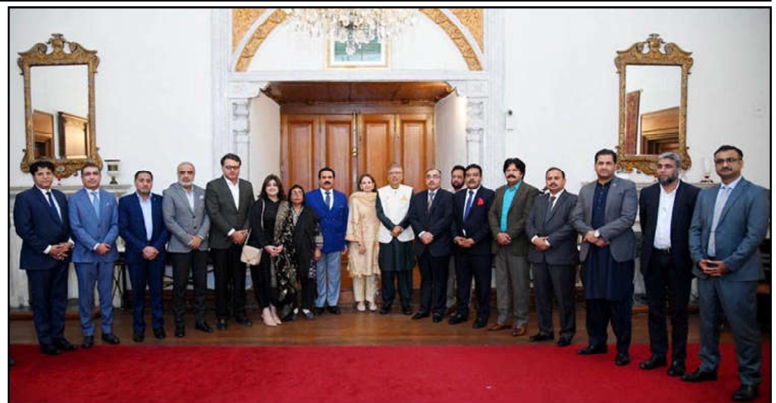
LAHORE: President Dr. Arif Alvi in a group photo with a delegation of the Lahore Chamber of Commerce and Industry, who called on him, at Governor House.