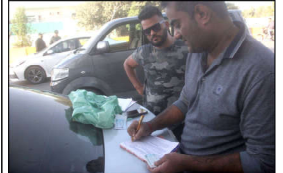
KARACHI: Officials of excise and taxation issuing a challan to a vehicle owner for non-custom paid (NCP) vehicle, violating the traffic rules at a road, in Provincial Capital.