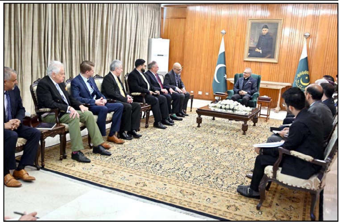
ISLAMABAD: A delegation of Miracle Saltworks Collective Inc, a USA-based salt mining and processing company, called on President Dr. Arif Alvi, at Aiwan-e-Sadr.

The delegation members apprised the president of the potential of Pakistan's salt mines to earn foreign exchange, adding that Pakistan.