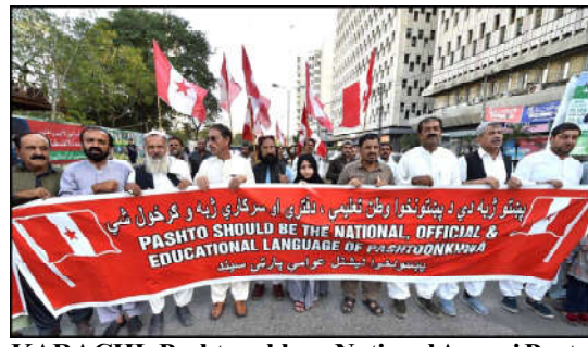
KARACHI: Pashtoonkhw National Awami Party hold protest outside KPC.