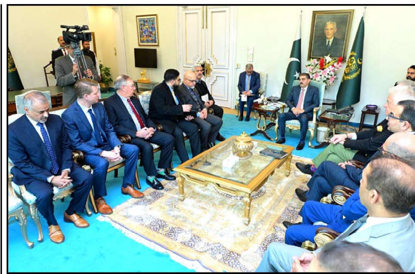
ISLAMABAD: A delegation of Miracle Salt Collective Inc called on Caretaker Prime Minister Anwaar-ul-Haq Kakar.

being court martialled. He misused the rank which he had previously held in the Army which he could not do so. The petitioner must have used his rank to attract publicity and to ensure that the contents of his petition are widely broadcast in the media and published in the newspapers. And after having achieved such purpose, the petitioner immediately bought a ticket (on February 13, 2024) to catch a flight out of the country. The usual practice is to buy a return ticket, but the petitioner bought a one-way ticket. He also did not disclose when he will return to Pakistan. The petitioner also did not disclose CUO 18/244 the reason for his sudden departure from Pakistan nor why he had to go to Bahrain.