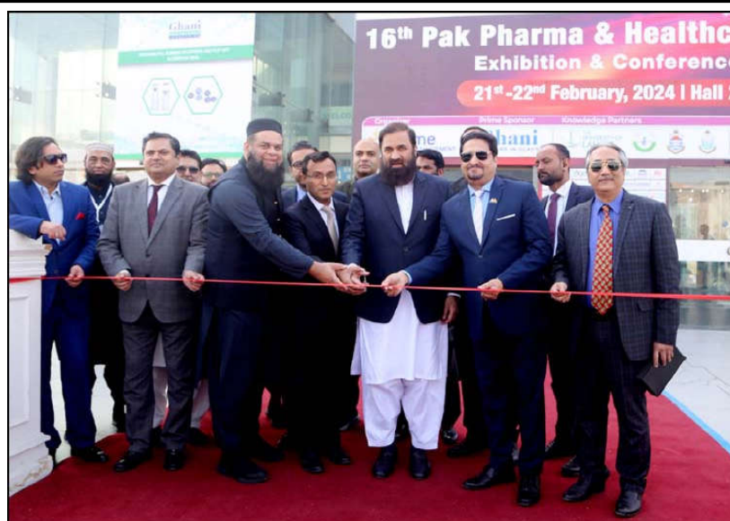
LAHORE: Governor Punjab Muhammad Balighur-Rehman inaugurates 16th Pak Pharma and Health Care Exhibition at Expo Center Lahore.

He said that organising Pak Pharma and Healthcare Exhibition is a good initiative which will give boost to the pharmaceutical industry. Governor Punjab said that it is encouraging to see that 115 foreign and local exhibitors are participating in this exhibition. He said that he appreciates the organizers of the exhibition for their efforts in arranging this exhibition regarding pharmaceuticals manufacturing and associated health related products and services. Governor Punjab said that this exhibition will provide an excellent opportunity to all those who are interested in promoting their products and services. Governor Punjab further said that the Punjab government is fully focused on providing international standard medical services in the provincial hospitals. Governor Punjab said that it is a good sign that Pakistani pharmaceutical companies are exporting medicines to different countries of the world, which is increasing the country's foreign exchange. In response to a question, Governor Punjab Muhammad Balighur Rahman said that it is the responsibility of the government to maintain balance in the regulation of drug prices.