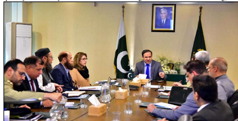
Caretaker Federal Minister for IT and Telecommunication, Dr. Umar Saif chairing meeting regarding Spectrum Availability in Islamabad.

livelihoods. BaKhabar Kisan is a comprehensive agricultural knowledge platform for farmers throughout Pakistan offering expert guidance on weather, crop and livestock advisory, modern agricultural practices, and disaster management, said a news release issued here on Wednesday.