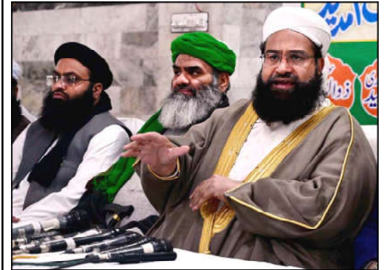
ISLAMABAD: Chairman Pakistan Ulema Council & Special Assistant for interfaith Harmony, Hafiz Tahir Mahmood Ashrafi addressing a Press conference during the 'Pakistan Accord' Convention.

ISLAMABAD (APP): Religious scholars and leaders on Wednesday urged political parties to forge a national accord requiring collective efforts to steer the country out of crises. In the joint declaration adopted at the "Convention for Pakistan Accord", the scholars and leaders from all religious schools of thoughts emphasized the necessity for all stakeholders, including state institutions, and political and religious parties to jointly formulate a covenant for the betterment of the nation. The covenant, named the Pakistan Accord, should outline the trajectory for the country's next 25 years addressing both internal and external challenges and finding effective solutions for economic crises and combating extremism, terrorism, and youth radicalization, they added. The convention organized by the Pakistan Ulema Council (PUC) was chaired by its Chairman Hafiz Muhammad Tahir Mahmood Ashrafi. He said it should outline a unified plan for steering beloved country for the next 25 years. The Ulema and scholars urged the political parties to accept one another's mandate and resolve their electoral disputes as per the Constitution and law. They emphasized that economic stability was intricately linked with political stability. "As Pakistan faces several challenges, which can be addressed through cooperation from all democratic forces," they added.