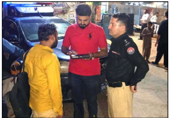
KARACHI: Police officials carry out the combing search operation against criminals as security has been tightened in city due to security reasons at different areas of District Korangi in Karachi.

KARACHI (INP): Sindh Excise and Taxation Department on Tuesday, confiscated 246 defaulting vehicles while documenting of 280 vehicles were also seized across the province on the first day of the road during a checking campaign for collection of outstanding taxes. Director General (DG) Excise and Taxation Aurangzeb Panhwer informed media through a statement issued here that a total tax of more than Rs 2.6 million was collected on the first day of the campaign that the campaign would continue till March 07, 2024. He informed that teams constituted by Excise and Taxation department