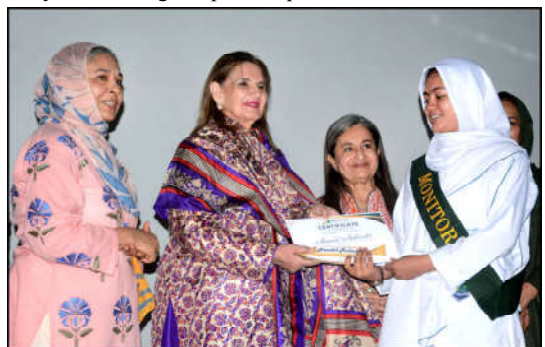
KARACHI: First Lady Samina Alvi distributing certificate during 'Teachers Appreciation Day' organized by Behbud Girls College and Higher Secondary School at Behbud Association.