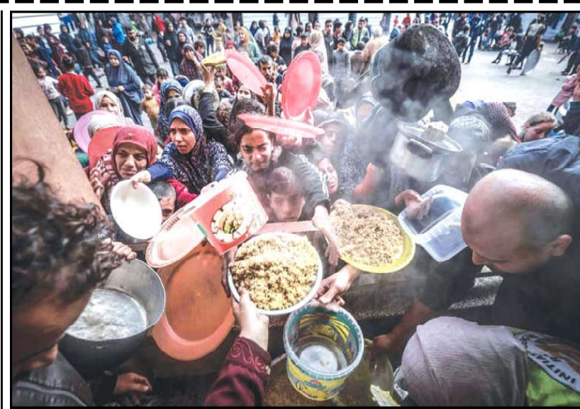
Displaced Palestinians gather to receive food at a government school in Rafah in the southern Gaza Strip, amid ongoing strikes by Israeli forces.