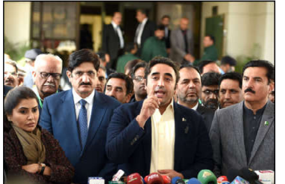
ISLAMABAD: Chairman Pakistan People Party Bilawal Bhutto Zardari talking with media persons after the attending hearing of former Prime Minister Zulfikar Ali Bhutto case at Supreme Court in the Federal Capital.

LAHORE (Online): PPP Chairman Bilawal Bhutto Zardari has said if martial law is imposed in the country then there will be "damadam mast Qalandar. "People of Pakistan has not given mandate to any political party. Those who claim to be of largest party they have not to talk to any one. Later we decided to talk to PML-N. The only way to steer out of prevailing situation is that we should sit together. Historical case is pending with Supreme Court (SC). The justice will be delivered to the grand son if not to daughter. We want history is set right, he said this while talking to media men outside SC here Tuesday. He went on to say today once again the hearing of Zulfikar Ali Bhutto has been held. I think it is an historical case. Dictatorship ruled during the 50 percent of history of the country. Powers of parliament and power are linked to it. This judiciary will administer justice to founder of constitution. Judicial murder of Bhutto took place in dictatorial regime. We hope judiciary will give us justice and wash the taint. We hope this presidential reference will help set right history so that we could draw a line that wrong was done in the past.