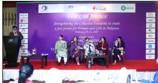
KARACHI: Participants and guests sit on stage during the two day Annual Conference of Fem Consortia, an alliance of twelve Women's Rights Organizations and five Alliances from across Pakistan, held at local hotel in Karachi.