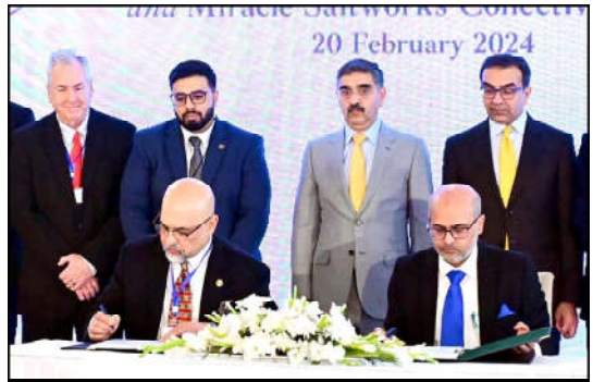
ISLAMABAD: Caretaker Prime Minister Anwaar-ul-Haq Kakar witnesses the signing ceremony between Pakistan Mineral Development Corporation and Miracle Saltworks Collective Inc. (USA) for joint venture agreement for the value addition and export of pink salt.