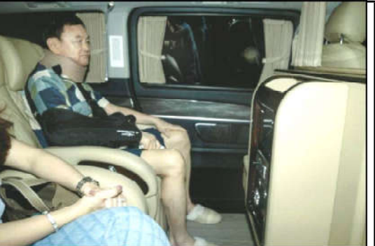
Former Thai Prime Minister Thaksin Shinawatra arrives at his family compound following his release.

distinguish between civilians and combatants in its records, but says around were women and children partially functioning