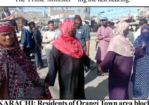
KARACHI: Residents of Orangi Town area block road as they are holding protest demonstration against prolong sui-gas load shedding in their area during heavy winter season, held at Johar Chowk in Karachi.

should be awarded death sentence twice, he said during the last hearing.