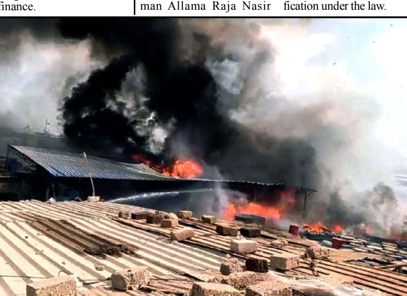
KARACHI: View of site after a fire broken out incident at a candle manufacturing factory as the fire brigade officials are busy in extinguishing fire and rescue operation, located on Korangi Ibrahim Hyderi area in Karachi.

The meeting discussed the country's political situation and important issues in the wake of recently held elections and their outcome. The party, which could not directly take part in elections due to the non-allotment of electoral symbol, wants its share of reserved seats for women and minorities by using the platform of other like-minded parties. Addressing a joint press conference in Islamabad today, Barrister Gohar said the PTIbacked independent candidates are required to join any party within three days following the issuance of noti-