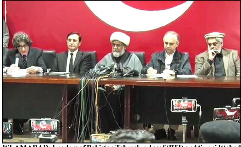
ISLAMABAD: Leaders of Pakistan Tehreek-e-Insaf (PTI) and Sunni Ittehad Council (SIC) addressing a Press conference.

Prime Minister Kakar said that there should be no doubt about government's commitment to the noble civil servants serving the State and the