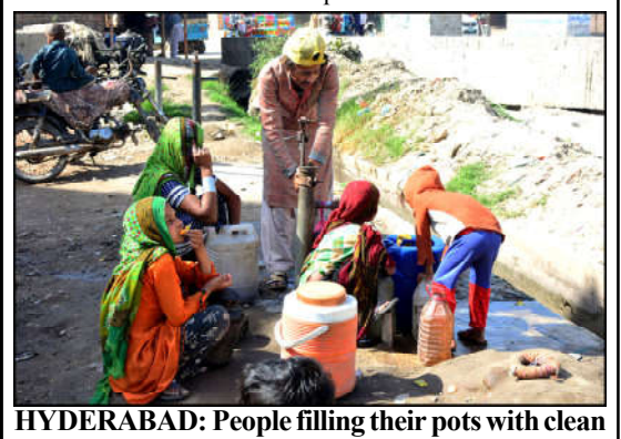
water from hand pump at Hatri area.