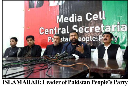
Sarfraz Bugti addressing a press conference in the Federal Capital.

(PTI)-backed candidates emerged as the largest group by winning more than 90 NA seats followed by the PML-N PPP's 75 and 54 seats, respectively.