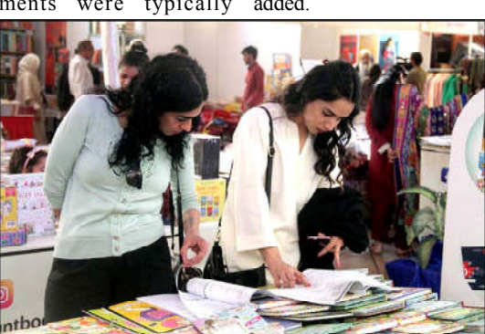
KARACHI: Visitors are reading books on a stall during Karachi Literature Festival 2024 at a local hotel, in the Provincial Capital.