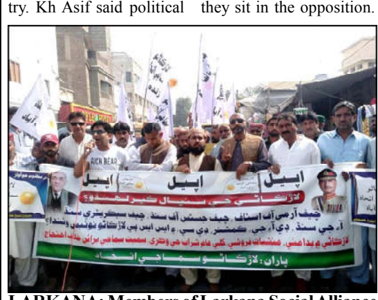
LARKANA: Members of Larkana Social Alliance are holding protest rally against the unrest law and order situation in city, at Jinnah Bagh round-