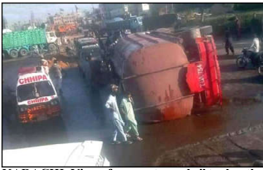
KARACHI: View of an overturned oil tanker that was fells down due to over speeding, at Vita Chowrangi located on Korangi area in Karachi.

The topic of the talk was 'Pakistan and the changing regional scenario' Senator Hussain during his talk also highlighted the fact that there's 'no fundamental conflict of interest' between Pakistan and Russia.