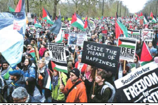
LONDON: Pro-Palestinian activists wave flags and carry placards during a march.

Under the memoran dum of understanding, Somaliland agreed to lease 20 kilometres (12 miles) of its coast for 50 years to landlocked Ethiopia, which wants to set up a naval base and a commercial port on