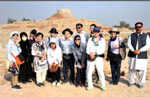
LARKANA: A group photo of Japanese tourists along during their visit to the world famous archeological site of Moen-Jo-Daro.

opportunities for business and investment in Pakistan and expressed called for investment in the country while facilitating businessmen from both China and