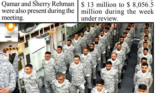
Chief of the Naval Staff Admiral Naveed Ashraf addressing the troops onboard PN ship during exercise SEASPARK 2024

kistan, in a statement issued here on Thursday, informed that foreign exchange reserves held by the central bank increased by $ 13 million to $ 8,056.5 million during the week