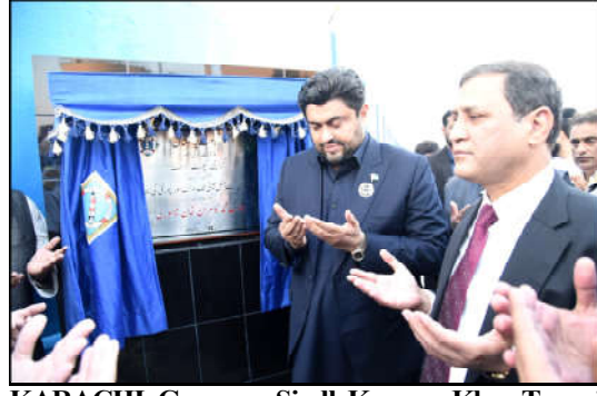
KARACHI: Governor Sindh Kamran Khan Tessori offering Dua after inaugurating road from Boat Basin to Oil Installation Area

It was informed that the Read Foundation was striving for promotion of quality and result-oriented education as well as for enhancing the access to free or low-cost education. The Foundation was also taking measures for education and upbringing of the orphan children, it was told.