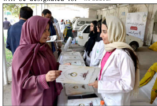
LAHORE: The pilgrims of Hajj are being guided with all possible efforts by the Ministry of Religious Affairs on the styles of medical camp and training camp in Haji Camp.

The launch of electric bikes can overcome the problems of exertion and would not take much time to reach their destinations,