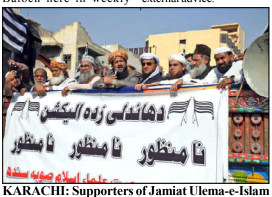
protest against alleged vote-rigging in some constituencies in the parliamentary elections, outside of the Pakistan Election Commission office, in provincial capital.

She said Pakistan takes its constitutional obligations seriously. It is the right of Pakistanis to enjoy freedoms and democracy. She said any step that Pakistan takes in this regard is in conformity with its own constitutional obligations and not influenced by external advice.