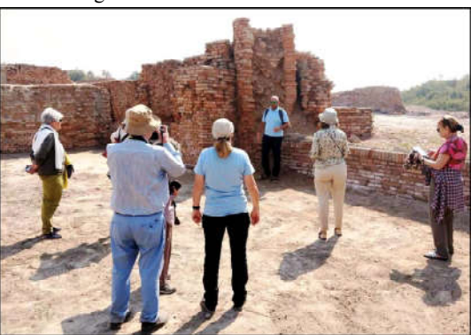
MOHENJO DARO: A tourist delegation from Italy and British are visiting and expressed keen inter-

universities across the nation are fulfilling their responsibilities in higher education. Furthermore, the HEC stands prepared to provide grants specifically for interdisciplinary and applied research ini-