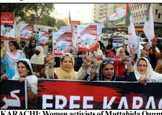
KARACHI: Women activists of Muttahida Qaumi Movement (Pakistan) hold a protest in favor of their demands outside press club in Provincial Capital.

would stage a sit-in outside the Sindh Assembly on the day the