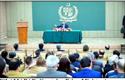
ISLAMABAD: Caretaker Prime Minister Anwaarul-Haq Kakar talks to National and foreign media in a press conference.

parties engaged in substantive discussions regarding the prevailing political landscape and the imperative of collaborative efforts for the betterment of the country. The PML-N delegation included Azam Nazir Tarar Ayaz Sadiq, Ahsan Iqbal Rana Tanvir, Khawaja Saad Rafique, Malik Ahmad Khan, Marriyum Aurangzeb and Sheza Fatima