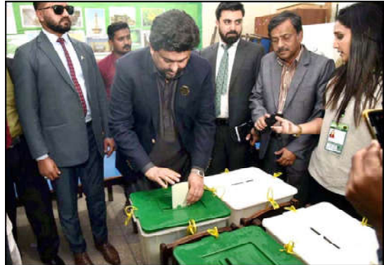
KARACHI: Governor Sindh Kamran Khan Tessori casts his vote at a polling station during General Elections 2024.

Kamran Khan Tessori said that government would not allow any one to disturb the peace of Karachi and stringent action would be taken against them.