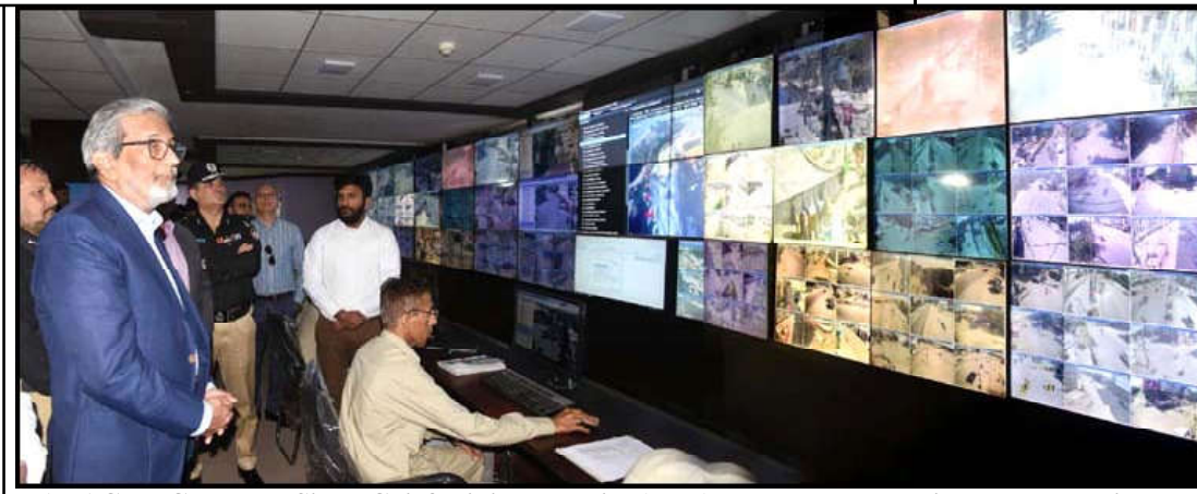
KARACHI: Caretaker Sindh Chief Minister, Justice (Retd) Maqbool Baqar witnesses the polling process at Command and Control Center during his visit at Civic Center building in Karachi.

A huge number of countrymen are expected to vote in the most expensive polling exercise since the country's inception.