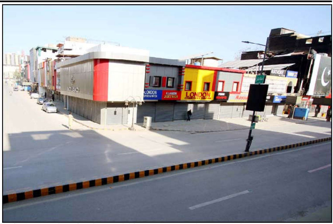
PESHAWAR: View of business activities seen closed while markets gives desert look during the General Elections 2024, held in Peshawar on Thursday, February 8, 2024. Voters across the country have flocked to their respective polling stations to cast ballots and elect their favorite leaders amid cold weather and the suspension of mobile phone services.