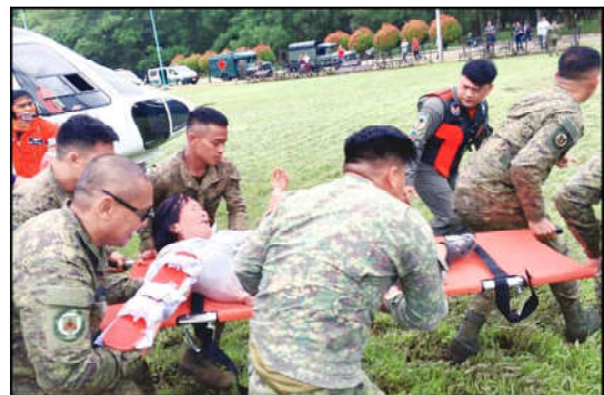
TAGUM (Philippines): Soldiers transfer an injured person to a hospital after evacuation from Maco region which was hit by landslides.

Singing patriotic songs, several thousand Aliyev supporters gathered on Wednesday evening in the streets of central Baku to celebrate his re-election. Some demonstrators held signs that read "Karabakh's liberator" and "We are proud of you!" The president and first lady Mehriban Aliyeva went to cast their ballots in the region's main city of Khankendi.