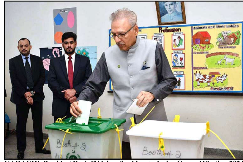
KARACHI: President Dr. Arif Alvi casting his vote during General Election-2024.

As per unverified and unconfirmed reports, the PML-N is on its way to reclaim its political stronghold of Lahore, with its election candidates attaining lead over competitors on 12 out of a total of 14 national assembly