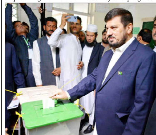
PESHAWAR: Khyber Pakhtunkhwa Governor Haji Ghulam Ali casting his vote during General Election 2024.

The Election Commissioner also engaged in a positive conversation with media representatives, highlighting the importance of democratic participation at polling stations for the country's stability and progress.