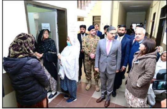
ISLAMABAD: Caretaker Prime Minister Anwaar-ul-Haq Kakar visits various polling stations for the General Elections 2024 in Islamabad.

He interacted with the voters, and shook hand with them, who also had photographs with him.