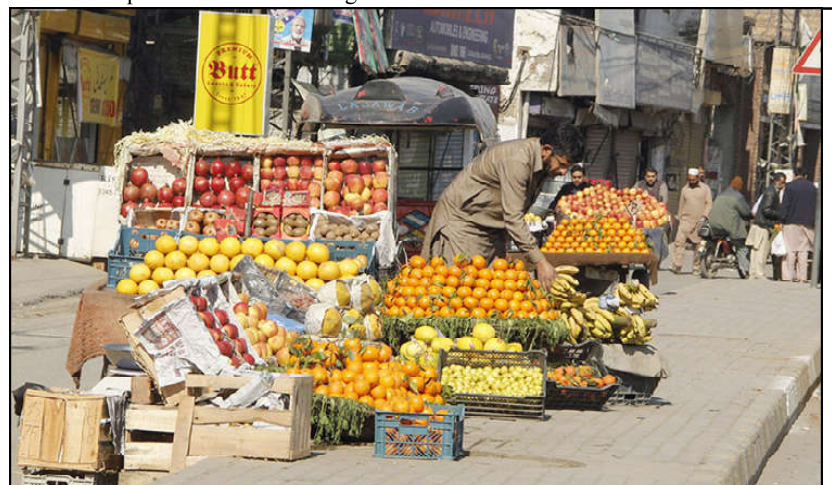
LAHORE: Fruit seller selling fruits on side of road on General Election Day.