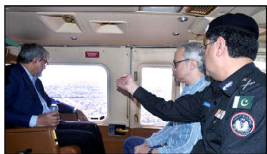
KARACHI: Caretaker Sindh Chief Minister, Justice (Retd) Maqbool Baqar takes aerial view of ongoing polling process in the city, in Karachi

In Karachi's Punjab Colony, polling has not yet started at NA-232 polling stations due to the non-availability of polling boxes and the absence of polling agents. It should be noted that polling for the general elections 2024 commenced at 8 am today and will continue without interruption until 5 pm. Voters across the country can cast their votes for their preferred candidates in both national and provincial assembly constituencies.