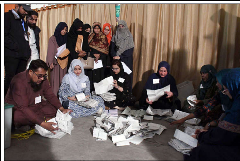
KARACHI: Members of polling staff start counting the votes after the polls closed for parliamentary elections, in the Provincial Capital.

LAHORE (Online): Polling process was halted for some time as a result of clash between workers of two political parties outside polling station located in government poly technical College Railway road. The polling resumed following the interference by police. It has been told that the workers involved in clash hailed from PML-N and PTI. They chanted slogans against leadership of each other.