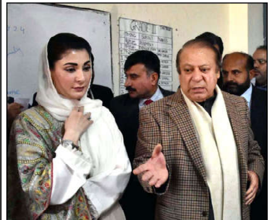
LAHORE: Former Prime Minister and PML-N leader Nawaz Sharif talking to supporters after cast his vote at polling station during General Election-2024.

To a question from journalist will he forge deal with the army he said there is no need to strike any deal with the army. There has been no problem ever with army. He stated people should come out of homes and cast their votes. The culture of obstinacy and indecency will have to be eliminated from the country. To a question from a journalist Mian Sahb you will get simple majority or will form coalition government Nawaz Sharif said o brother don't mention name of coalition government.