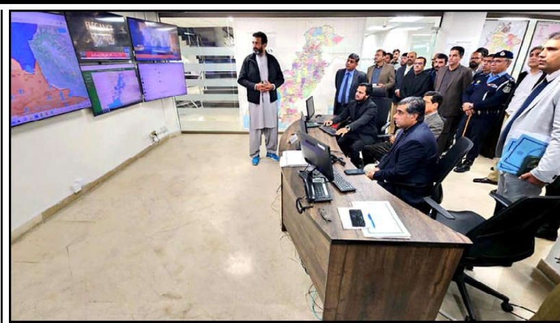
ISLAMABAD: Federal Minister for Interior, Dr. Gohar Ejaz visiting the Control Room to review overall security situation in the Country during General Elections-2024.

With India-Pakistan ties remaining virtually frozen, Newsweek pointed out that Pakistani officials have often lamented what they view as a lack of international attention being paid to the issue of Kashmir, where New Delhi carried out a mass crackdown since Indian Prime Minister Narendra Modi revoked Jammu and Kashmir's semi-autonomous status in August 2019. "We would say that attention from Kashmir is moving away because of Ukraine or the preoccupation of the Western world with China as a competitor, as a challenger to the existing order, and so on," Masood Khan said. "Now, in addition to Ukraine and the Indo-Pacific politics, you have the Middle East." "So, Kashmir is no more on the radar screen of the international community, and yet the oppression continues there," he added. "So, I've always said this is a blind spot, and this is very dangerous, this is very perilous for the international community because the Kashmiris' freedoms are as sacrosanct as the freedoms of any people in any part of the world."