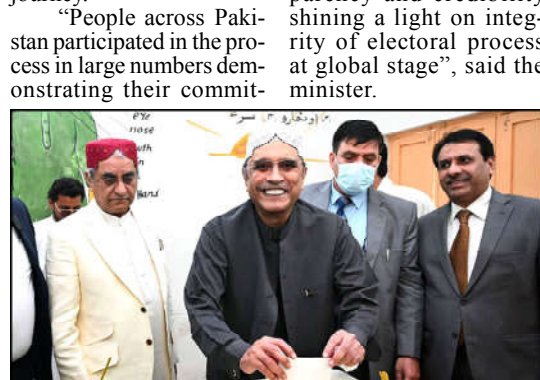
NAWABSHAH: Former President of Pakistan and President PPP Asif Ali Zardari cast his vote in a polling station during General Elections-2024.

"The smooth conduct of the elections is attributed to the collective efforts of multiple stakeholders and it is my privilege to extend my gratitude to all those who played a pivotal role in this democratic exercise", he added. He specially thanked the international media, observers, local media and journalists covering the electoral process. "Your presence and coverage has been instrumental in ensuring transparency and credibility shining a light on integrity of electoral process at global stage", said the minister.