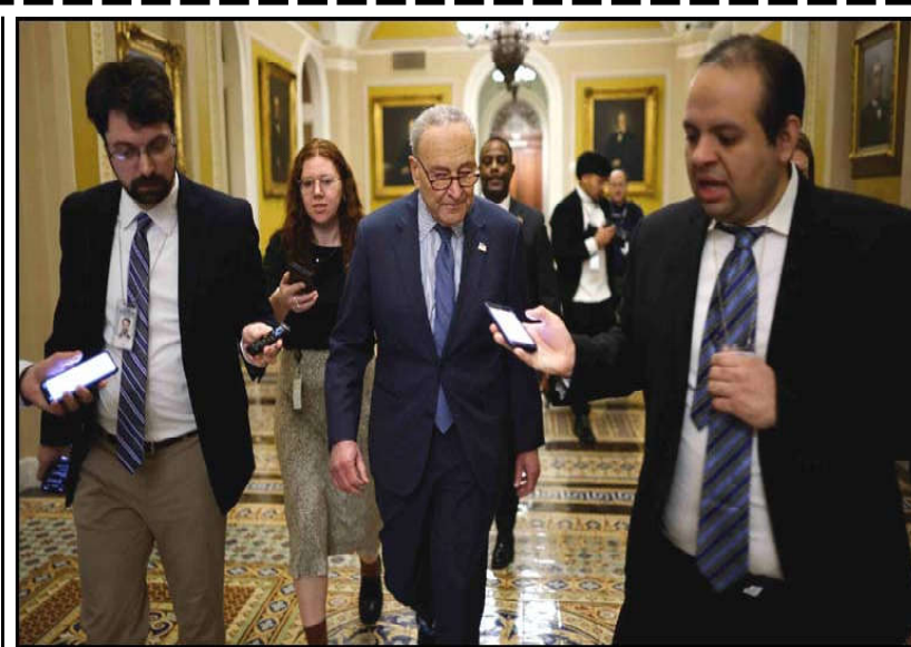
US Senate Majority Leader Charles Schumer (D-NY) talks to reporters as he walks to his office at the Capitol in Washington, DC.

But as the war in Ukraine nears its two-year anniversary, Avdiivka has become "a primary focus" of Moscow's forces, the U.K. Defense Ministry said in an assessment Thursday.